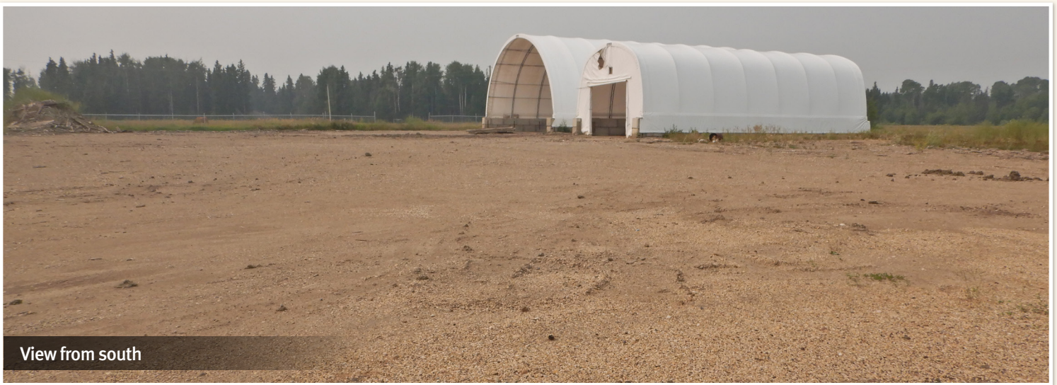
View from south