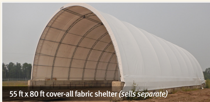
55 ft x 80 ft cover-all fabric shelter ( sells separate )

*Fabric shelters must be removed by Nov 21, 2018. Buyer is responsible for load out and all costs associated.