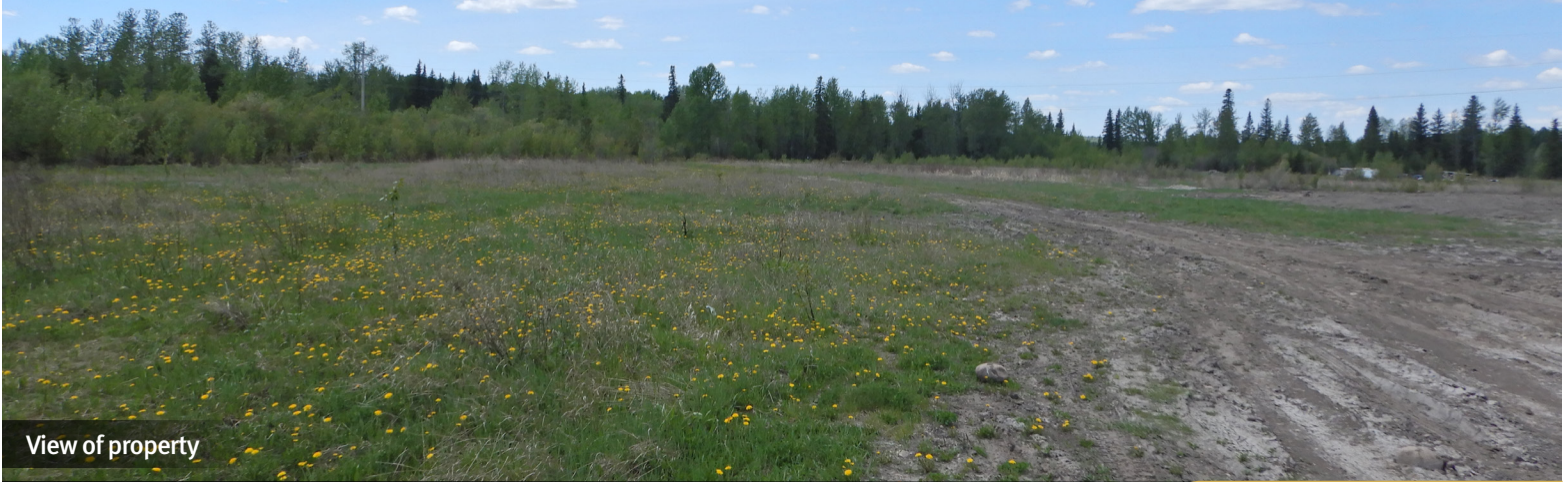
View of property

890801 Alberta Ltd. 1 Parcel of Industrial Real Estate – 73.1± Title Acres Hwy 43 Frontage – $2339.40 Power Line Revenue – Whitecourt, AB