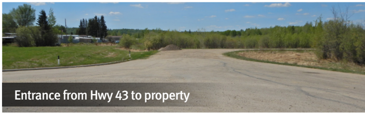
Entrance from Hwy 43 to property