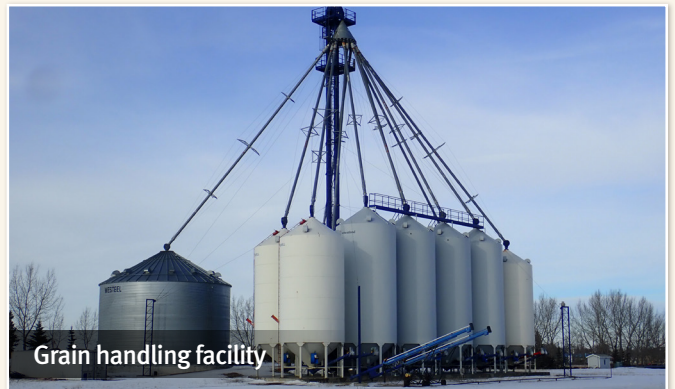
Grain handling facility