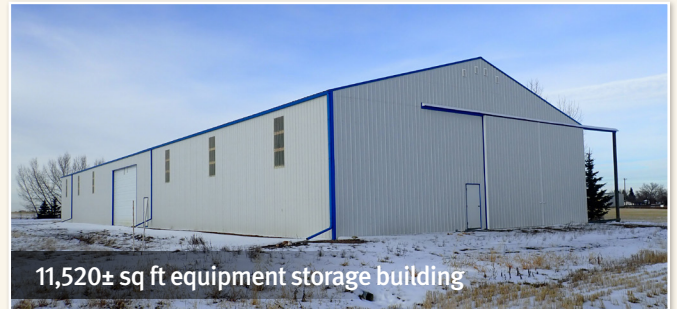
11,520± sq ft equipment storage building