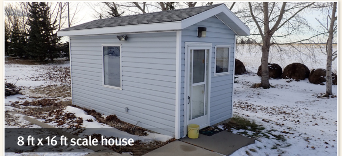
8 ft x 16 ft scale house