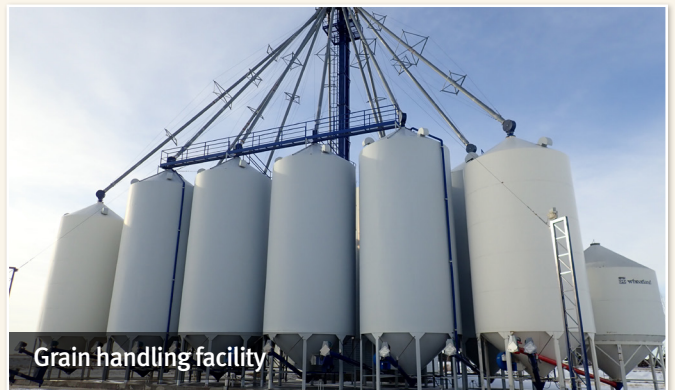
Grain handling facility

Bidders must satisfy themselves as to the exact current acres, property lines and fence locations, building sizes, taxes and assessments, zoning and permitted uses & surface lease revenue details. The information provided is a guide only.