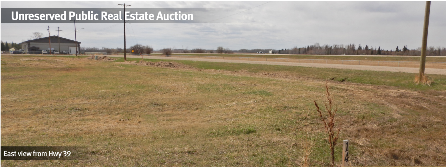
East view from Hwy 39