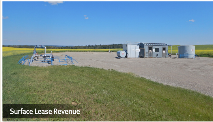
Surface Lease Revenue