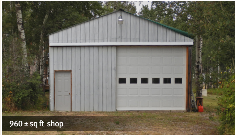
960 ± sq ft shop