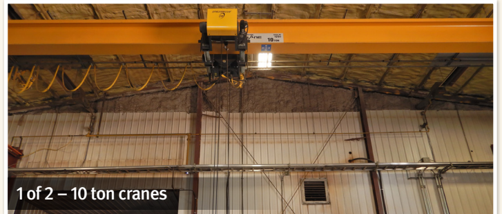
1 of 2 – 10 ton cranes