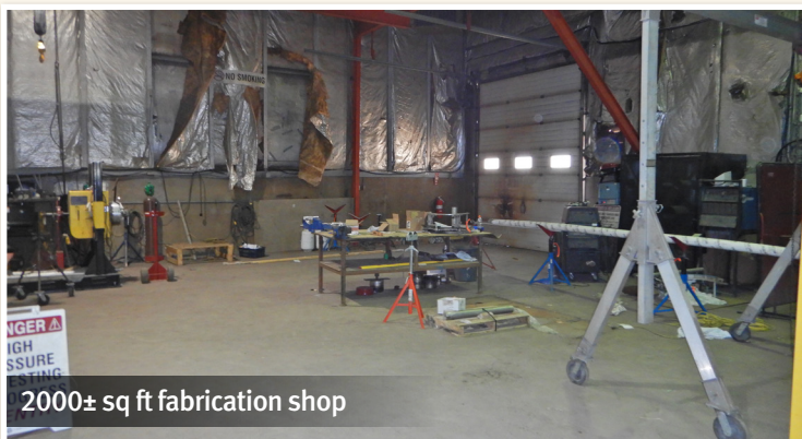
2000± sq ft fabrication shop