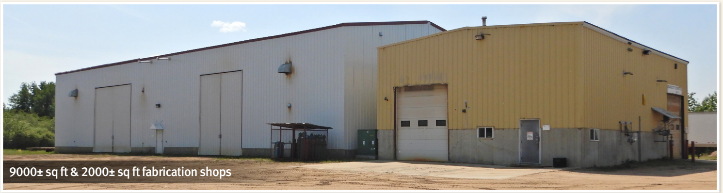
9000± sq ft & 2000± sq ft fabrication shops