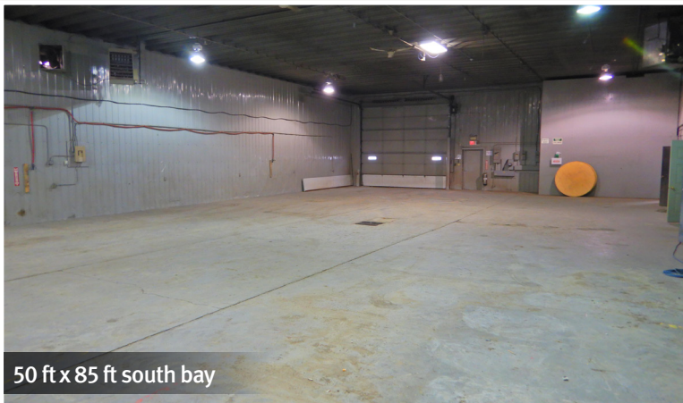
50 ft x 85 ft south bay