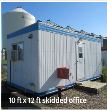
10 ft x 12 ft skidded office