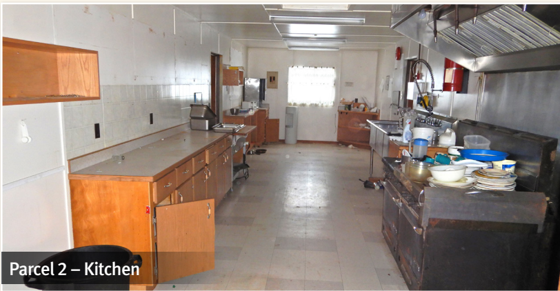
Parcel 2 – Kitchen