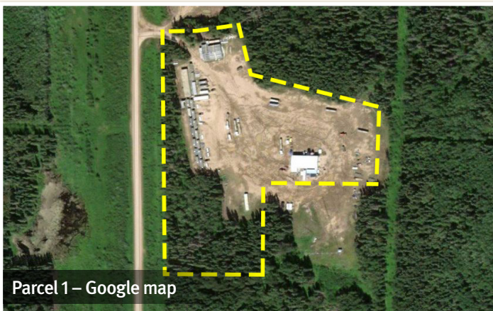
Parcel 1 – Google map