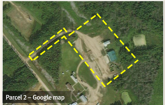
Parcel 2 – Google map

The successful bidder will make application to Alberta Environment and Parks for lease assignment and will be responsible for all the costs associated.