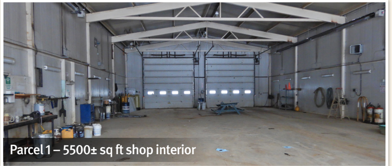
Parcel 1 – 5500± sq ft shop interior