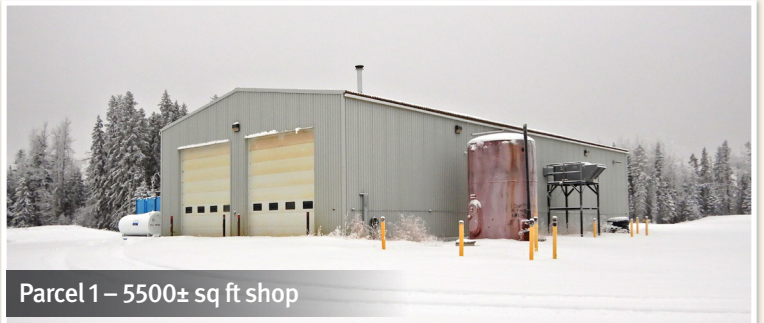
Parcel 1 – 5500± sq ft shop

The successful bidder will make application to Alberta Environment and Parks for lease assignment and will be responsible for all the costs associated.