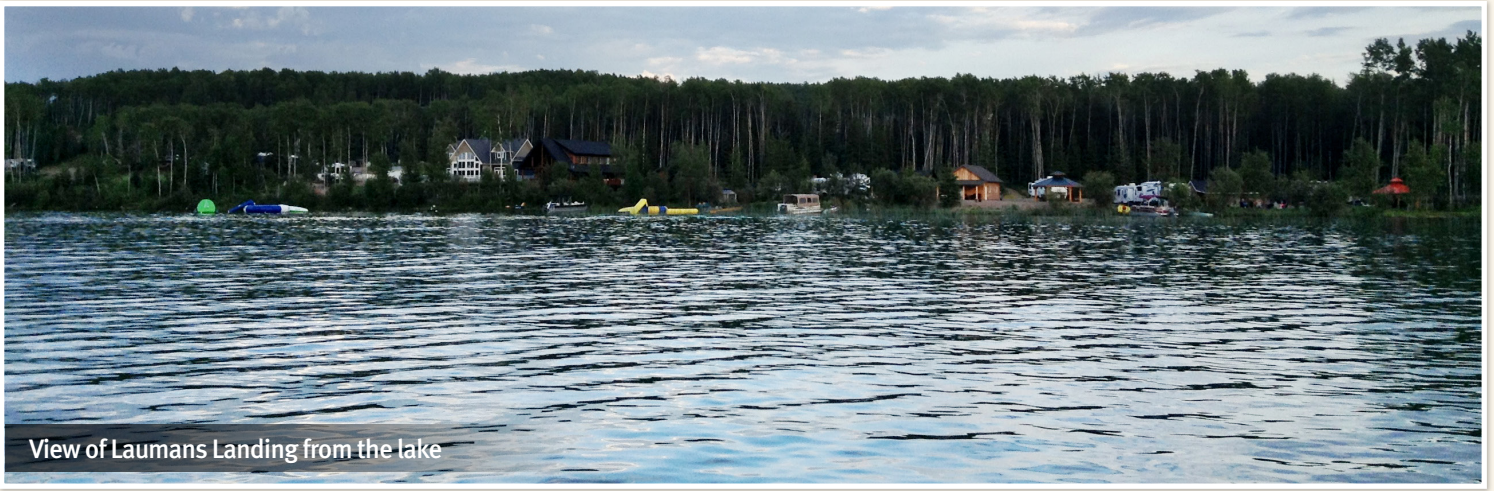
View of Laumans Landing from the lake