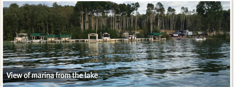
View of marina from the lake