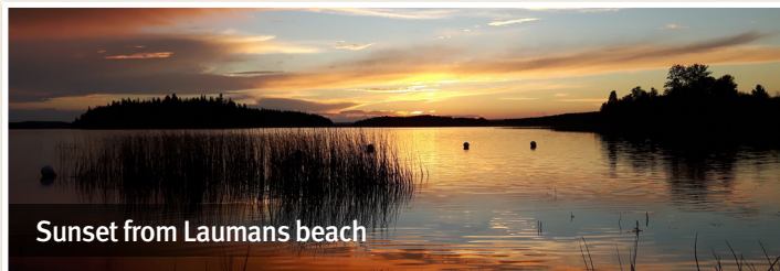
Sunset from Laumans beach

Services to the lot line include: power, phone, natural gas, and water.