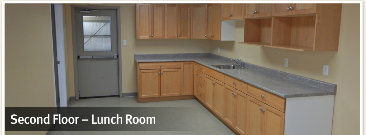
Second Floor – Lunch Room