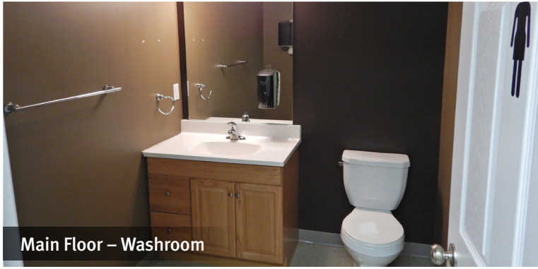
Main Floor – Washroom