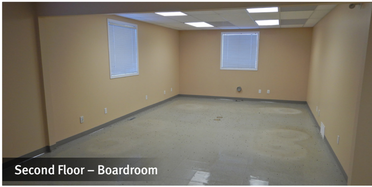
Second Floor – Boardroom