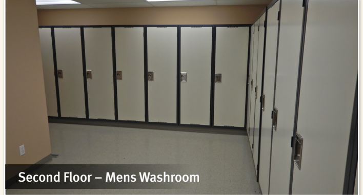
Second Floor – Mens Washroom