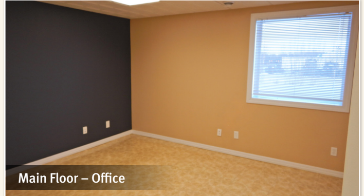
Main Floor – Office