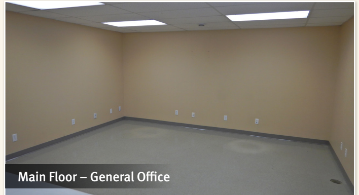
Main Floor – General Office