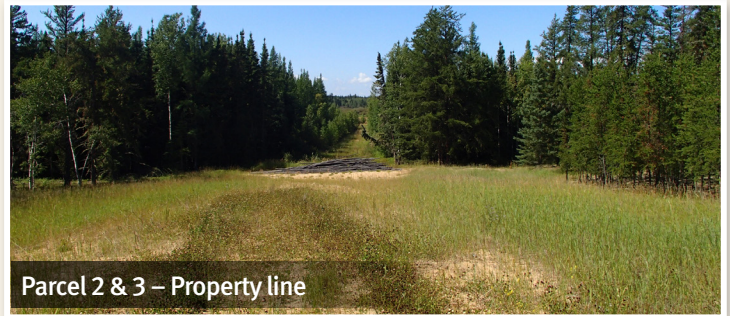
Parcel 2 & 3 – Property line