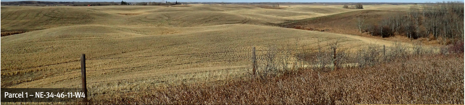
Parcel 1 – NE-34-46-11-W4

The Armitage Farm Corp. 2 Parcels of Farmland – 256.58± Title Acres $3400 Surface Lease Revenue – Kinsella, AB