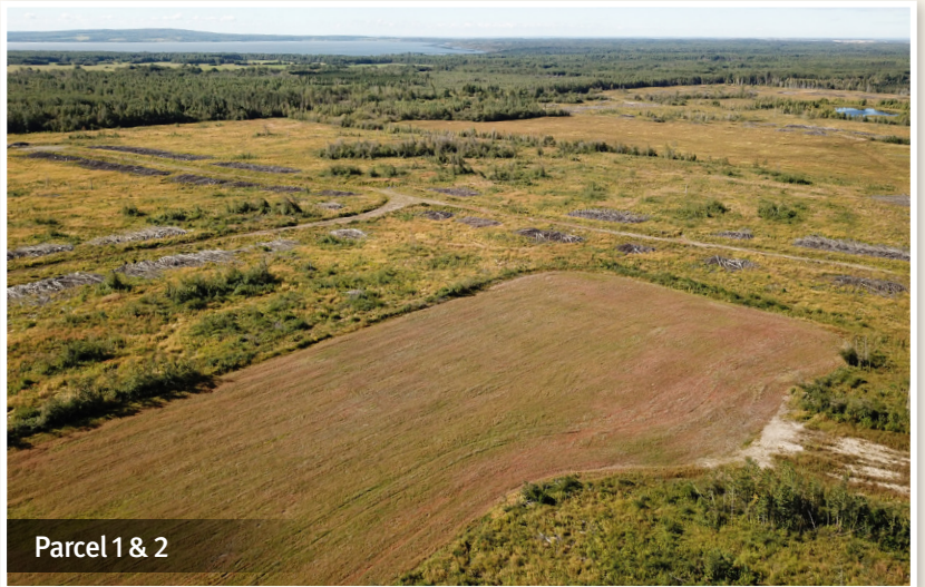
Parcel 1 & 2

▶ 35± ac cult, balance cleared, not broke, taxes $38.32.