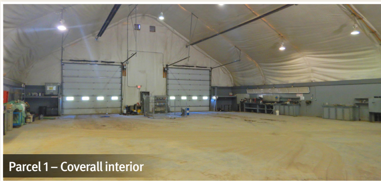
Parcel 1 – Coverall interior

Parcel 3: 10 Barber Way, Fort Nelson, BC