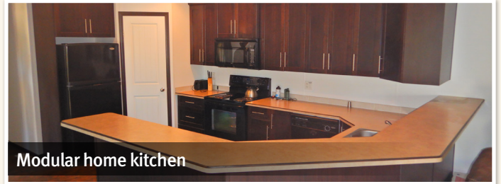
Modular home kitchen