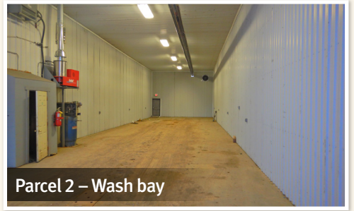
Parcel 2 – Wash bay