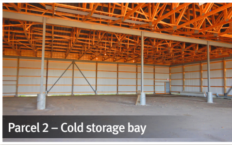
Parcel 2 – Cold storage bay