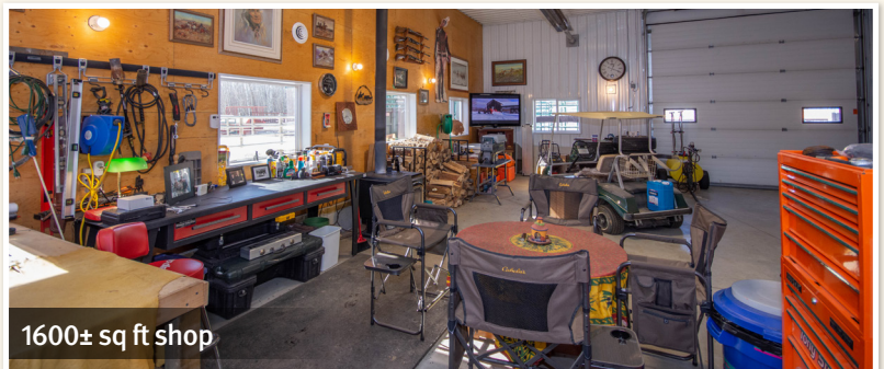
1600± sq ft shop