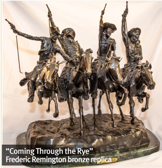
"Coming Through the Rye" Frederic Remington bronze replica