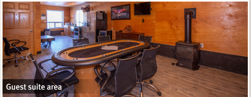
Guest suite area