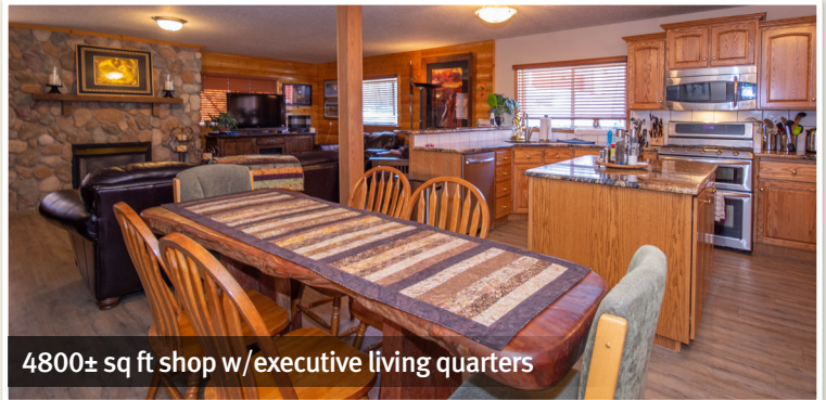
4800± sq ft shop w/executive living quarters