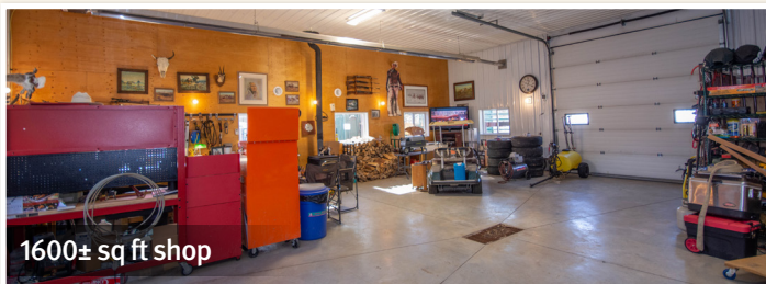
1600± sq ft shop