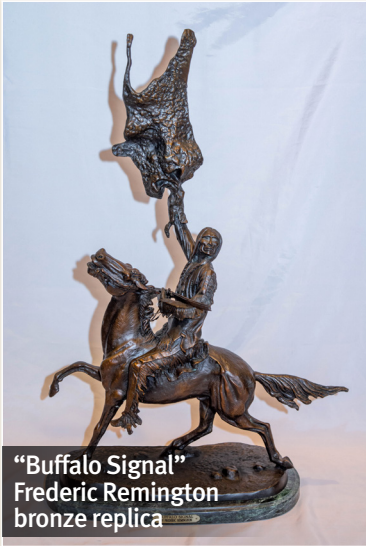
"Buffalo Signal" Frederic Remington bronze replica