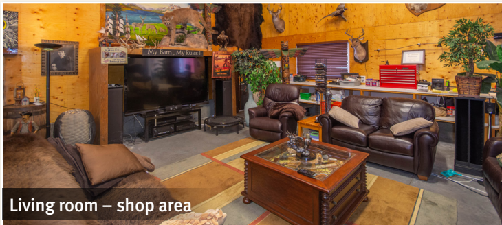
Living room – shop area