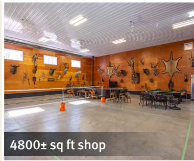
4800± sq ft shop