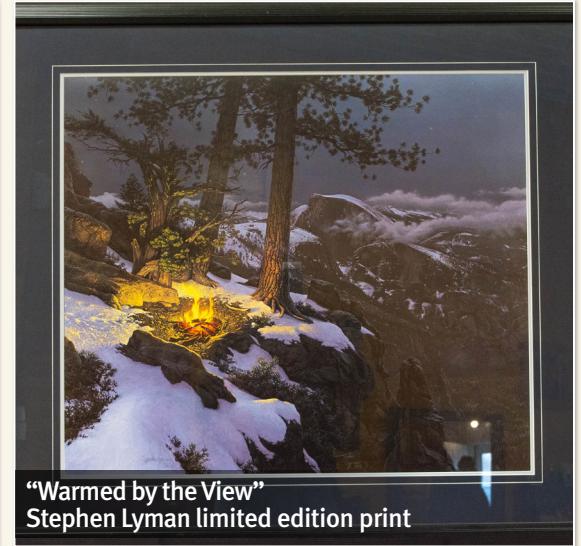
"Warmed by the View" Stephen Lyman limited edition print