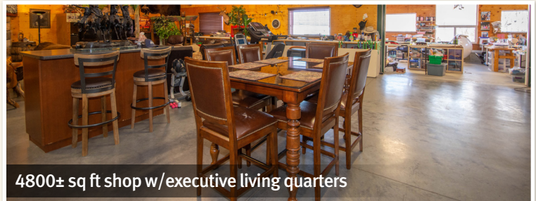
4800± sq ft shop w/executive living quarters