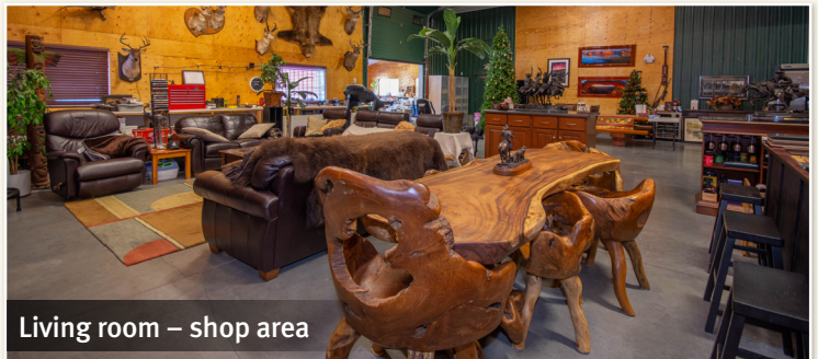
Living room – shop area

Bidders must satisfy themselves as to the exact current acres, property lines and fence locations, building sizes, taxes and assessments, zoning and permitted uses & surface lease revenue details. The information provided is a guide only.