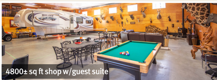
4800± sq ft shop w/guest suite