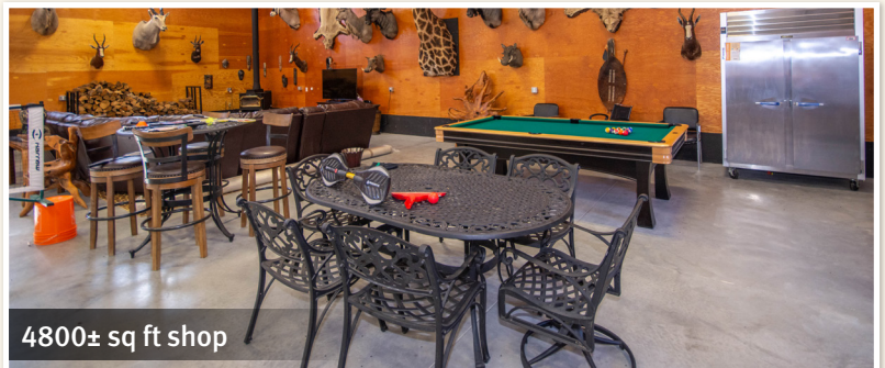
4800± sq ft shop