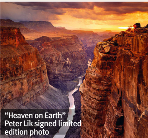
"Heaven on Earth" Peter Lik signed limited edition photo