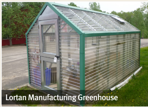
Lortan Manufacturing Greenhouse