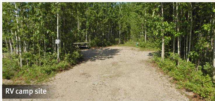
RV camp site