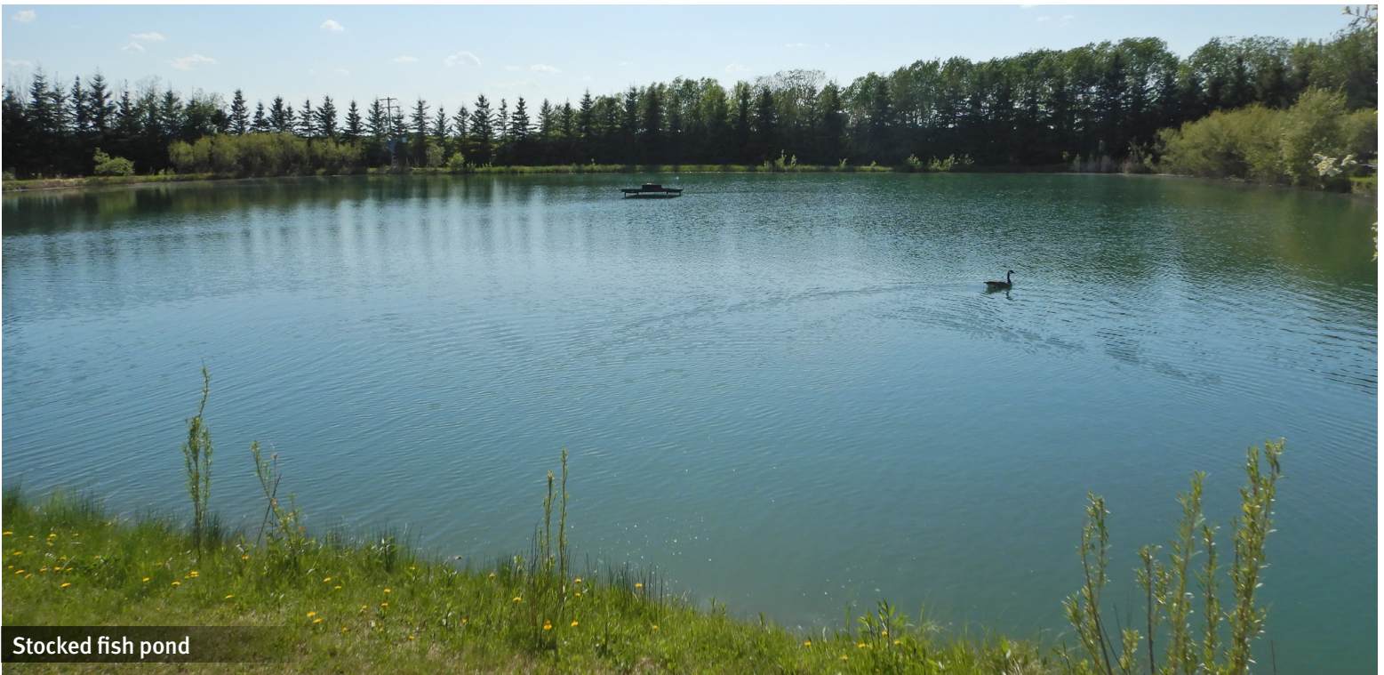
Stocked fish pond