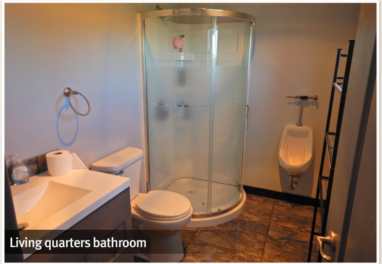
Living quarters bathroom