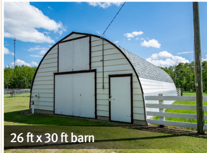
26 ft x 30 ft barn