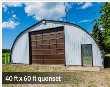
40 ft x 60 ft quonset