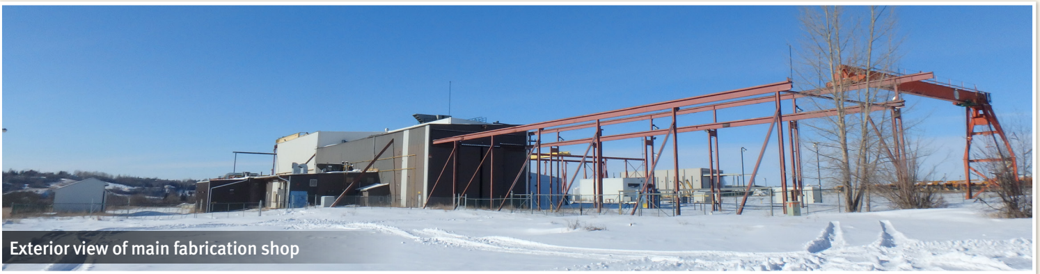
Exterior view of main fabrication shop