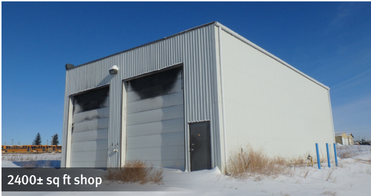
2400± sq ft shop