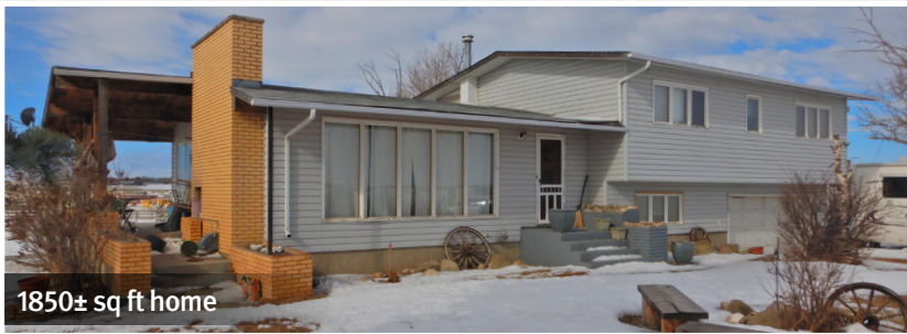
1850± sq ft home

The seller will retain possession of the home until October 22, 2019.