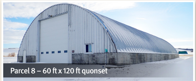
Parcel 8 – 60 ft x 120 ft quonset