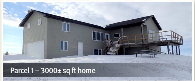
Parcel 1 – 3000± sq ft home