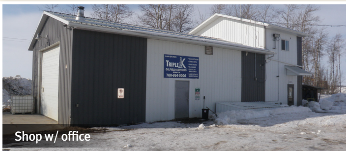
Shop w/ office