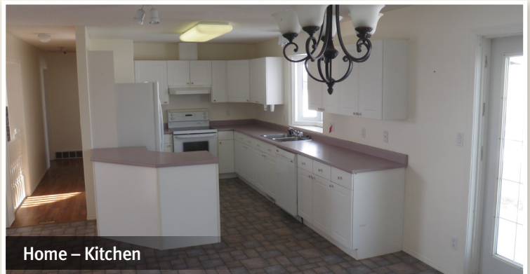
Home – Kitchen