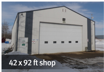
42 x 92 ft shop