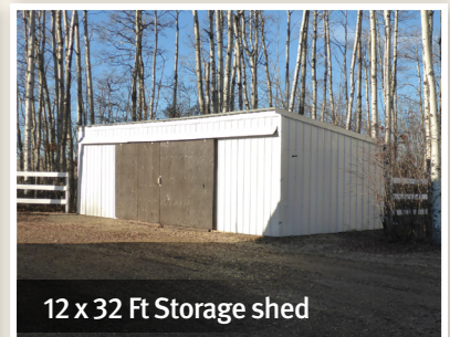
12 x 32 Ft Storage shed