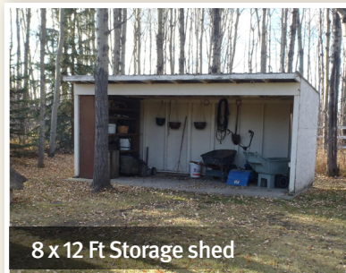
8 x 12 Ft Storage shed