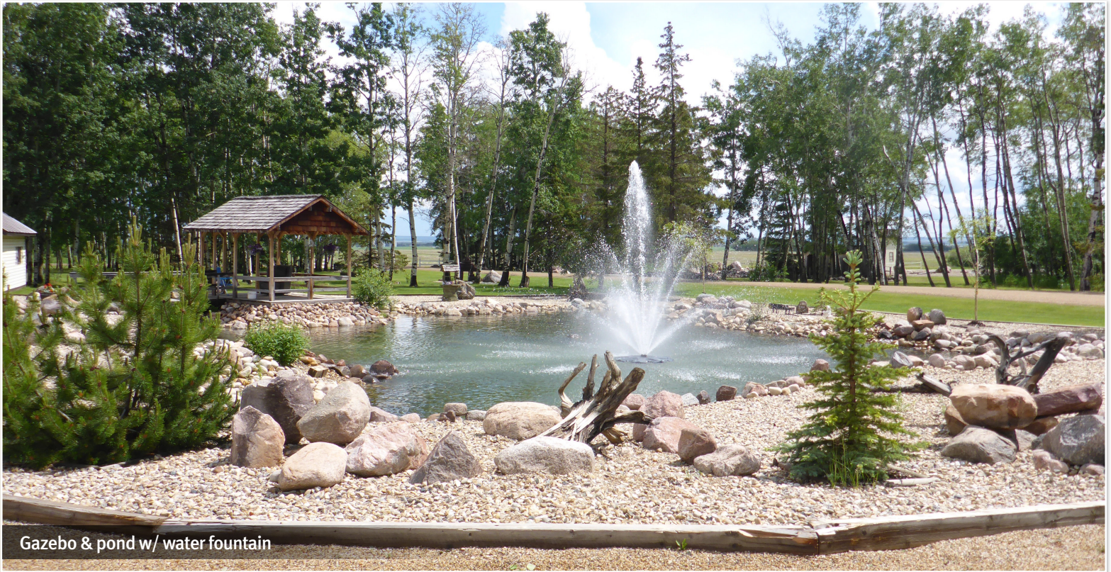
Gazebo & pond w/ water fountain