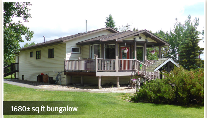
1680± sq ft bungalow