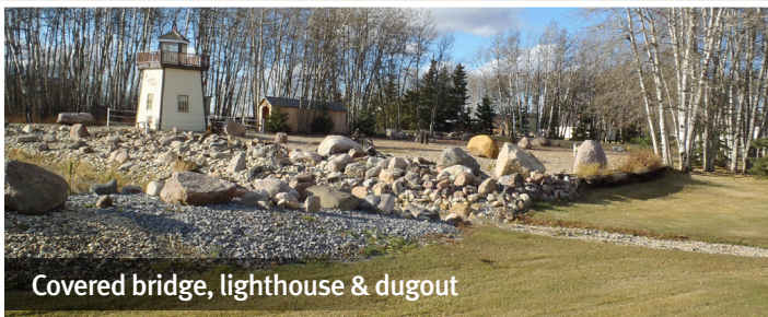
Covered bridge, lighthouse & dugout

From Rycroft, AB , go 3.2 km (2 miles) South on Hwy 2, then 3.2 km (2 miles) West on Twp Rd 780, then 0.4 km (0.25 miles) South on Rge Rd 55.