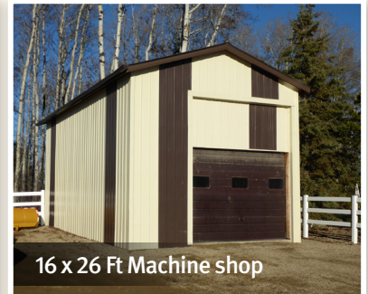
16 x 26 Ft Machine shop