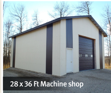
28 x 36 Ft Machine shop