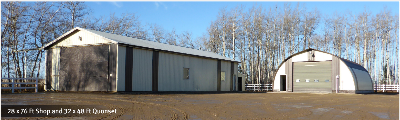
28 x 76 Ft Shop and 32 x 48 Ft Quonset