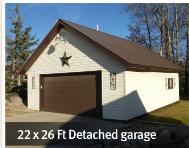
22 x 26 Ft Detached garage