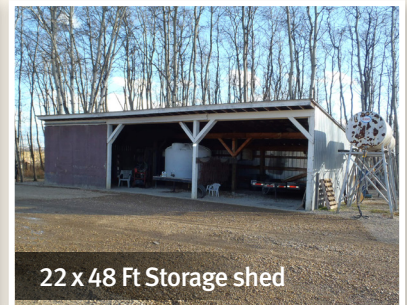
22 x 48 Ft Storage shed