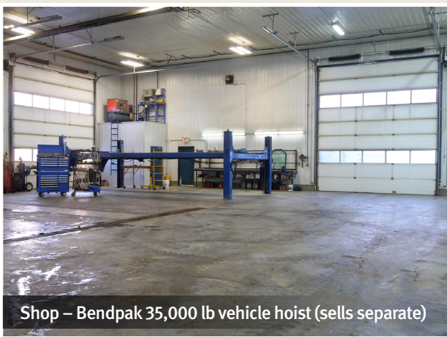
Shop – Bendpak 35,000 lb vehicle hoist (sells separate)

Brokerage: Ritchie Bros. Real Estate Services Ltd.