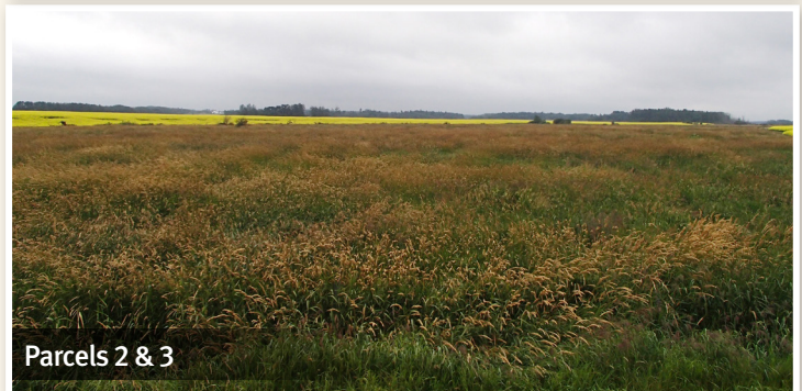
Parcels 2 & 3

Property may be viewed without an appointment