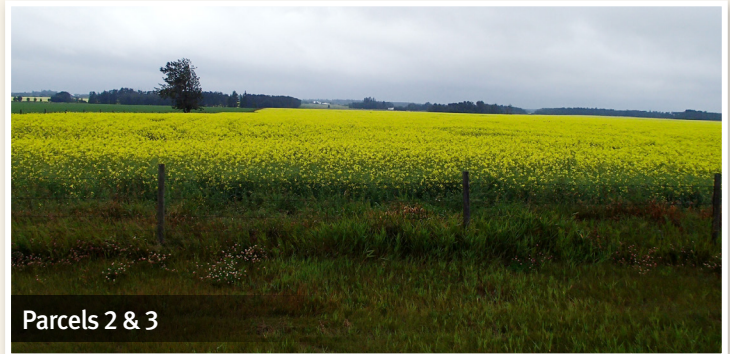
Parcels 2 & 3