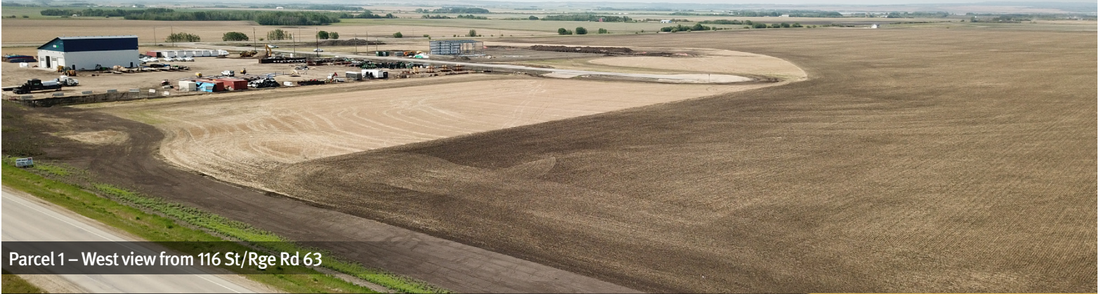
Parcel 1 – West view from 116 St/Rge Rd 63