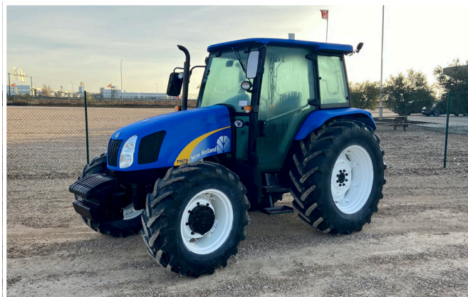
2014 NEW HOLLAND T5070