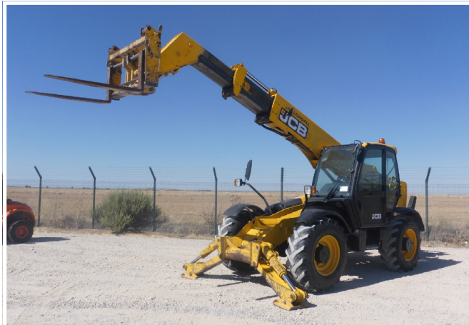
JCB 535-125 4X4X4