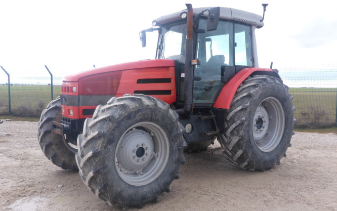
2011 SAME LASER-3 160