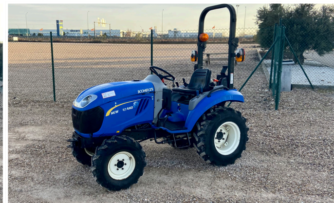
NEW HOLLAND BOOMER 25