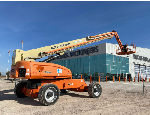
JLG 1350SJP TELESCOPIC 4X4X4