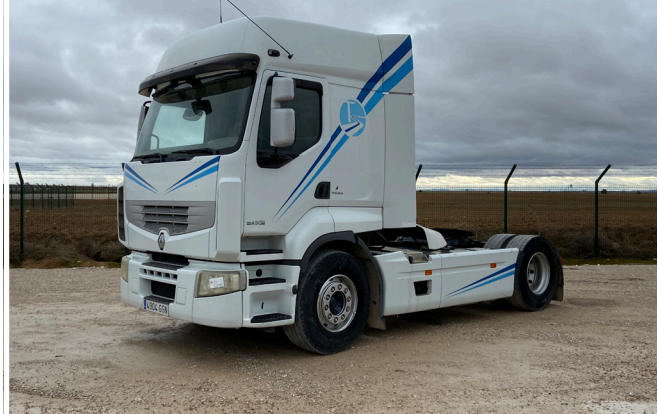
RENAULT PREMIUM 450DXI 4X2