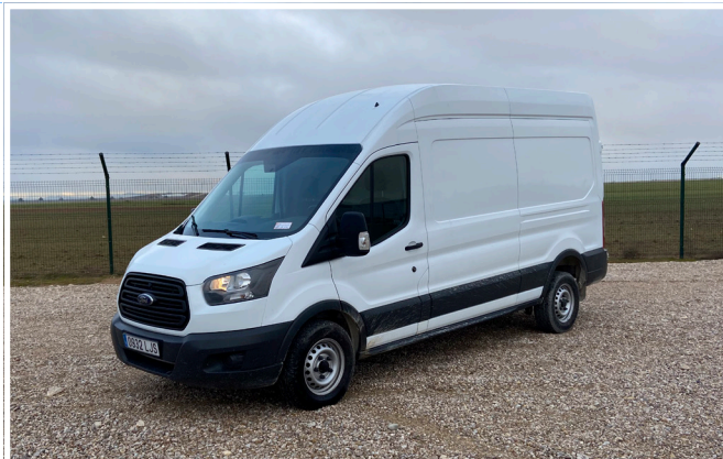
2016 FORD TRANSIT PANTHER 2.0