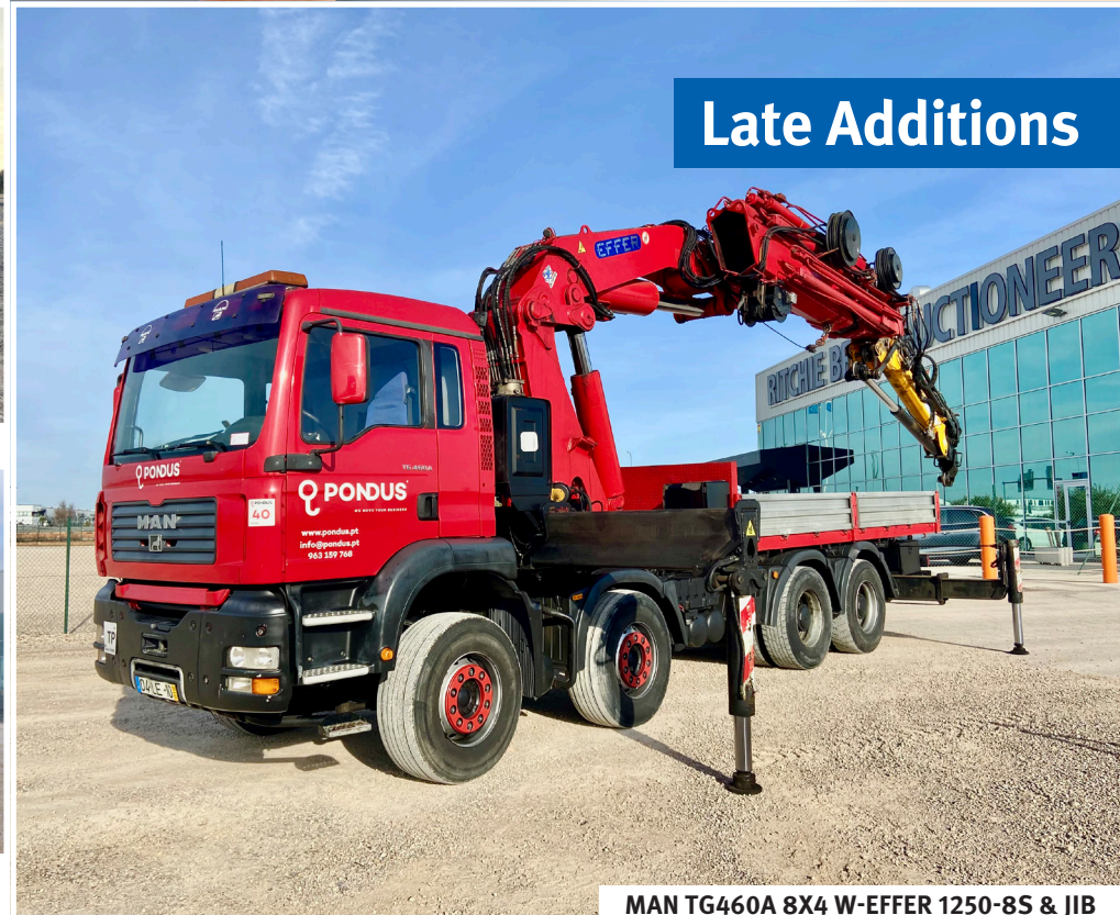
MAN TG460A 8X4 W-EFFER 1250-8S & JIB