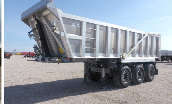
2012 MONTENEGRO SVF2G18S TRI/A