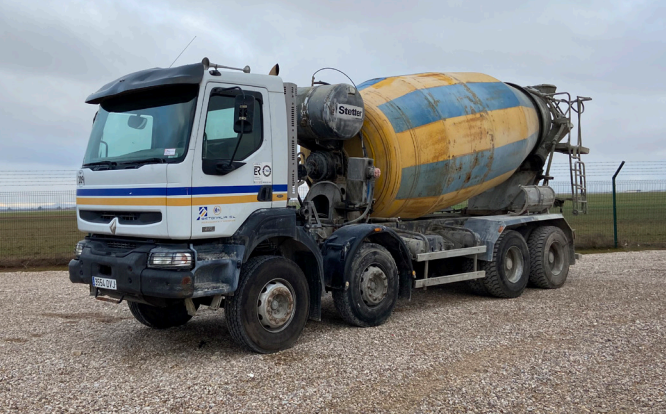
1 / 2 – RENAULT PREMIUM 370 8X4