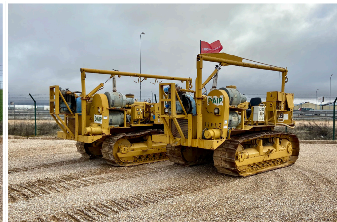
2 OF 5 - CAT D6C & D6D