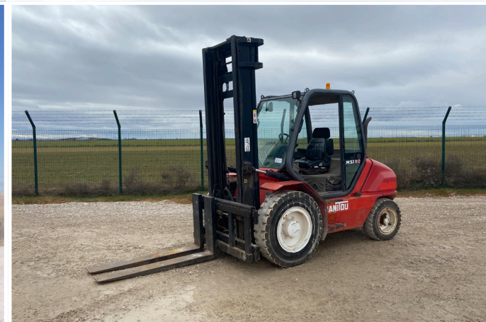
MANITOU MS150 4X2