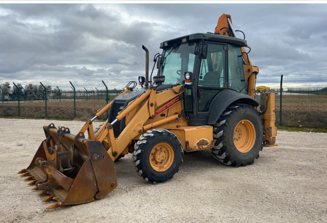
CASE 580SR 4X4