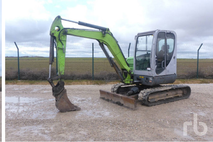
2011 NEUSON 50Z3-RD