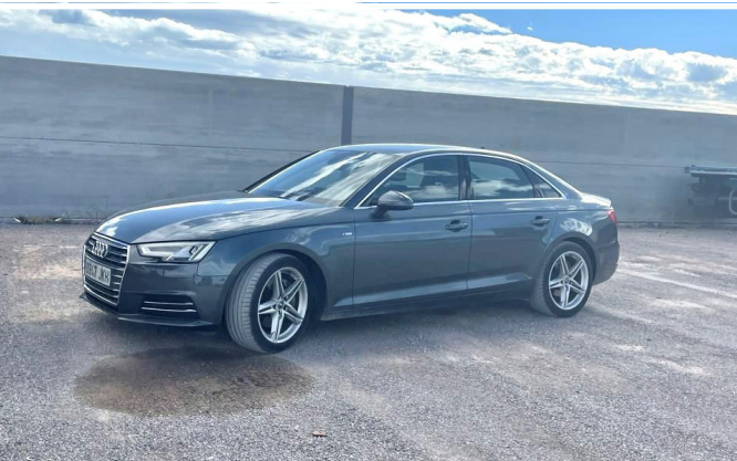
2015 AUDI A4 2.0TDI