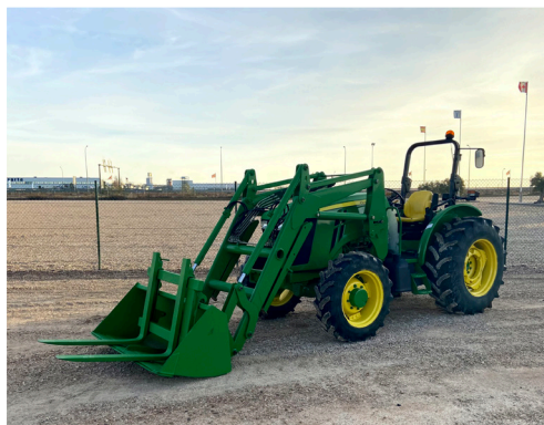
2014 JOHN DEERE 5100M