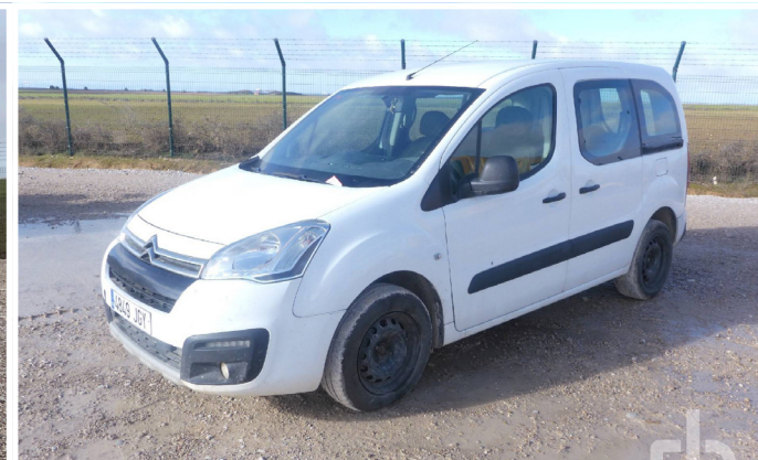
2015 CITROEN BERLINGO 1.6D

Also online: the auction brochure with even more featured items.