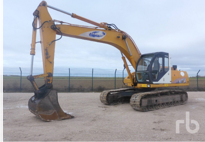
1995 SAMSUNG SE210LC2