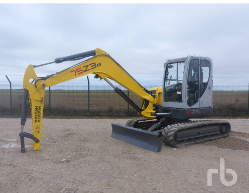
2012 WACKER NEUSON 7523