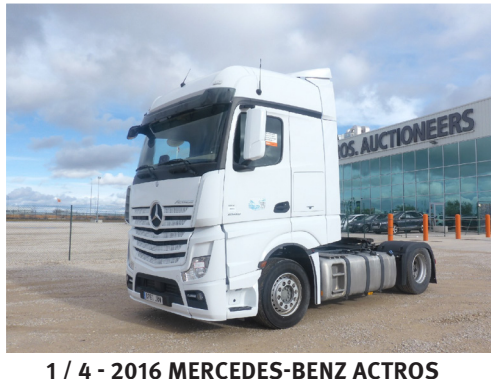
1 / 4 - 2016 MERCEDES-BENZ ACTROS 1845 4X2