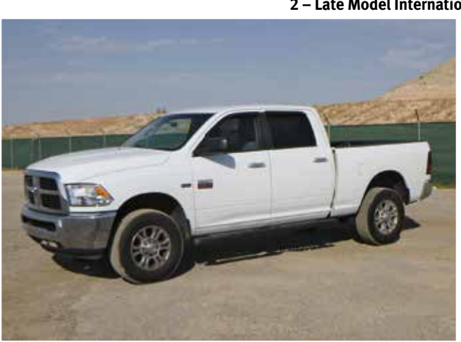
2011 Ram 2500 4x4 | Las Vegas