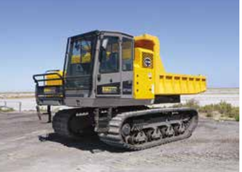
2017 Terramac RT14R | Salt Lake City