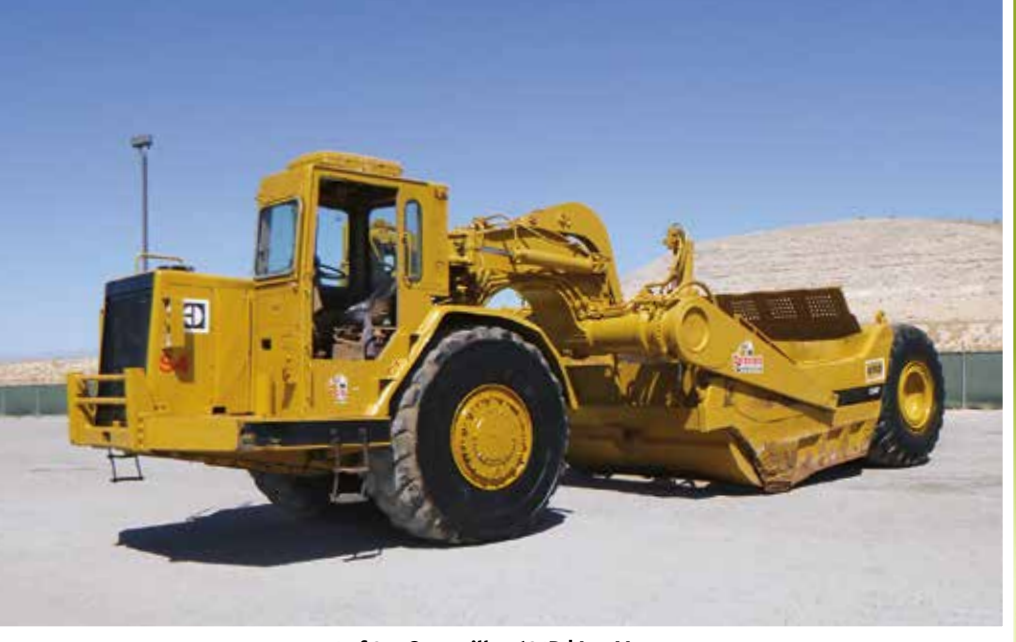
1 of 3 – Caterpillar 631D | Las Vegas