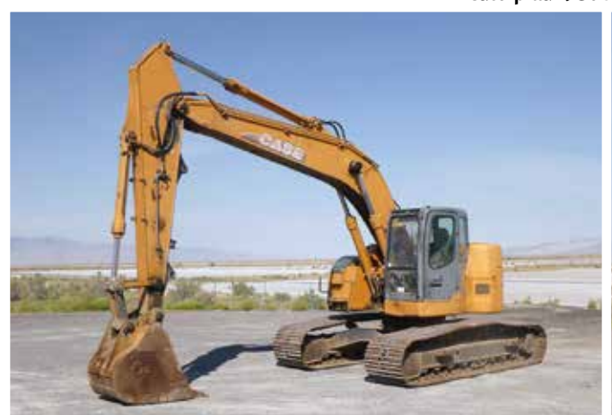
Case CX225SR | Salt Lake City