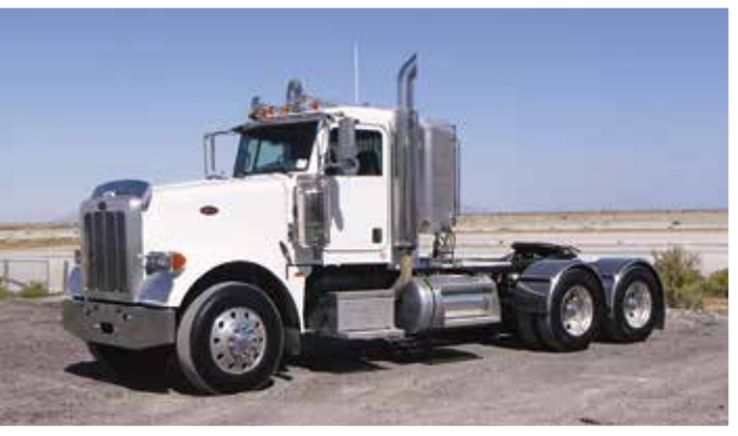
Peterbilt 367 | Salt Lake City