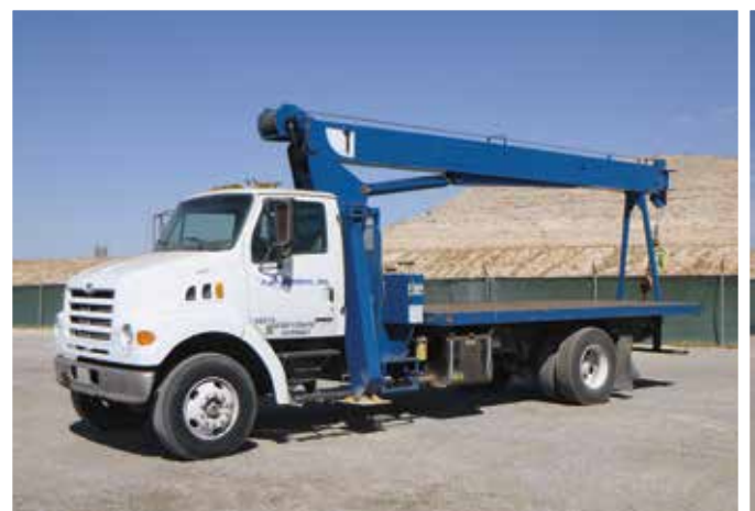
Sterling L7500 w/Manitex M1461 14 Ton | Las Vegas