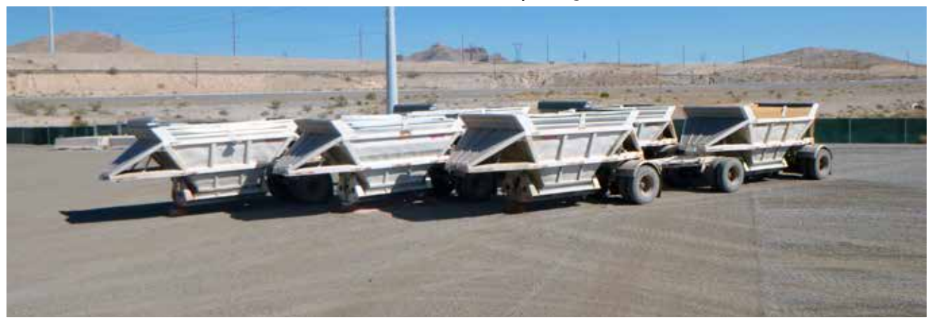
Large Qty of Dragon 22 Ft | Las Vegas