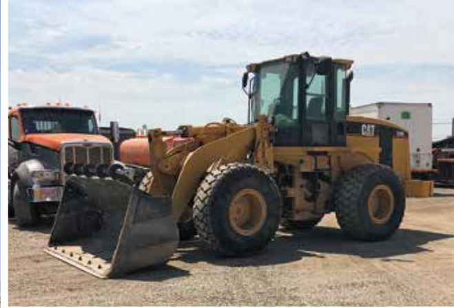
Caterpillar 938G | Las Vegas