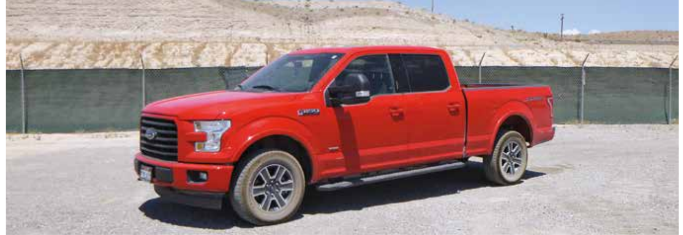
1 of 2 - 2017 Ford F150 4x4 | Las Vegas