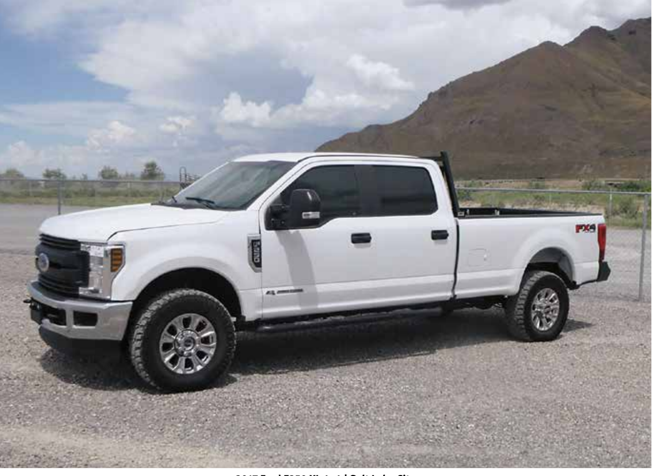
2017 Ford F250 XL 4x4 | Salt Lake City

See equipment, register & bid: rbauction.com