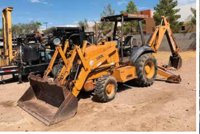
Case 580L 4x4 | Las Vegas