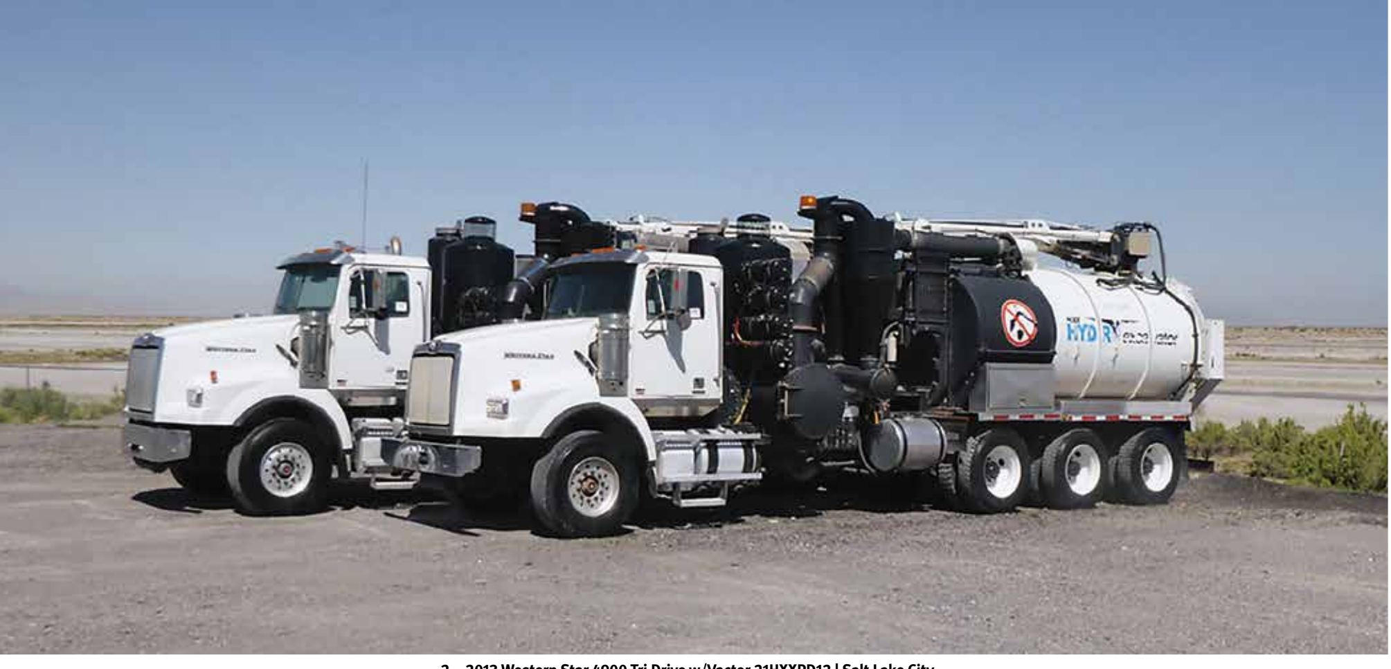
2 – 2013 Western Star 4900 Tri Drive w/Vactor 21HXXPD12 | Salt Lake City