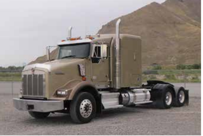
2015 Kenworth T800 | Salt Lake City