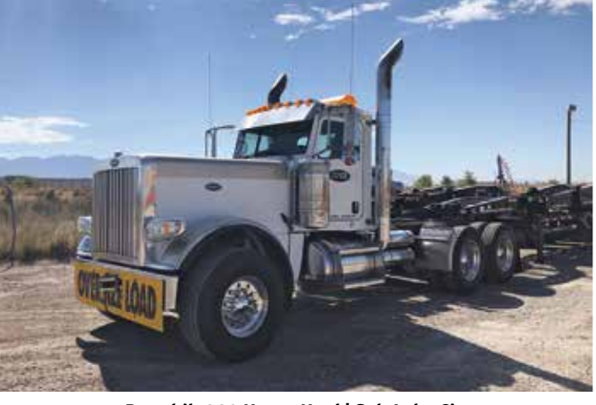
Peterbilt 389 Heavy Haul | Salt Lake City