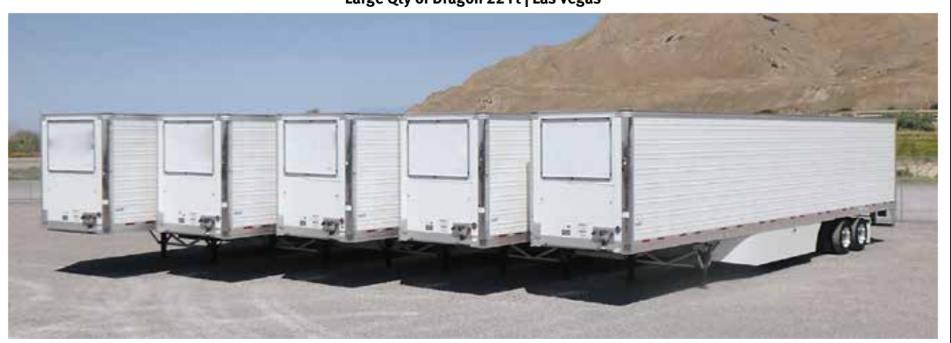
Large Qty of Unused - 2020 Vanguard 53 Ft Reefer