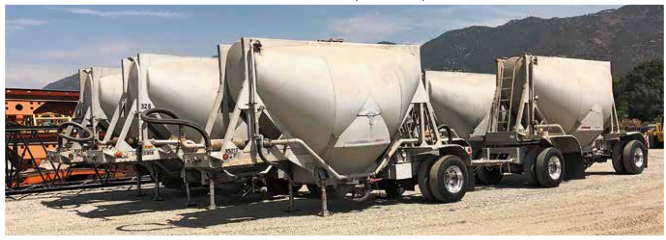
Qty of J&L 570 Cu Yd | Las Vegas