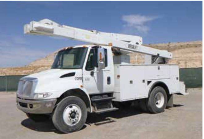
International 4200 w/Versalift VO43I | Las Vegas