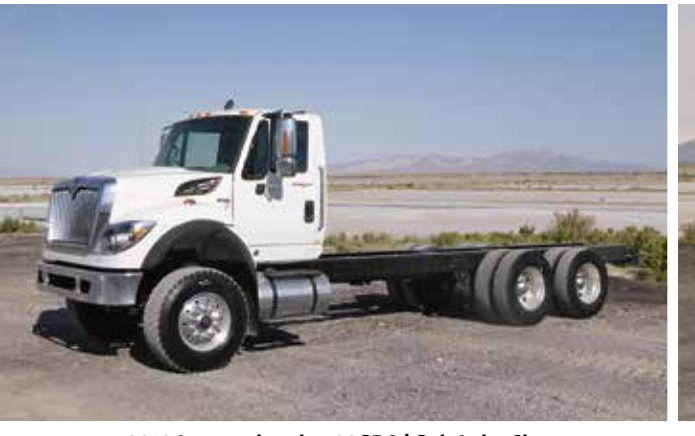
2012 International 7500SBA | Salt Lake City