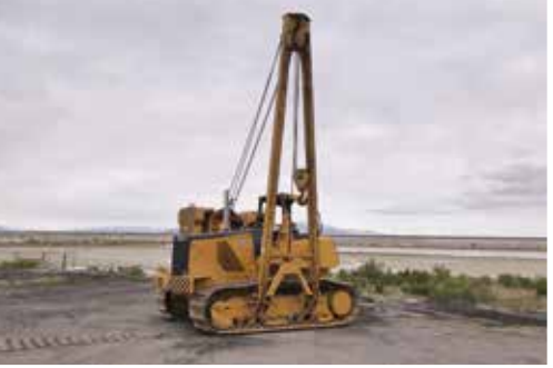
John Deere 850J w/Midwestern M572 Salt Lake City