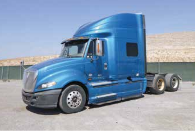
1 of 2 – 2015 International ProStar+ 122 | Las Vegas