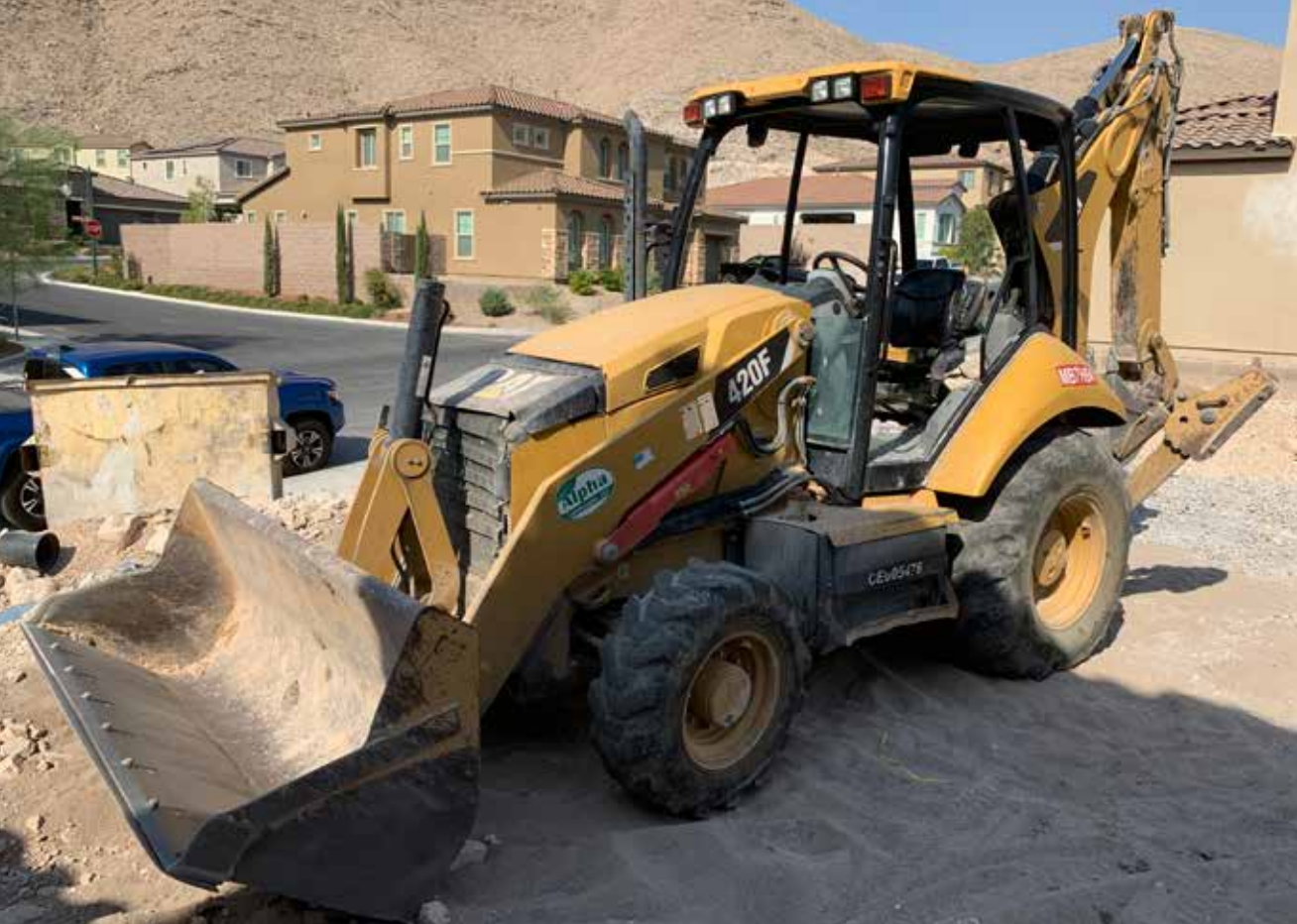
2014 Caterpillar 420F 4x4 | Las Vegas