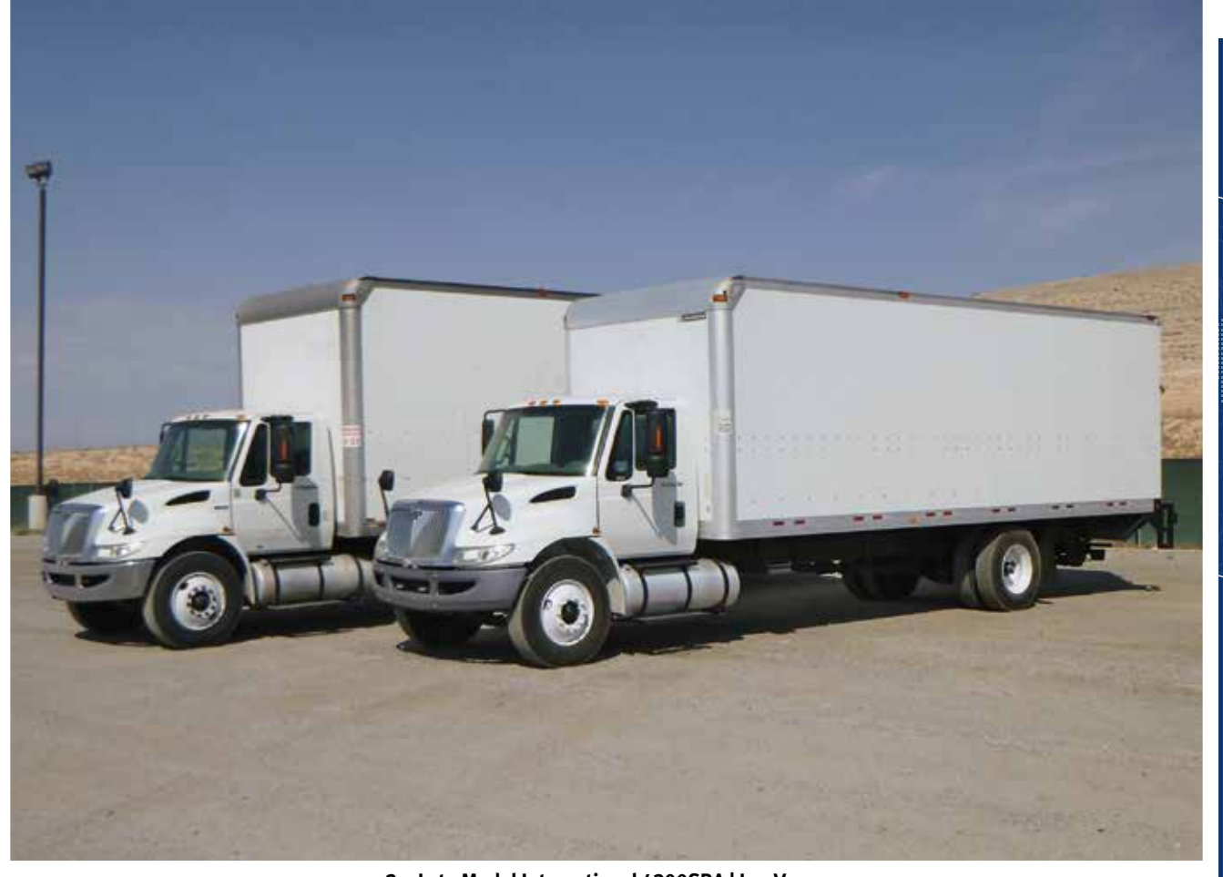
2 - Late Model International 4300SBA | Las Vegas