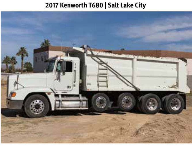
Freightliner FLD120 | Las Vegas