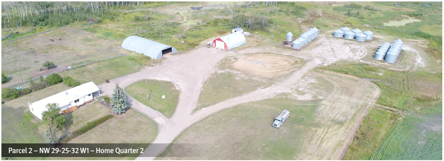
Parcel 2 – NW 29-25-32 W1 – Home Quarter 2