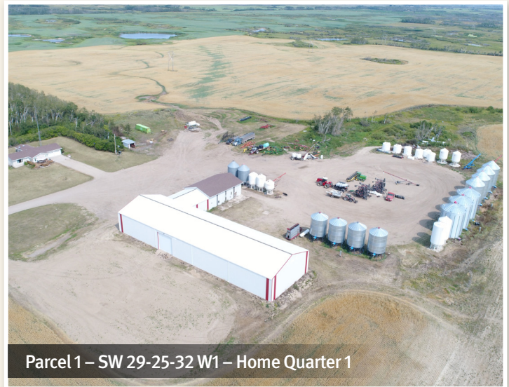
Parcel 1 – SW 29-25-32 W1 – Home Quarter 1

Property may be viewed by appointment only