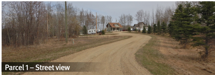
Parcel 1 – Street view