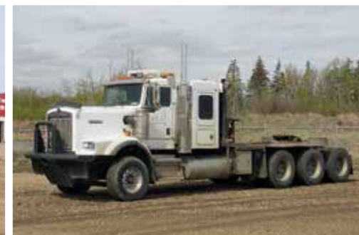
Kenworth C500 Winch