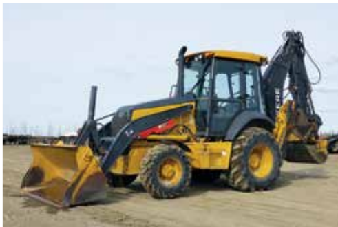
2014 John Deere 410K 4x4