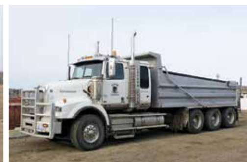
2015 Western Star 4900SA