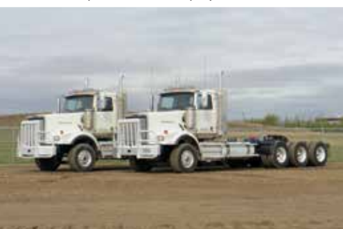
2 - 2013 Western Star 4900SA