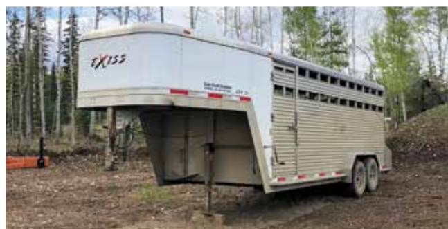
Universal Exiss STK-20 20 Ft