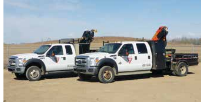
2 of 6 – Late Model Ford F550 4x4 w/Picker