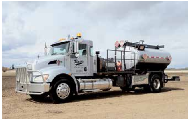
2012 Kenworth T370 8000 Litre Pressure

See complete auction and equipment information on our website