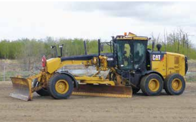
2013 Caterpillar 160M2 VHP Plus