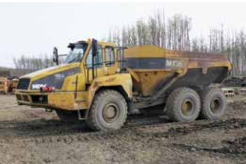
1 of 2 - Moxy MT36