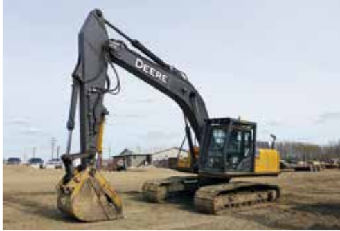
2012 John Deere 250G LC