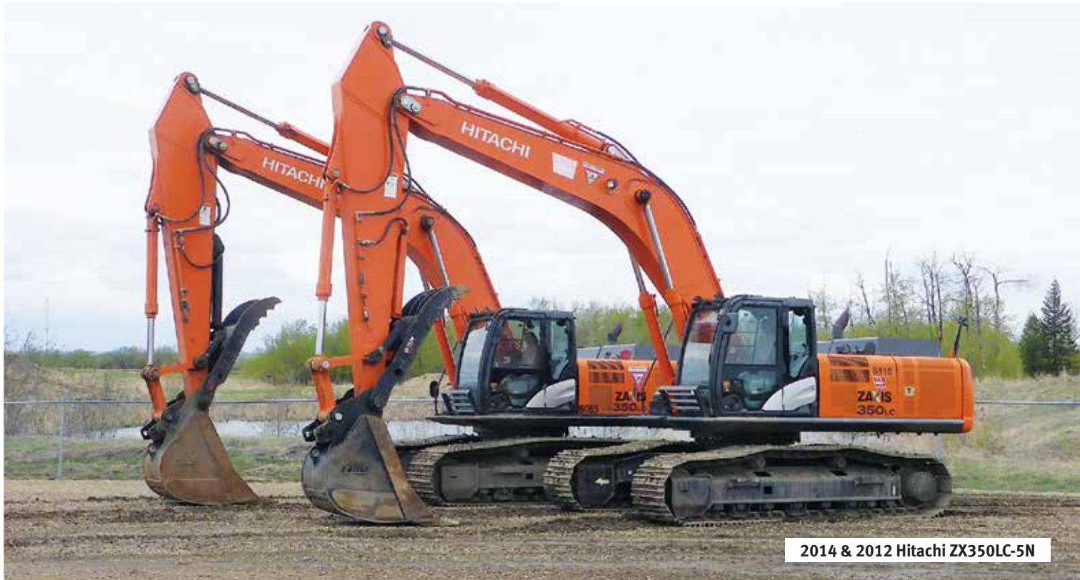
2014 & 2012 Hitachi ZX350LC-5N