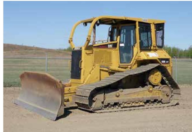
Caterpillar D6N LGP