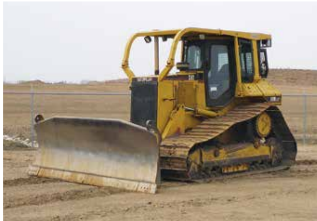
Caterpillar D6M LGP