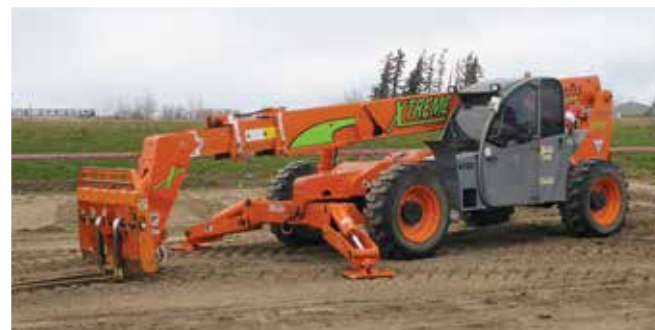
2012 Xtreme 1255 12000 Lb 4x4x4

ARTICULATED DUMP TRUCKS: 2- Caterpillar 730 • 2- Moxy MT36.