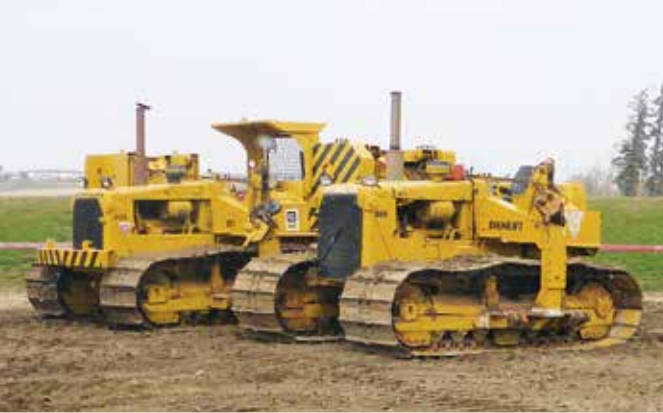
2 of 6 – Caterpillar D6D w/Danlift DLD Hyd