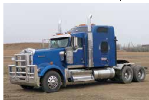
2013 Kenworth W900