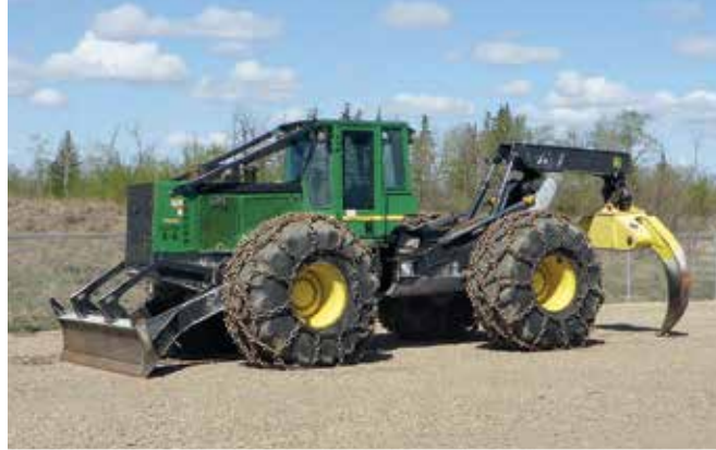
2010 John Deere 748H