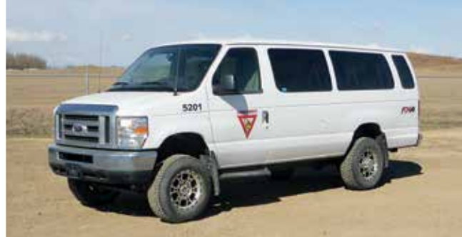
2014 Ford E350 XLT 4x4 15 Passenger