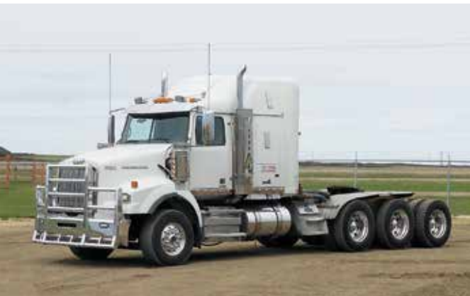
2012 Western Star 4900SA