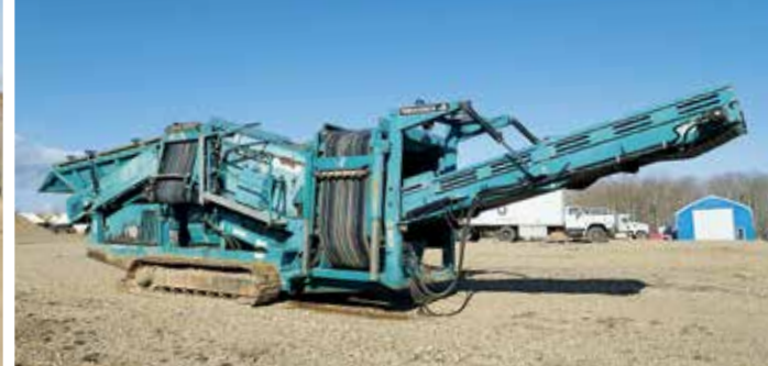
Powerscreen Warrior 1400