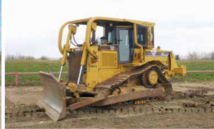
Caterpillar D7R XR Series II