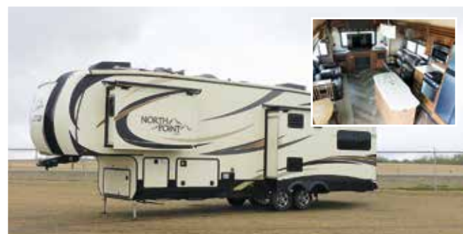
2016 Jayco North Point 31 Ft