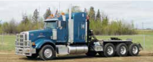
2012 Peterbilt 367 Winch