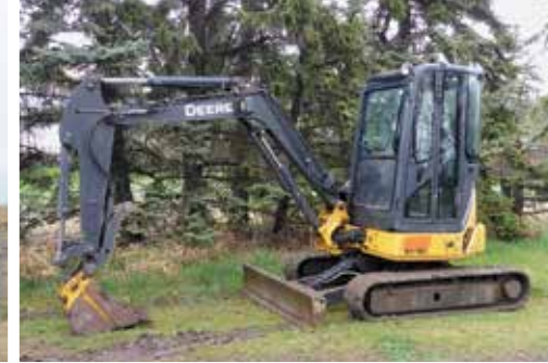
2012 John Deere 35D