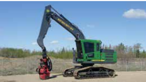
2017 John Deere 2154G w/Waratah HTH622C