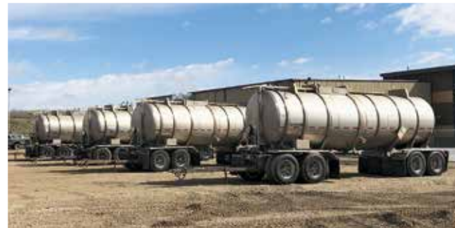
1 of 4 – 2013 West-Mark 31418 Litre