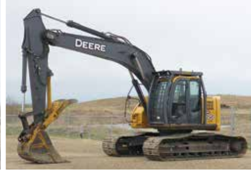
2011 John Deere 225D LC