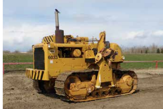
Caterpillar 571G w/2013 Midwestern 571MMC