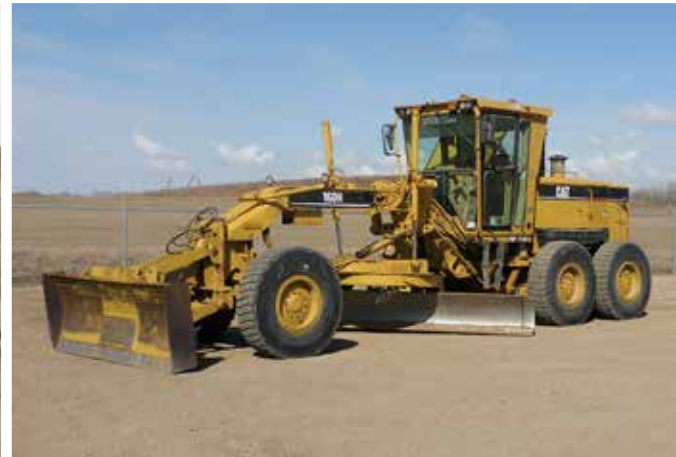
Caterpillar 160H VHP Plus