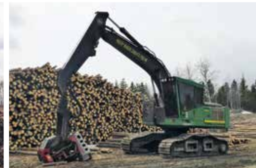
2012 John Deere 2154D w/Waratah 622B