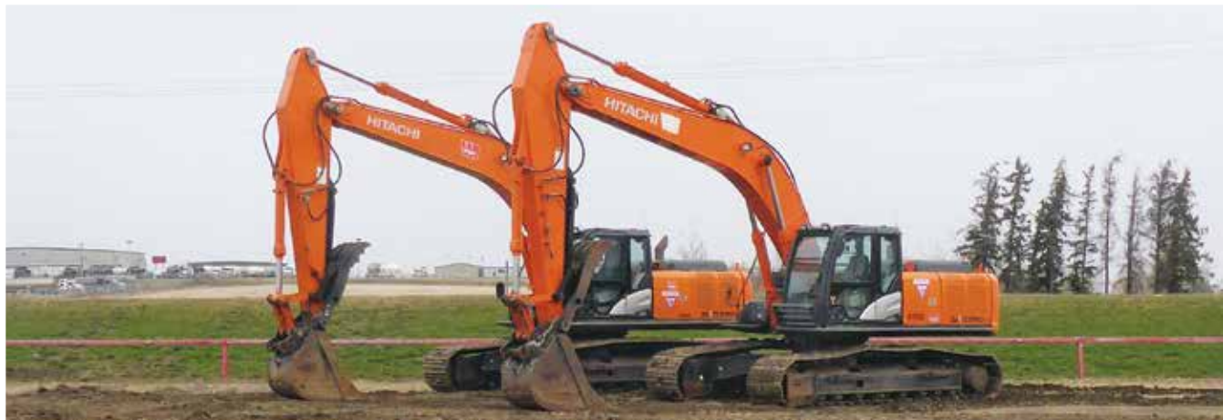
1 of 5 - 2013 & 1 of 5 - 2012 Hitachi ZX290LC-5N