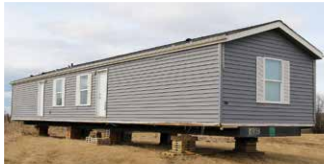
2012 Palm Harbour 4M71S11 72 Ft x 16 Ft