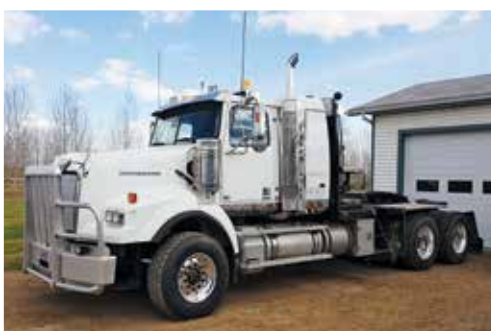
2013 Western Star 4900SB