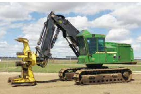
John Deere 953J w/FR22B