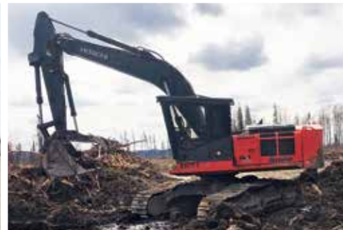
2012 Hitachi ZX240F-3