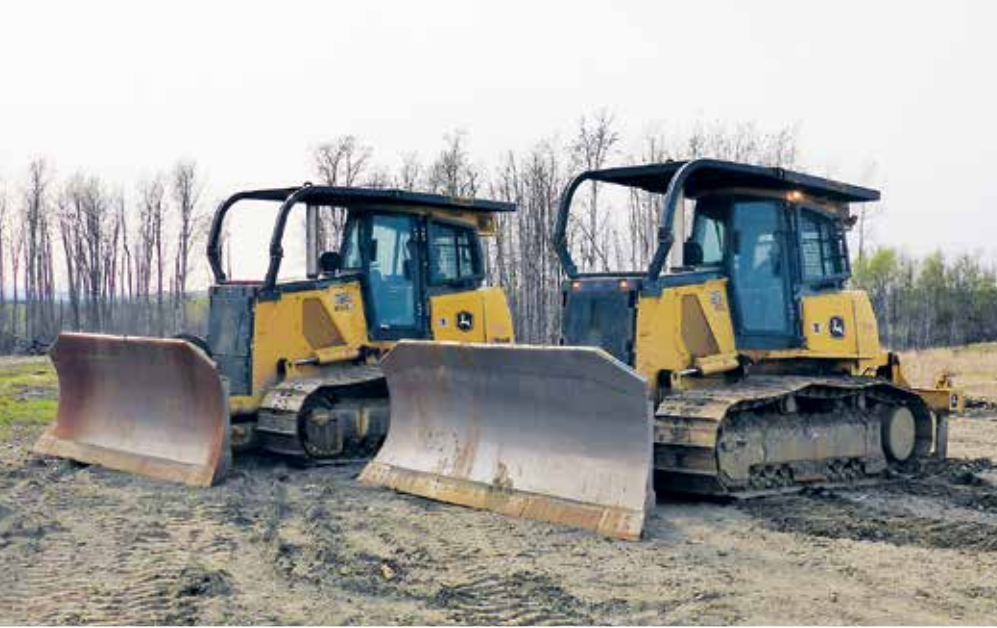
2013 & 2012 John Deere 850J WLT