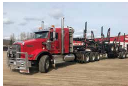
2016 Kenworth T800 & 2016 Doepker