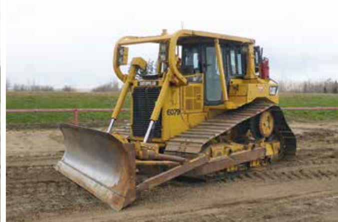
Caterpillar D6T LGP