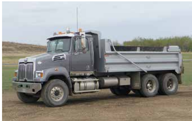
2016 Western Star 4900SF