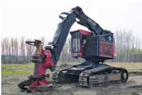
Valmet 445 EXL Tilter