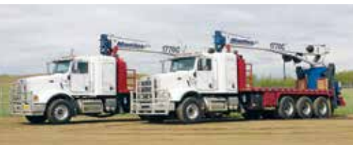
2015 & 2013 Peterbilt 365 w/Manitex 1770C