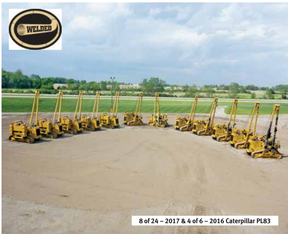
8 of 24 – 2017 & 4 of 6 – 2016 Caterpillar PL83