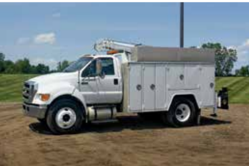
Ford F650 XLT