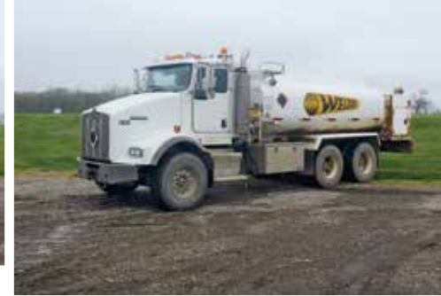
1 of 2 – Kenworth T800 3000 Gallon Refueler