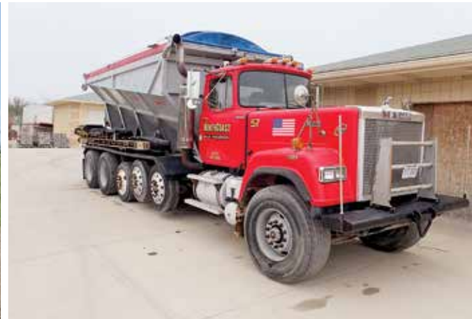
Mack RW713 Superliner