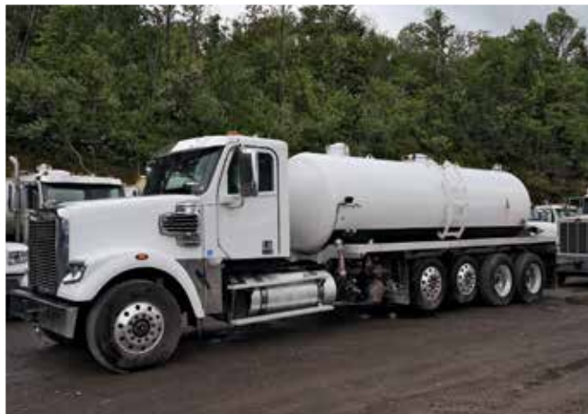
1 of 9 - Freightliner 122SD 100 Barrel