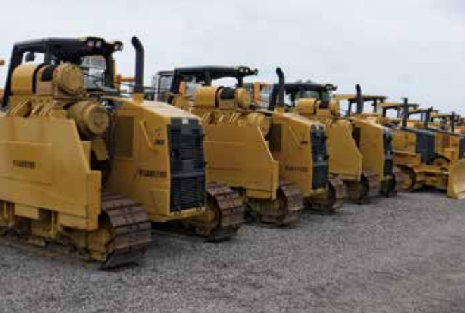
3 – 2013 Caterpillar PL61