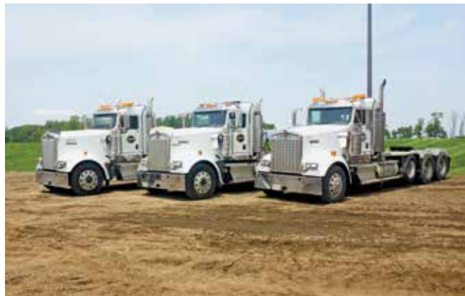
3 – Kenworth W900

See complete auction and equipment information on our website