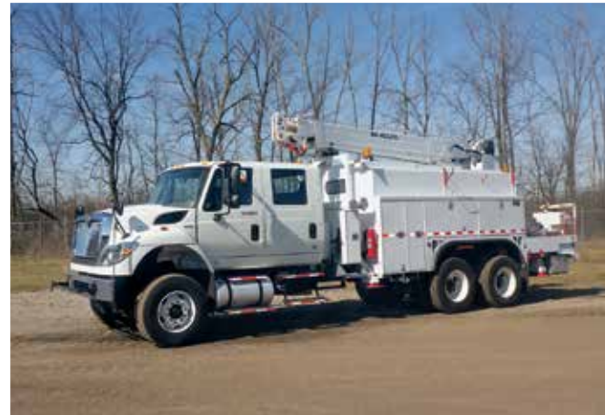
2012 International 7400SBA w/Altec DM47TCw