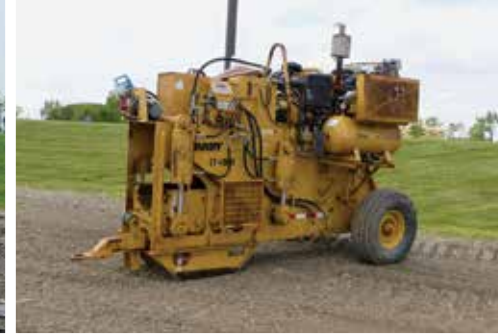
2016 Darby 620