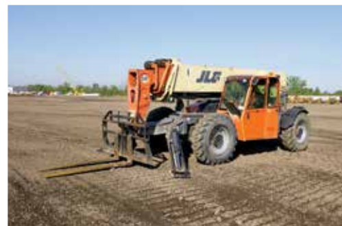
2012 JLG G1255A 12000 Lb 4x4