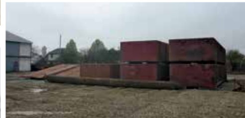
Flexifloat S50 To be sold by photo in Perrysburg, OH