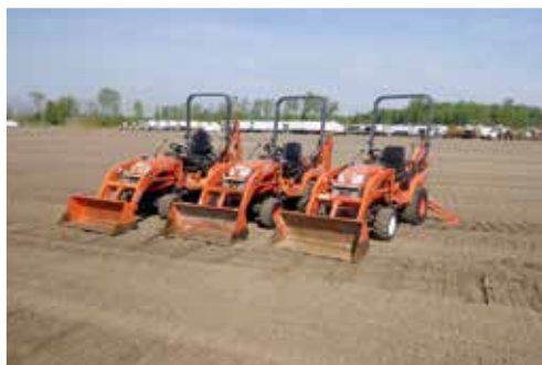
1 of 2 – 2014 & 2 – 2012 Kubota BX25 4x4