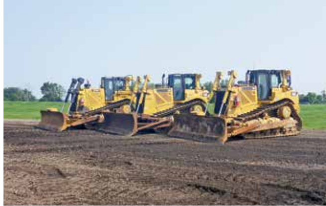
1 of 6 – 2012 & 2 of 4 – 2011 Caterpillar D8T