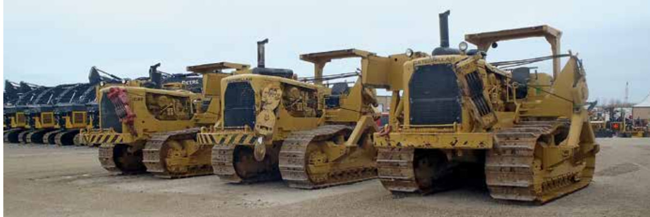
3 of 4 – Caterpillar D9H w/Superior SP594