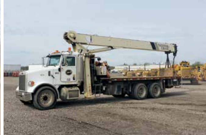
Peterbilt 357 w/National 11105 26.5 Ton