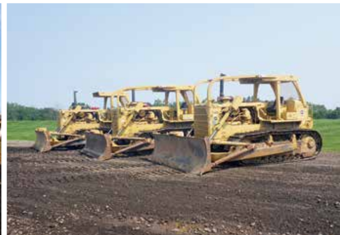
3 of 4 – Caterpillar D8K