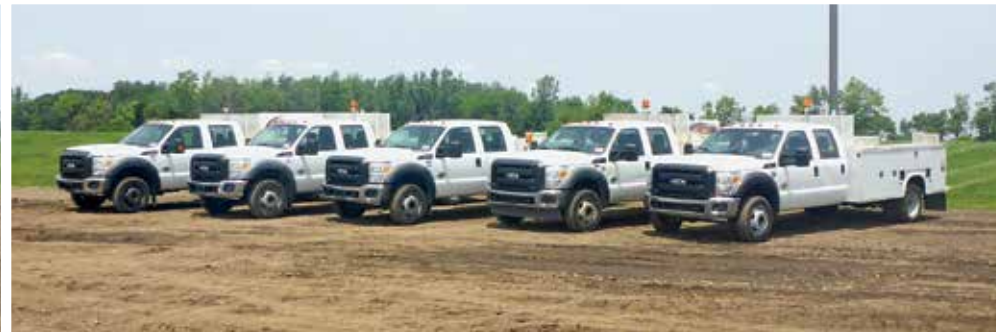
5 – 2011 Ford F550 XL