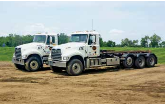
2 – 2016 Mack GU713