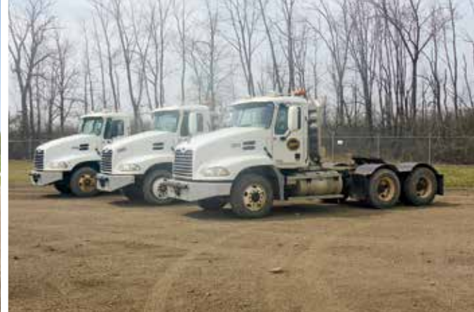
3 of 14 – Mack CX613