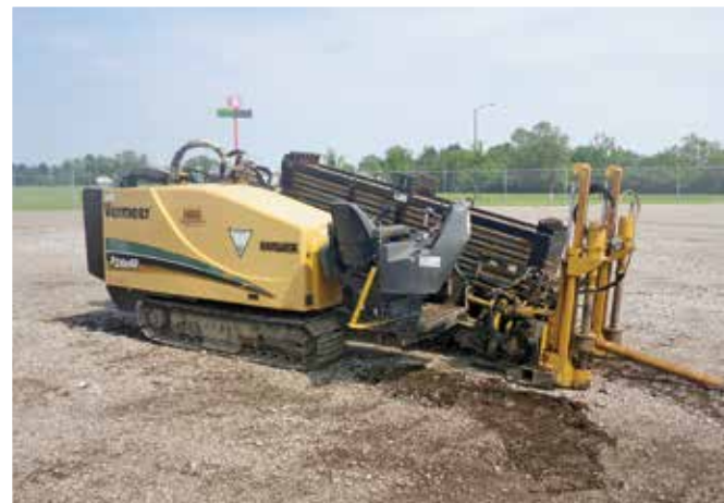
2010 Vermeer D24X40 Series II