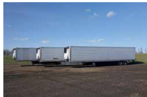
3 of 10 – 2012 Wabash 53 Ft