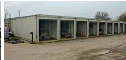
Containers w/ Large Qty of Pipeline Supplies – To be sold by photo in Perrysburg, OH