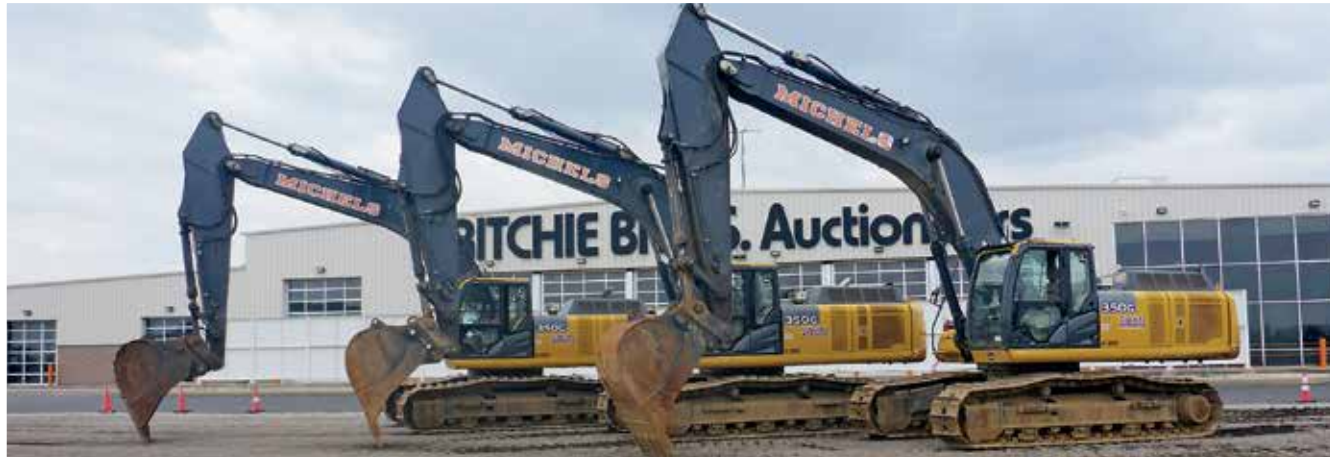
3 of 10 – 2013 John Deere 350G LC