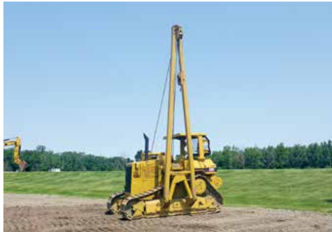
Caterpillar D5H w/Midwestern M540