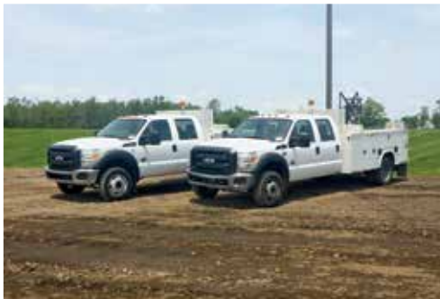
2 – 2011 Ford F450 XL