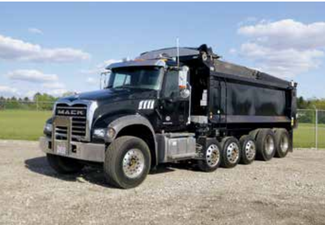
2017 Mack GU713