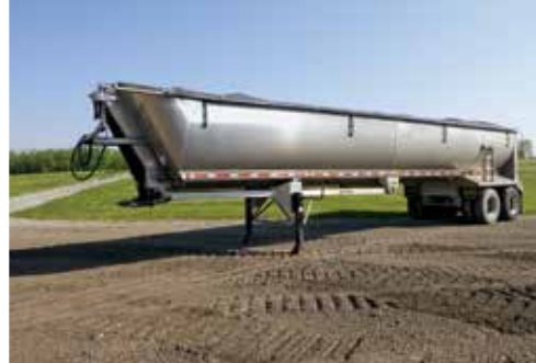
2017 Mac 40 Ft Aluminum