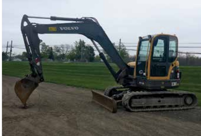
2013 Volvo ECR88