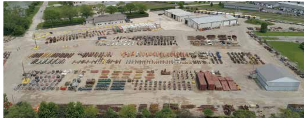
Large Qty of Pipeline Supplies – To be sold by photo in Perrysburg, OH