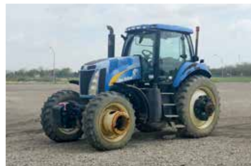
New Holland TG275