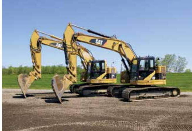
Caterpillar 321D LCR & Caterpillar 321C LCR