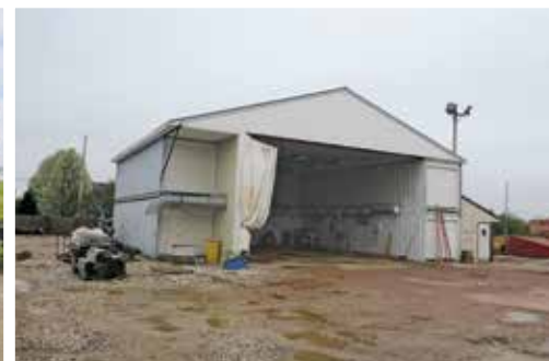
48 x 48 x 16 Ft Paint Shop