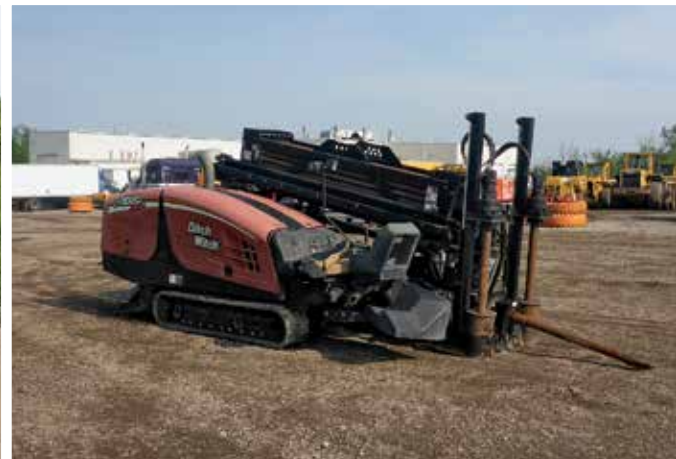
Ditch Witch JT3020