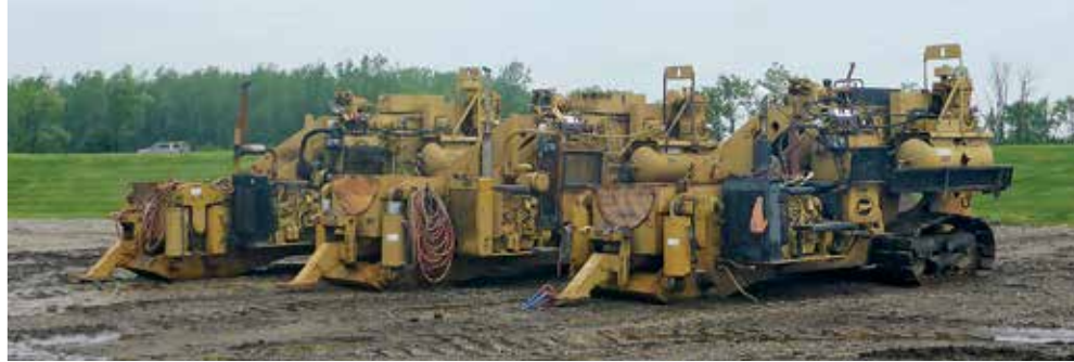
3 of 4 – CRC PB3242