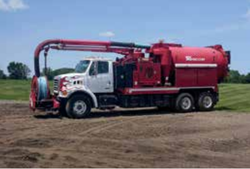
Sterling L9500 w/Vac Con