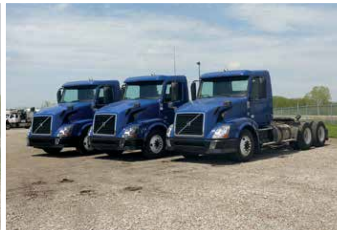
3 of 6 – 2012 Volvo VNL64300