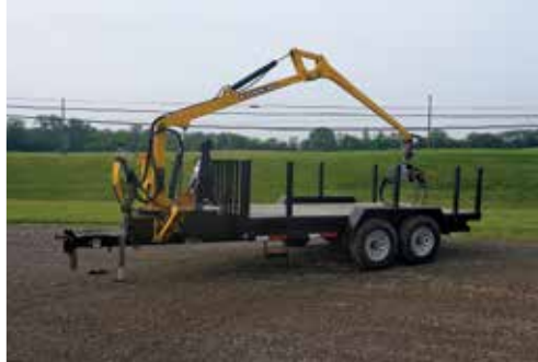
2016 Coyote LGT14 w/Anderson M160