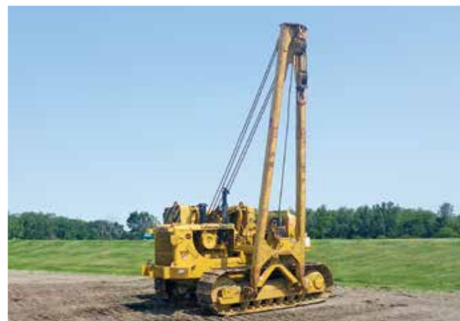
1 of 2 – Caterpillar 572E