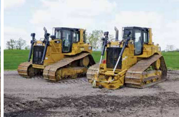
1 of 2 – 2012 & 2011 Caterpillar D6T LGP