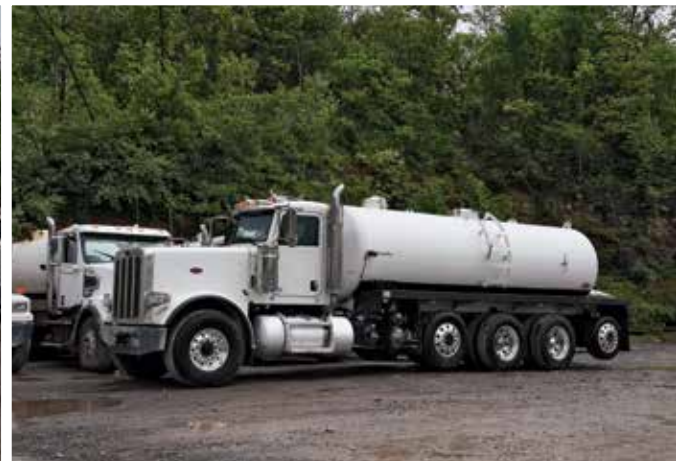
1 of 10 - Peterbilt 389