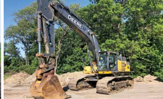
1 of 5 – 2013 John Deere 470G LC