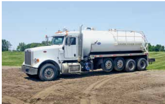
2014 Peterbilt 367