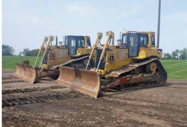
2 – Caterpillar D7R LGP Series II