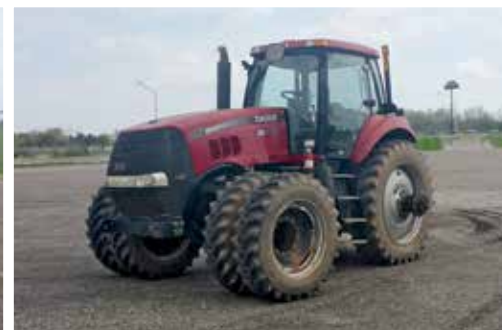
Case IH Magnum 245