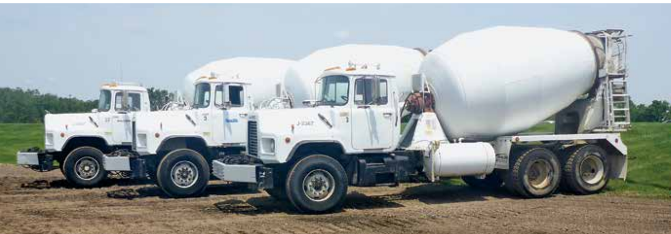
3 of 6 – Mack DM690S