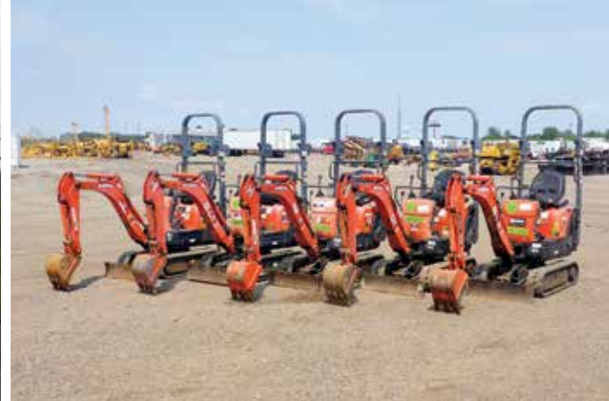
2 of 5 – 2013 & 3 – 2012 Kubota K008-3