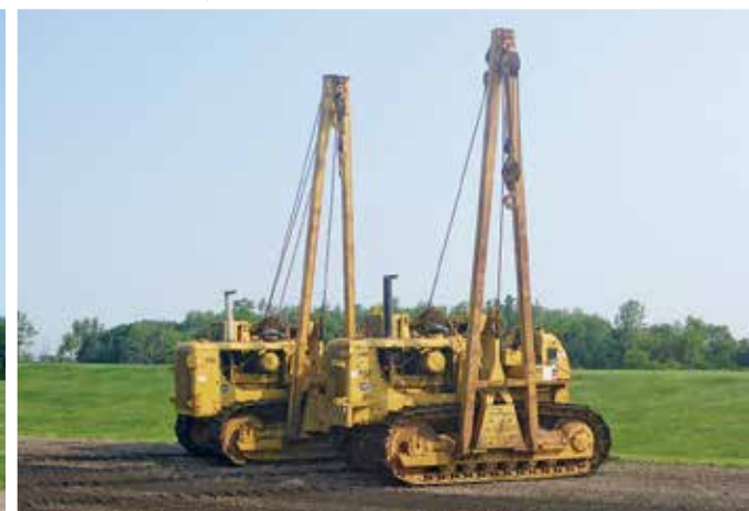
2 – Caterpillar 571F