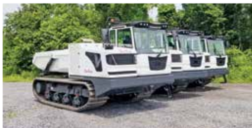
2 – 2017 & 2016 Power Bully 12RT Low meter hours