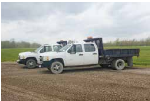
2 of 11 – Chevrolet 3500HD 4x4