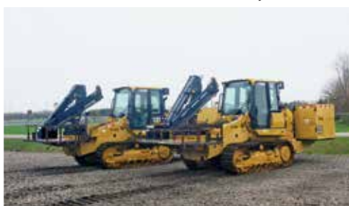
2 – 2012 Caterpillar 953D