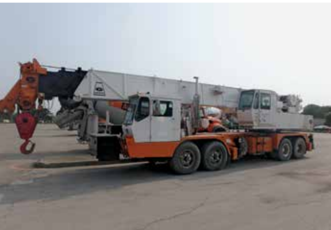
Grove TMS475 50 Ton