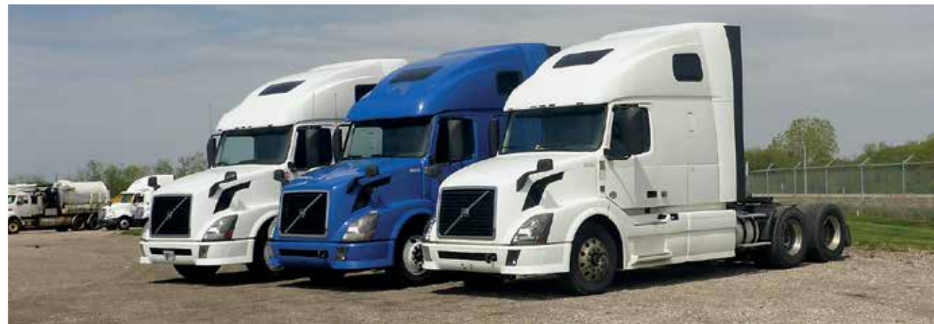
3 of 6 – 2013 Volvo VNL64670