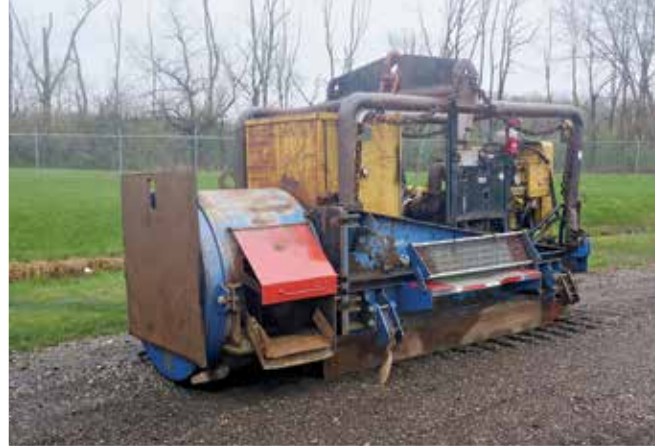
American Augers 54-1MS 54 In.