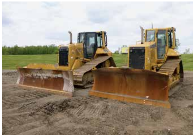
1 of 3 – Caterpillar D6N LGP & Caterpillar D6N XL