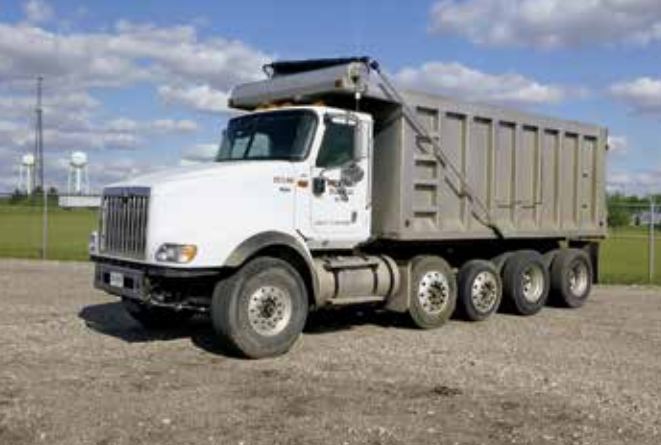
2014 International PayStar