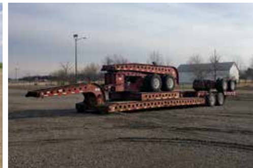
Trail King TK120MDG-622 60 Ton