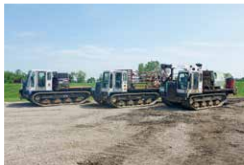
3 – IHI IC70-2