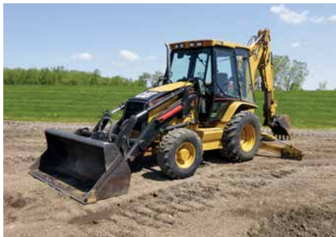
Caterpillar 420D IT 4x4