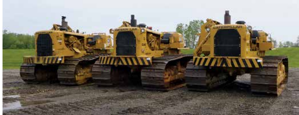
3 of 14 – Caterpillar 594 w/Vanguard