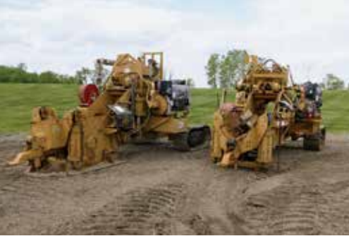
2 – CRC-Evans PB620