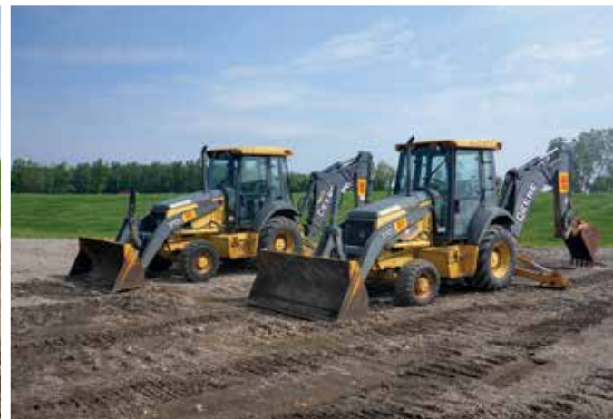
2 – John Deere 310J 4x4