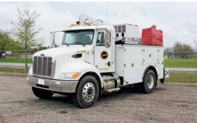
2017 Peterbilt 337 – Low mileage