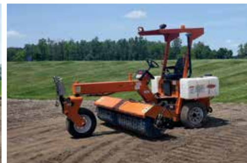
2015 Lay-Mor SM300