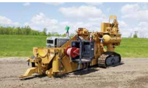
2013 CRC-Evans PB1630