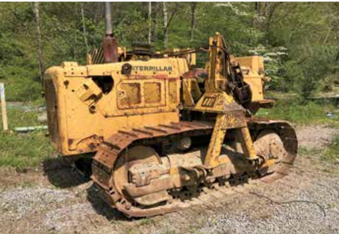
1 of 3 – Caterpillar D6D w/Midwestern M562