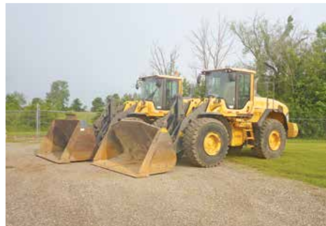
2 – 2012 Volvo L120G