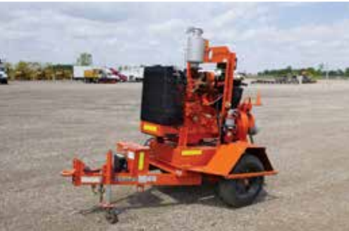
1 of 2 – 2014 Godwin CD200M 8 In.