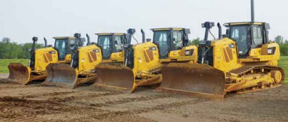
4 of 5 – 2010 Caterpillar D7E