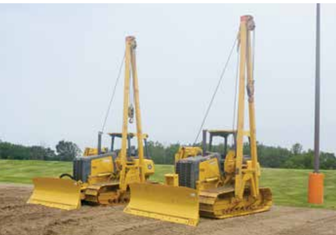
2 of 5 – John Deere 700J w/Midwestern M540