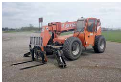
1 of 4 – Skytrak 10054 10000 Lb 4x4x4