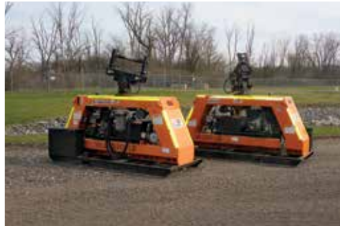
2 of 3 – 2016 Lift Technologies LT30