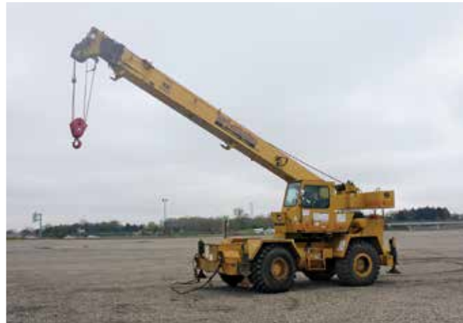
Grove RT522 22 Ton