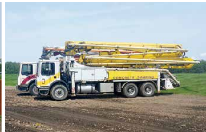
Mack MR688 w/Putzmeister M382 & Mack MR688 w/Putzmeister M36Z