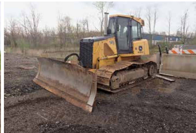
2011 John Deere 750J LGP