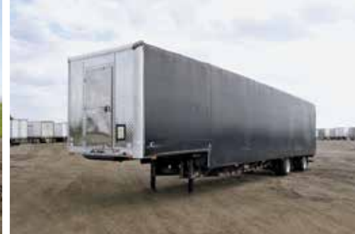
1 of 3 – Transcraft Eagle W2 53 Ft