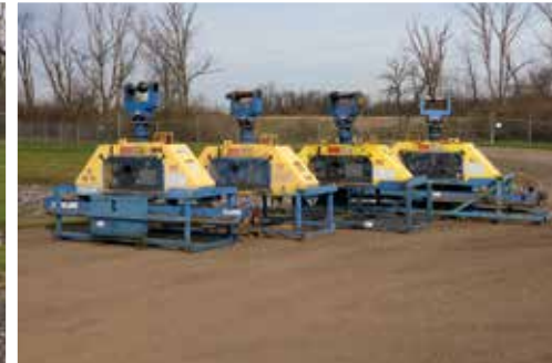
4 of 6 – Vacuworx RC10