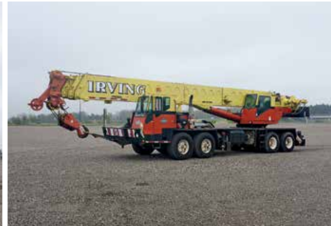
Link-Belt HTC1055 55 Ton