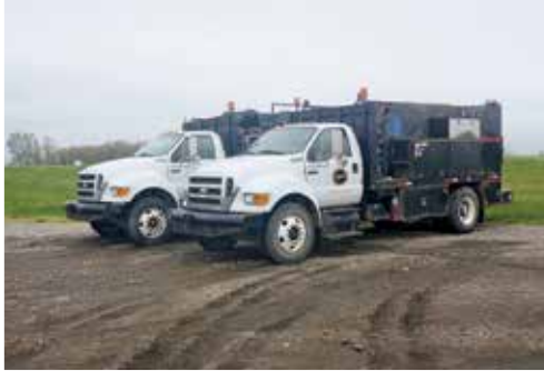
2 – Ford F750 XL Lube