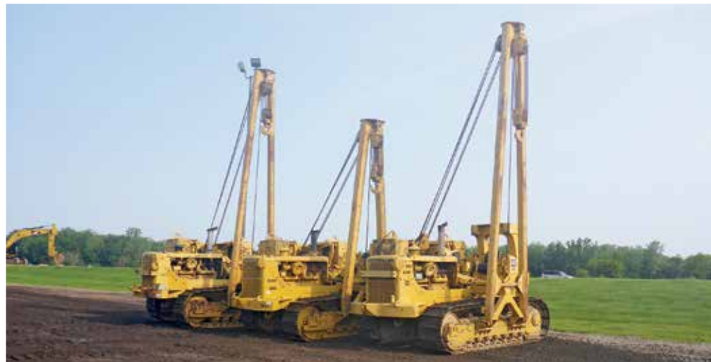
3 of 10 – Caterpillar 583H