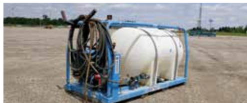
1 of 4 – Grundmudd DS500 500 Gallon