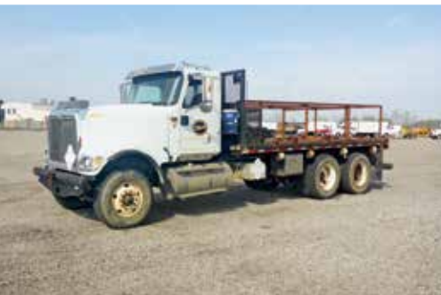
1 of 3 – International 5900I