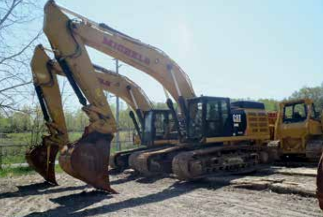
2013 Caterpillar 349EL