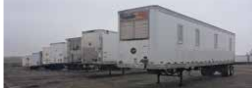
Large Qty of Warehouse Trailers