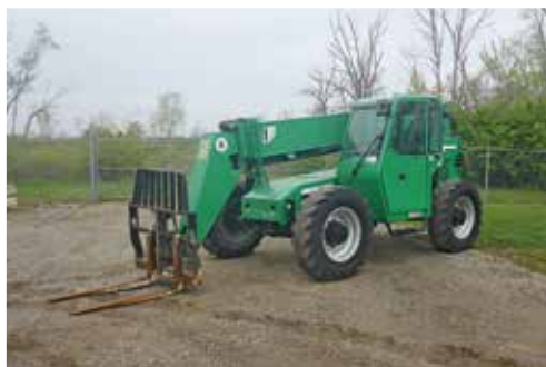
1 of 2 – 2011 Skytrak 6042 6000 Lb 4x4x4