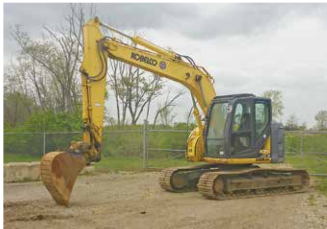
2011 Kobelco SK140SRLC