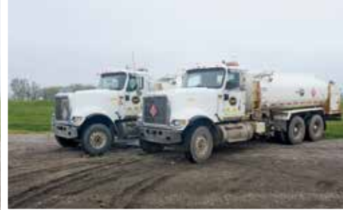
2 – International 5900I SFA 3000 Gallon Refueler