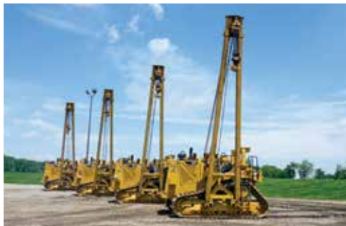
2 of 9 – 2018 & 2 of 3 – 2017 Caterpillar PL87