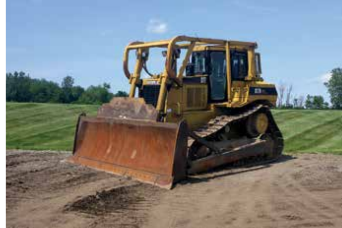
Caterpillar D7R LGP