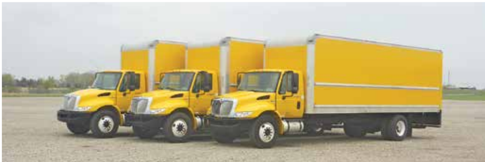
3 of 10 – 2014 International 4300SBA