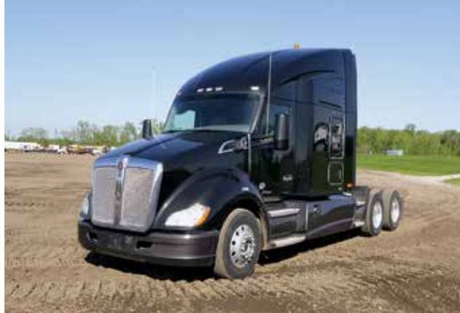
2016 Kenworth T680