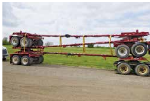
3 of 18 – 2016 Sunbelt 40 Ft