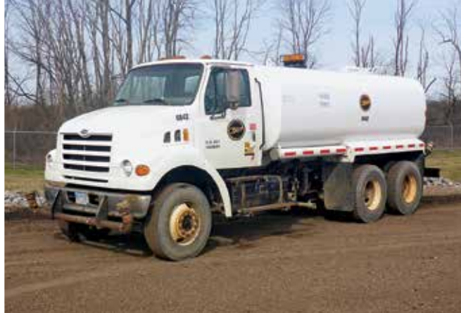
Sterling LT7501 4000 Gallon