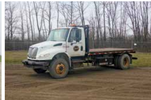
1 of 9 – International 4300SBA