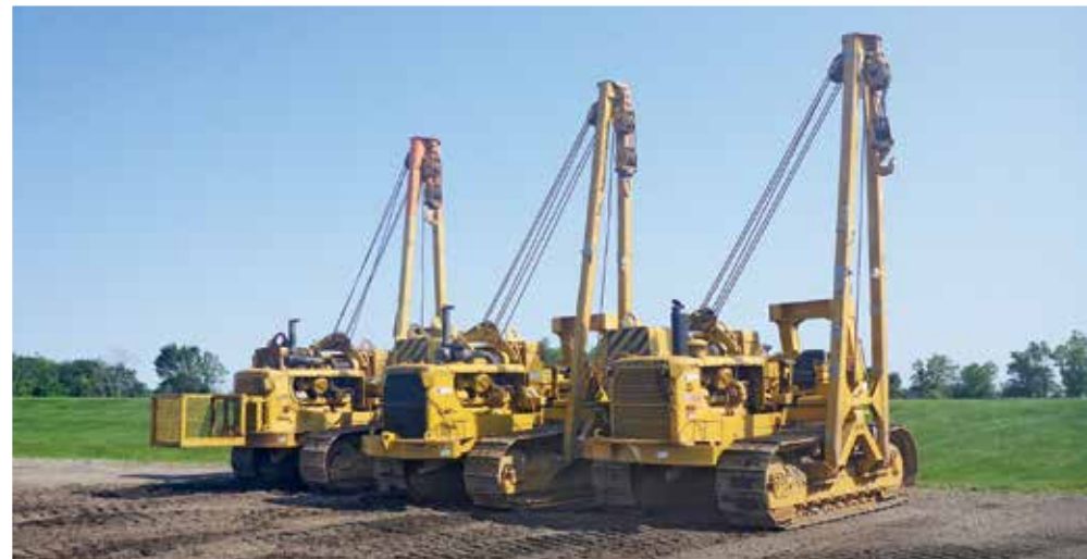
3 of 7 – Caterpillar 583K w/Vanguard