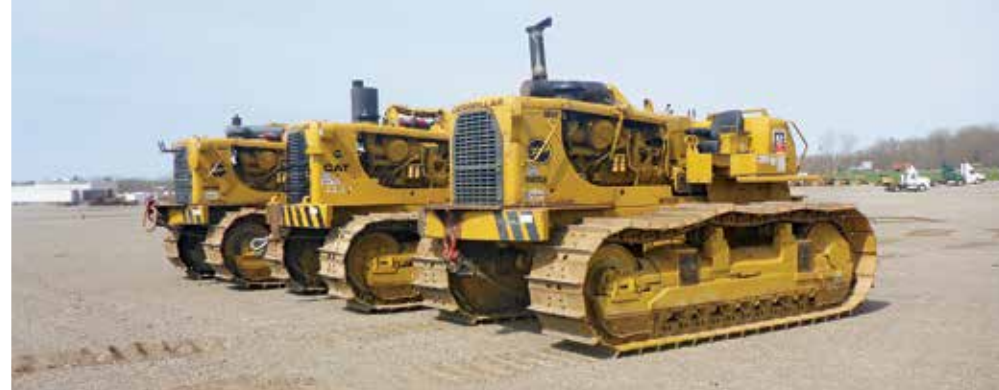
3 of 15 – Caterpillar 594H w/Vanguard