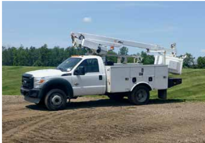
2011 Ford F450 XL w/Altec AT200A