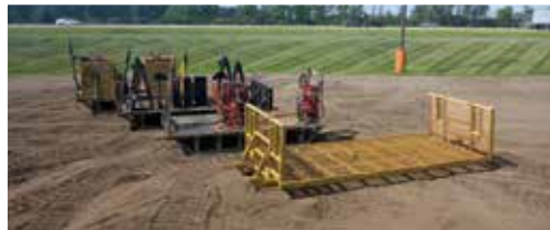
Large Qty of Pipeline Sleds