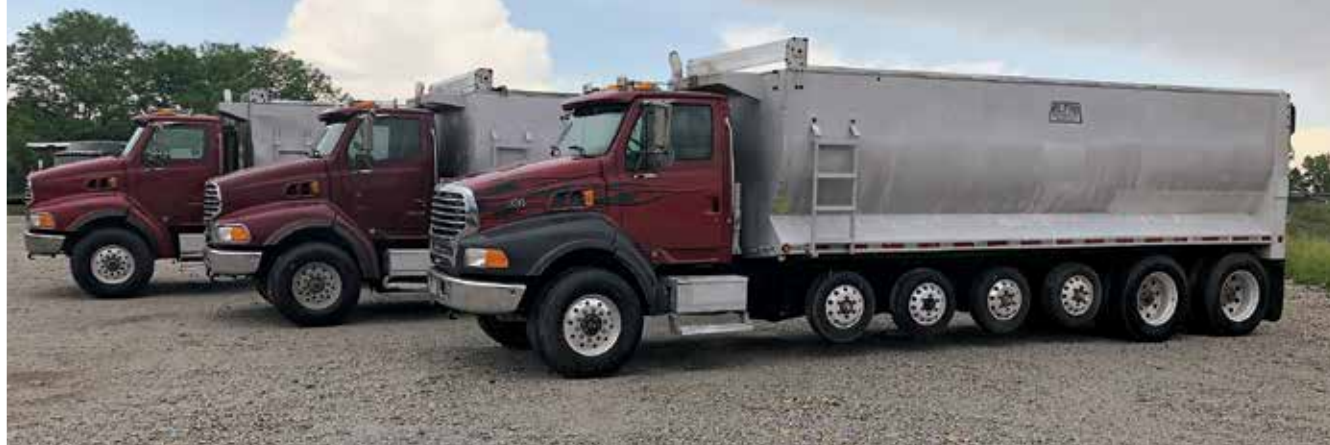
3 – Sterling LT9513