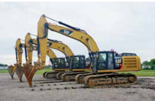
3 of 14 – Caterpillar 336EL