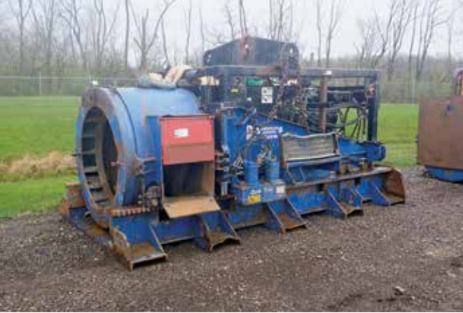
American Augers 60-1200 60 In.