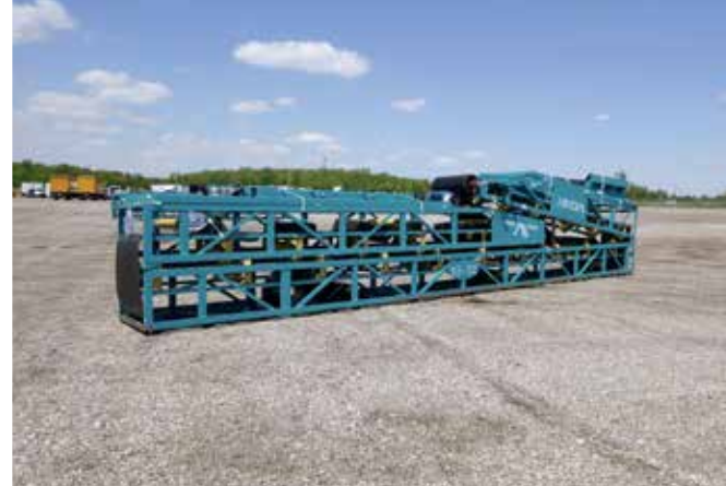
1 of 2 – Unused – 2019 Vickwest PRS8532 32 In. x 85 Ft