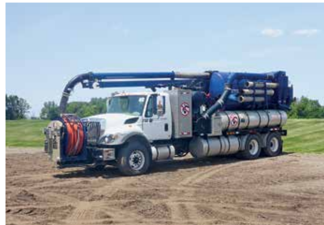
2010 International 7500SBA w/Vactor 2115P18