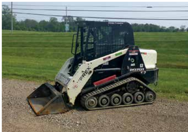
1 of 3 – Terex R070T