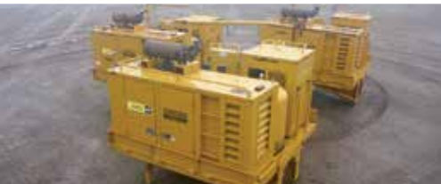
3 of 8 – Vanguard CPW125-4 Continuous