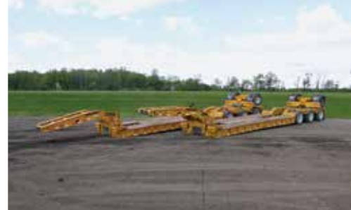
2 of 7 – 2017 Trail King TK110HDG & 2 of 6 – 2017 Trail King TKFA1