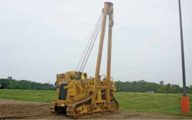
1 of 5 – Caterpillar 583T