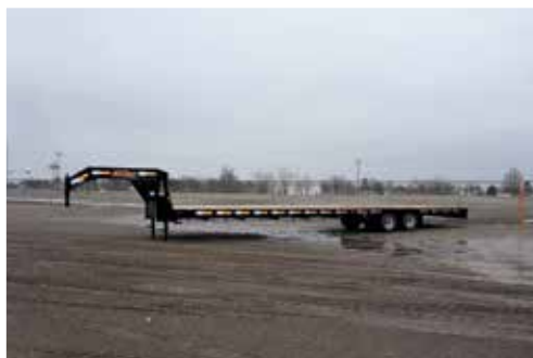
2019 Maxey 40 Ft