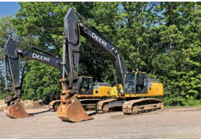
2 – 2015 John Deere 350G LC