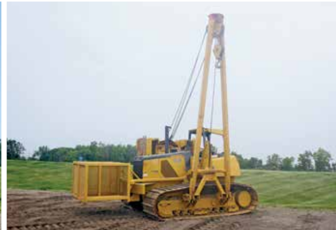
1 of 2 – John Deere 850J w/Midwestern M572CXL