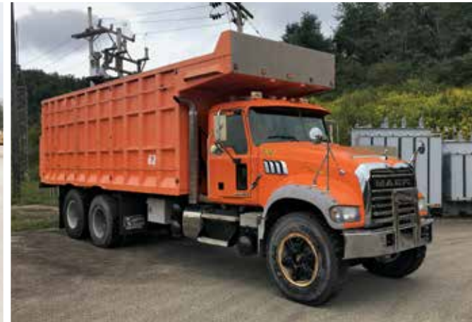
2010 Mack GU713 Off Highway