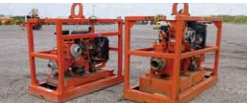
1 of 2 – Godwin CD150M 6 In. & 1 of 14 – CD100 4 In.