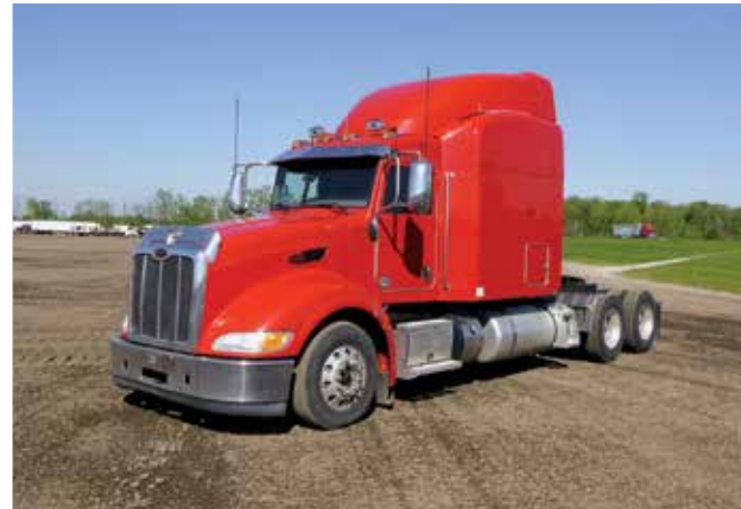
1 of 3 – 2013 Peterbilt 386