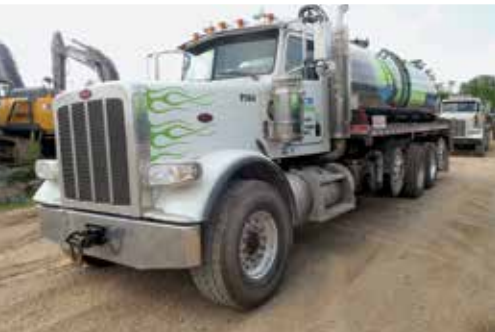
1 of 6 – 2016 Peterbilt 389 110 Barrel