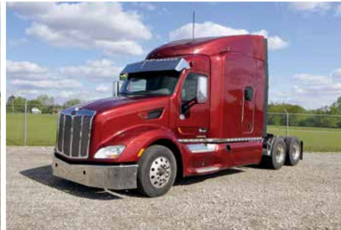
2015 Peterbilt 375