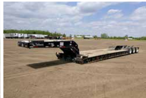
1 of 2 – 2014 Talbert 55 Ton