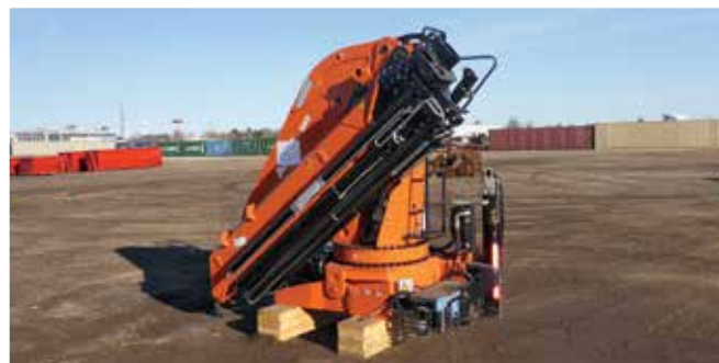
Unused – 2017 Atlas Copma 300