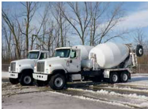
2 – International 5500I PayStar