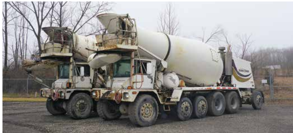
2 of 10 – Advance