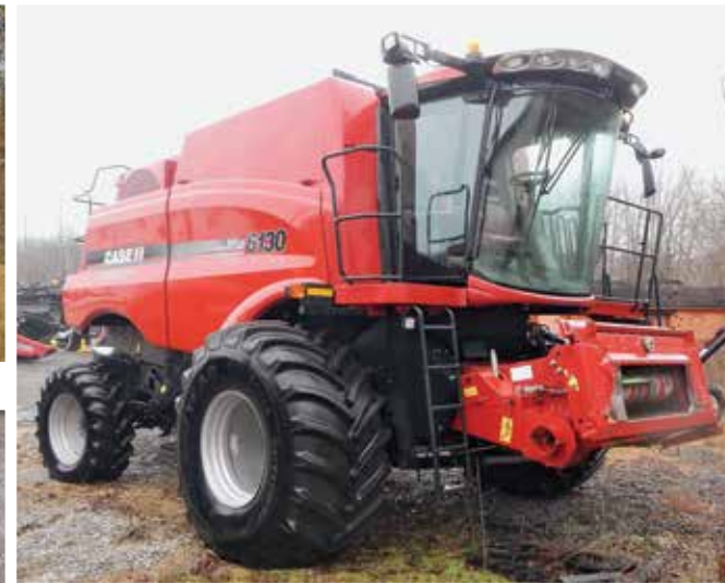
2013 Case IH 6130 4x4