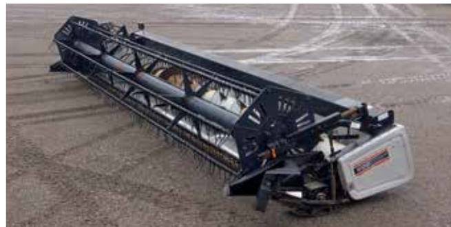
Gleaner 800 30 Ft