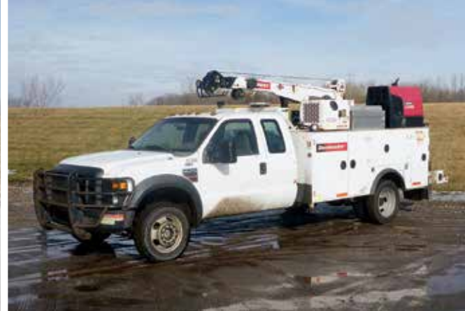
Ford F550 4x4