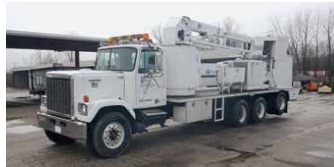
GMC General w/UB50 Bridge Inspection