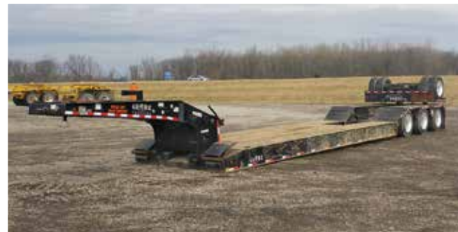
2012 Globe GTBN5545325H