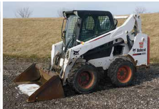
2013 Bobcat S570