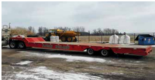
Trail-Eze TE70HT53 35 Ton