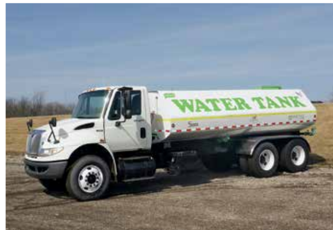
International 4400SBA 3500 Gallon