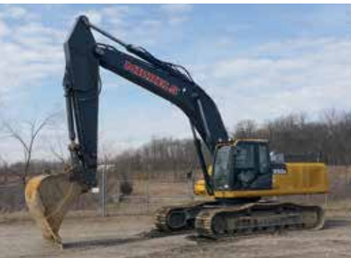
1 of 2 – 2013 John Deere 350G LC