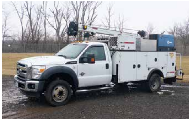
2012 Ford F550