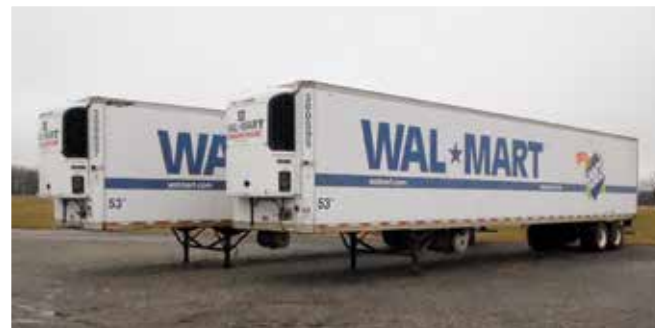
2 of 8 – Great Dane 7811TZ1 53 Ft