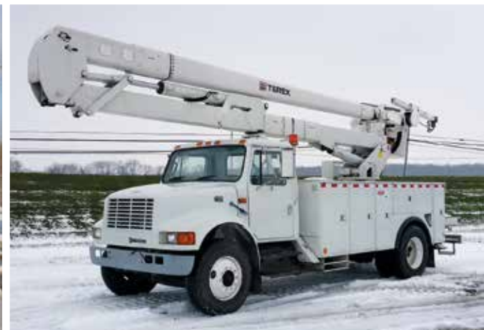
International 4700 w/Terex Hi-Ranger 5TC