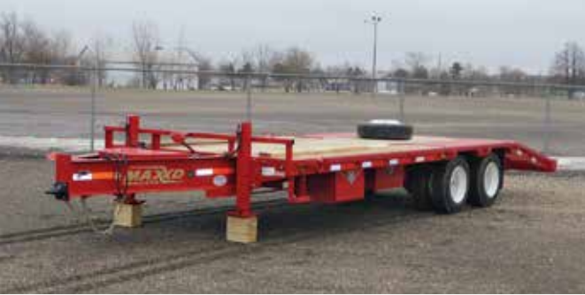
2019 Maxey 23 Ft