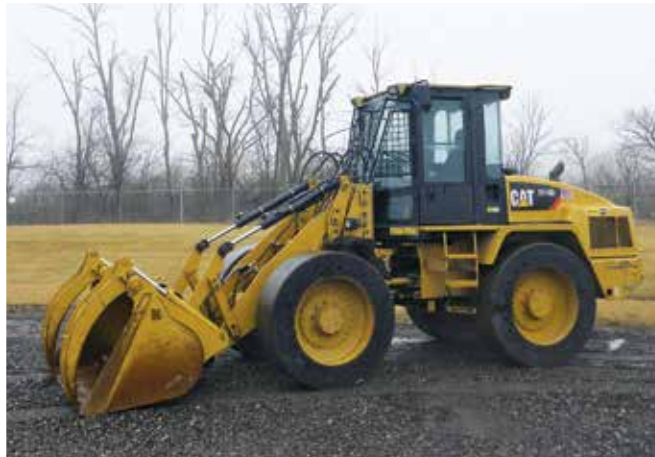
2014 Caterpillar IT14G2