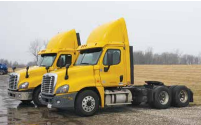
2 of 7 – 2013 Freightliner PX125064ST