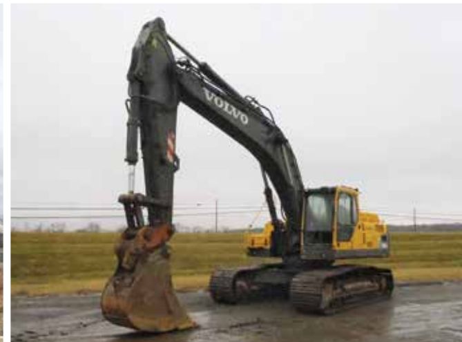
Volvo EC330B LC