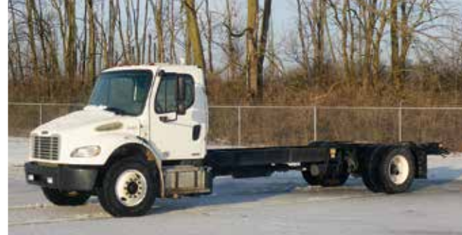
2012 Freightliner M2106