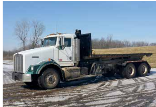
Kenworth T800 Hook