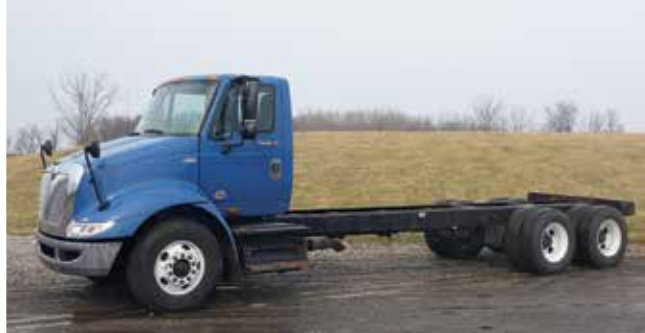
2013 International 8600SBA