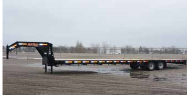
2019 Maxey 40 Ft