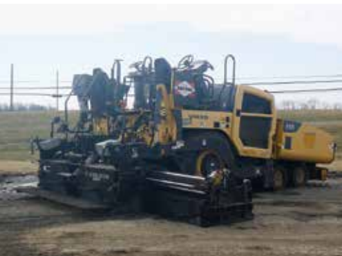
2013 Volvo P7170