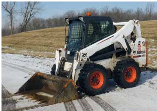
2014 Bobcat S650