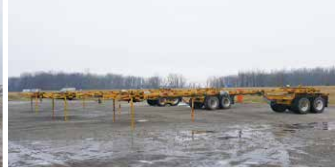
3 – 2018 Challenger Magnolia 65 Ft Extendable