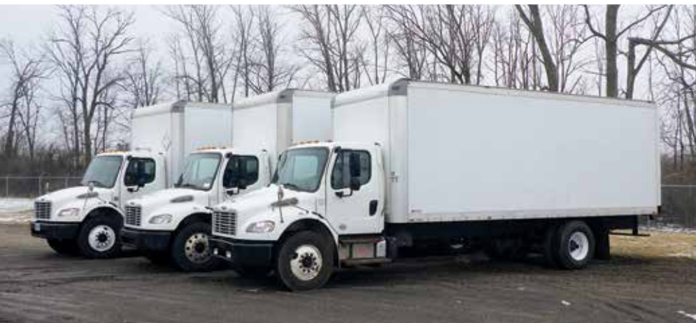
3 of 12 - Freightliner M2106