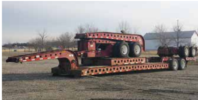
Trail King TK120MDG-622 60 Ton