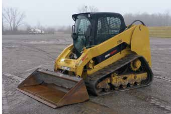
2012 Caterpillar 279C