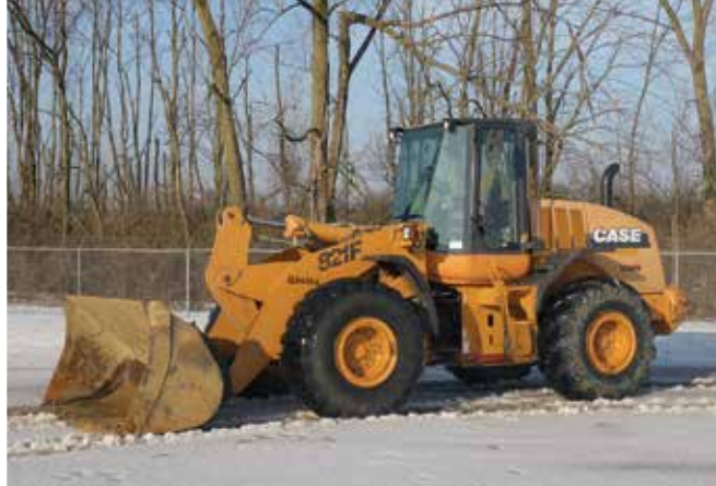
2011 Case 821F