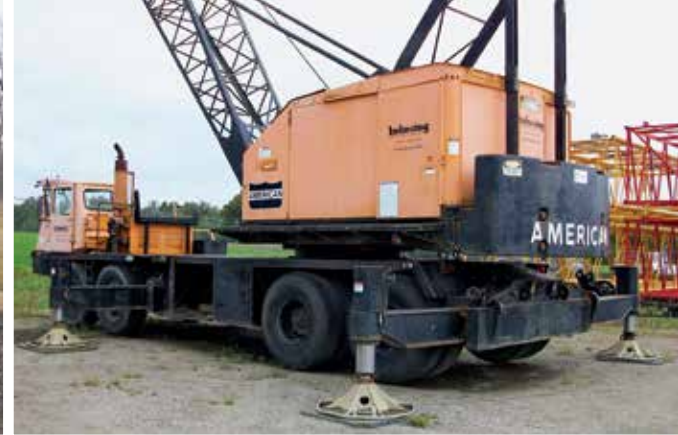
American 5460 8x4