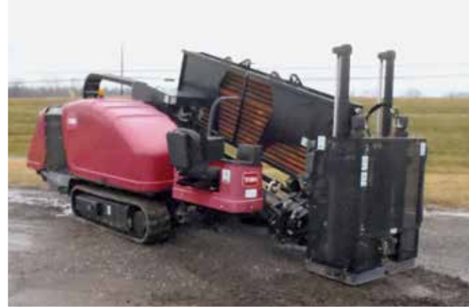
2013 Toro DD4045