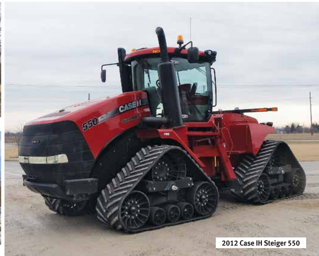
2012 Case IH Steiger 550