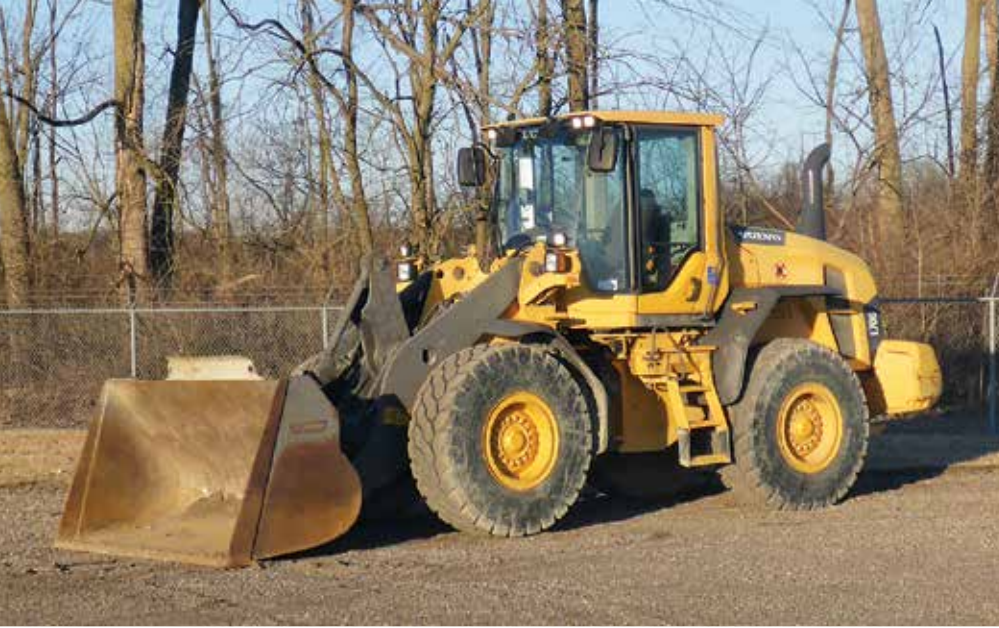
1 of 3 – 2012 Volvo L70G