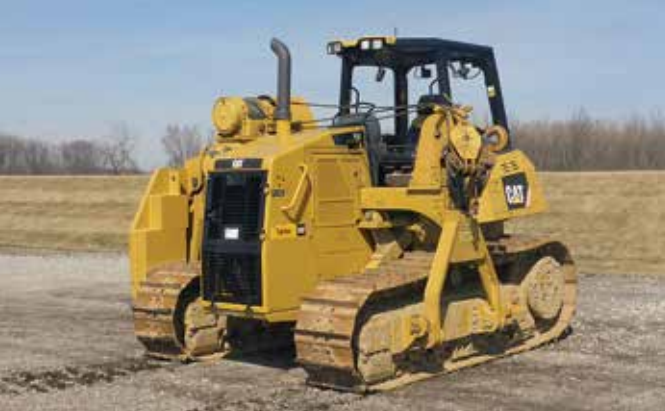
2014 Caterpillar PL61