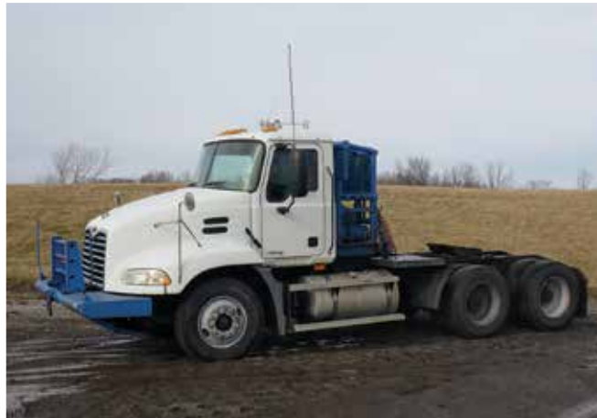
Mack CX613 Winch