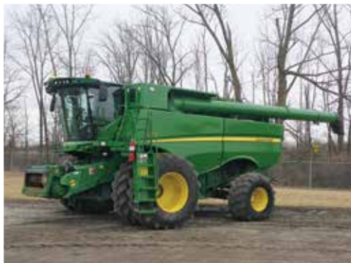
2012 John Deere S670 4x4