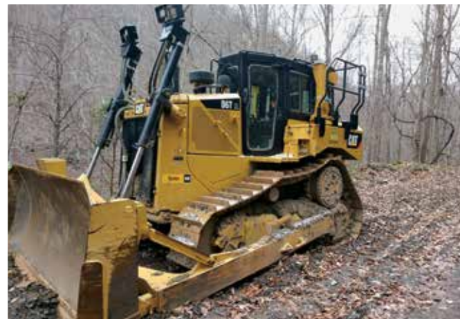
2014 Caterpillar D6T XL