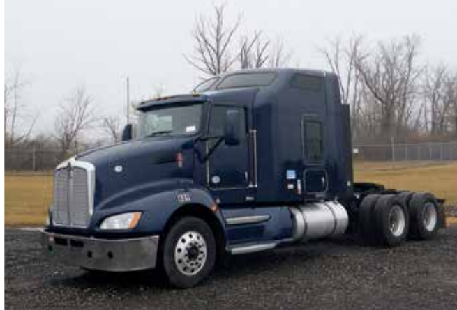
2015 Kenworth T660