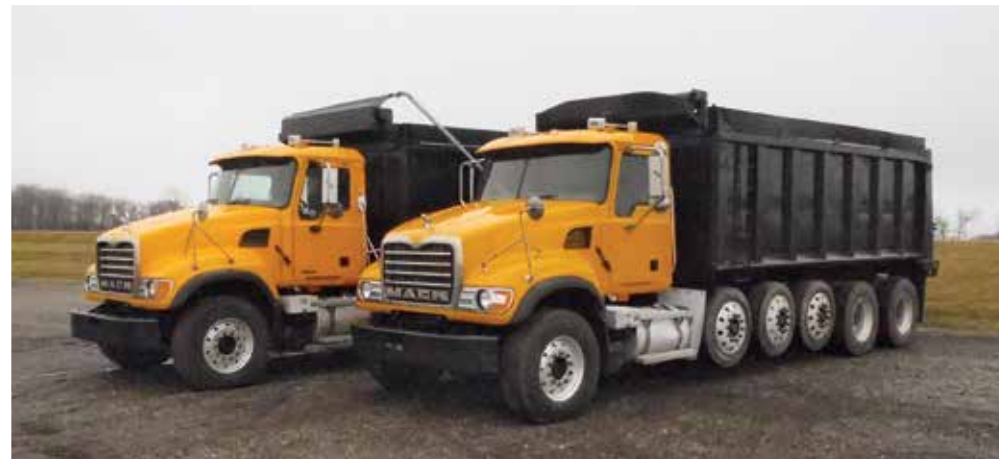
2 – Mack CV713