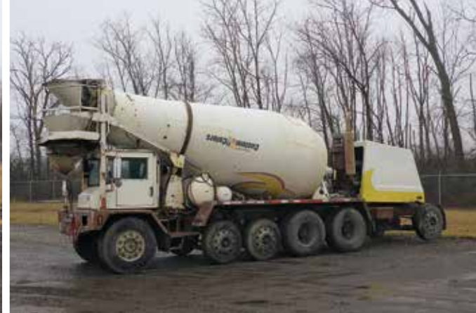
1 of 2 – 2013 Phoenix