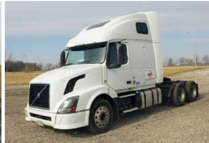
1 of 3 - 2014 Volvo VNL