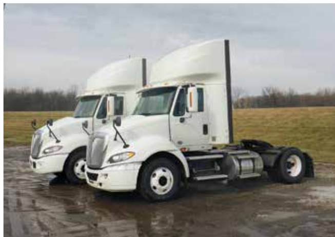
2 - 2012 International ProStar+ 113