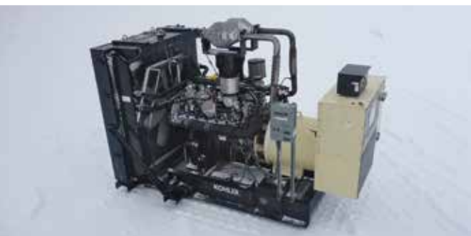
Kohler 400REZX 260 KW