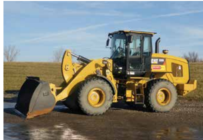
2012 Caterpillar 930K