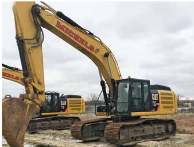
1 of 2 – 2013 Caterpillar 336ELH