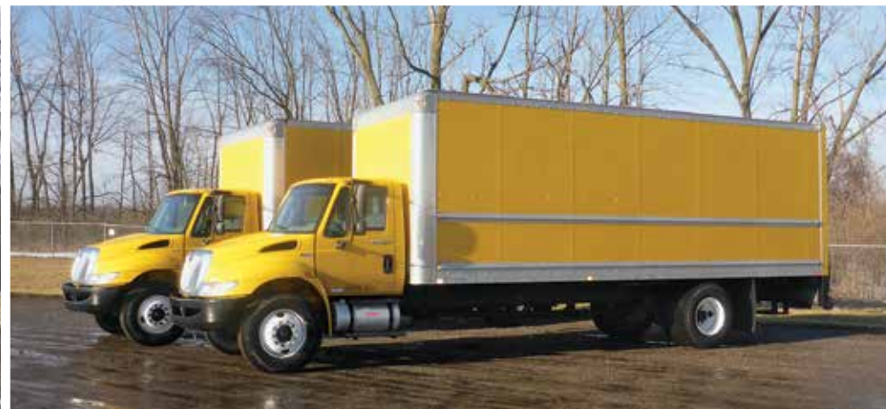
2 of 5 - 2014 International 4300SBA