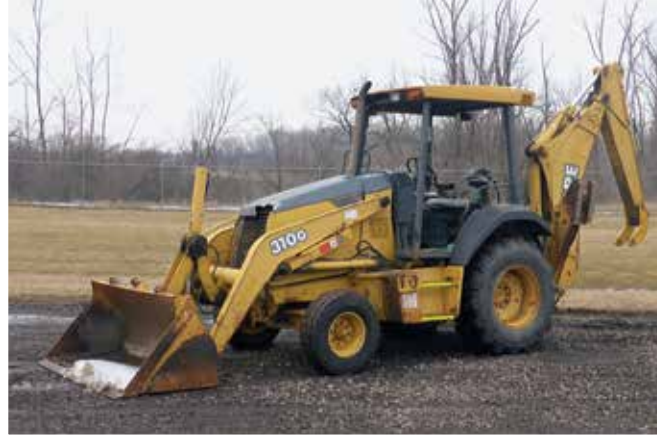
1 of 4 – John Deere 310G