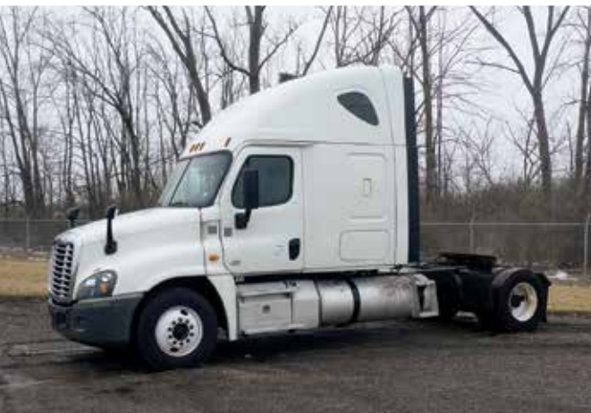
2014 Freightliner PX125042ST