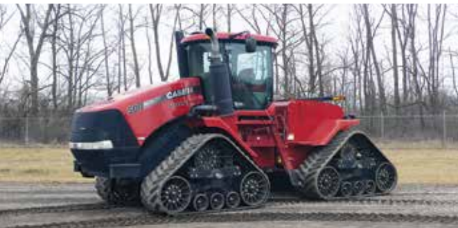
2011 Case IH Steiger 500