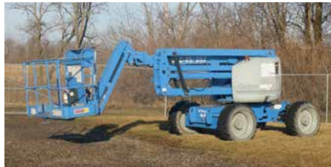
2012 Genie Z45/25J 4x4