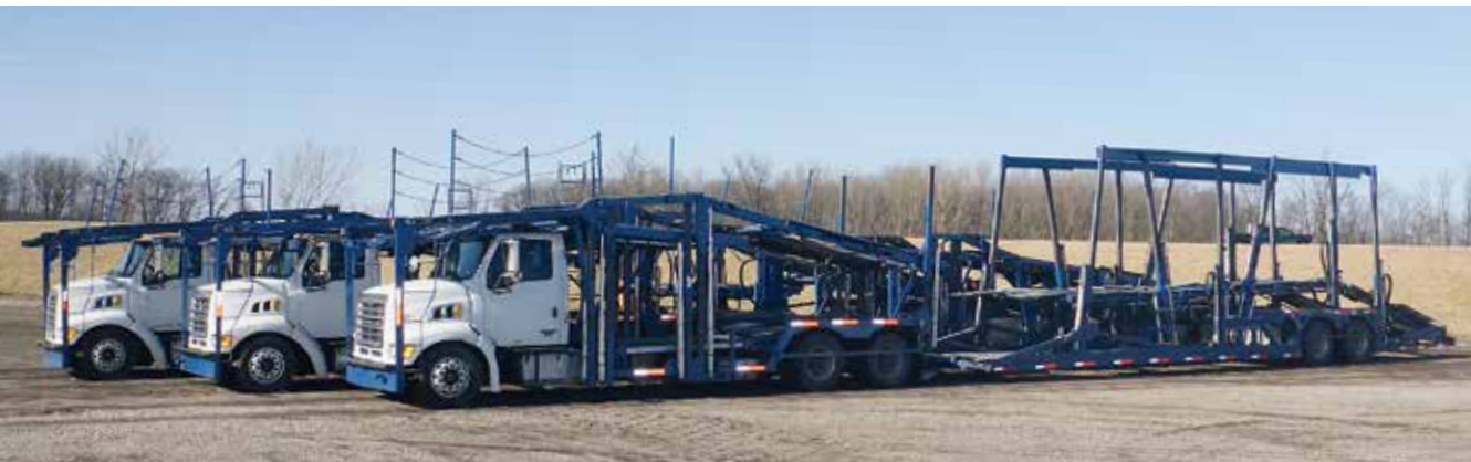
3 of 10 – Sterling LC w/Cottrell

Equipment videos, photos, auction news and more. Like us on facebook.com/RitchieBros