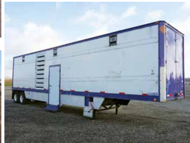
DMT DMT600CA2 545 KW Gen Set w/Great Dane 42 Ft