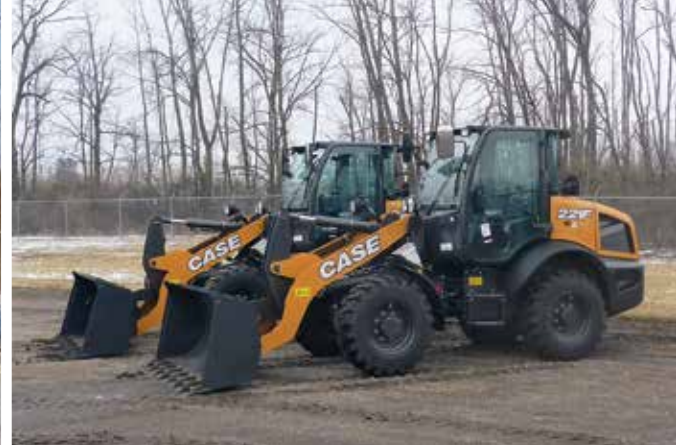
2 - Unused - 2018 Case 221F