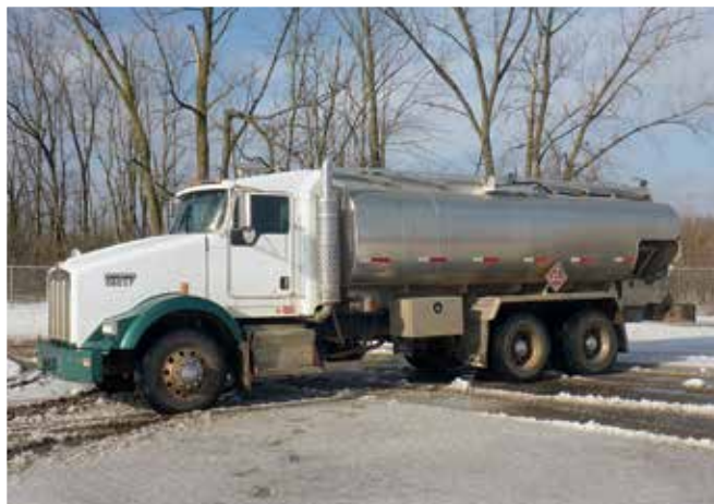
1 of 2 – Kenworth T800 4000 Gallon Fuel