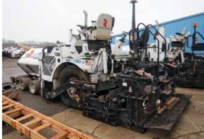
2012 Roadtec RP190