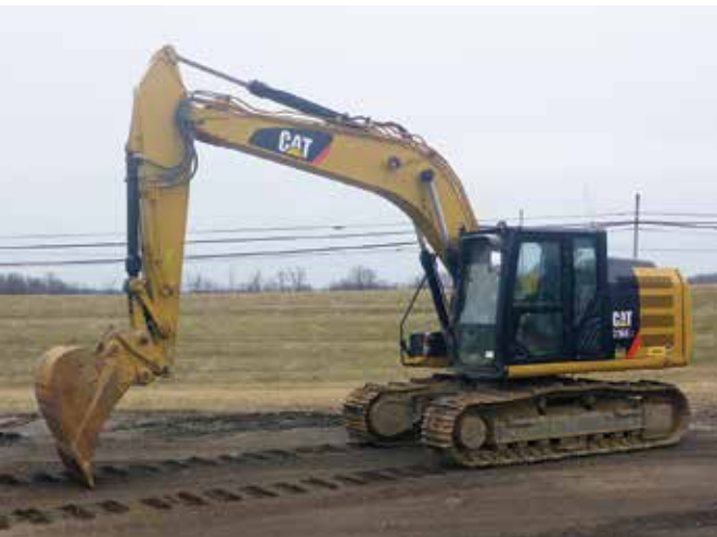
2016 Caterpillar 316EL