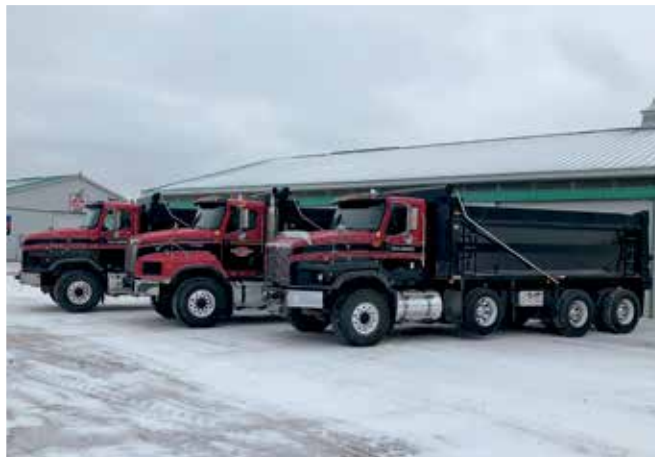
3 – International 5600i PayStar