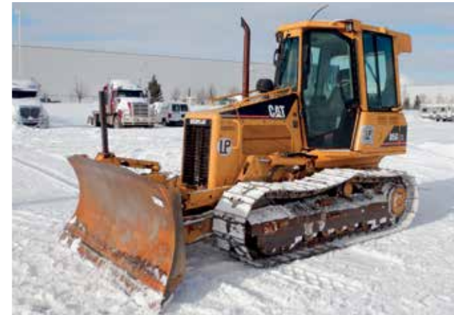
1 of 3 – Caterpillar D5G XL