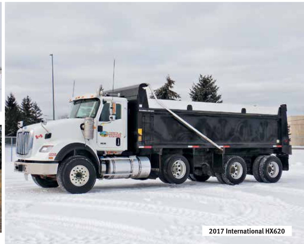
2017 International HX620