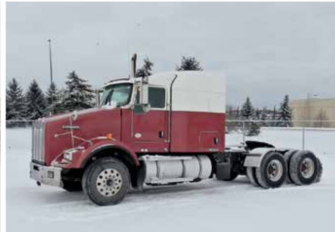
2012 Kenworth T800