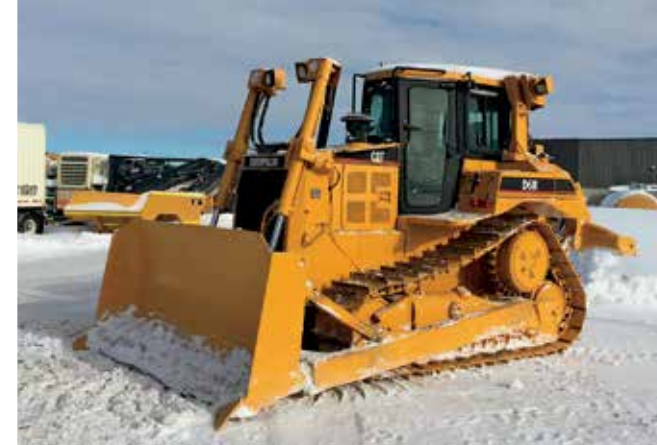
Caterpillar D6R Series II

From Pearson (Toronto) International Airport , follow Hwy 427 North to Hwy 7. Go West 1.4 km (1 mile) to Regional Road 50 North. Proceed North on Regional Road 50 for approx 9.9 km (6 miles) and turn left onto Mayfield Road to Coleraine Dr. 1.3 km. Travel North on Coleraine 4.5 km (3 miles) to auction site (opposite water tower).