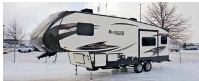
1 of 2 – Unused – 2017 Heartland Elkridge Xtreme Lite 30 Ft

See complete auction and equipment information on our website