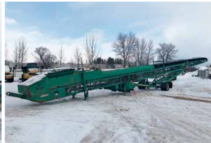
2012 McCloskey 36 In. x 100 Ft