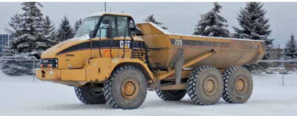
Caterpillar 725 6x6