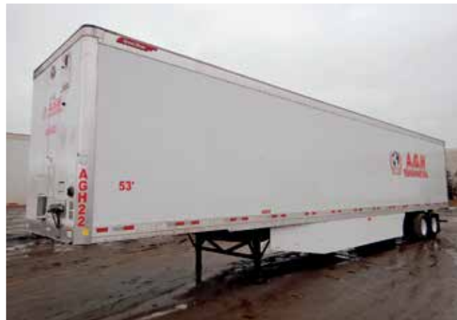
2019 Great Dane 53 Ft