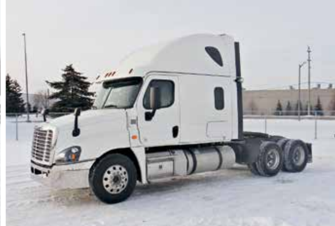
2017 Freightliner CA125SLP Cascadia – Rebuilt