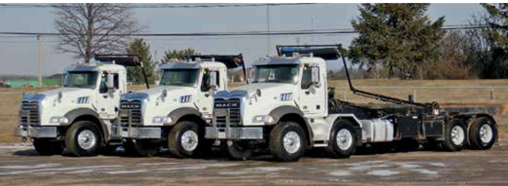
3 of 7 – Late Model Mack GU813 Granite