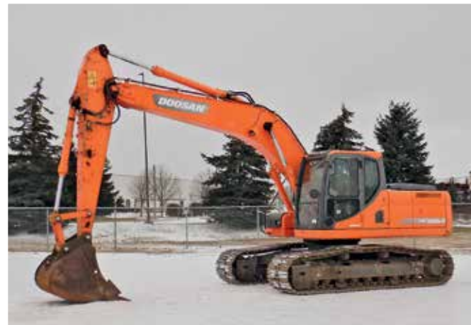
2011 Doosan DX225 LC