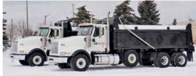
2016 & 2015 International 5900i PayStar