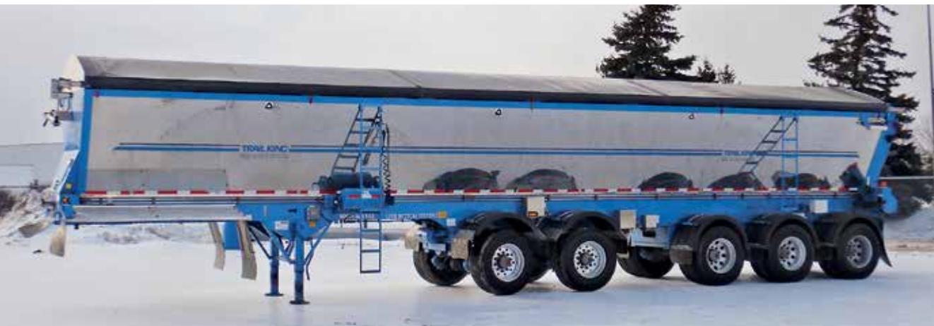
2017 Trail King 48 Ft