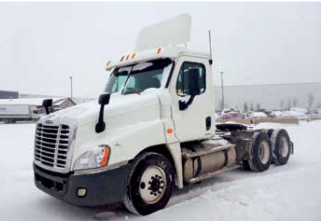
1 of 11 – 2011 Freightliner CA125DC Cascadia