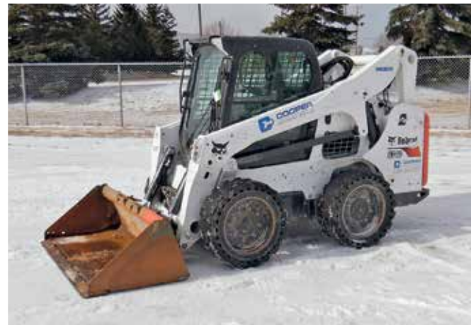
2017 Bobcat S740 2 Spd – Low meter hours