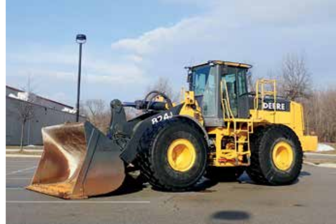
John Deere 824J