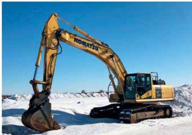
2012 Komatsu PC360LC-3