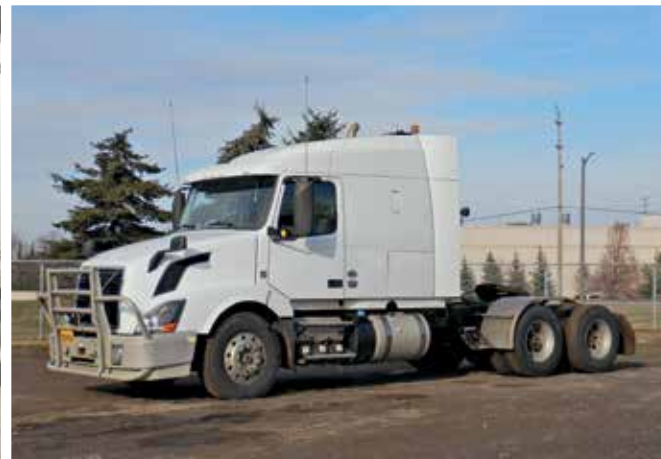
2014 Volvo VNL64T630