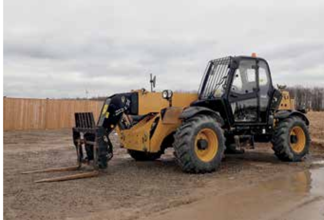
2013 Caterpillar TH414C 8150 Lb 4x4x4