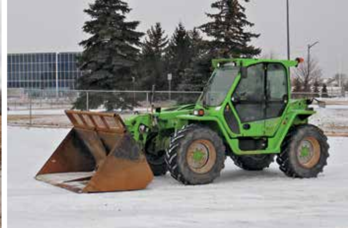
2013 Merlo P40.7CS 8800 Lb 4x4x4