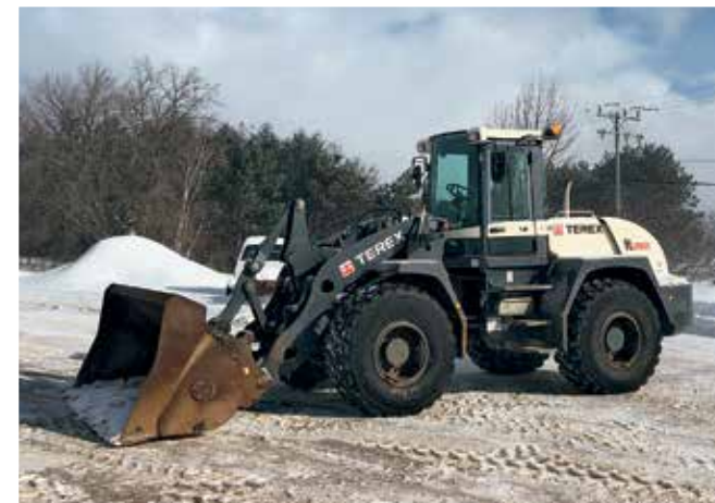
2013 Terex TL260