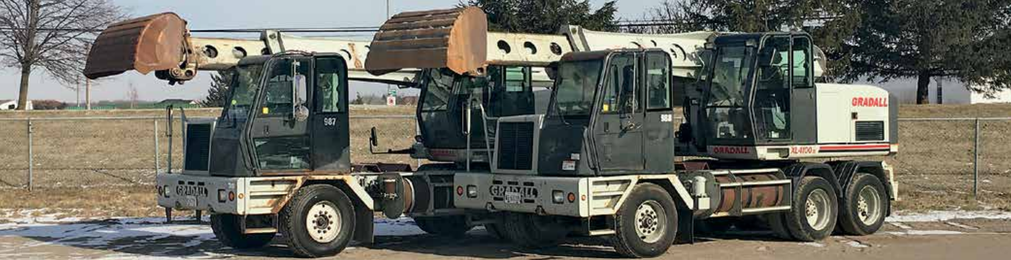
Gradall XL4100 II & Gradall XL4100 III