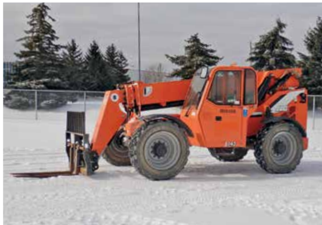
2012 Skytrak 8042 8000 Lb 4x4x4