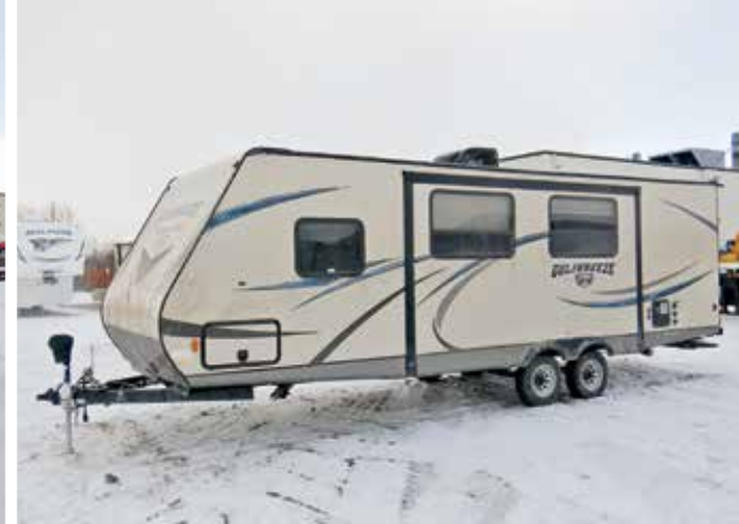
2018 Gulf Stream Ultra Lite Gulf Breeze 26 Ft