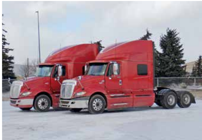
2 of 5 – 2014 International ProStar+ Eagle