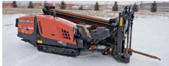
2017 Ditch Witch JT20 – Low meter hours