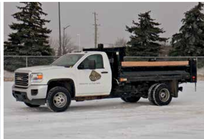
2015 GMC Sierra 3500HD 4x4