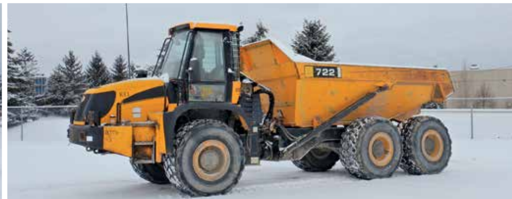
1 of 5 - JCB 722 6x6