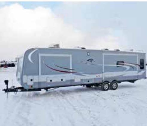
2016 Jayco Open Range Roam 323RLS 32 Ft