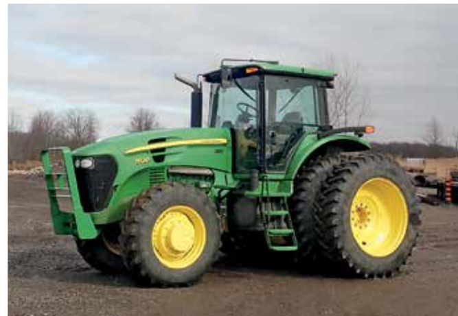
John Deere 7630