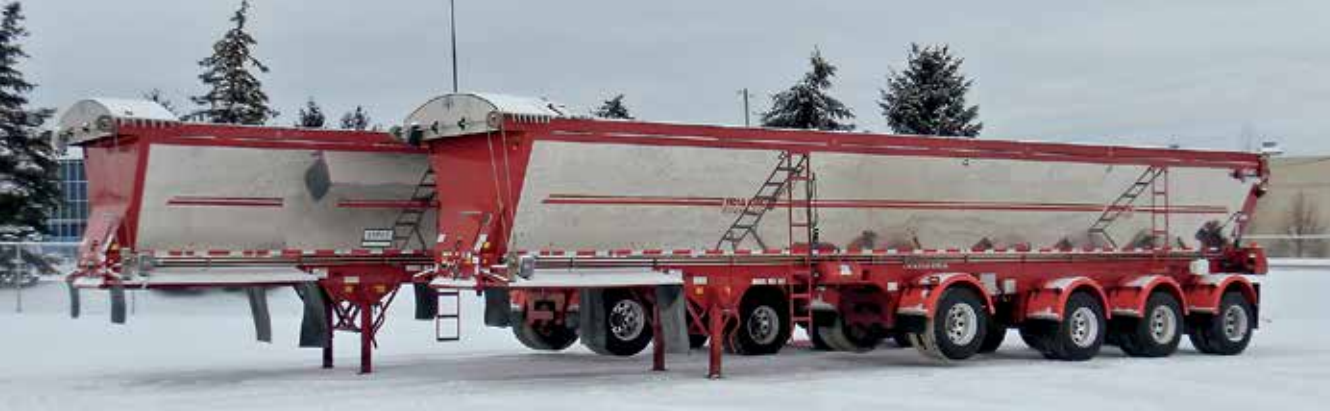
2 – 2017 Trail King 48 Ft