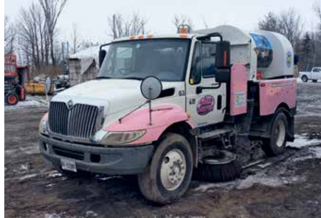
International 4200 w/Tymco 500DX