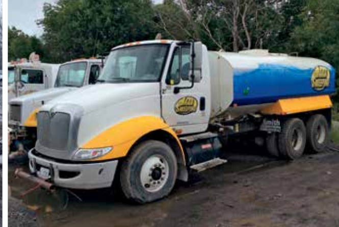
International 8600 3200 Gallon