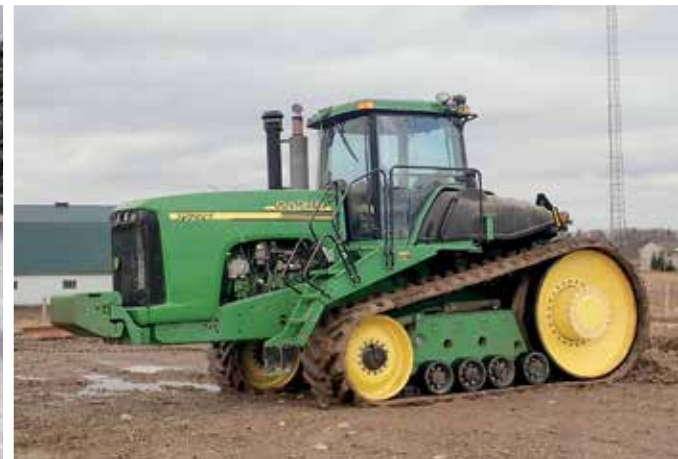
John Deere 9520T