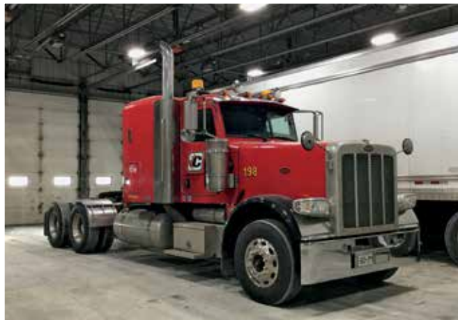
1 of 3 – 2010 Peterbilt 388