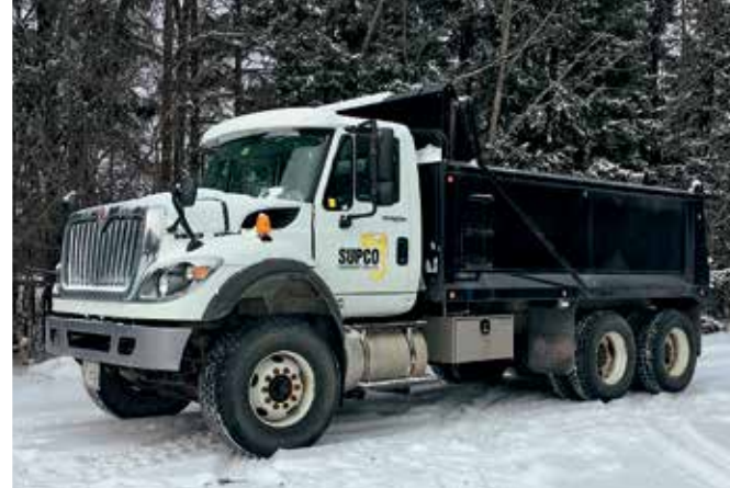
2013 International 7400 SBA WorkStar