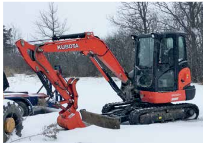
2018 Kubota KX040-4