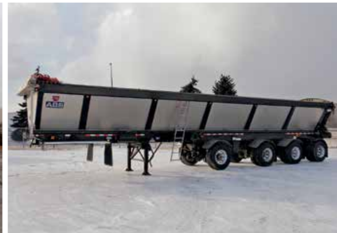
2016 ABS 48 Ft