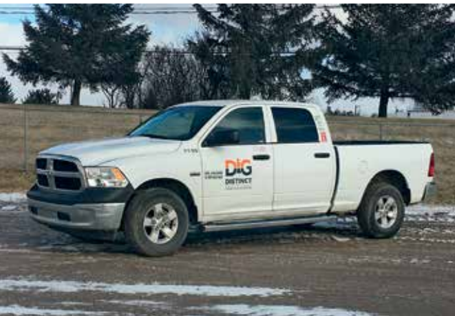
2017 Ram 1500 4x4