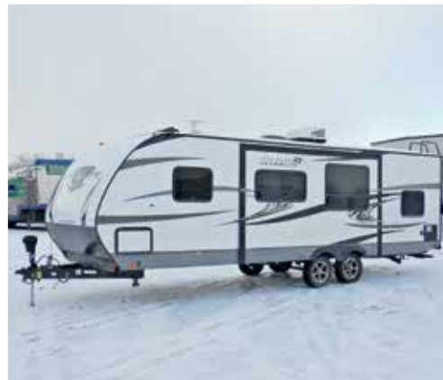
2017 Jayco Open Range Ultra 2704BH 27 Ft