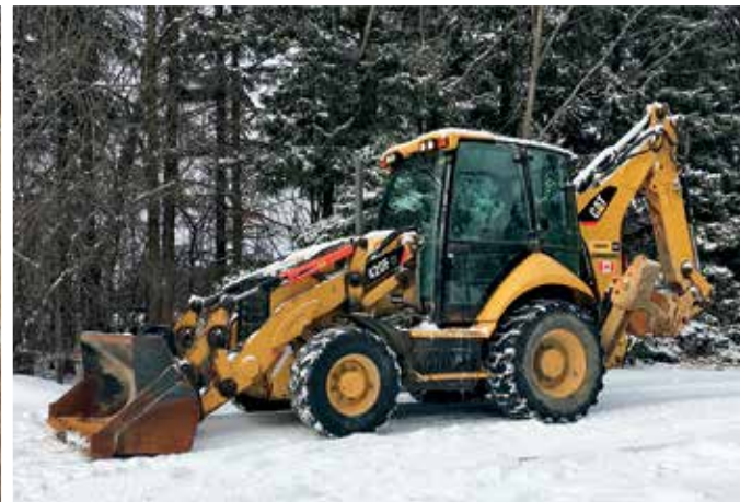
2014 Caterpillar 420FIT 4x4