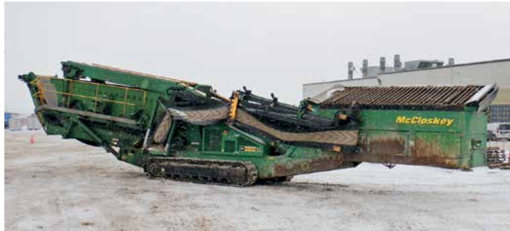
2013 McCloskey S190