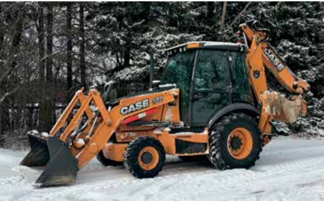
2016 Case 580SN 4x4