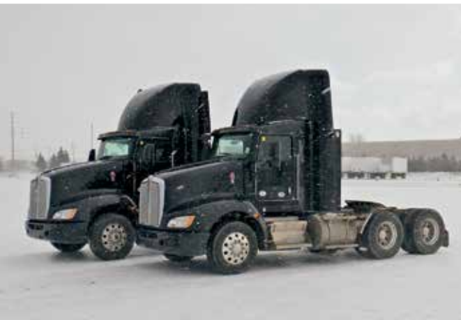
2013 & 1 of 2 – 2012 Kenworth T660