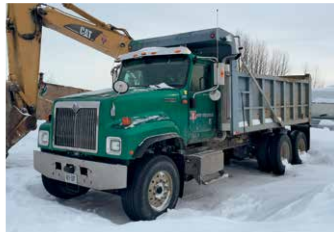
International 5500i PayStar