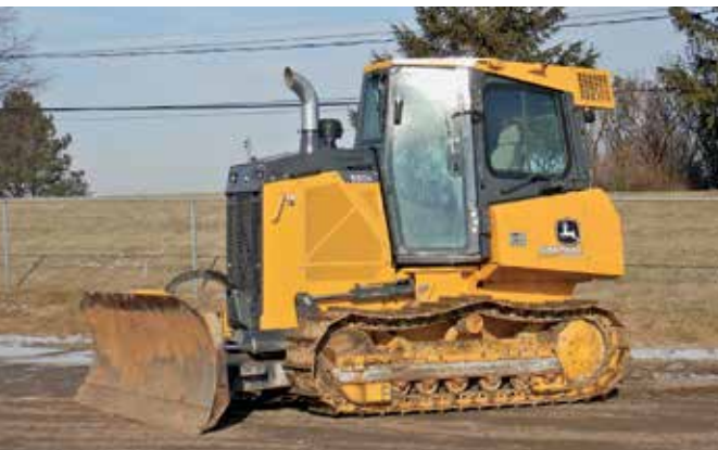
2017 John Deere 550K