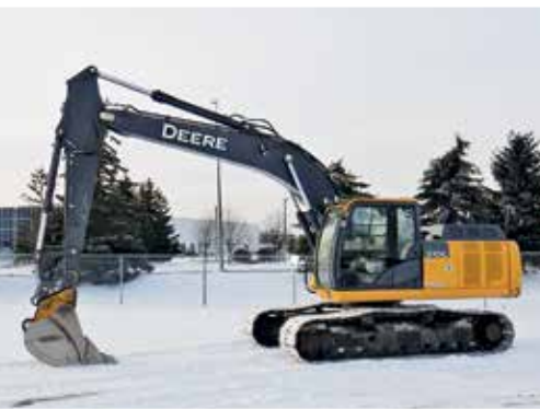
2017 John Deere 210G LC