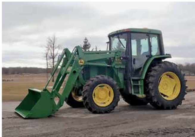
John Deere 6200