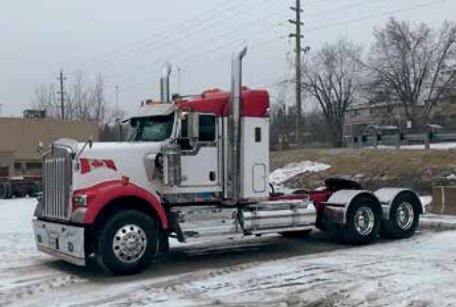
2014 Kenworth W900 Heavy Haul