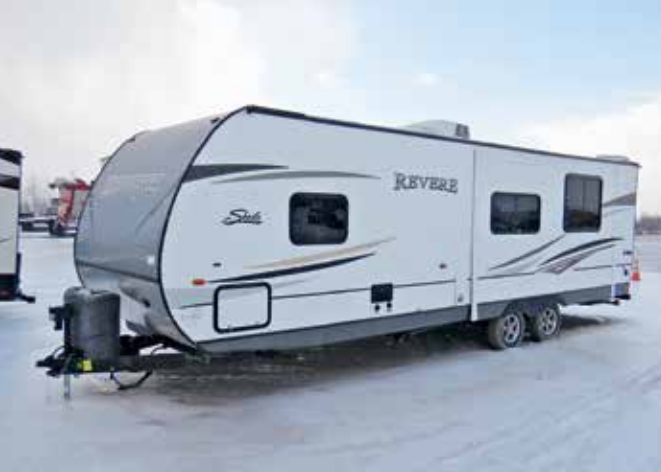
2014 Forrest River Shasta Revere 29RK 29 Ft