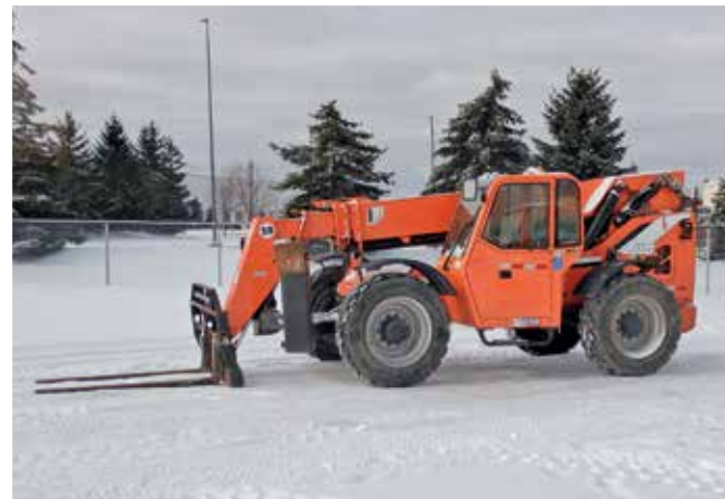
2011 Skytrak 10054 10000 Lb 4x4x4