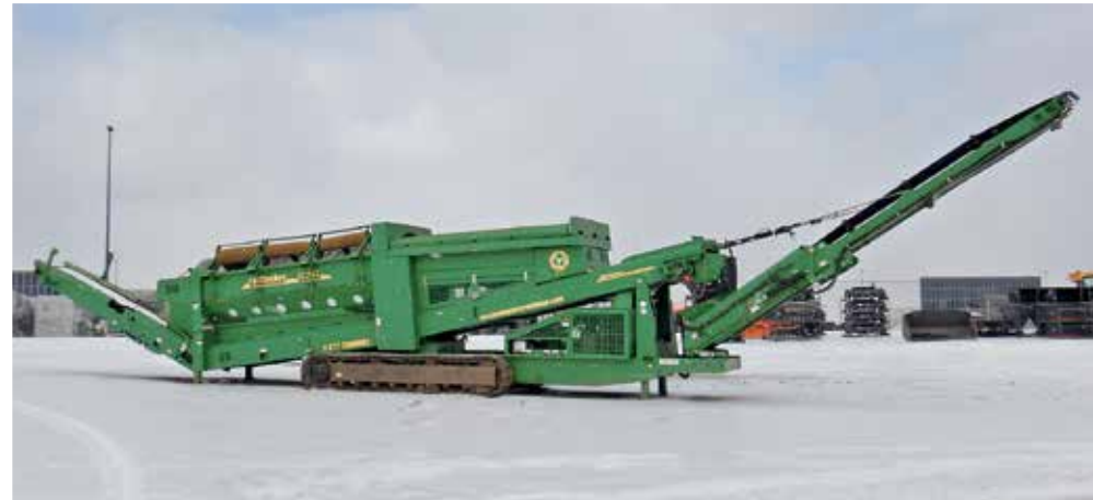
2014 McCloskey 516RT