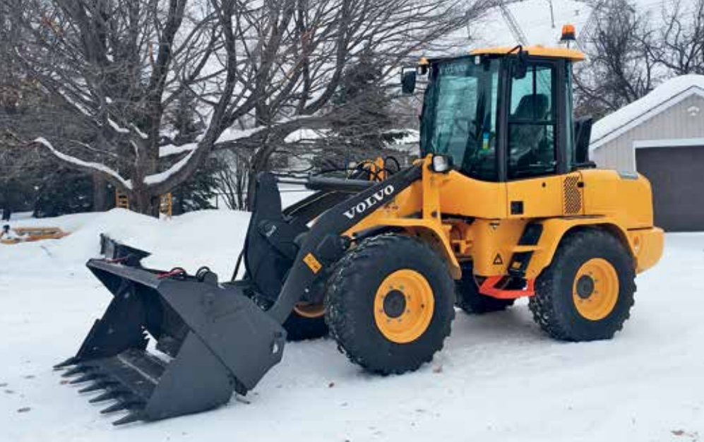
Unused – 2017 Volvo L30G