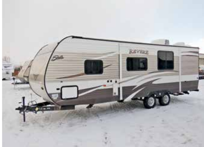
2016 Forest River Shasta Revere 27BH 27 Ft