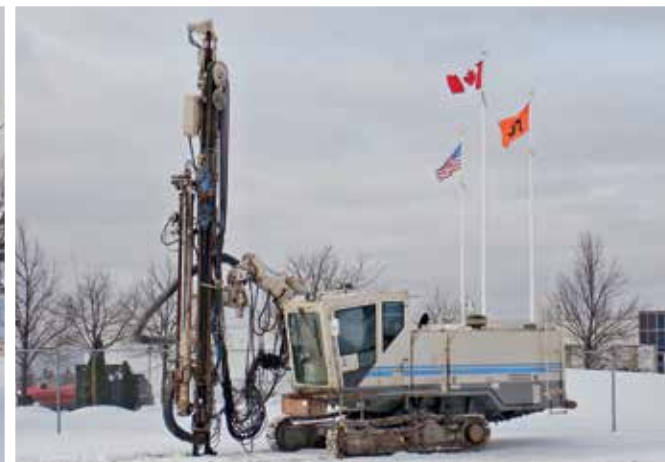
1 of 2 - Furukawa HCR1500ED