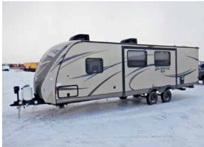
1 of 2 - 2016 Gulf Stream Gulf Breeze CG30RBI 30 Ft