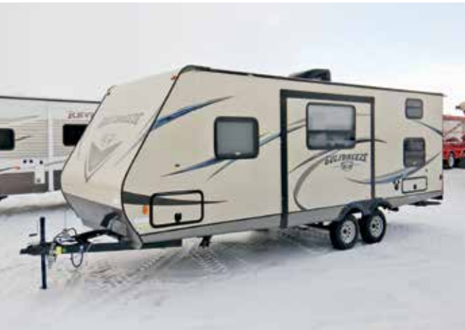
2017 Gulf Stream Gulf Breeze 25BHS 25 Ft