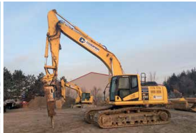
2014 Komatsu PC290LC-10 & BTI V250