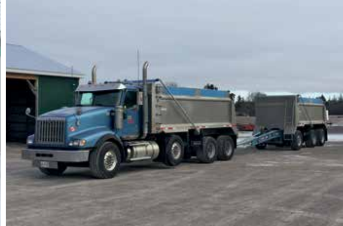
2014 International 5900i Paystar & 2014 Raglan 17 Ft