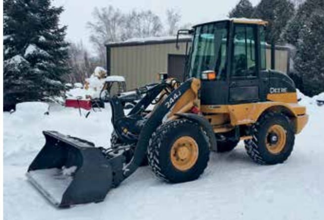
John Deere 244J