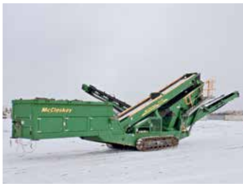
2015 McCloskey S1302DT