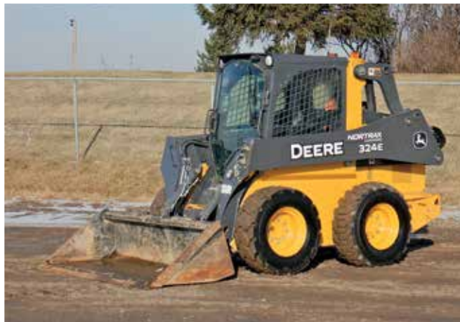
2017 John Deere 324E 2 Spd