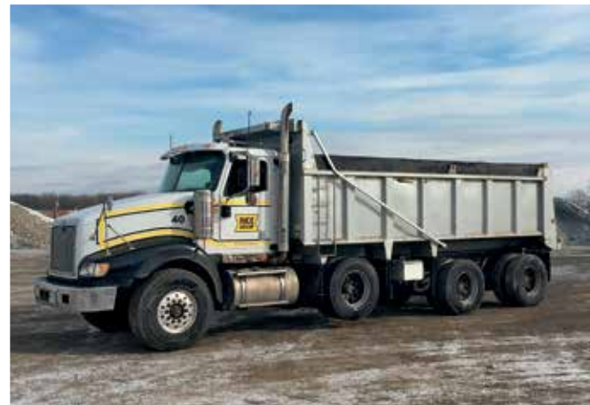
International 5900i SBA Paystar