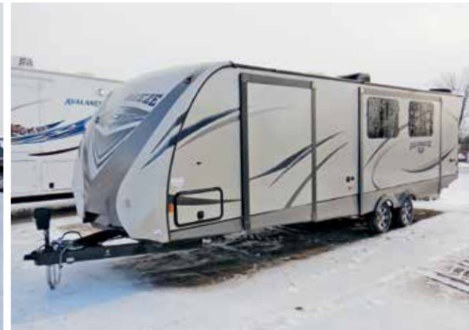
2015 Gulf Stream Gulf Breeze 30R Champagne Edition 30 Ft