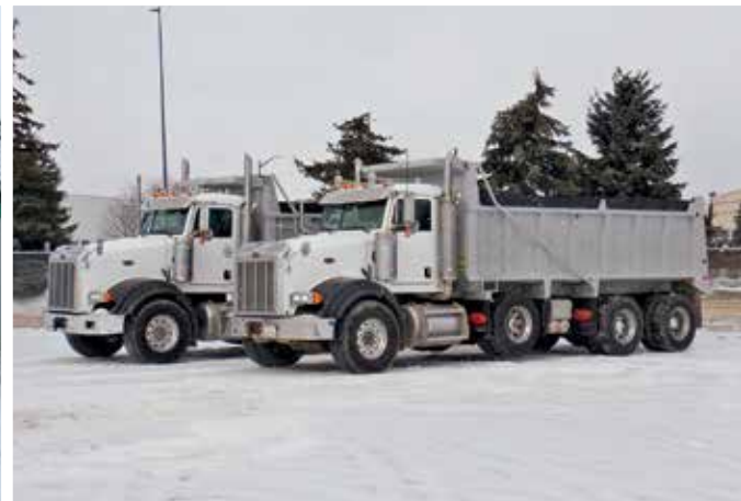
2 – Peterbilt 378