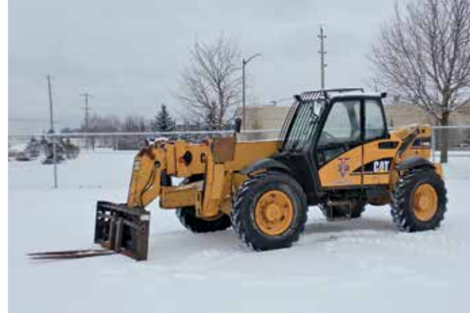
Caterpillar TH460B 9000 Lb 4x4x4