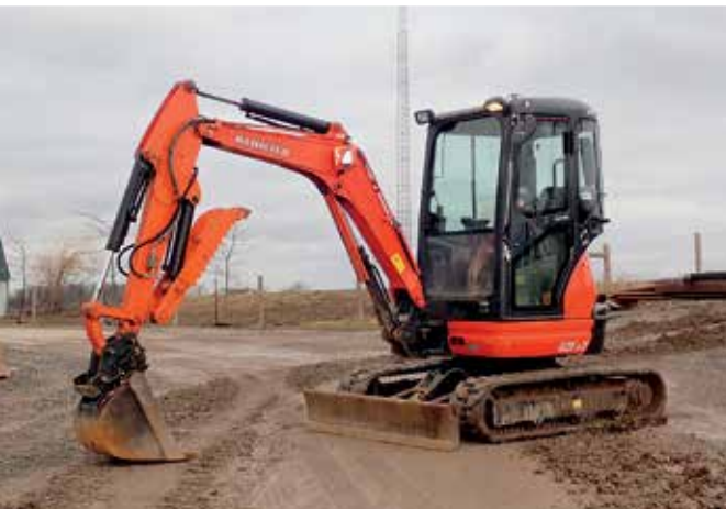
2013 Kubota U25-3