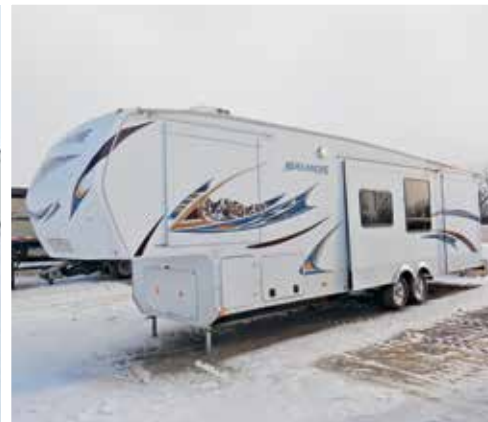
2013 Keystone Avalanche 341TG 38 Ft