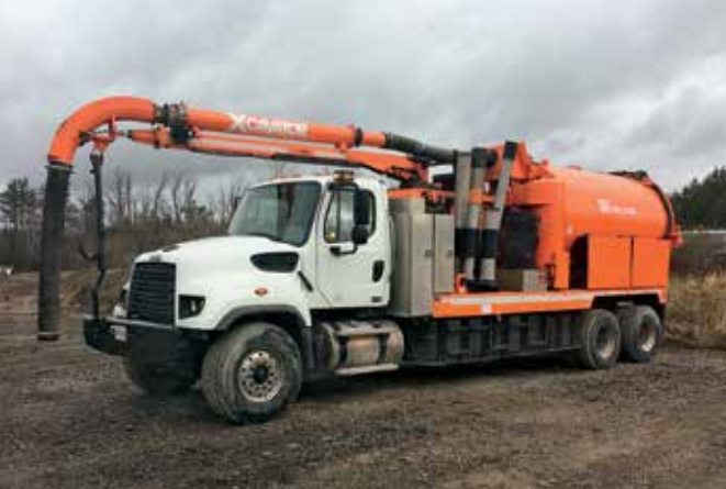
2015 Freightliner 114SD w/Vacon VX316LHE