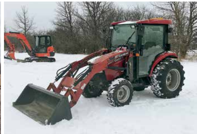
2010 Case IH Farmall 50DX