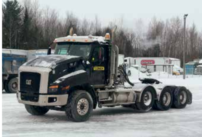
2013 Caterpillar CT660L