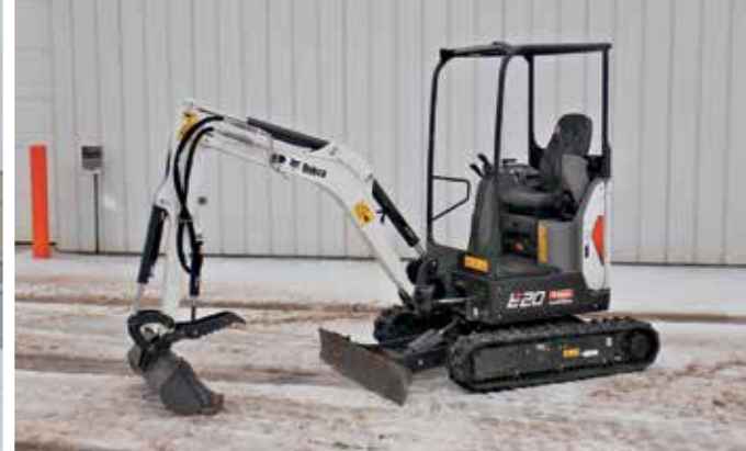
2017 Bobcat E20 – Low meter hours