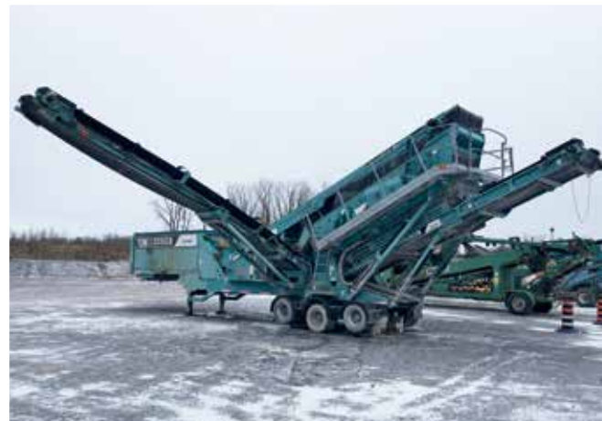
Powerscreen Chieftain 1700