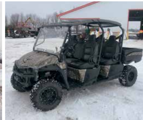
2016 Mahindra XTV 1000