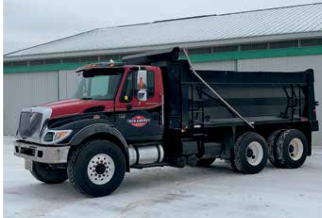
International 7400 WorkStar