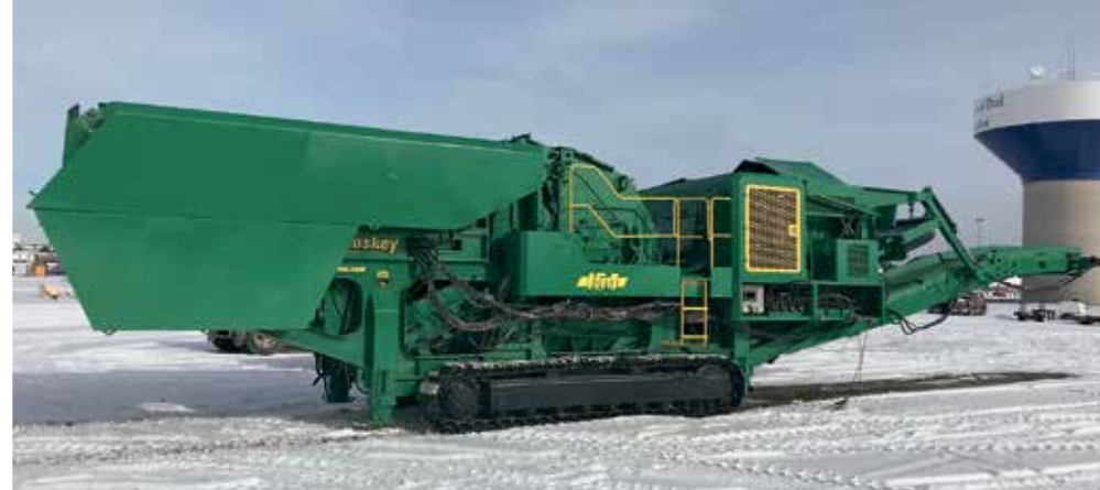
2014 McCloskey 154 Impact