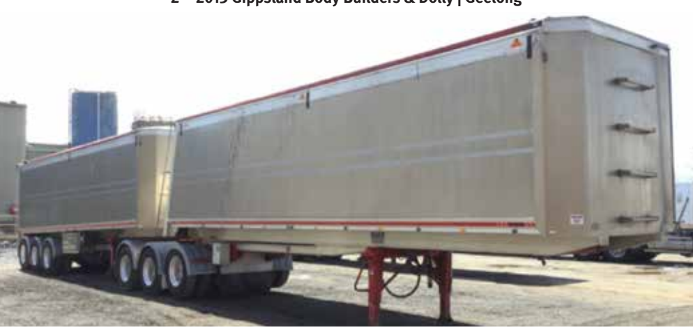
2 - 2013 Gippsland Body Builders | Geelong