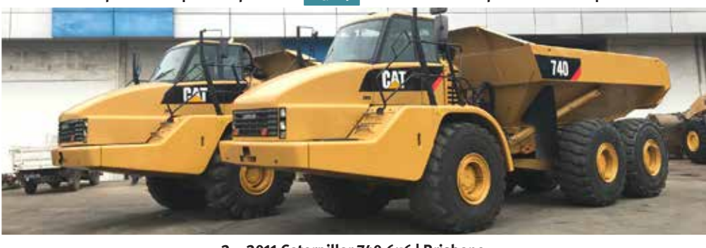
2 - 2011 Caterpillar 740 6x6 | Brisbane