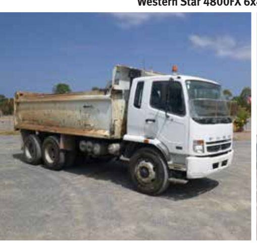
2010 Mitsubishi Fuso FN600 6x4 | Brisbane