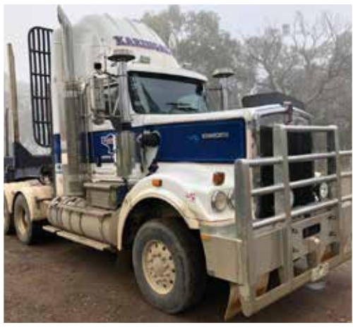
1 of 2 – 2015 Kenworth C509 6x4 | Geelong