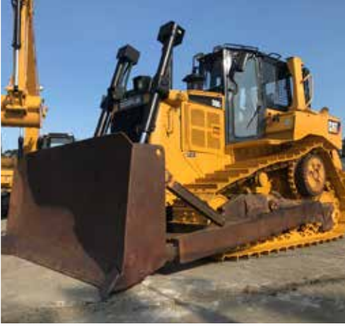
2010 Caterpillar D6R Series III | Brisbane