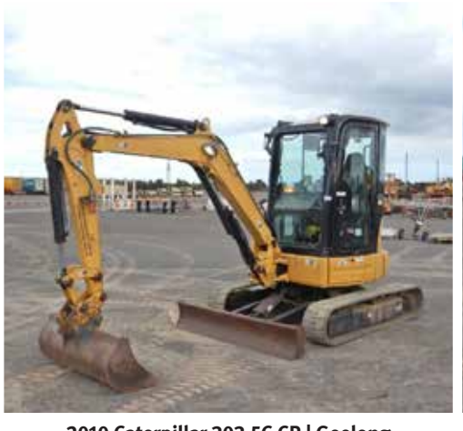
2010 Caterpillar 303.5C CR | Geelong