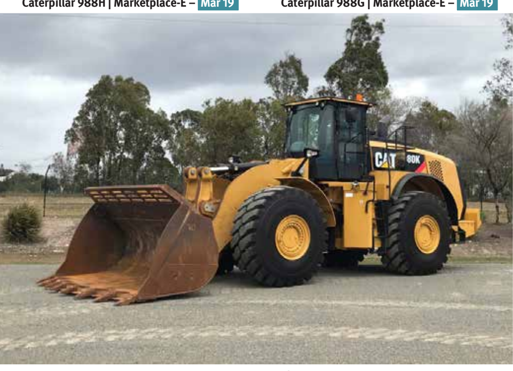
2012 Cateprillar 980K | Brisbane