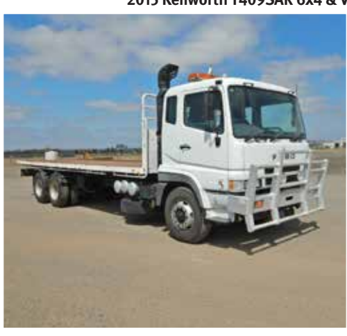
Mitsubishi Fuso FV500 6x4 | Geelong