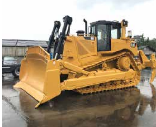
Caterpillar D8T | Brisbane