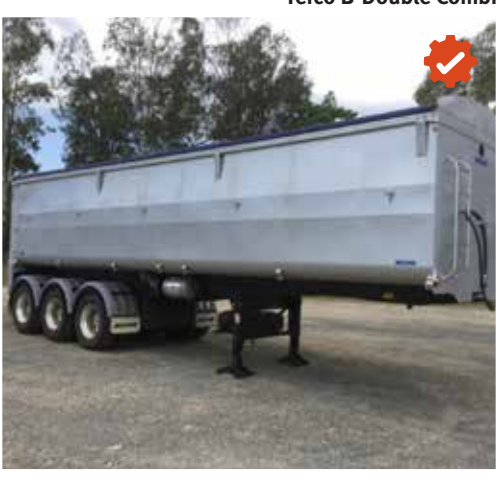
2017 Moore | Marketplace-E