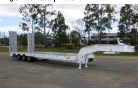
Unused - 2019 RES 3 Row of 4 Hyd Deck Widening | Brisbane