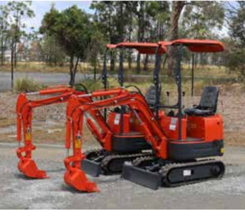
2 of 3 – Unused – 2018 Everun ERE08 Brisbane & Geelong