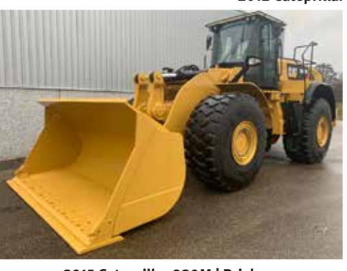
2015 Caterpillar 980M | Brisbane