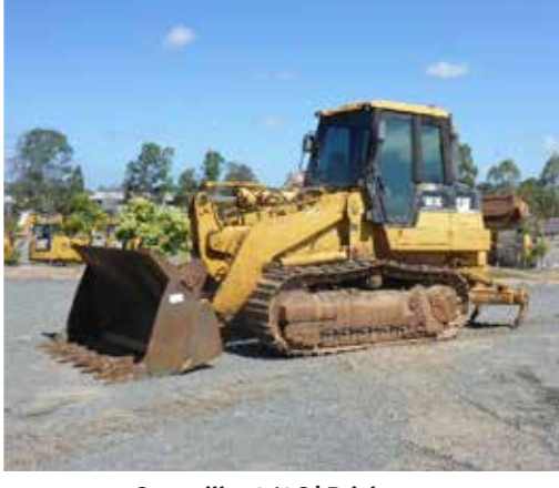
Caterpillar 963C | Brisbane