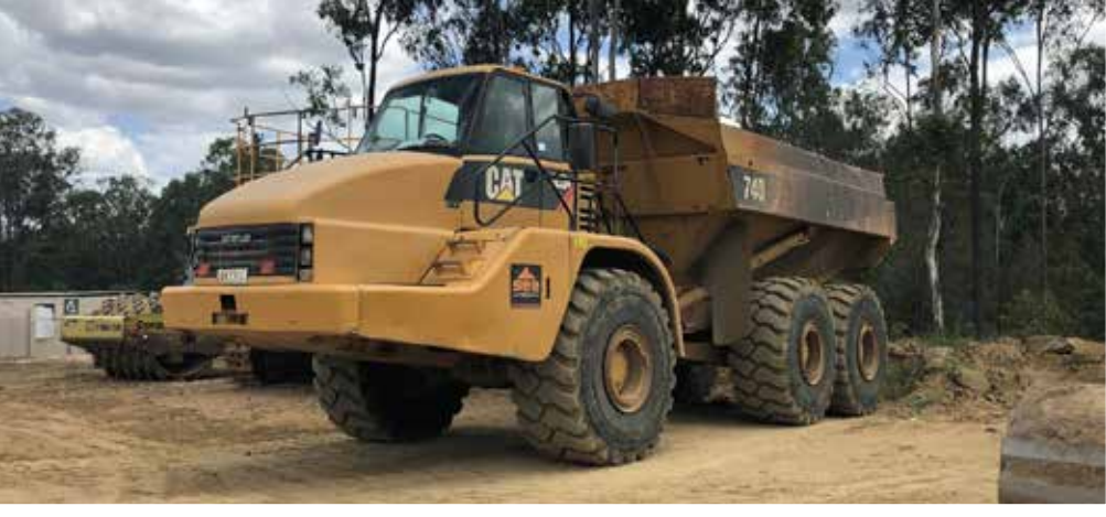
1 of 3 - Caterpillar 740 6x6 | Brisbane