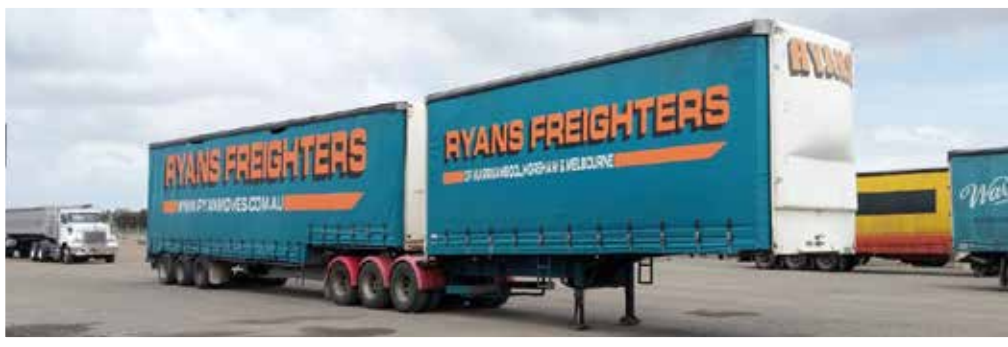
Vawdrey & Topstart | Geelong