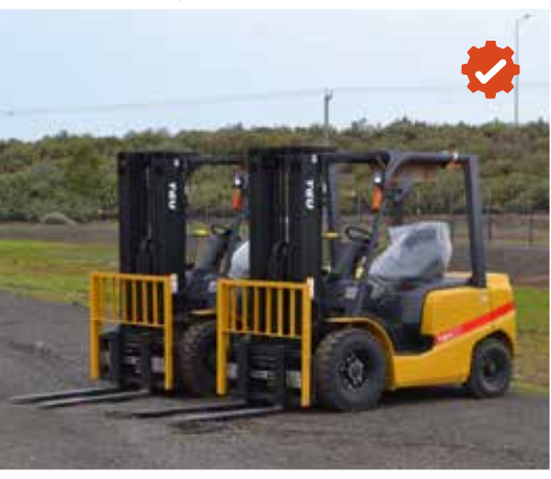
2 - Unused - 2018 TEU FD25T Marketplace-E - Mar 19