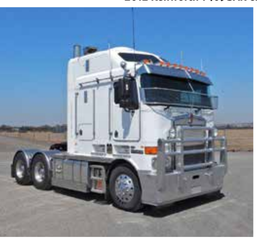
Kenworth K108 Big Cab Aerodyne 6x4 | Geelong