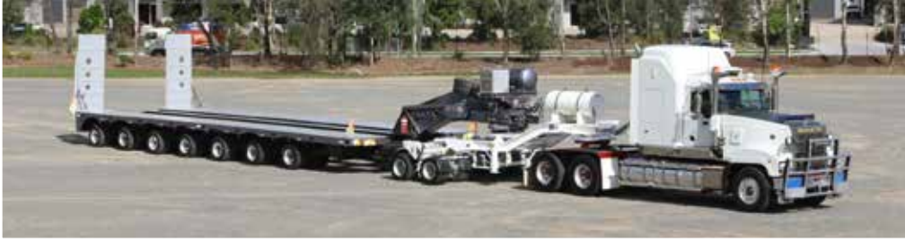
Mack CLR866RSX Titan 6x4 & Drake 7 Row of 8 Hyd Widening Platform & 2015 RES 2 Row of 8 Hyd Widening | Brisbane