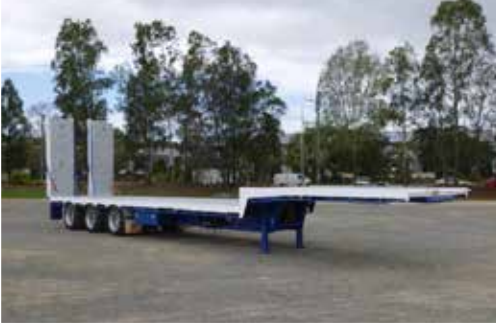
1 of 2 - 2010 Howard Porter | Brisbane