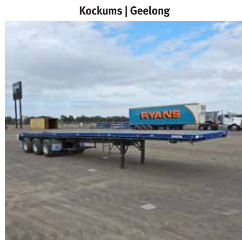
Krueger | Geelong