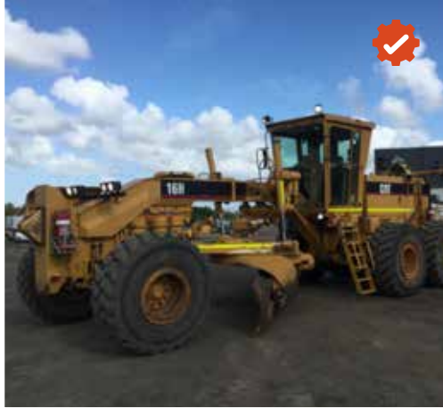
Caterpillar 16H | Marketplace-E - Mar 19