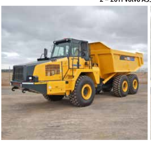
1 of 2 - Komatsu HM300-2 6x6 | Geelong