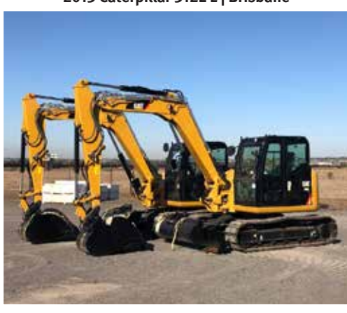
2 - Unused - 2017 Caterpillar 308E2 CR Geelong