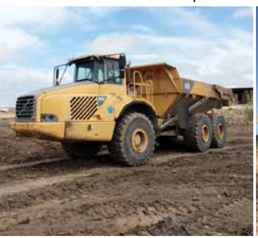
Volvo A35D 6x6 | Geelong