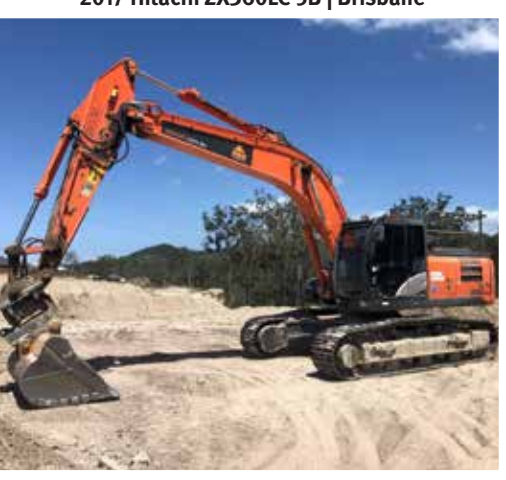
2017 Hitachi ZX290LC-5B | Brisbane