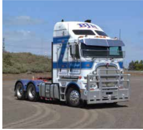
1 of 5 - Kenworth K200 Aerodyne 6x4 | Geelong