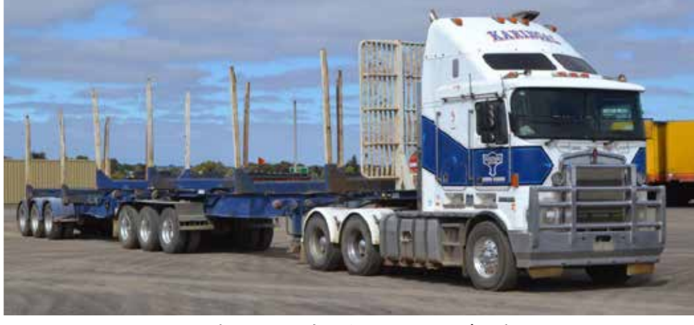
Kenworth K104B Aerodyne 6x4 & 2 - Krueger | Geelong