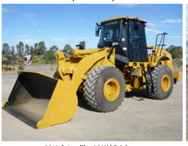
2010 Caterpillar 950H | Brisbane