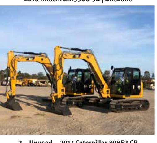
2 – Unused – 2017 Caterpillar 308E2 CR Brisbane