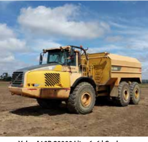
Volvo A40D 30000 Litre 6x6 | Geelong