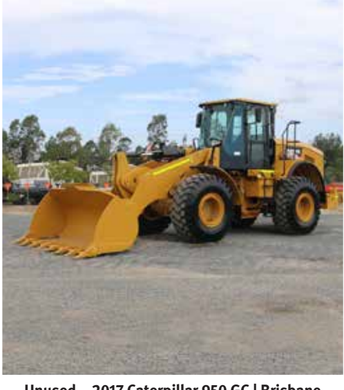
Unused – 2017 Caterpillar 950 GC | Brisbane