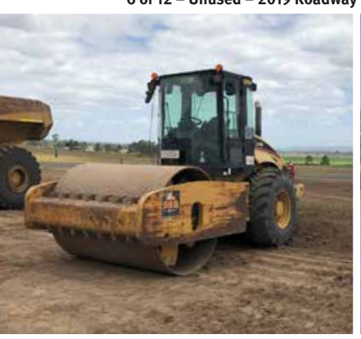
Caterpillar CS573E | Brisbane