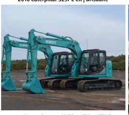
2 - Unused - 2017 Kobleco SK140SRLC Geelong