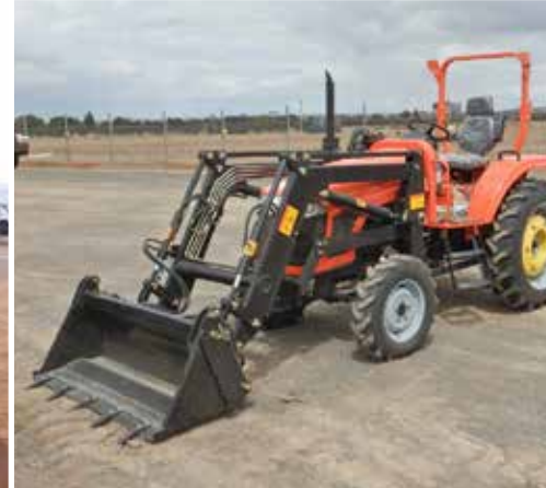
Unused - 2018 Everun ER404T | Geelong