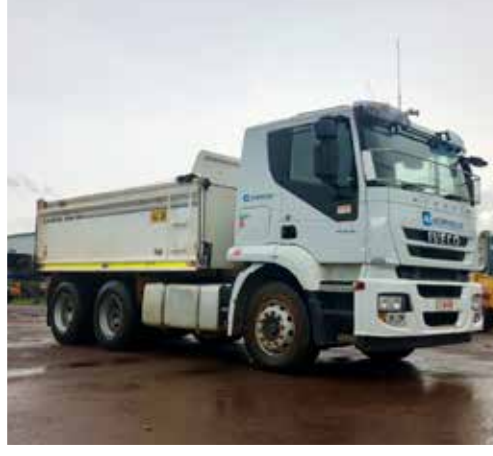
2010 Iveco Stralis ATi 6x4 | Brisbane