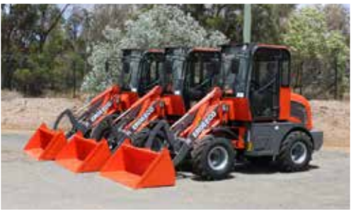
3 - Unused - 2019 Everun ER08 | Brisbane