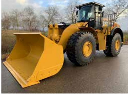
2013 Cateprillar 980K | Brisbane