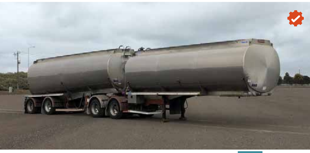
Tieman 57600 Litre B-Double Combination | Marketplace-E - Mar 19