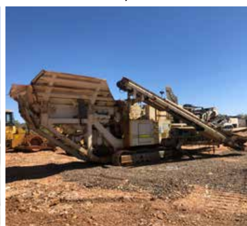
Metso Lokotrack 12135 | Brisbane