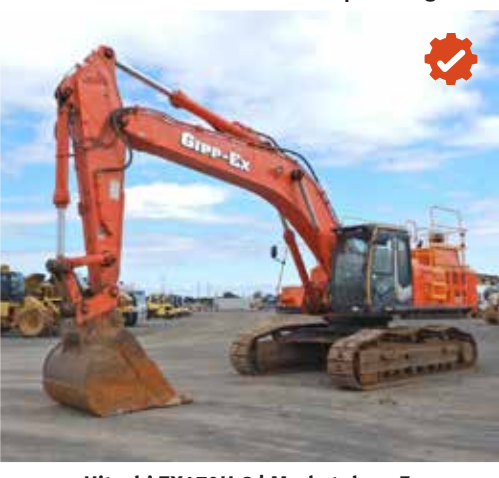
Hitachi ZX470H-3 | Marketplace-E