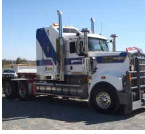
2011 Kenworth T909 6x4 | Brisbane