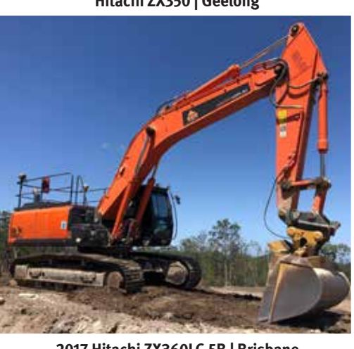
2017 Hitachi ZX360LC-5B | Brisbane