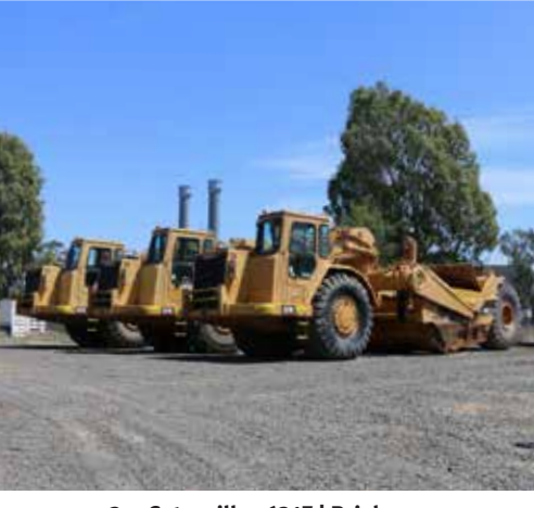
3 - Caterpillar 631E | Brisbane