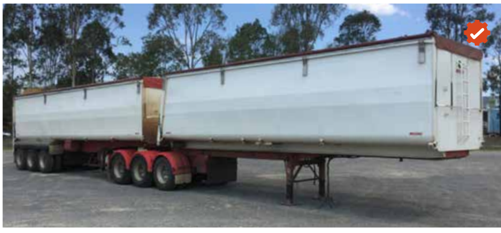
2014 Moore B-Double Combination | Marketplace-E