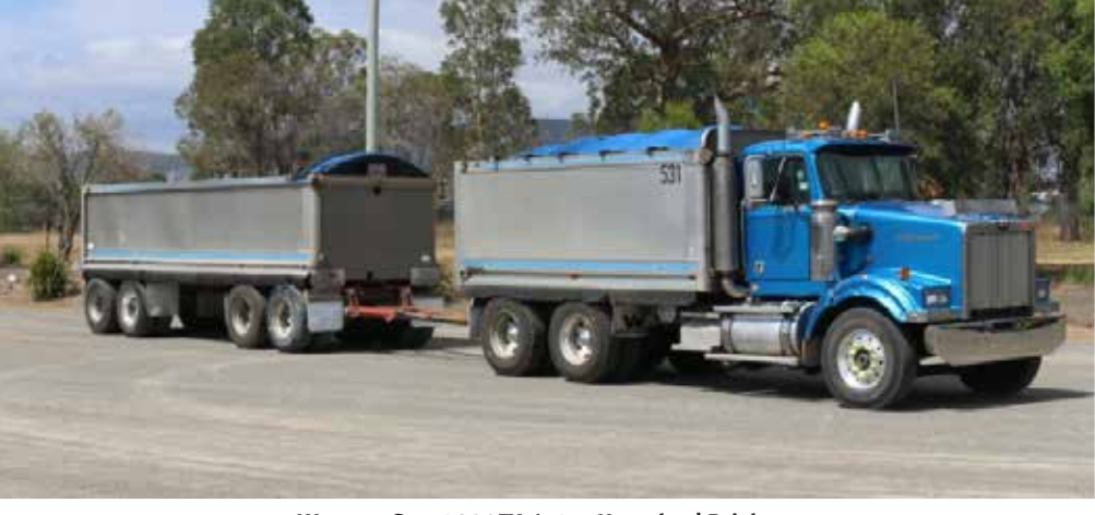
Western Star 4800FX 6x4 & Hercules | Brisbane