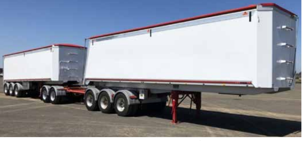
2 – 2013 Gippsland Body Builders & Dolly | Geelong