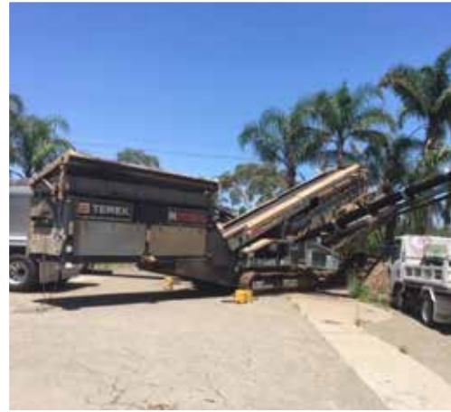
2013 Terex M1700-3 | Brisbane