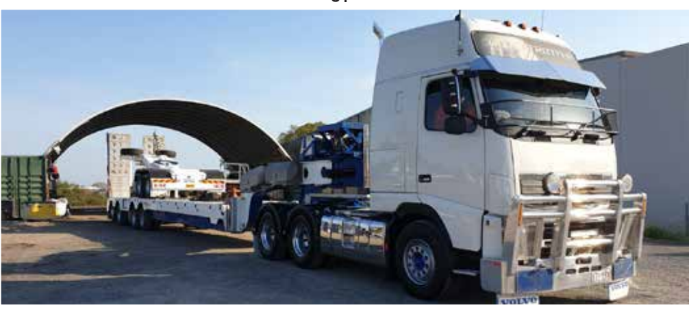
2012 Volvo FH16 6x4 & 2016 RES 4 Row of 4 Extendable Hyd Widening & 2014 RES 2 Row of 4 Brisbane