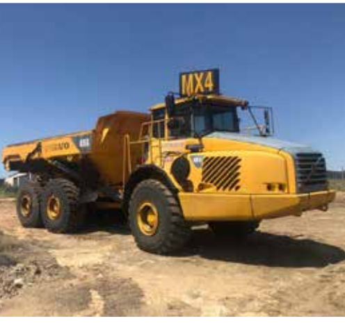
Volvo A35D 6x6 | Brisbane