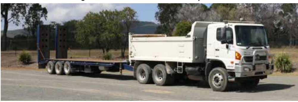
Hino FM1J 6x4 & 2014 Taipan | Brisbane