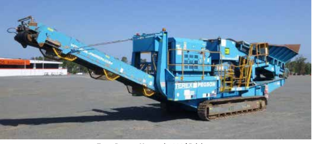
Terex Pegson Maxtrack 1000 | Brisbane