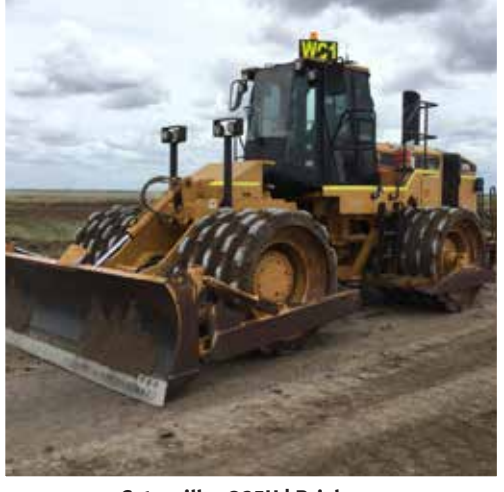
Caterpillar 825H | Brisbane