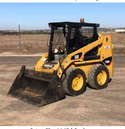
Caterpillar 226B | Geelong