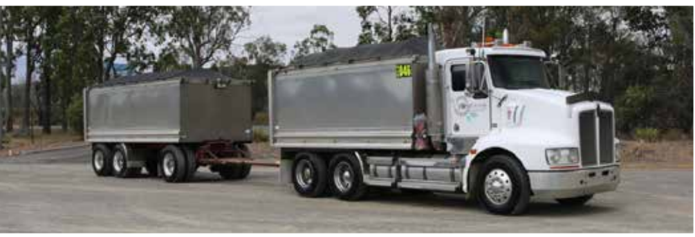
Kenworth T408 6x4 & BPT | Brisbane