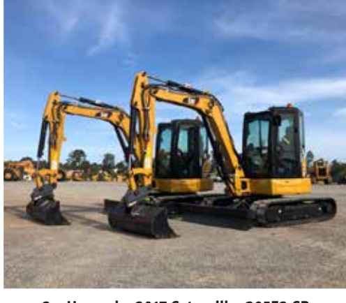
2 – Unused – 2017 Caterpillar 305E2 CR Brisbane