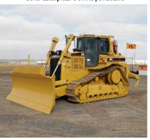
Caterpillar D6R XL Series III | Geelong