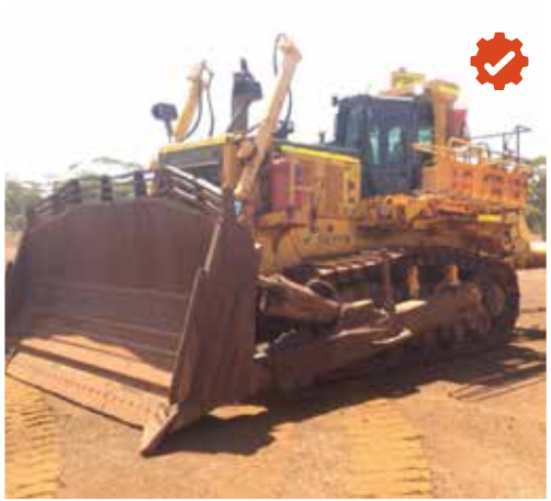
2011 Komatsu D375A-6 | Marketplace-E – Mar 19