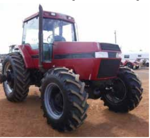
Case IH 7140 | Geelong