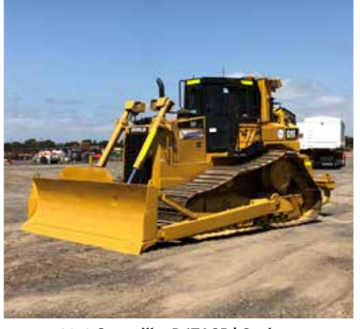
2010 Caterpillar D6T LGP | Geelong