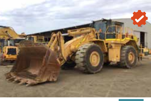
Caterpillar 988G | Marketplace-E - Mar 19