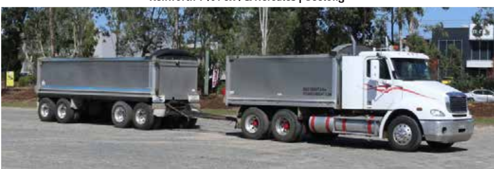
Freightliner CL112 Columbia 6x4 & Hercules | Brisbane