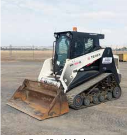
Terex PT100G | Geelong