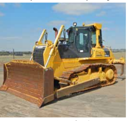
Komatsu D65EX-15 | Geelong