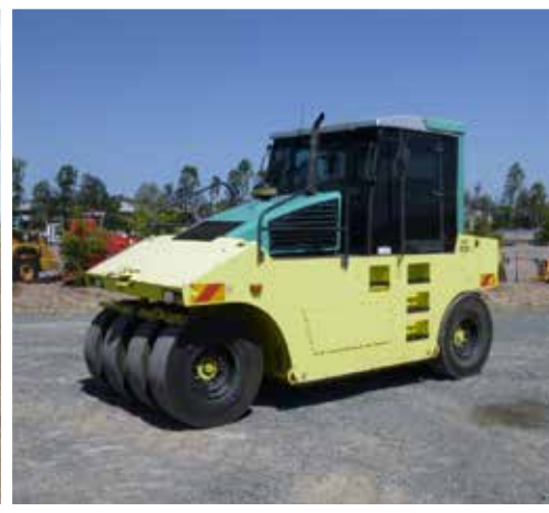
2011 Ammann AP240 | Brisbane