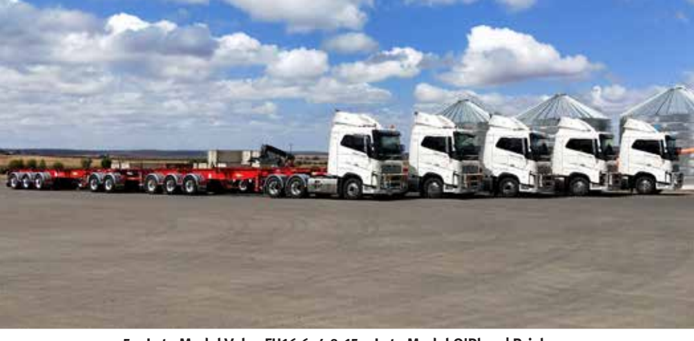
5 - Late Model Volvo FH16 6x4 & 15 - Late Model O'Phee | Brisbane