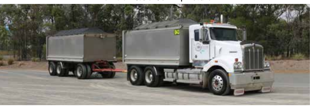
Kenworth T404SAR 6x4 & BPT | Brisbane