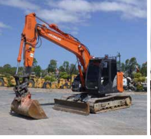
2016 Hitachi ZX135US-5B | Brisbane