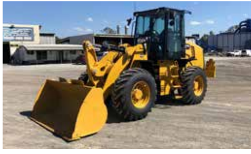
2016 Caterpillar 910K | Brisbane