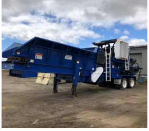
Peterson Pacific HC2400-A | Geelong