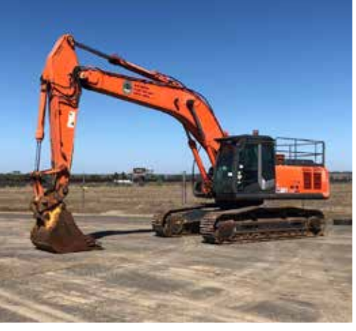
Hitachi ZX350 | Geelong