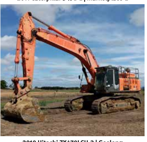
2010 Hitachi ZX470LCH-3 | Geelong