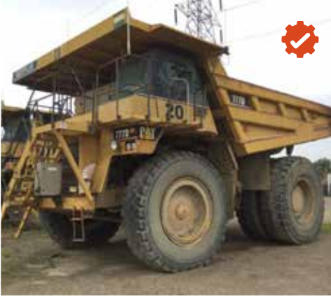
Caterpillar 777D | Marketplace-E