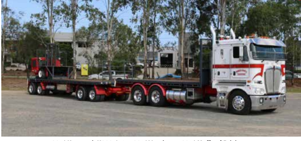
2016 Kenworth K200 6x4 & 2016 Vawdrey & 2016 Moffett | Brisbane