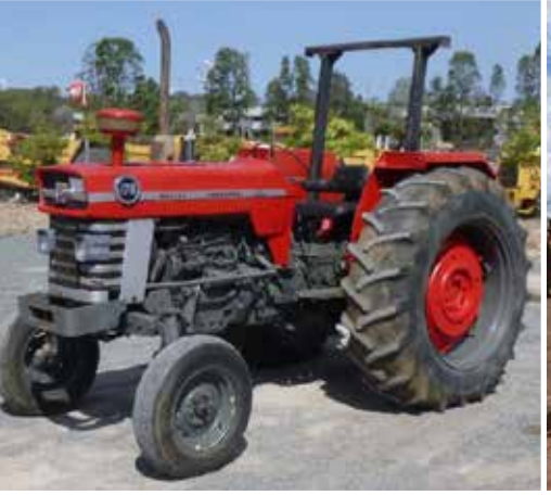
Massey Ferguson 178 | Brisbane