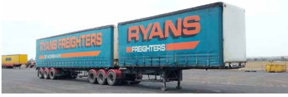
Freighter & Krueger | Geelong