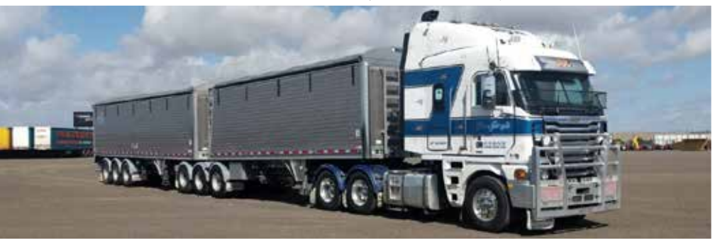
2012 Freightliner Argosy 6x4 & 2 – 2011 Wilson | Geelong