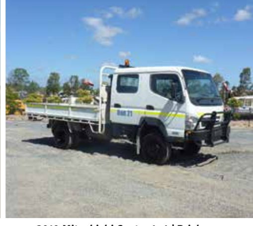
2010 Mitsubishi Canter 4x4 | Brisbane