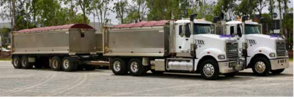
2 - 2013 Mack CMHR Trident 6x4 & 2 - Shephard | Brisbane