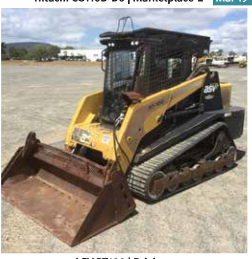
ASV PT100 | Brisbane