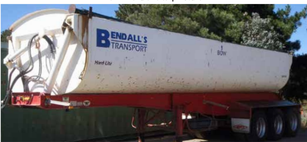
2010 Roadwest | Brisbane