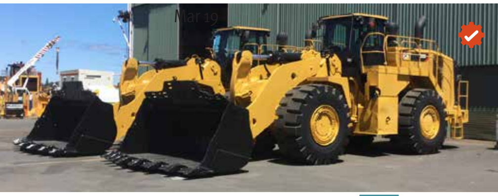
2 – 2015 Caterpillar 988K High Lift | Marketplace-E – Mar 19