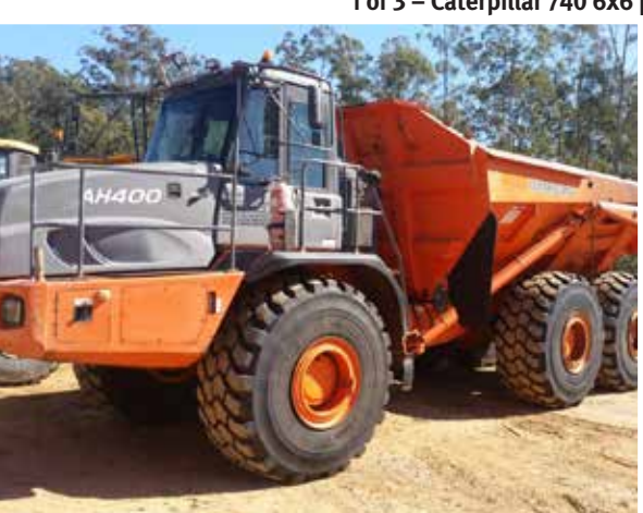
1 of 2 – Hitachi AH400 6x6 | Brisbane