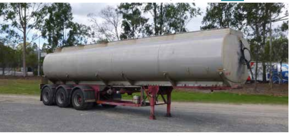
Holmwood Highgate 34000 Litre | Brisbane