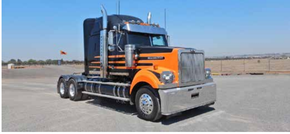
2017 Western Star 4900FXT Stratosphere 6x4 | Geelong