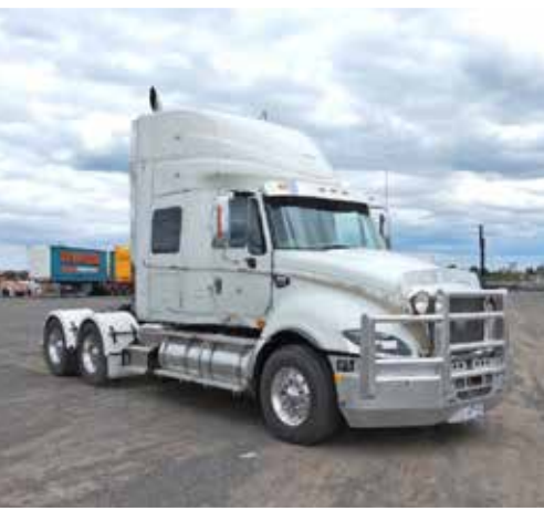
2013 Caterpillar CT630LS 6x4 | Geelong