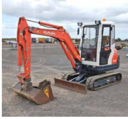
2011 Kubota KX71-3 | Geelong