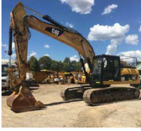
2011 Caterpillar 329D L | Brisbane