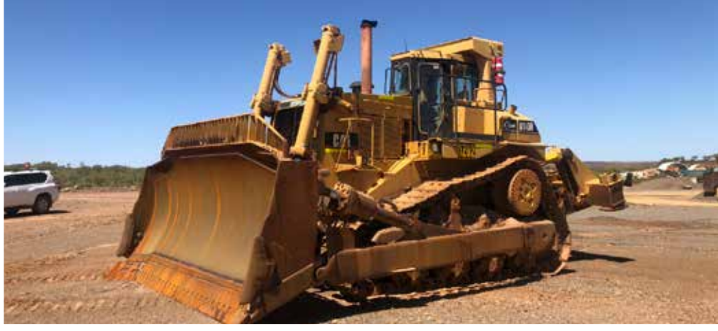
Caterpillar D10N | Brisbane