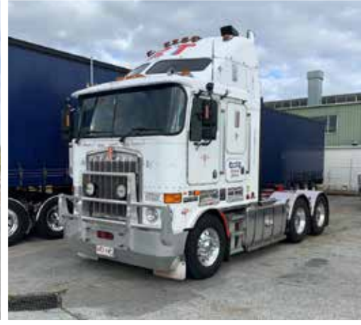
1 of 2 - Kenworth K108 Aerodyne 6x4 | Brisbane