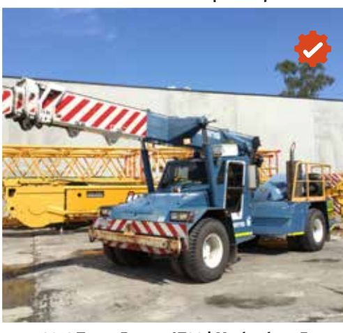
2012 Terex Franna AT20 | Markeplace-E