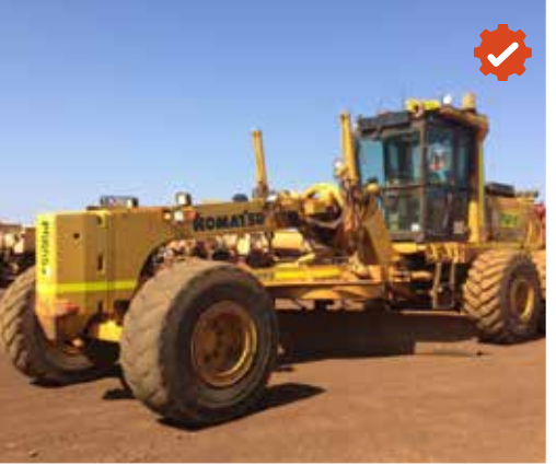
2014 Komatsu GD825A-2 Marketplace-E – Mar 19