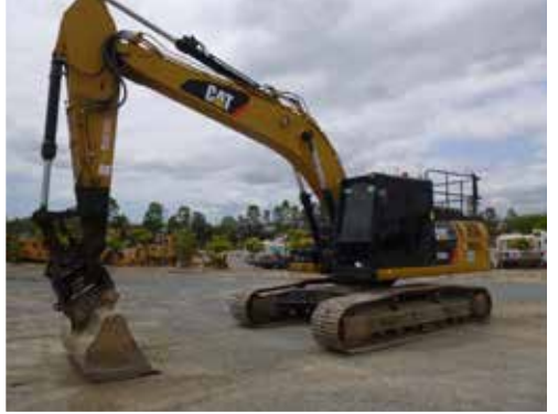
2015 Caterpillar 326D2 L | Brisbane