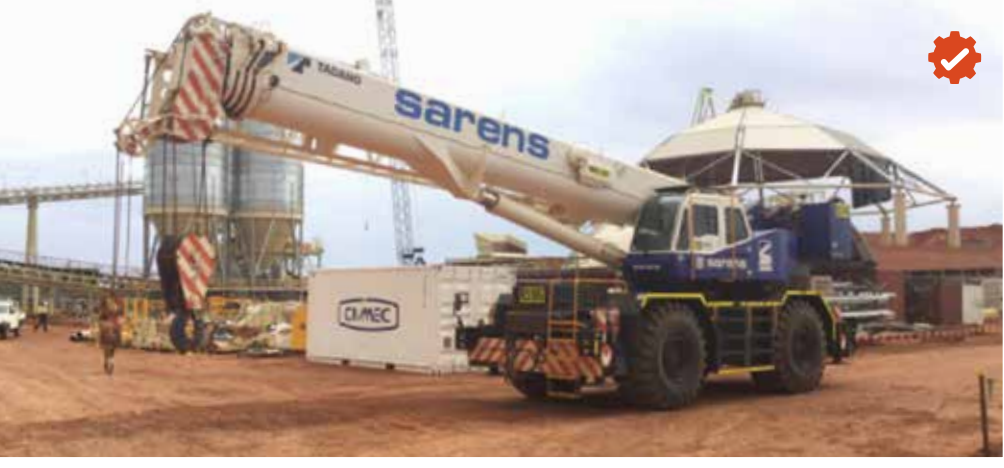
2012 Tadano GR-800EX | Markeplace-E