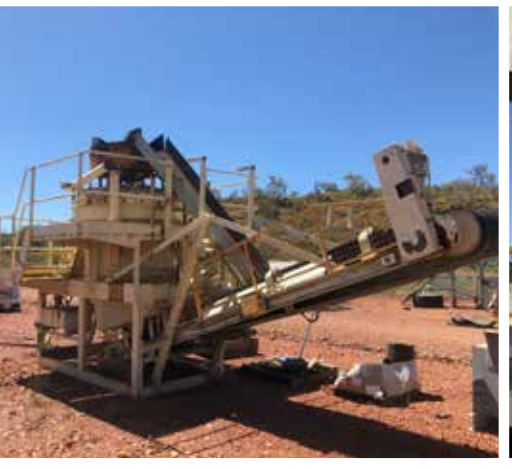
Impact Technology 200VSI | Brisbane