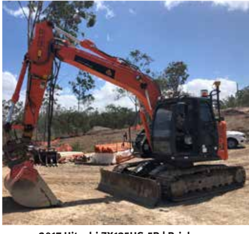
2017 Hitachi ZX135US-5B | Brisbane