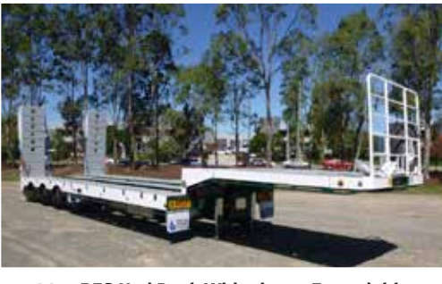
2015 RES Hyd Deck Widening & Extendable Brisbane