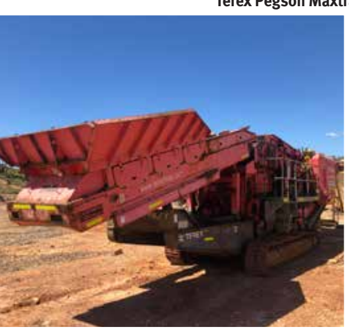
Terex Finlay C1540 | Brisbane