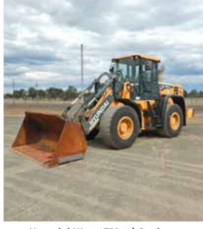
Hyundai HL740TM-9 | Geelong