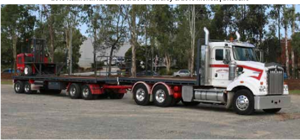
2015 Kenworth T409SAR 6x4 & Vawdrey & 2015 Moffett | Brisbane