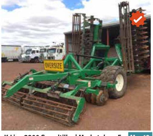
K-Line 2900 Speedtiller | Marketplace-E – Mar 19 New Holland L65DT & Silvan Slasher | Brisbane