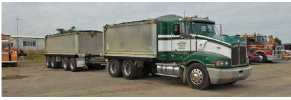
Kenworth T401 6x4 & Hercules | Geelong