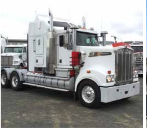
2013 Kenworth T909 6x4 | Geelong