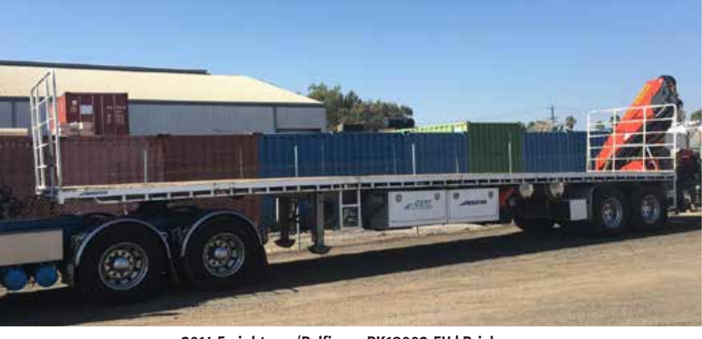
2014 Freighter w/Palfinger PK18002-EH | Brisbane