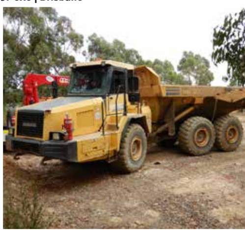
Komatsu HM300-1 6x6 | Geelong