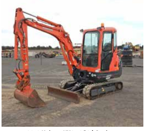
2012 Kubota KX91-3S2 | Geelong