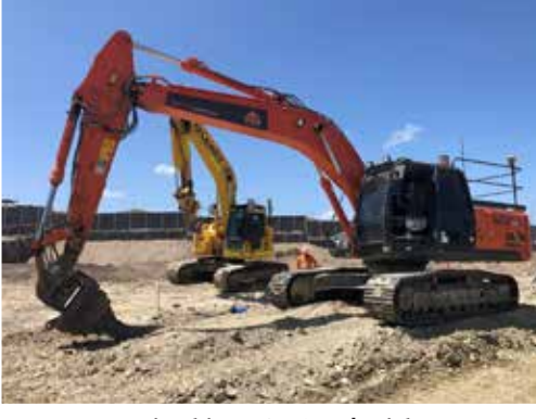
2017 Hitachi ZX260LC-5B | Brisbane