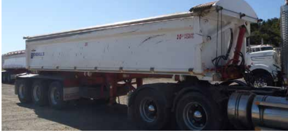
1 of 2 - Howard Porter | Brisbane