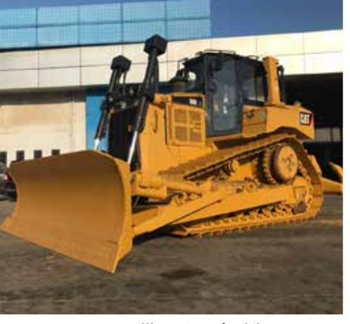
2012 Caterpillar D6R XL | Brisbane