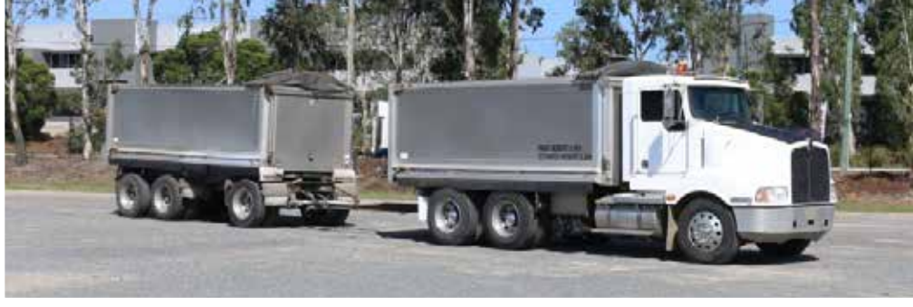
Kenworth T401 6x4 & Maxitrans | Brisbane