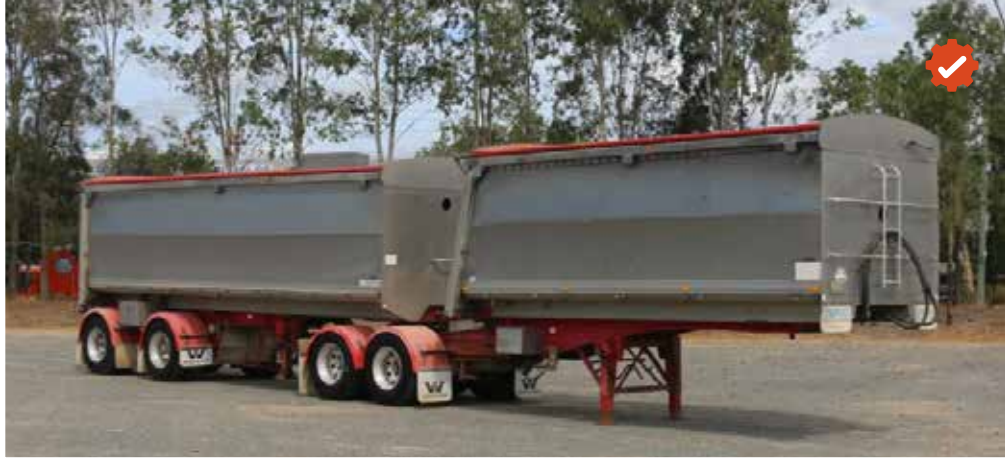
Tefco B-Double Combination | Marketplace-E