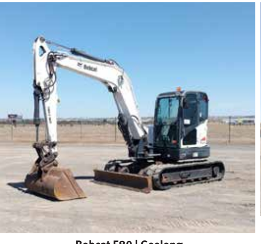
Bobcat E80 | Geelong