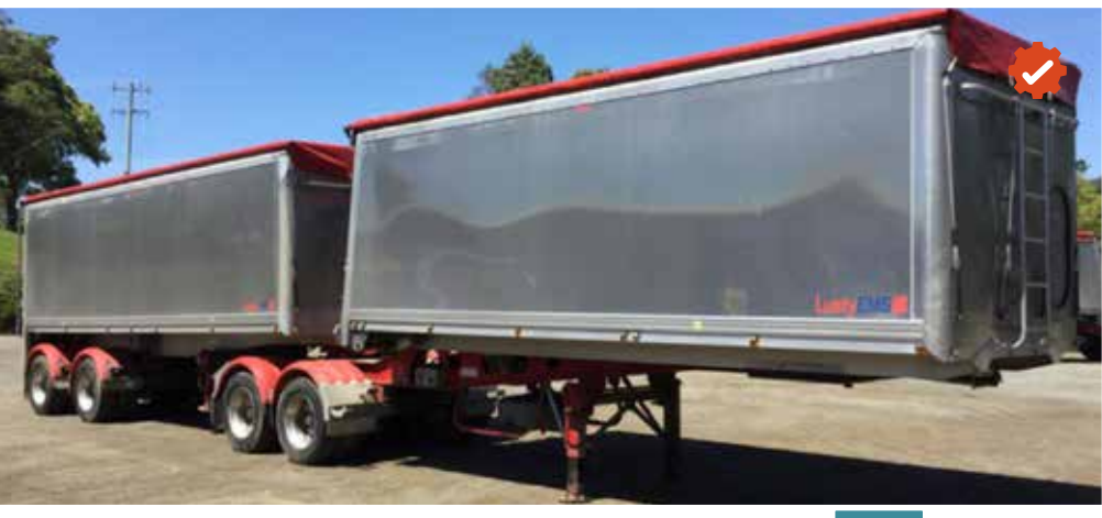
1 of 3 – Lusty EMS B-Double Combination | Marketplace-E – Mar 19