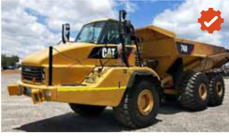
Caterpillar 740 6x6 | Marketplace-E