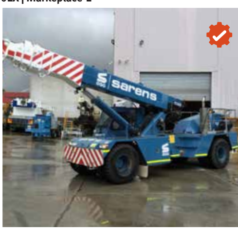
2014 Terex Franna MAC25 | Markeplace-E