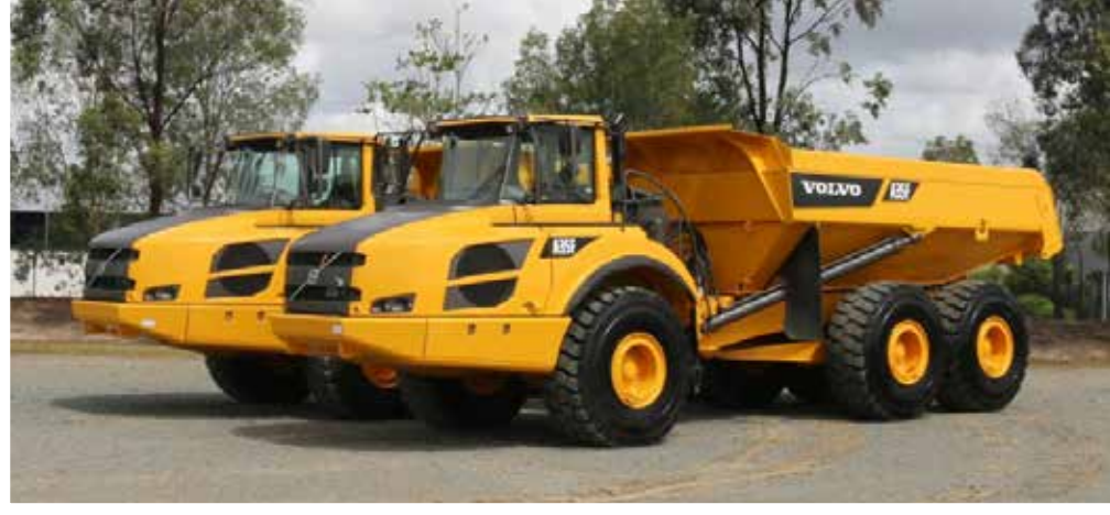
2 - 2011 Volvo A35F 6x6 | Brisbane