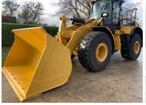
2017 Caterpillar 972M | Brisbane