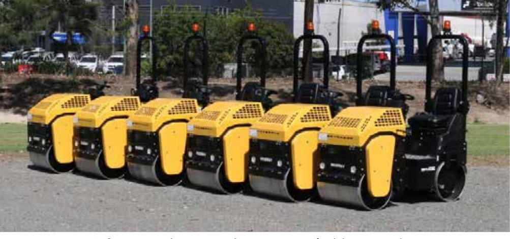
6 of 12 - Unused - 2019 Roadway RWYL42AC | Brisbane & Geelong