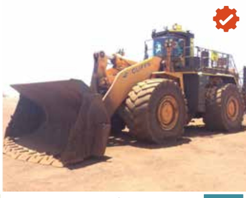
Komatsu WA900-3E0 | Marketplace-E – Mar 19