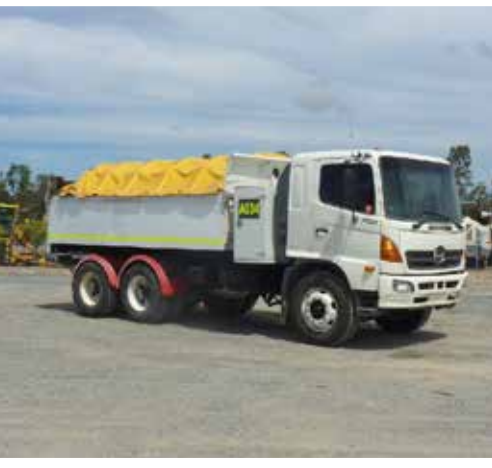
Hino FM1J 6x4 | Brisbane