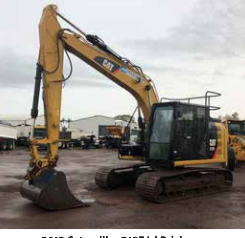
2013 Caterpillar 312E L | Brisbane