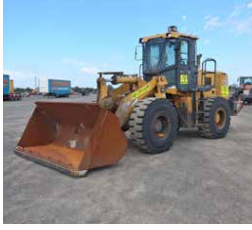
2013 XCMG LW400K | Geelong