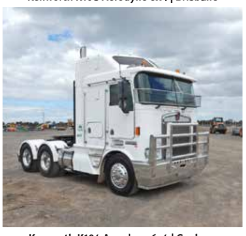
Kenworth K104 Aerodyne 6x4 | Geelong