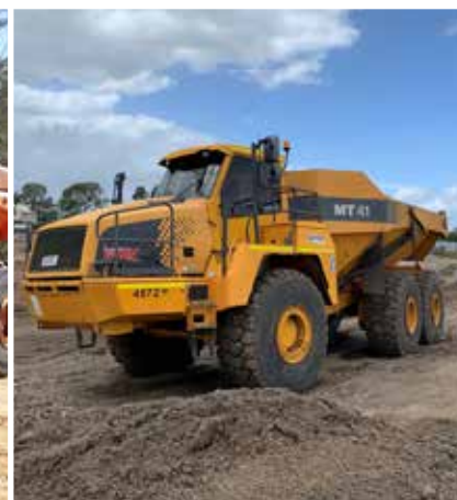
1 of 2 - Moxy MT41 6x6 | Brisbane