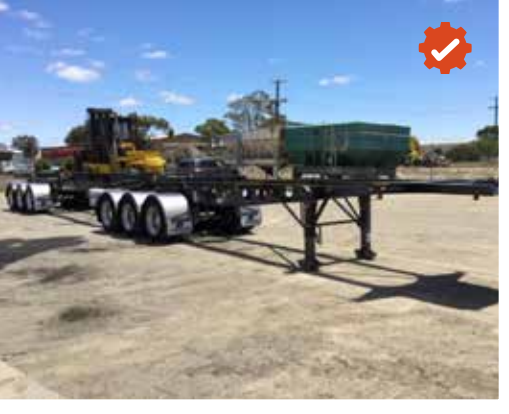
2013 Maxitrans B-Double Combination Marketplace-E