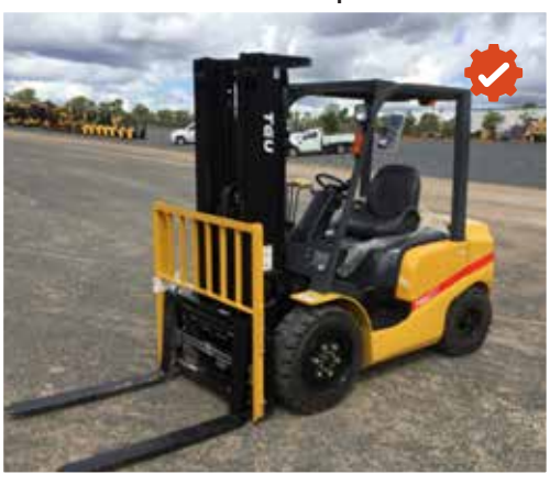
Unused – 2018 TEU FD30T Marketplace-E – Mar 19