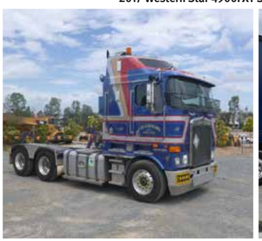
Kenworth K108 Aerodyne 6x4 | Brisbane