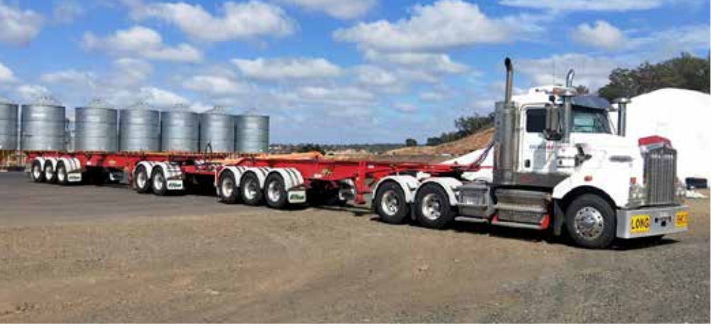
2012 Kenworth T409SAR 6x4 & 3 - O'Phee | Brisbane