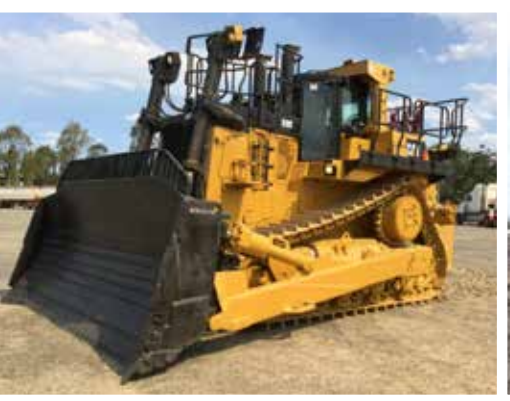
2010 Caterpillar D10T | Marketplace-E