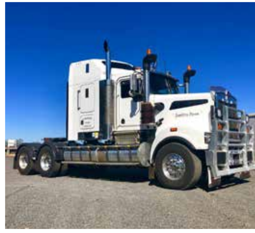
Kenworth T904 6x4 | Brisbane