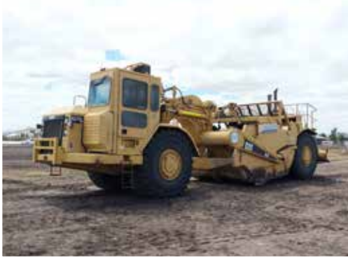
1 of 2 - Caterpillar 627 Auger | Geelong