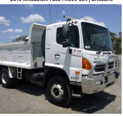
Hino FM1J 6x4 | Brisbane