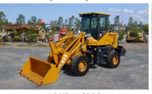
2018 PCAT 928 | Brisbane