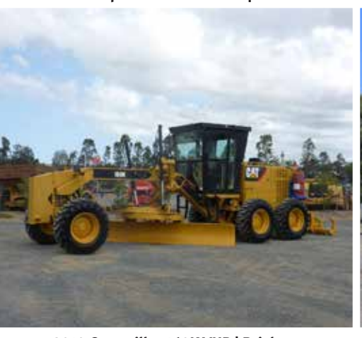
2010 Caterpillar 160K VHP | Brisbane