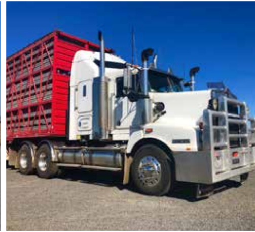
Kenworth T404 6x4 | Brisbane