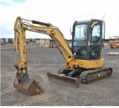
Komatsu PC30MR-2 | Geelong