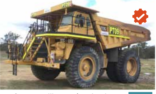
1 of 2 – Caterpillar 777C | Marketplace-E – Mar 19