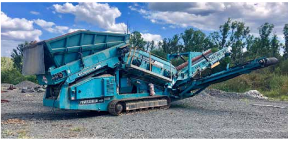
Powerscreen Warrior 1400 | Brisbane