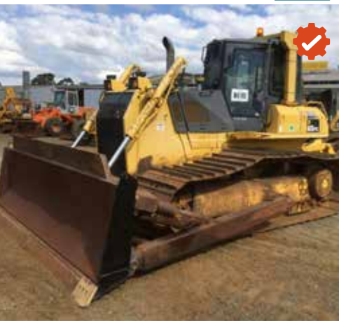
Komatsu D65PX-15 | Marketplace-E