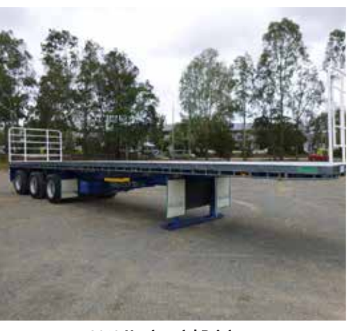
2012 Haulmark | Brisbane