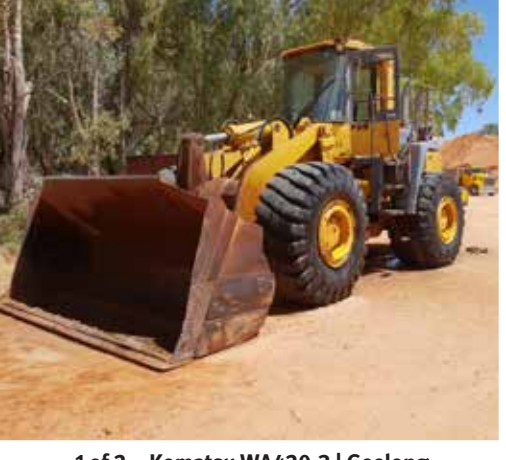
1 of 2 - Komatsu WA420-3 | Geelong