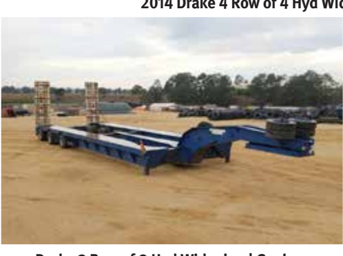
Drake 3 Row of 8 Hyd Widening | Geelong