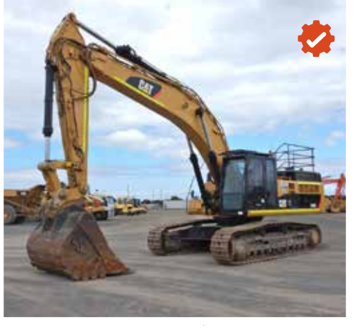
2011 Caterpillar 349D L | Marketplace-E