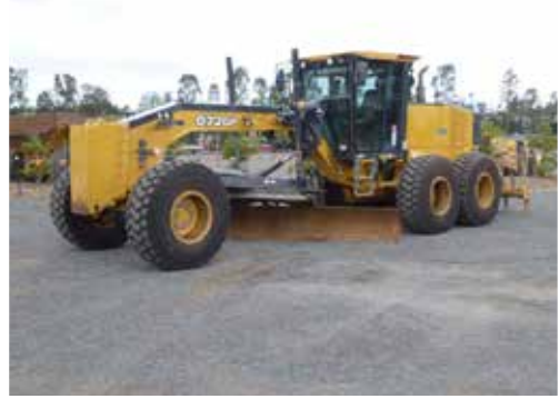
2011 John Deere 872GP AWD | Brisbane