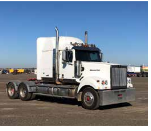
1 of 2 – 2013 Western Star 4900FXT 6x4 Geelong