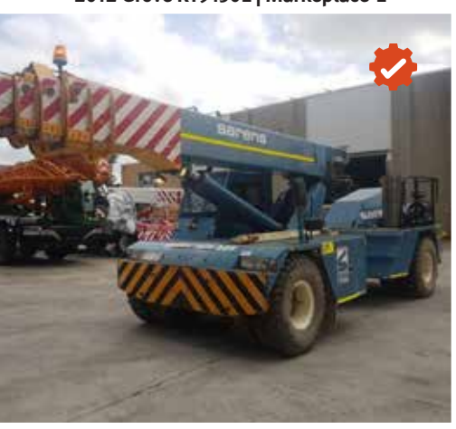
2012 Terex Franna MAC25 | Markeplace-E