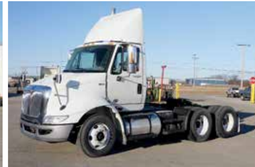
1 of 3 - 2012 International 8600