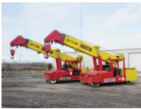
2 - Mobilift MBL075 75 Ton