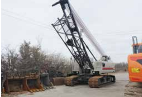
Link-Belt LS138H 75 Ton Crawler