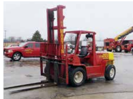
Hyster H135XL 13500 Lb