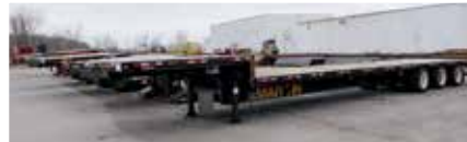
2012 Manac 53 Ft Extendable