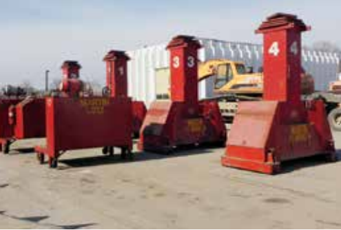
Lift-N-Lock L1800-4-34 900 Ton Gantry