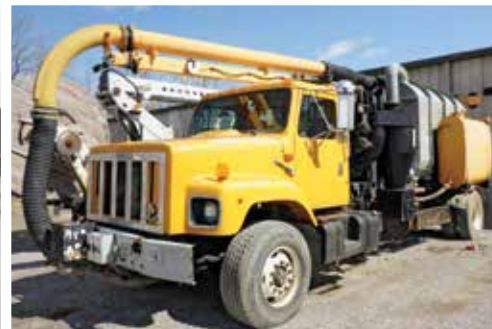
International 2654 w/Safe Jet Vac