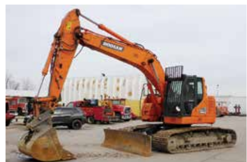
2015 Doosan DX235LCR-5