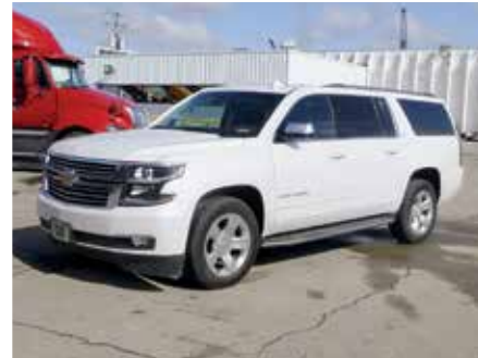
Chevrolet Suburban LTZ 4x4