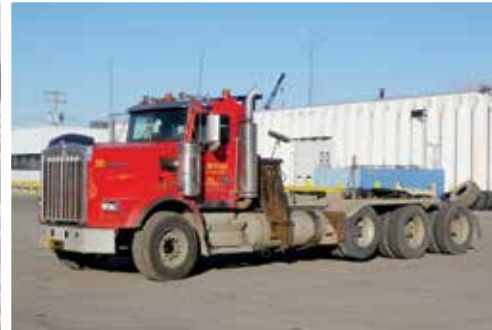
Kenworth T800 w/Tulsa Winch