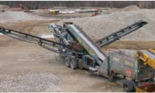
Powerscreen Chieftain 1200 5 x 10 Ft 2 Deck