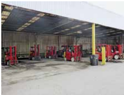
Qty of Forklifts