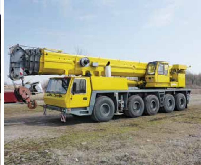
Grove GMK5120B 120 Ton 10x8x10