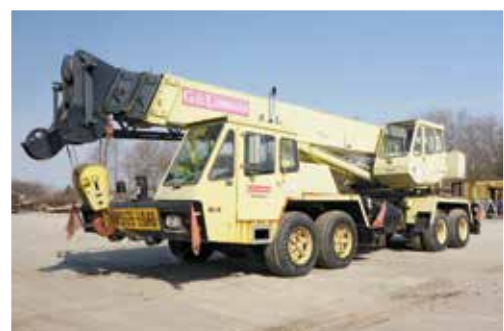
Grove RT58 14 Ton 8x4x4