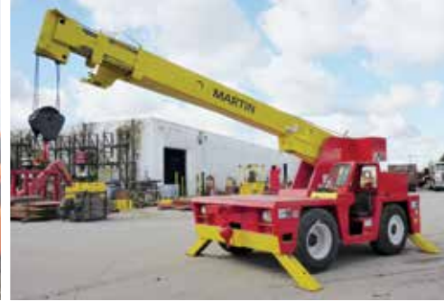
Broderson IC1801A 15 Ton