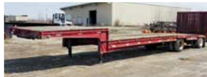
1 of 2 - Nelson ART-35F 44 Ft