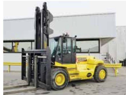
Hoist P168 33.5 Ton