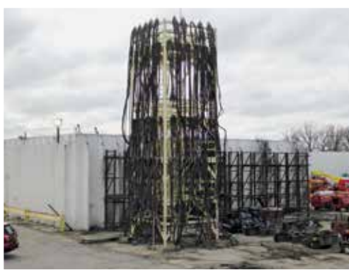
Large Qty of Rigging Equipment