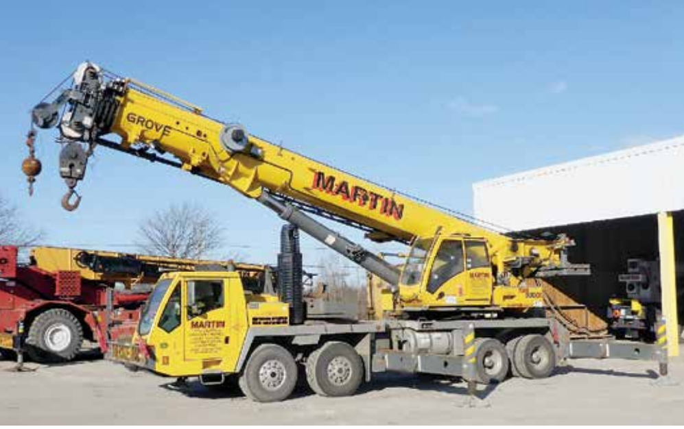
Grove TMS9000E 110 Ton 8x4x4