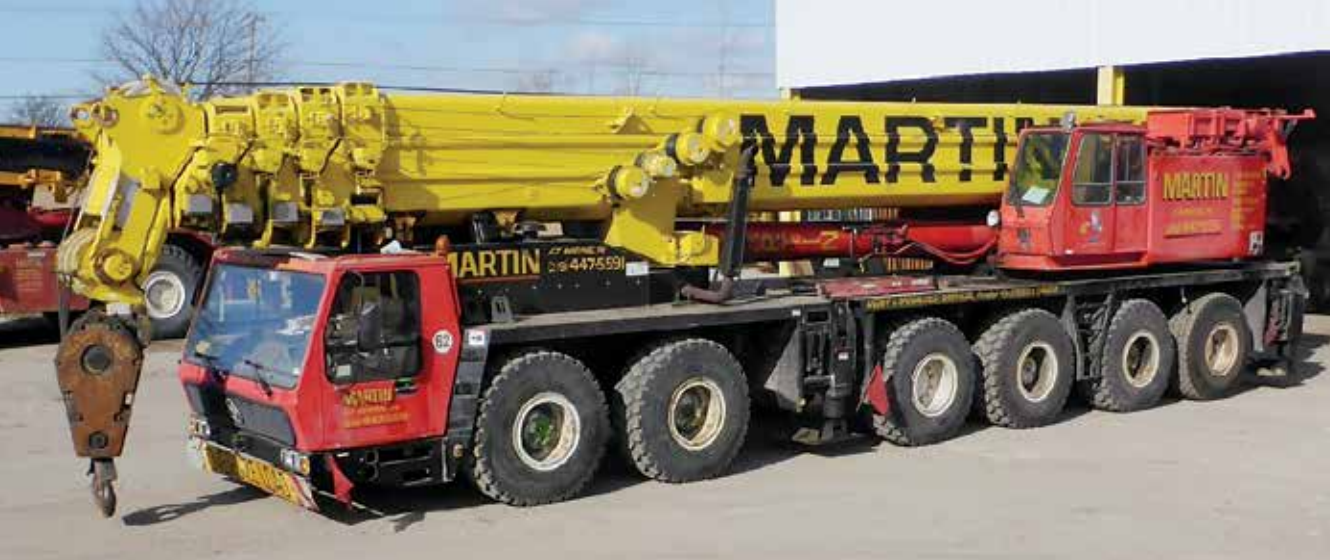
Krupp KMK6200 275 Ton 12x8x4