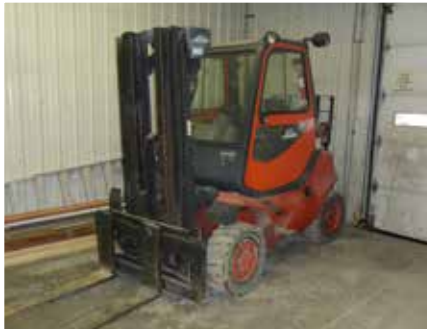
Linde H40D04 8000 Lb