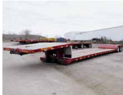
Trail King 50 Ton Expandable