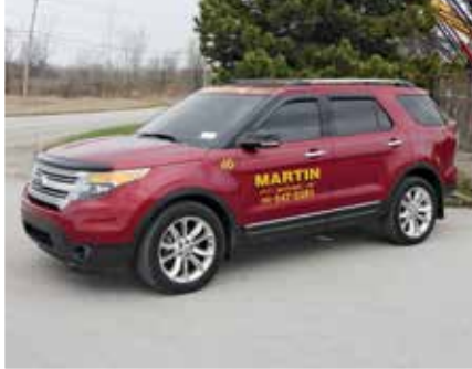
2014 Ford Explorer XLT 4x4