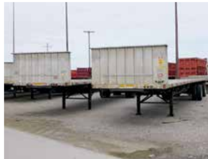
2 of 3 - Utility 48 Ft Aluminum