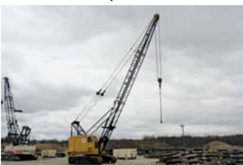
American 595C 40 Ton