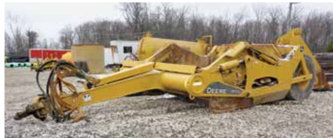
1 of 2 – John Deere 1810E 18 CY Ejector

» See complete and up-to-date listings for this auction at rbauction.com