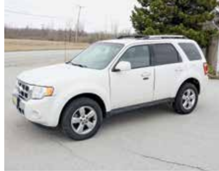
2012 Ford Escape Limited 4x4