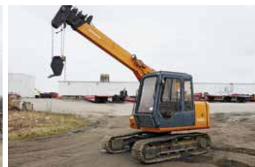
Hitachi EX-60-LCT-3 4 Ton