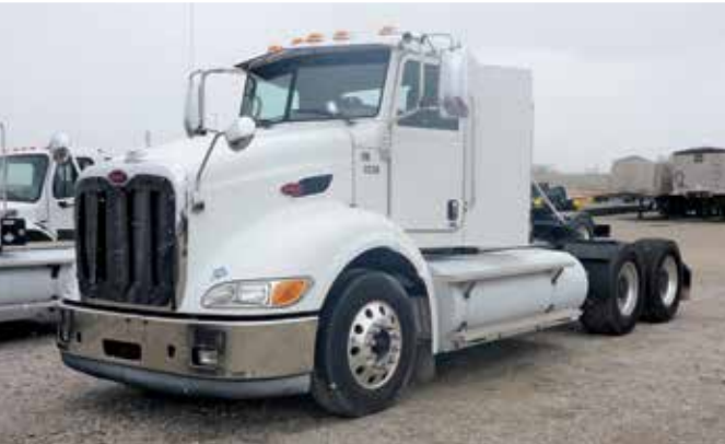
2013 Peterbilt 384