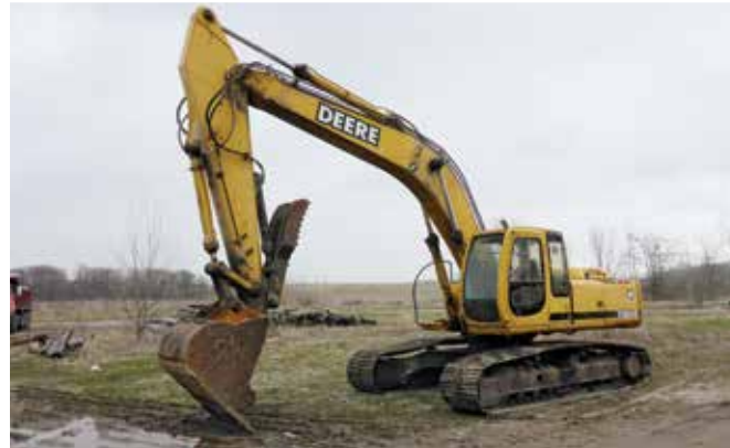
John Deere 230 LC