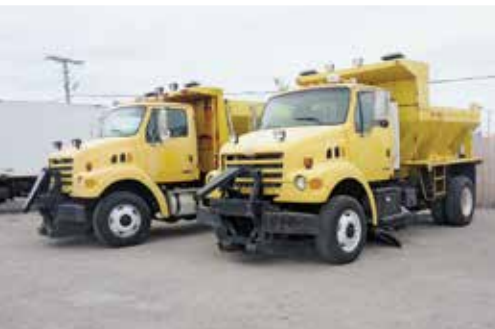
2 - Sterling L7500