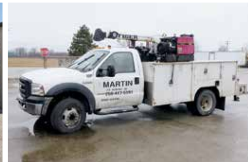
Ford F550 XL w/Tiger 5031E 500 Lb