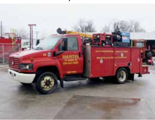
Chevrolet C5500 w/STI 8000 Lb