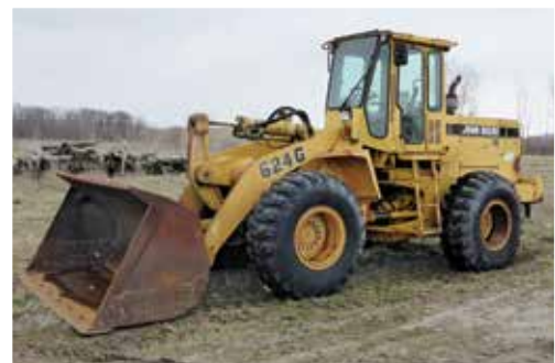
John Deere 624G