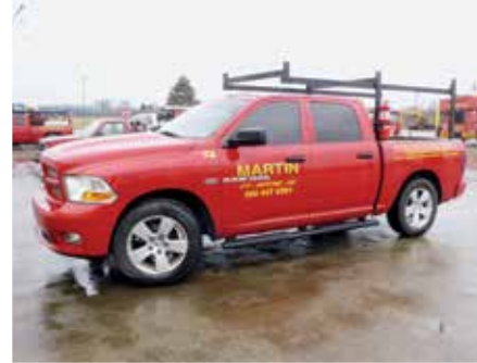
2012 Dodge Ram 1500ST 4x4