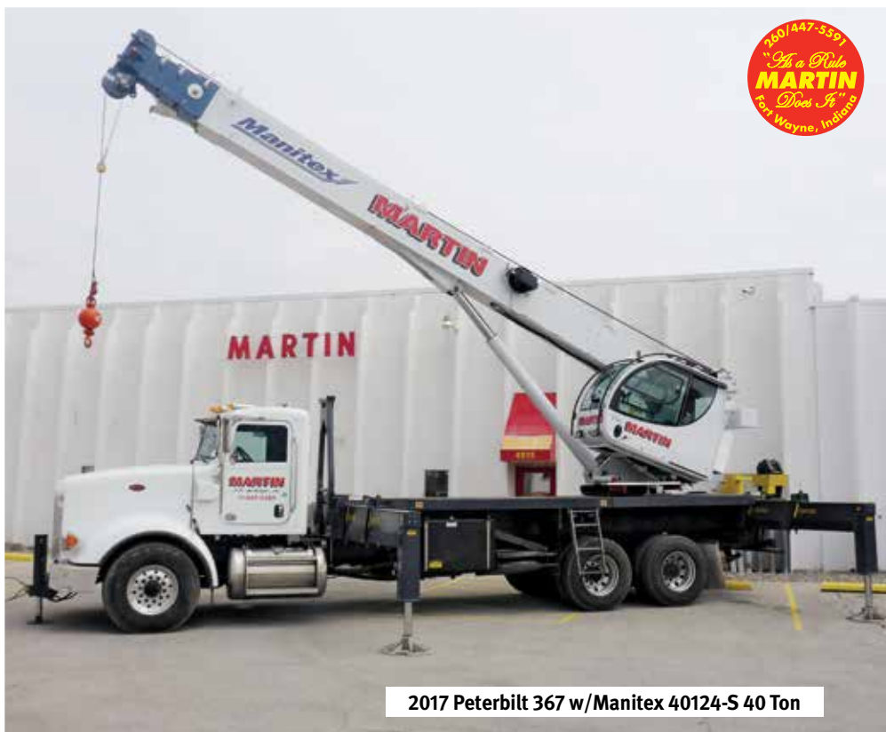
2017 Peterbilt 367 w/Manitex 40124-S 40 Ton