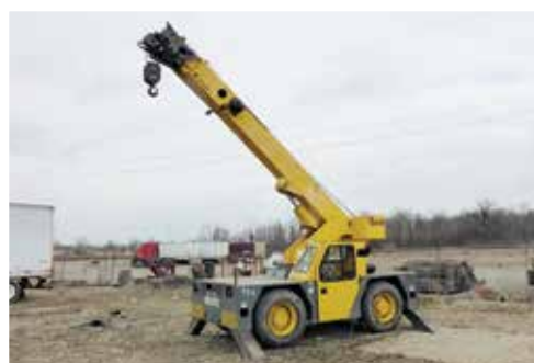
Grove YB5515 15 Ton