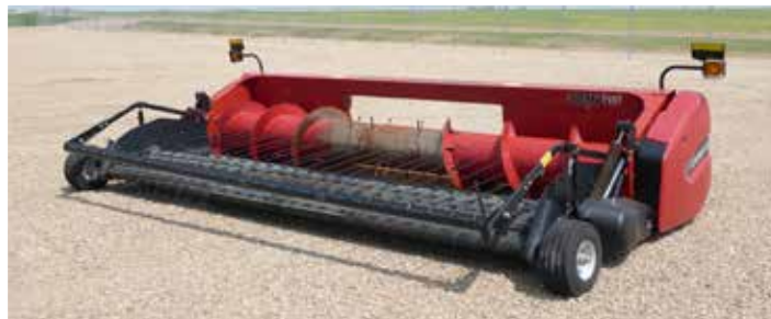
2012 Case IH 3016 15 Ft