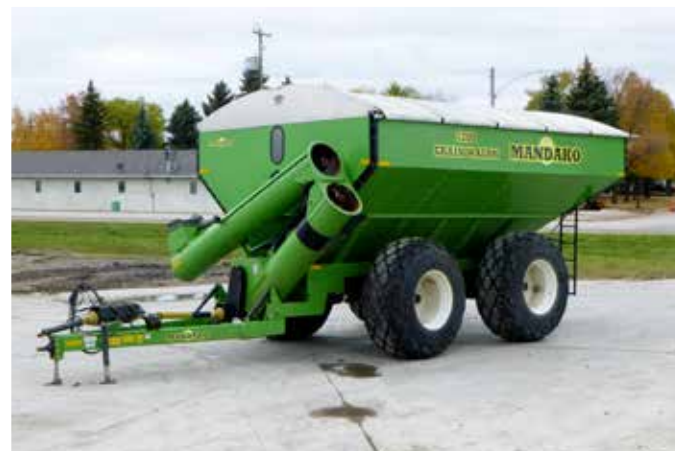
2015 Mandako MGW1200