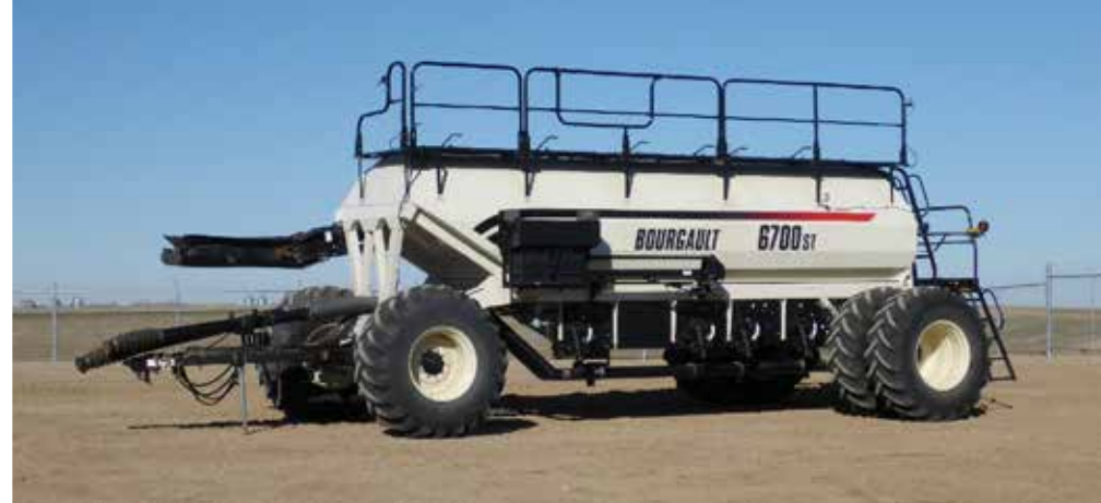
2012 Bourgault 6700ST