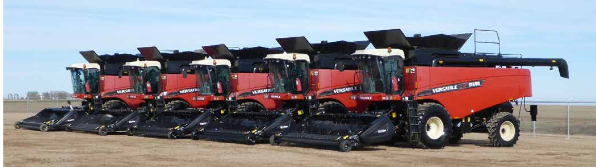
5 of 7— 2014 Versatile RT490 RWA