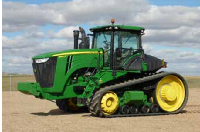
2013 John Deere 9560RT