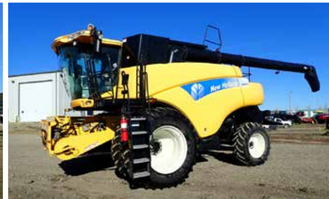
2011 New Holland CR9070