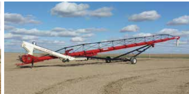
2014 Wheatheart X160-125