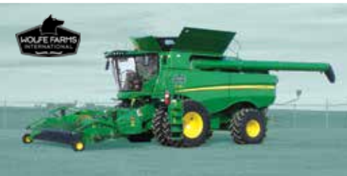
2016 John Deere S690