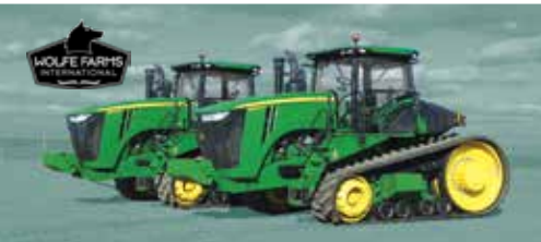
2- 2013 John Deere 9560RT