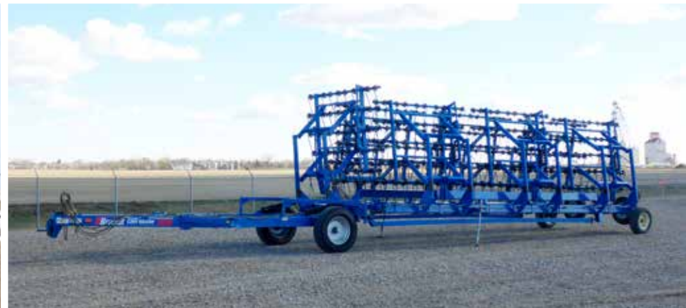
2011 Brandt Contour Commander 7000 70 Ft