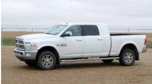
2016 Ram 2500 Laramie 4x4