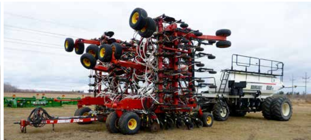
2009 Bourgault 3310PHD 65 Ft w/6550ST