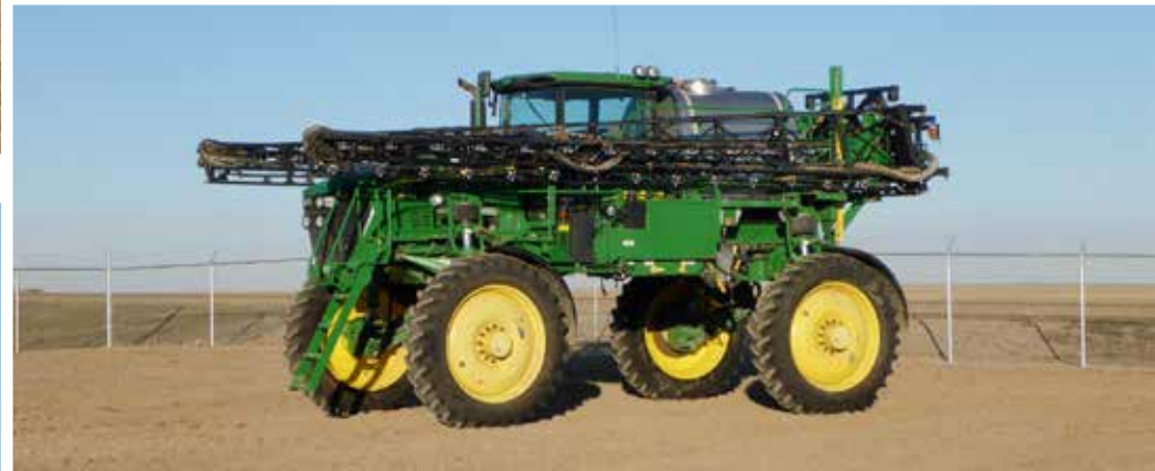
2011 John Deere 4830 100 Ft