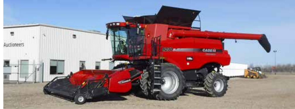
2013 Case IH 9230