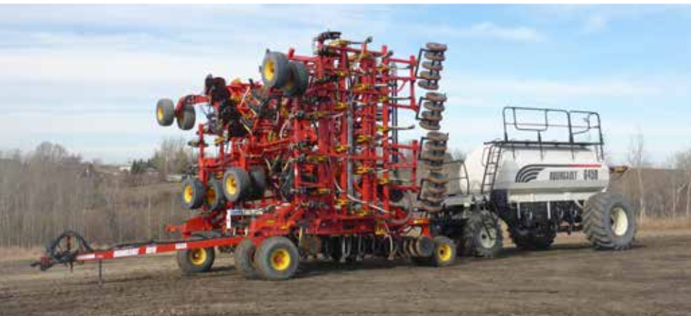
2012 Bourgault 5810 72 Ft w/6450