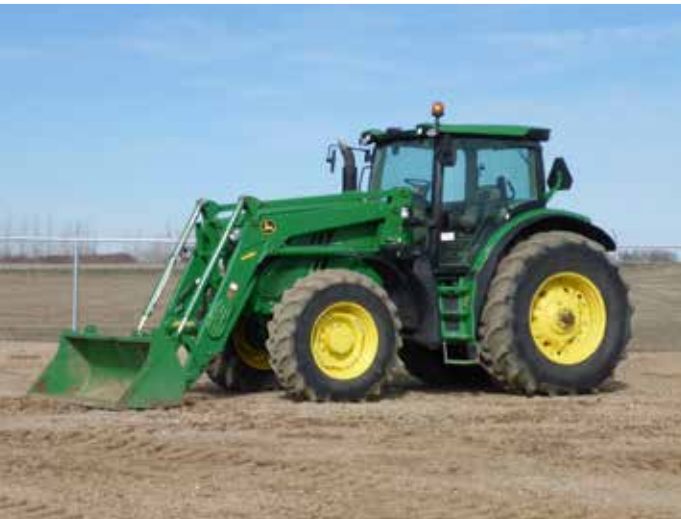
2013 John Deere 6210R