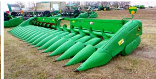
2013 John Deere 618C