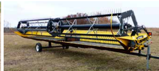
2005 New Holland 94C 36 Ft