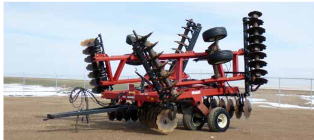
2013 Versatile TD700 28.5 Ft