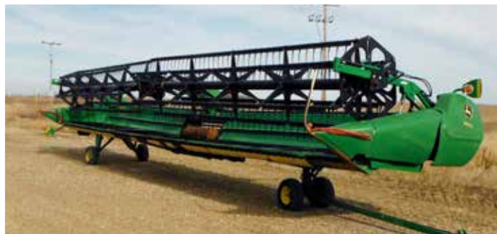
1 of 2— 2013 John Deere 640D 40 Ft HydraFloat