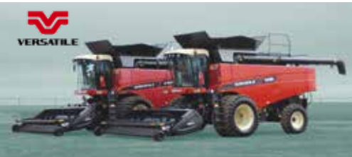
2- 2015 Versatile RT490 RWA