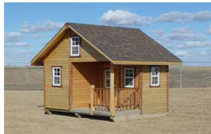
Unused- FG Pro 8 Ft x 10 Ft

OTHER ITEMS INCLUDE: Generator Sets - Pumps - Tanks - Industrial Plant Equipment - Crane Accessories - Equipment Attachments - Tires - Treated Fence Posts - Work Benches - Unused - FG Pro 8 Ft x 10 Ft Skid Mounted Cabin Playhouse - Unused - FG Pro 8 Ft x 10 Ft Skid Mounted Playhouse ... AND MUCH MORE!