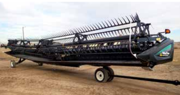
1 of 2— 2014 MacDon FD75-D 45 Ft