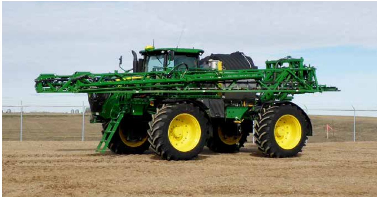
2017 John Deere R4045 120 Ft