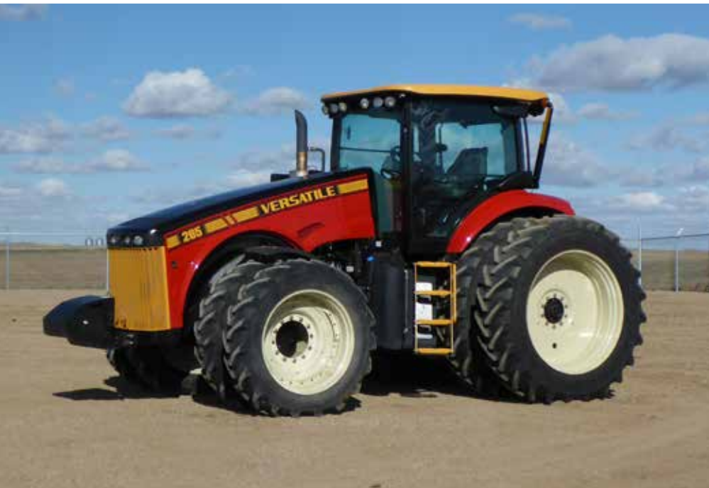
2017 Versatile 265 Row Crop