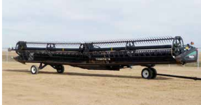
2015 MacDon FD75-D 45 Ft