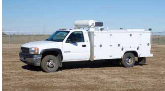
2001 GMC 3500 SL 4x4