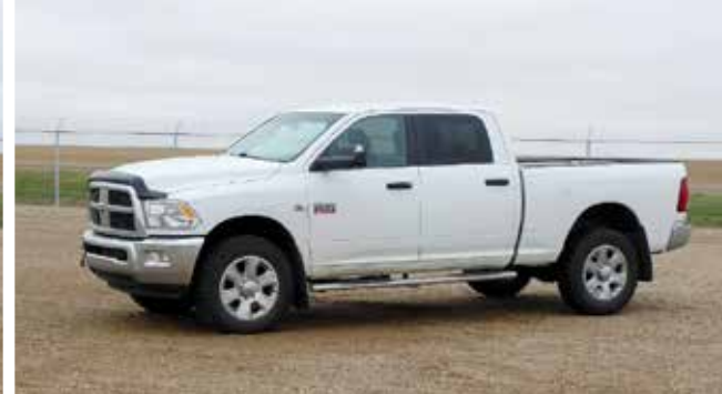
2012 Ram 3500 SLT 4x4