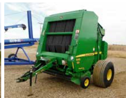
2012 John Deere 568