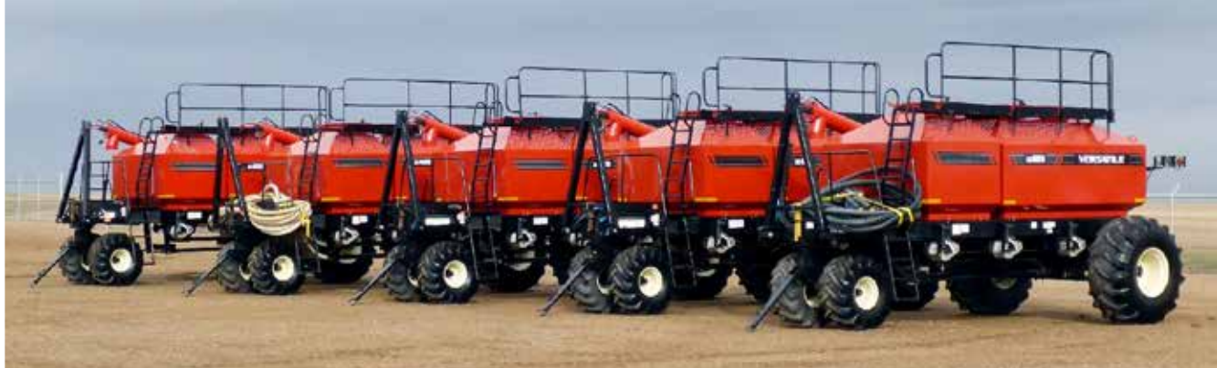
5 of 7— 2014 Versatile AC400