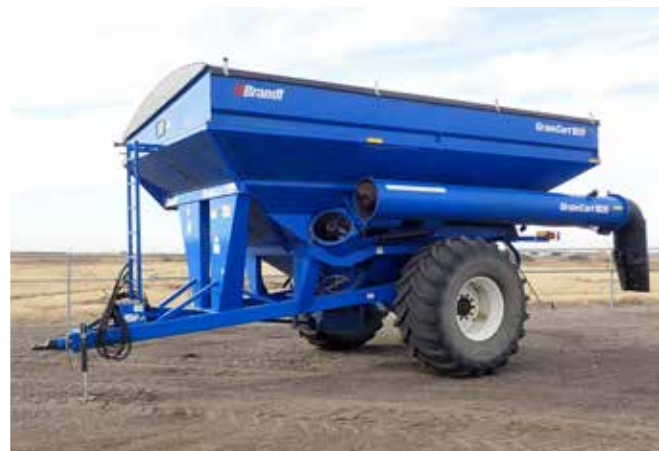
2014 Brandt 1020XR