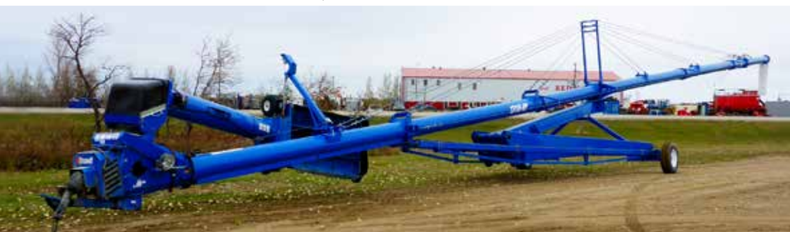
2014 Brandt 13110-HP