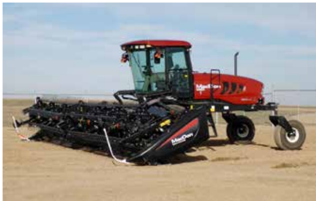
2015 MacDon M155 35 Ft

Hold your device's camera up to the QR code