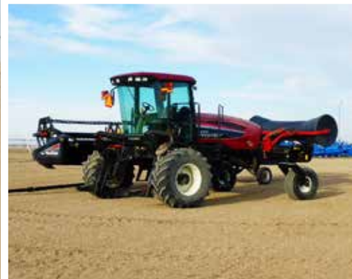
2010 Premier M150 35 Ft