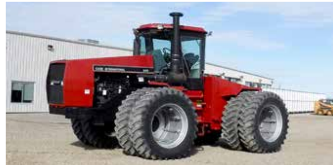
1995 Case IH 9270