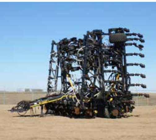
2015 K-Hart GenII 66 Ft