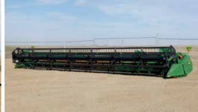
2015 John Deere 635F 35 Ft HydraFlex