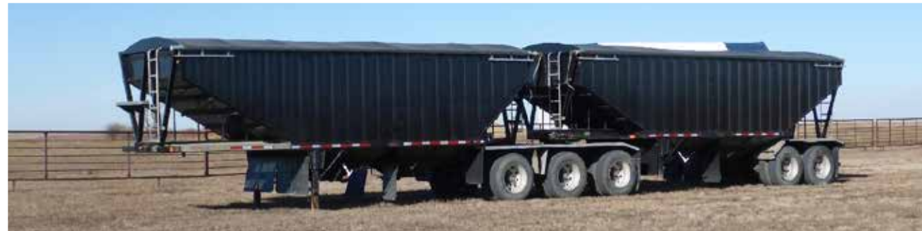
2003 Doepker Super B