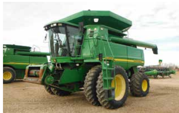
2004 John Deere 9860STS