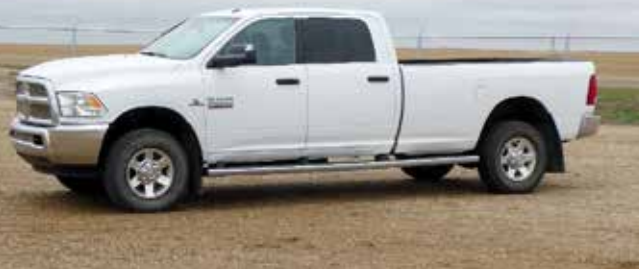
2016 Ram 2500 SLT 4x4