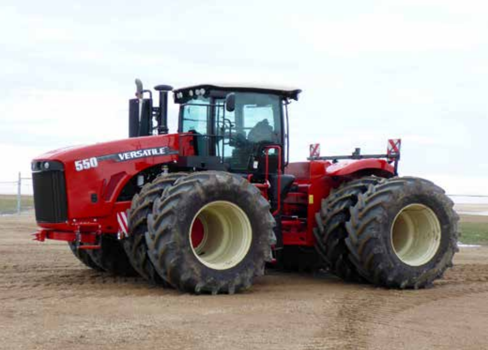
2014 Versatile 550