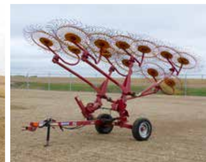
2002 Sitrex H-90 V12