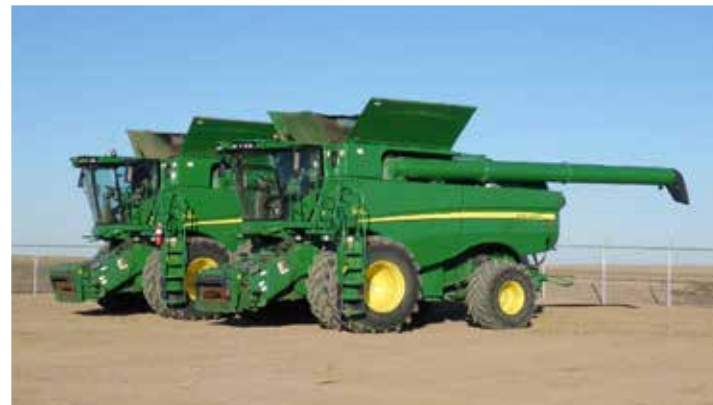
2— 2015 John Deere S680