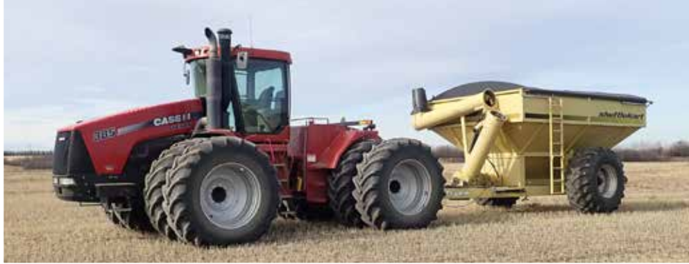
2009 Case IH Steiger 385 & 1996 Degelman SK800