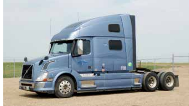
2015 Volvo VNL64T 780