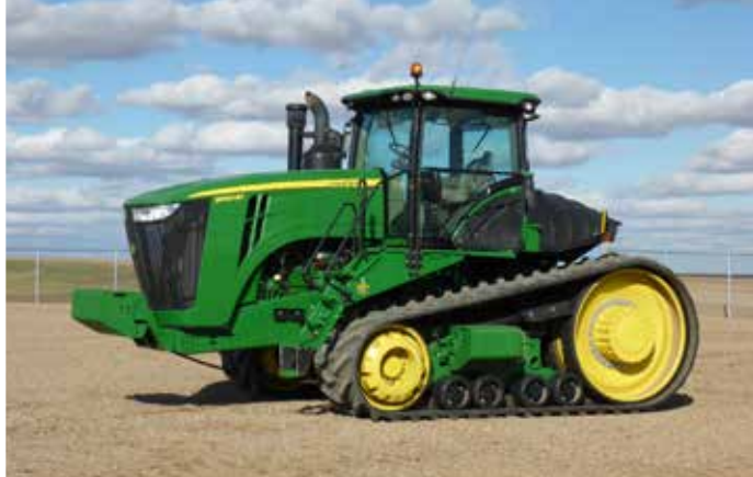
2013 John Deere 9560RT