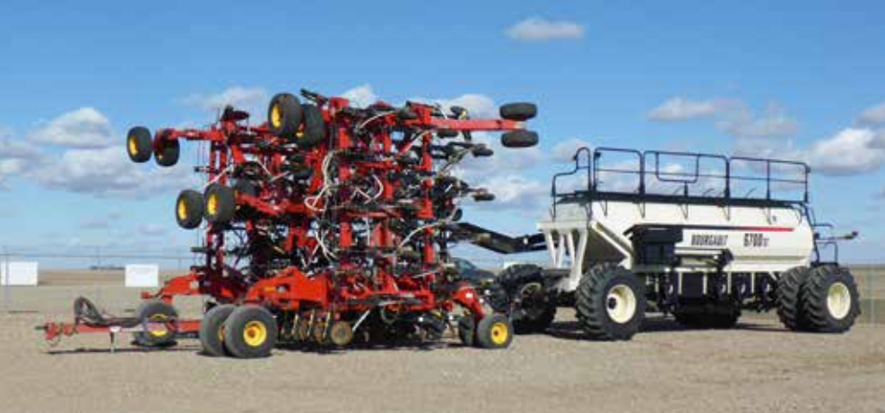
2012 Bourgault 3320PHD QDA 66 Ft w/2013 Bourgault 6700ST