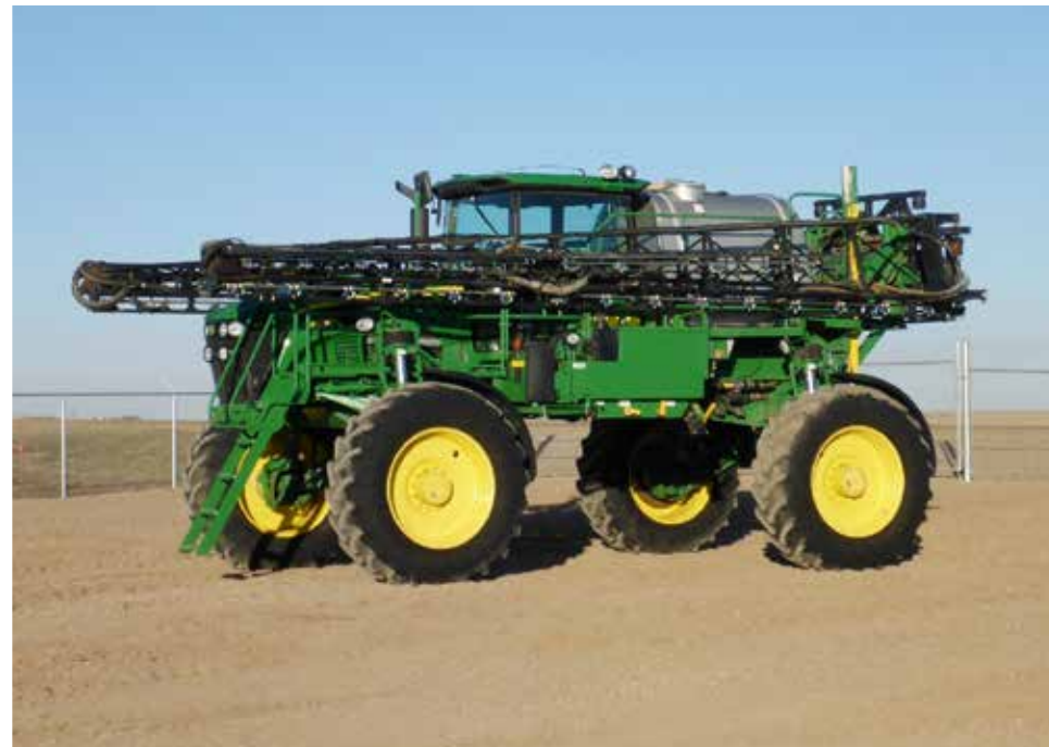
2013 John Deere 4830 100 Ft