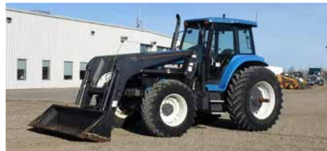
1999 New Holland 8770