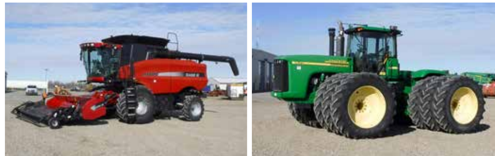
2006 Case IH 8010