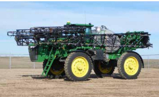
1 of 2— 2013 John Deere 4940 120 Ft