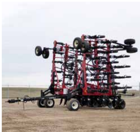
2014 Versatile ML930 42 Ft