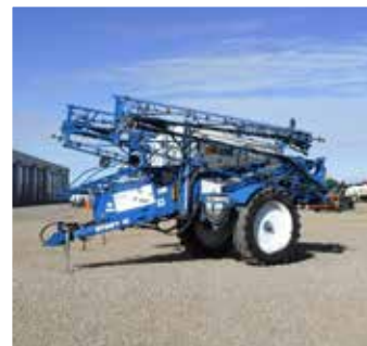
2005 Brandt SB4000 100 Ft