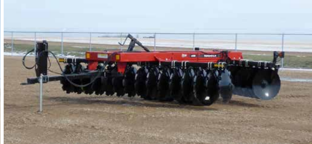
2015 Versatile SD650 15 Ft