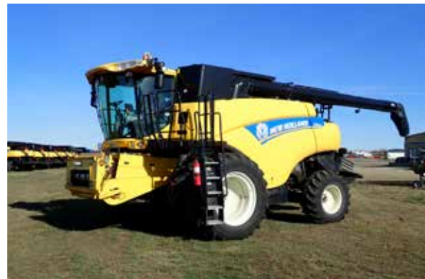
2014 New Holland CR8090