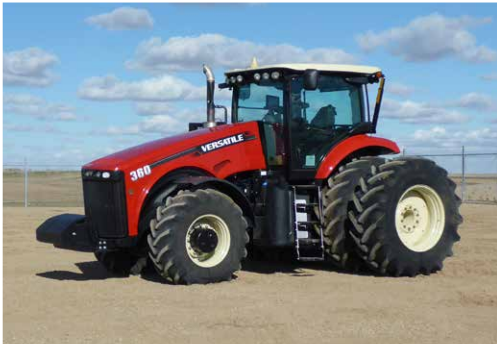
2015 Versatile 360