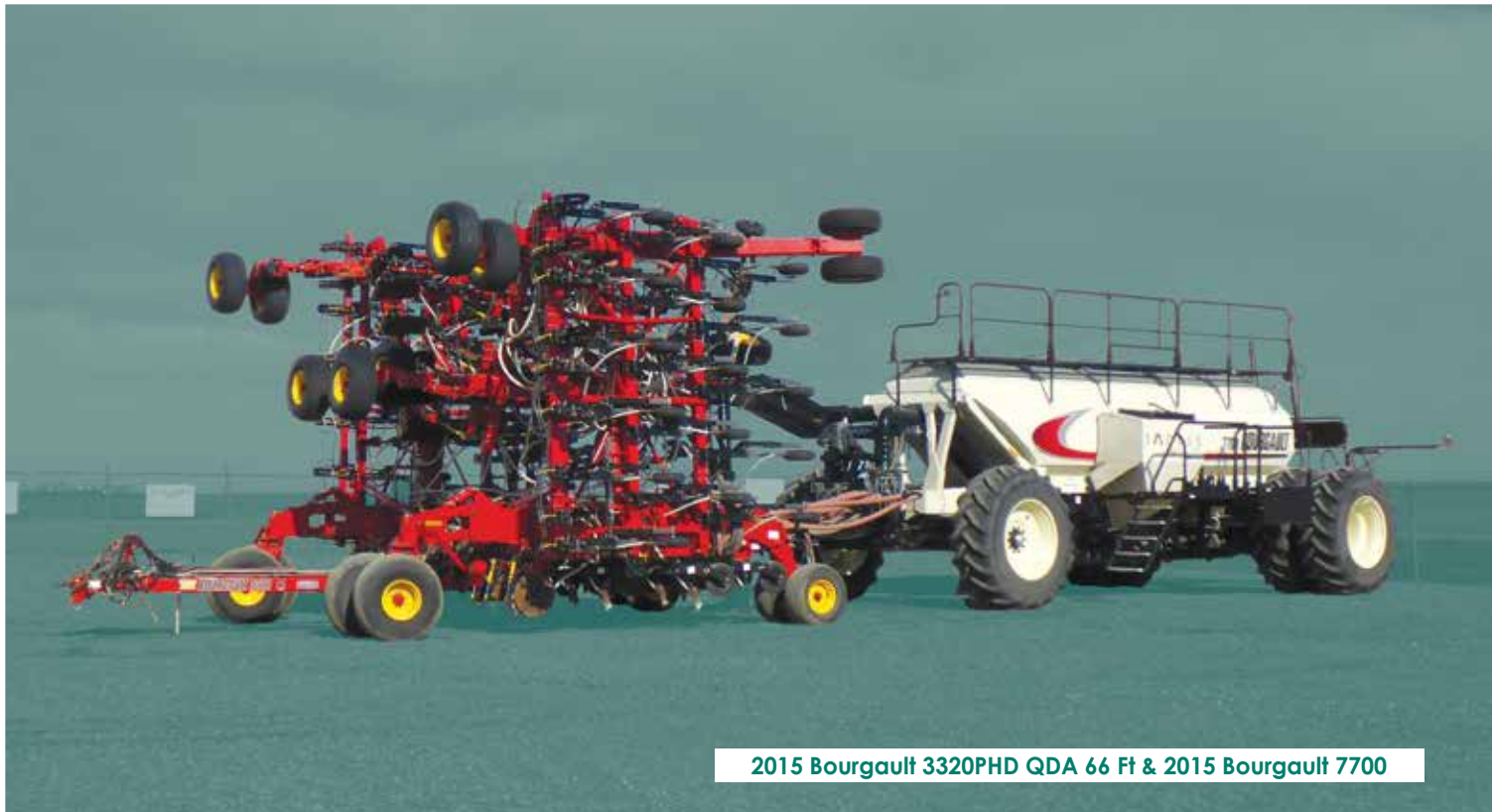
2015 Bourgault 3320PHD QDA 66 Ft & 2015 Bourgault 7700