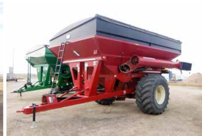
2011 Parker 1039