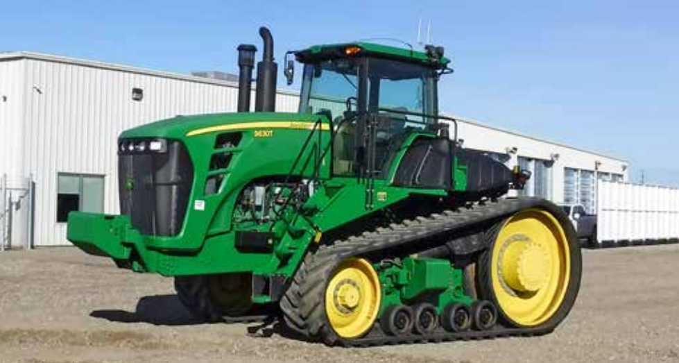
2008 John Deere 9630T