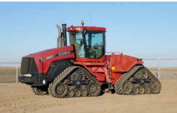
2009 Case IH Steiger 535