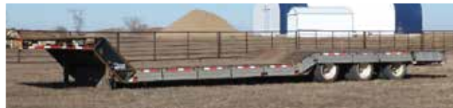
2008 Palomino 48 Ton