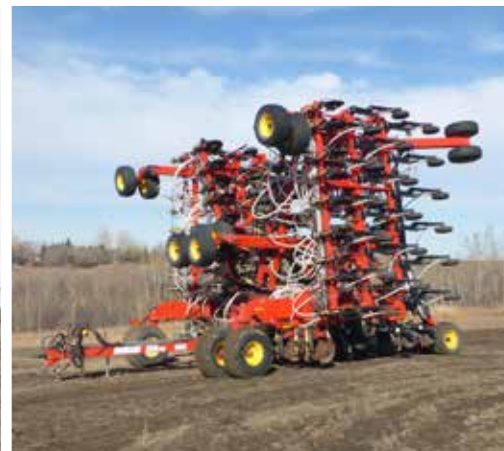
2011 Bourgault 3310PHD 75 Ft