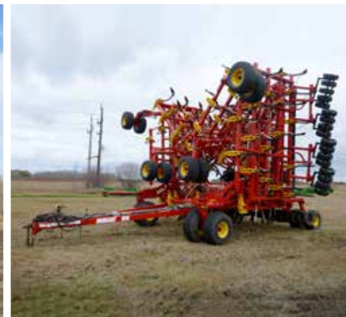
2011 Bourgault 5810 72 Ft