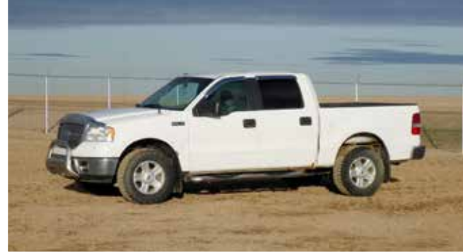
2008 Ford F150 XLT 4x4