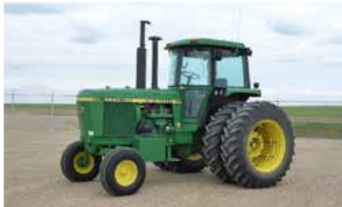
1978 John Deere 4440