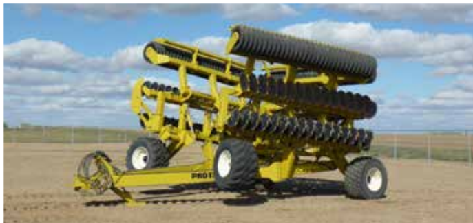
2015 Degelman Pro-Till 40 Ft