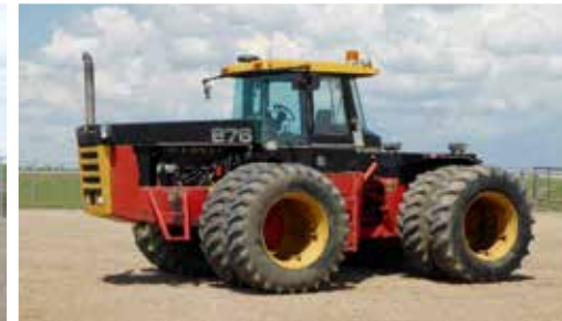
1985 Versatile 876