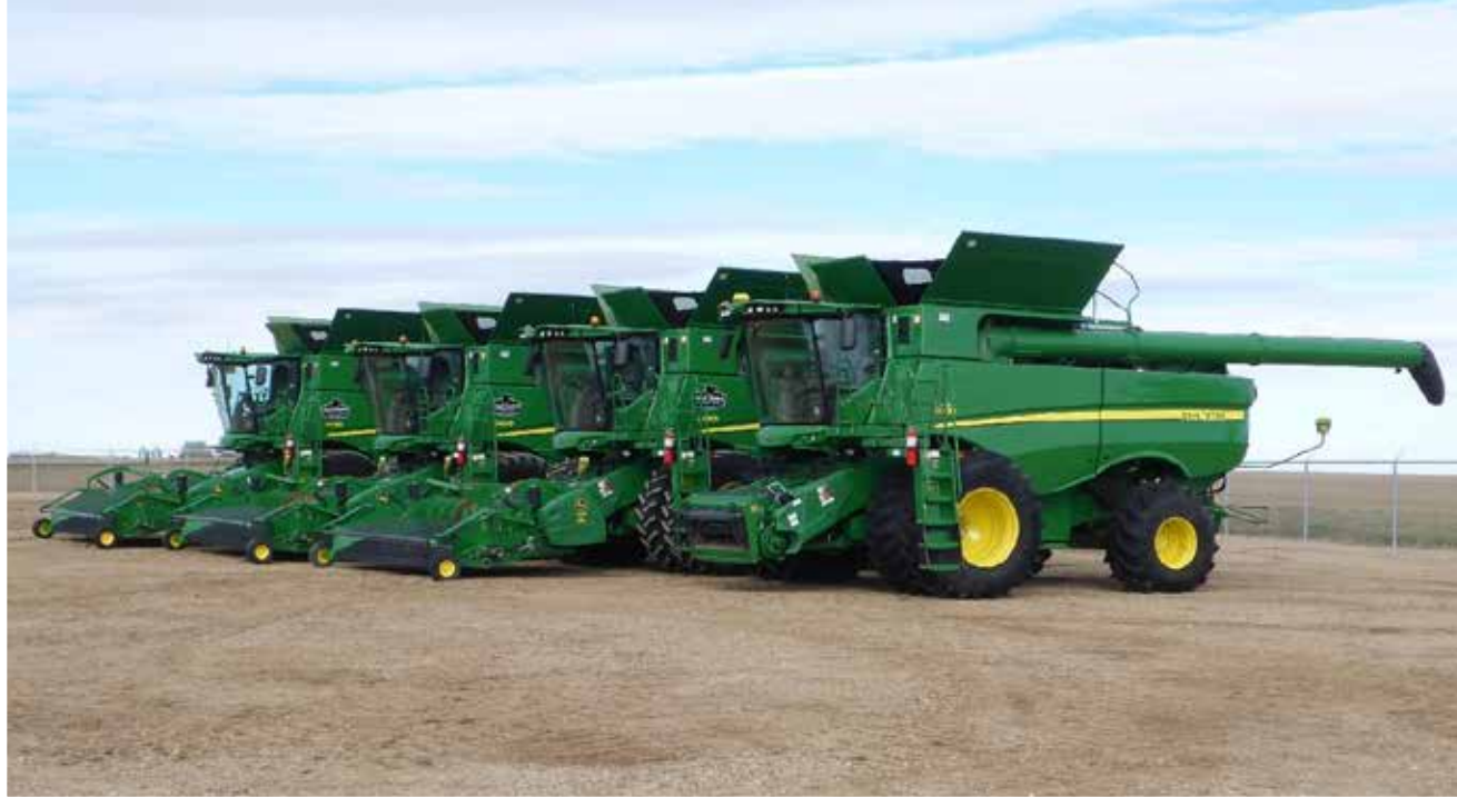
4— 2016 John Deere S690