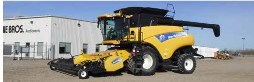
2011 New Holland CR9080