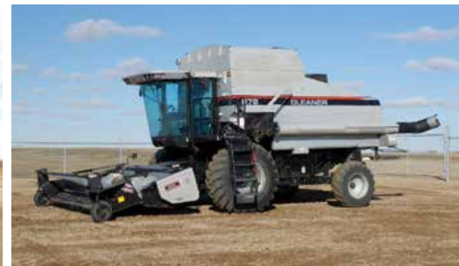
1998 Gleaner R72