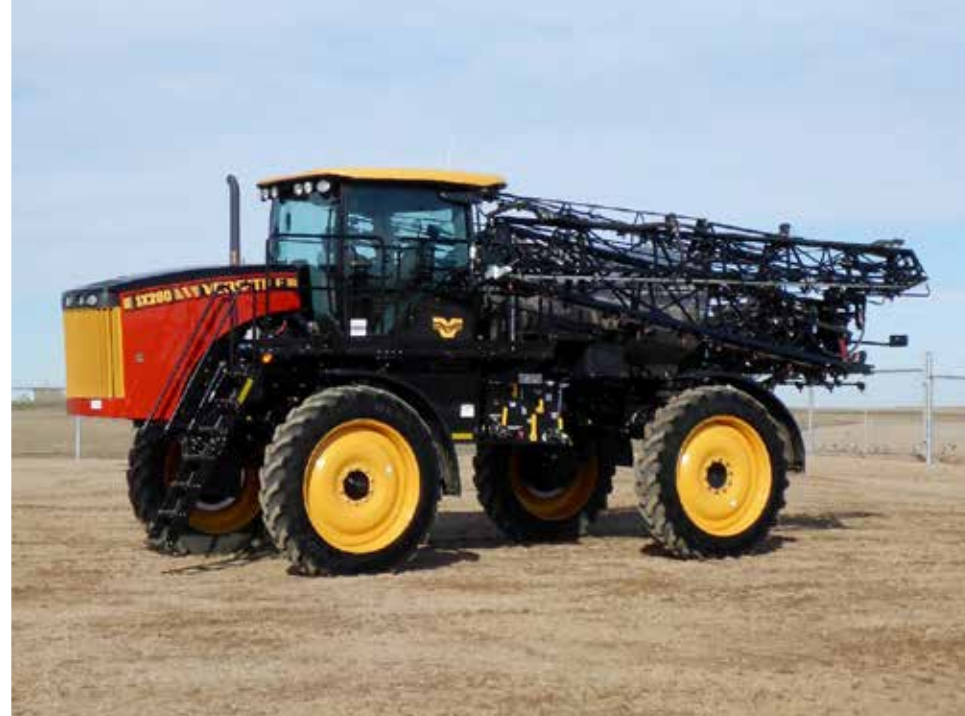
2017 Versatile SX280 120 Ft