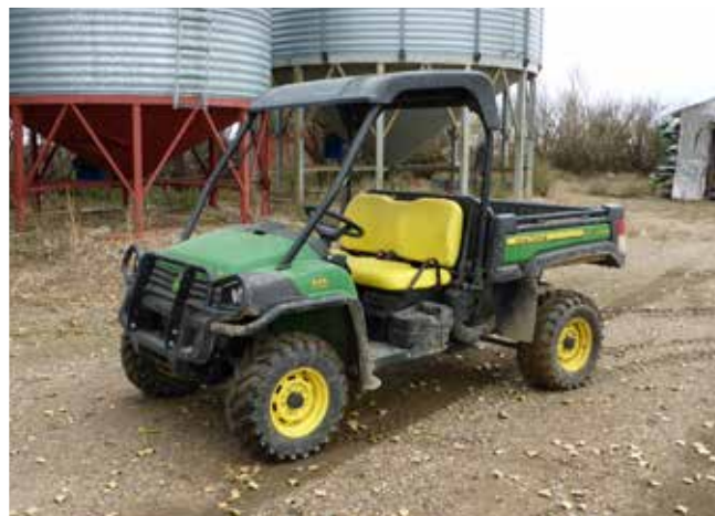
2014 John Deere XUV 825i 4x4