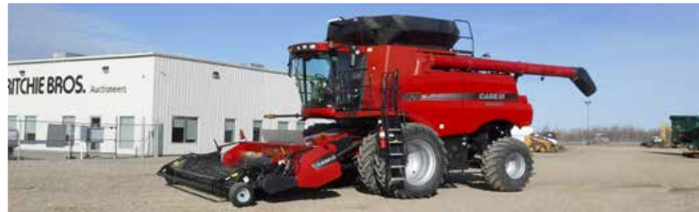
2010 Case IH 9120