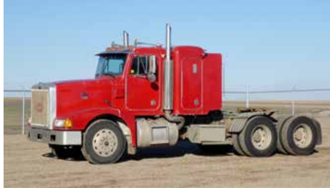
1988 Peterbilt 377