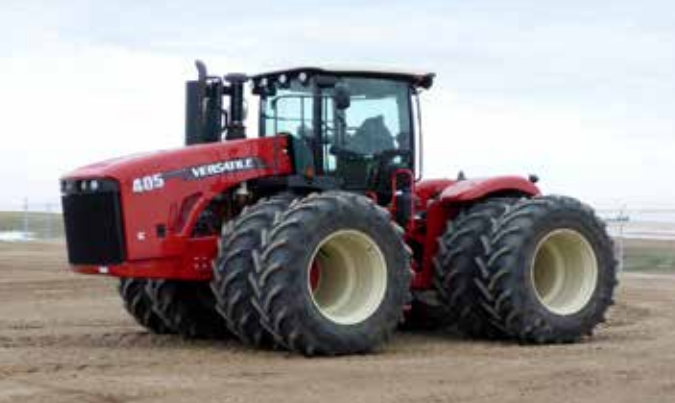
2014 Versatile 405