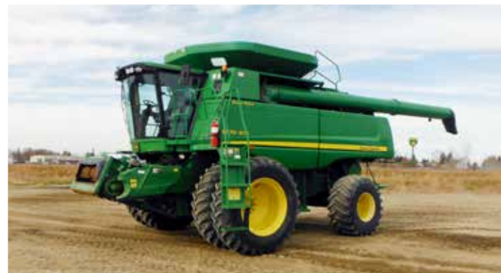
2010 John Deere 9870STS