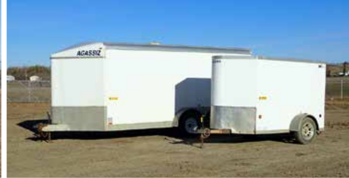
2012 Agassiz 16 Ft & 2013 Royal Cargo 8 Ft

- Custombuilt Oil Field Pipe Single Bale Livestock Feeder - HiQual 10 Ft x 12 Ft Maternity Pen - Lemsko Qty of 6 Panels - Mr. Squeeze Cattle Squeeze - 2000 Rem Delta BaleMax 3200 Bale Processor - Unused - Suihe Qty of 56 10 Ft Powder Coated Corral Panels - 5 - Unused - Suihe 20 Ft Bi-Parting Wrought Iron Gates - Thrifty Qty of 16 Ft Gates.