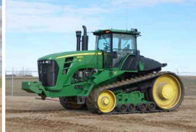
2010 John Deere 9630T