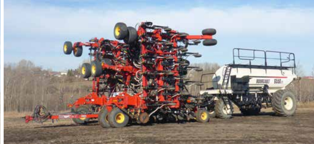
2012 Bourgault 3320PHD QDA 66 Ft w/6550ST