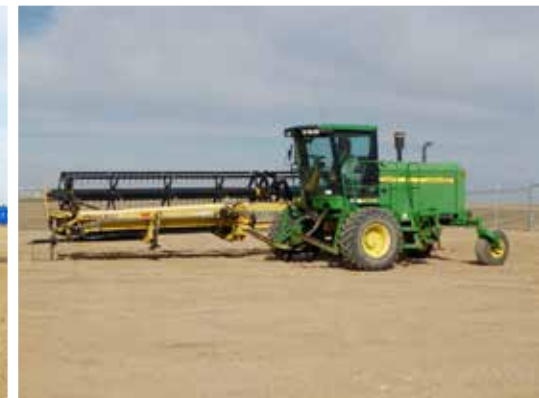
2008 John Deere 4895 36 Ft