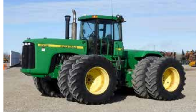
1997 John Deere 9200

All equipment displayed in this brochure is located in Canada. This auction will also include equipment located throughout North America.