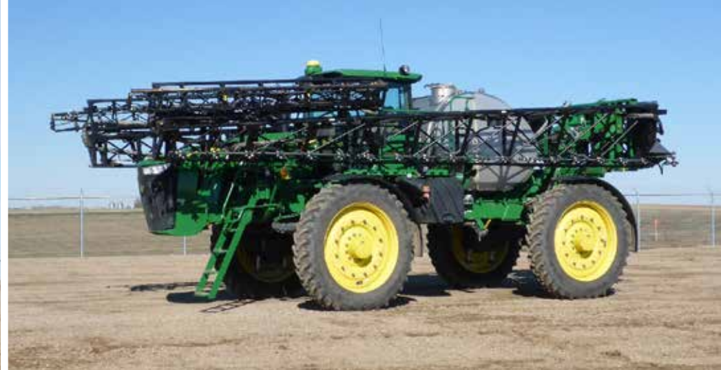
2012 John Deere 4940 120 Ft