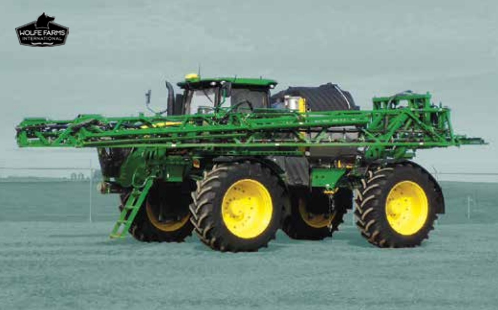
2017 John Deere R4045 120 Ft