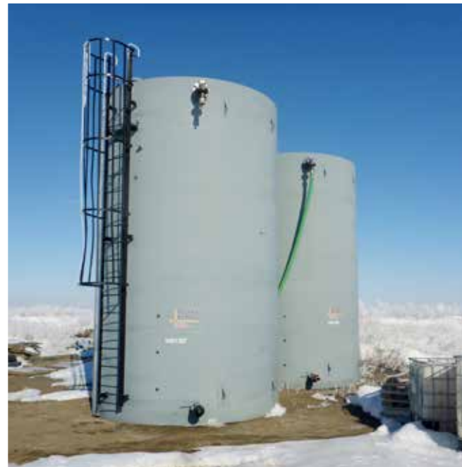
2— 2012 Palmer 400 Barrel Water Tanks