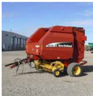
2007 New Holland BR780A