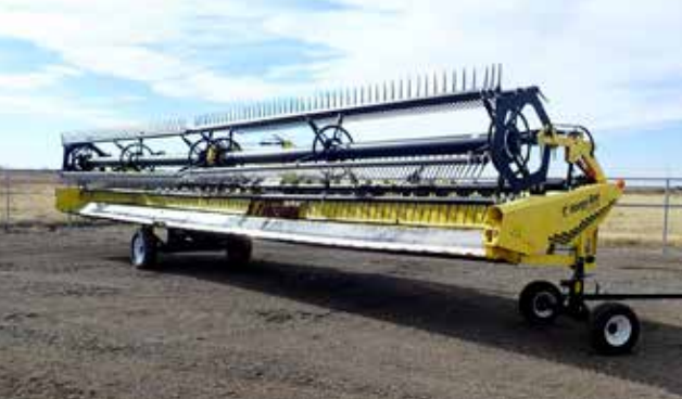
1 of 2— 2016 Honey Bee AF240 40 Ft