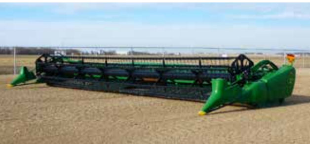
1 of 2— 2013 John Deere 635FD 35 Ft HydraFlex