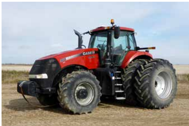
2014 Case IH Magnum 380