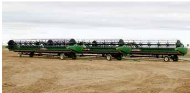
3— 2016 John Deere 645FD 45 Ft HydraFlex