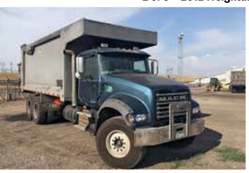
1 of 3 - Mack GU713 Granite