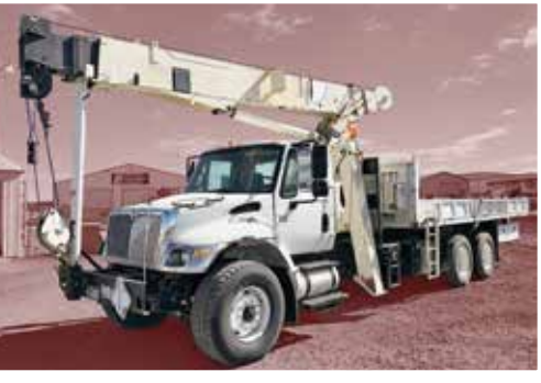
International 7500 w/National 20 Ton