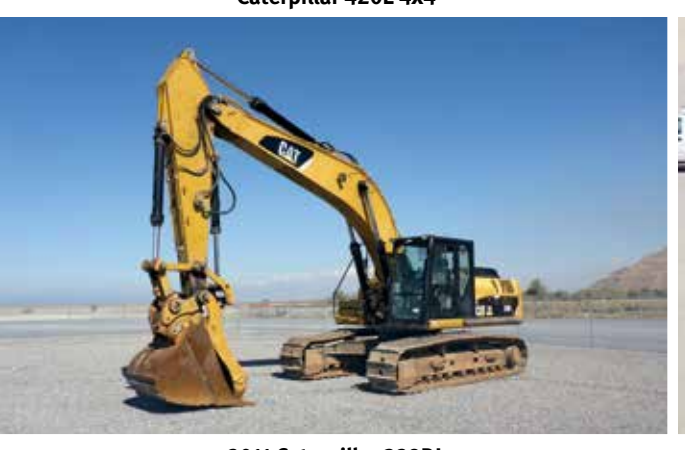
2011 Caterpillar 329DL