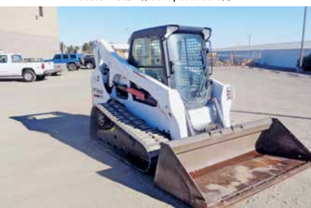
2013 Bobcat T750 2 Spd

See complete auction and equipment information on our website