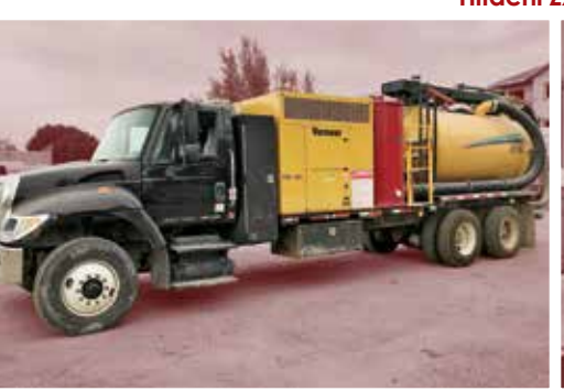
International 7400 w/Vermeer ATV1850