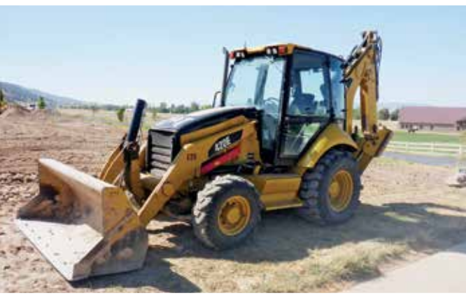
Caterpillar 420E 4x4