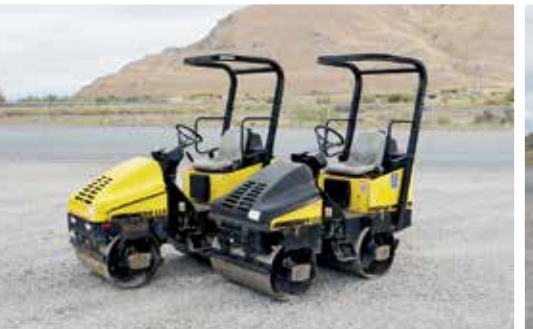
2 – Wacker RD11A