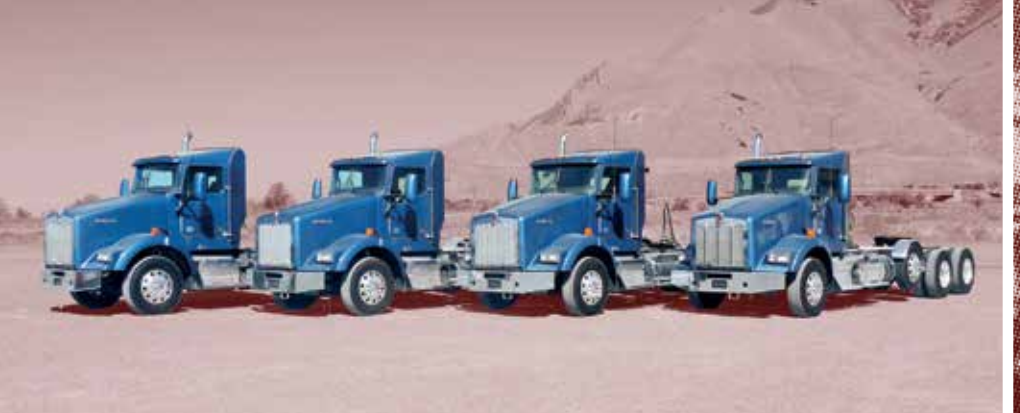
2 of 4 - 2015 & 2 of 4 - 2014 Kenworth T800