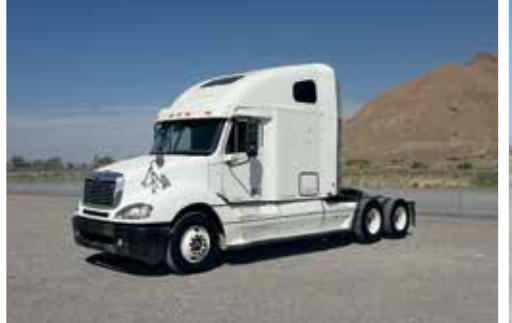
Freightliner CL120 Columbia