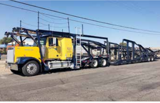
Western Star 4900 w/Cottrell C751