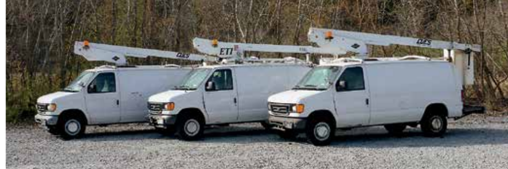
3 of 4 – Ford E350