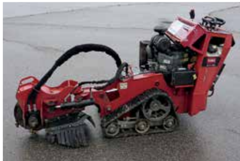
2014 Toro STX26