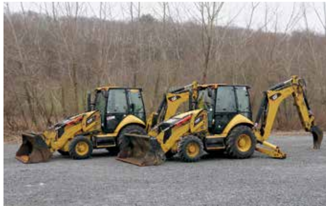
2014 & 2013 Caterpillar 430FIT 4x4