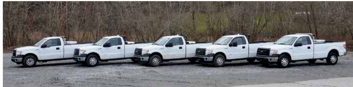
2 – 2014 & 3 of 4 – 2012 Ford F150 XL