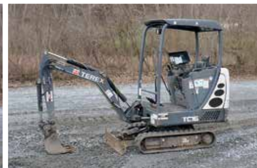
2013 Terex TC16