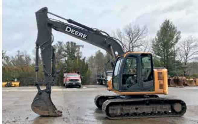
2012 John Deere 135D