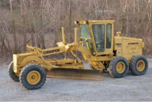
Champion 710A Series III