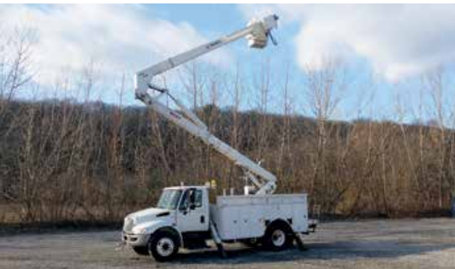
2012 International 4300SBA DuraStar w/Terex-Telelect Hi-Ranger HR50