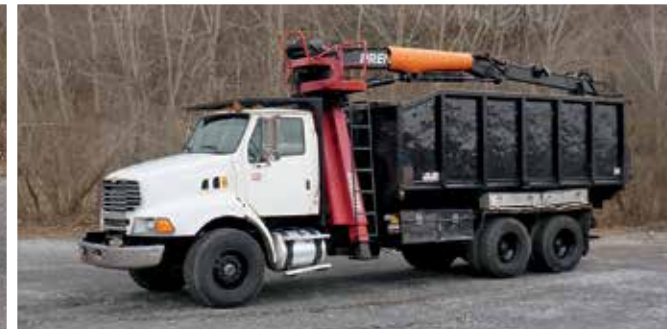
Sterling LT8500 w/Prentice 2124-BC 8523 Lb