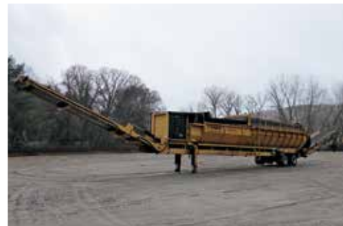
Wildcat 626 Cougar 6 x 26 Ft Trommel