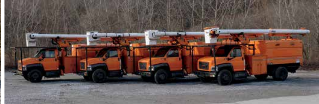
4 of 5 – GMC C7500 w/Altec LRV55