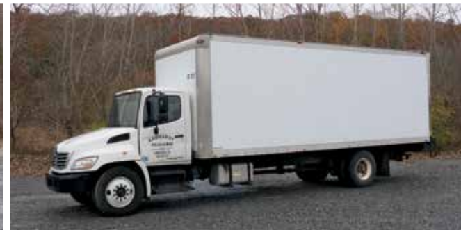
2010 Hino 338