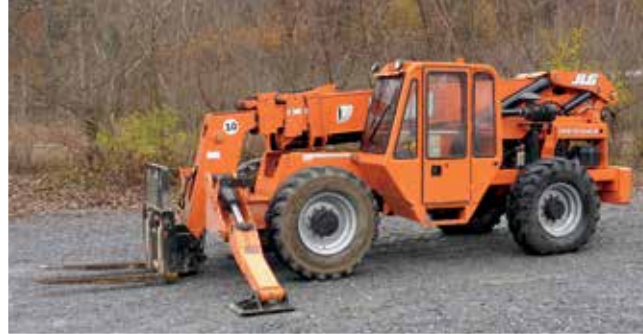
Lull 1044C54 Series II 10000 Lb 4x4x4