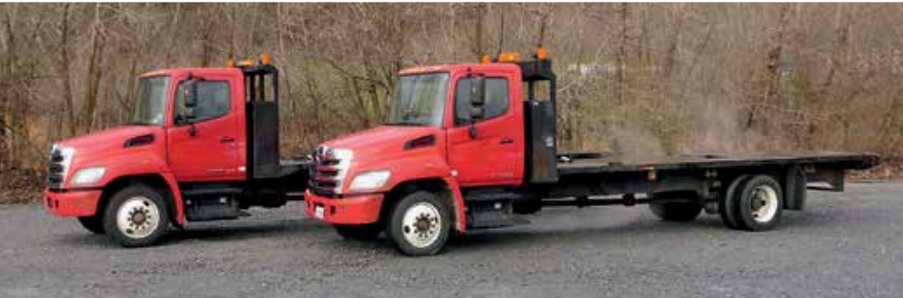
2014 & 2013 Hino 268