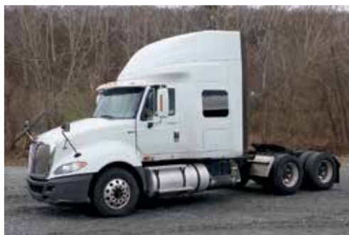
2012 International ProStar+