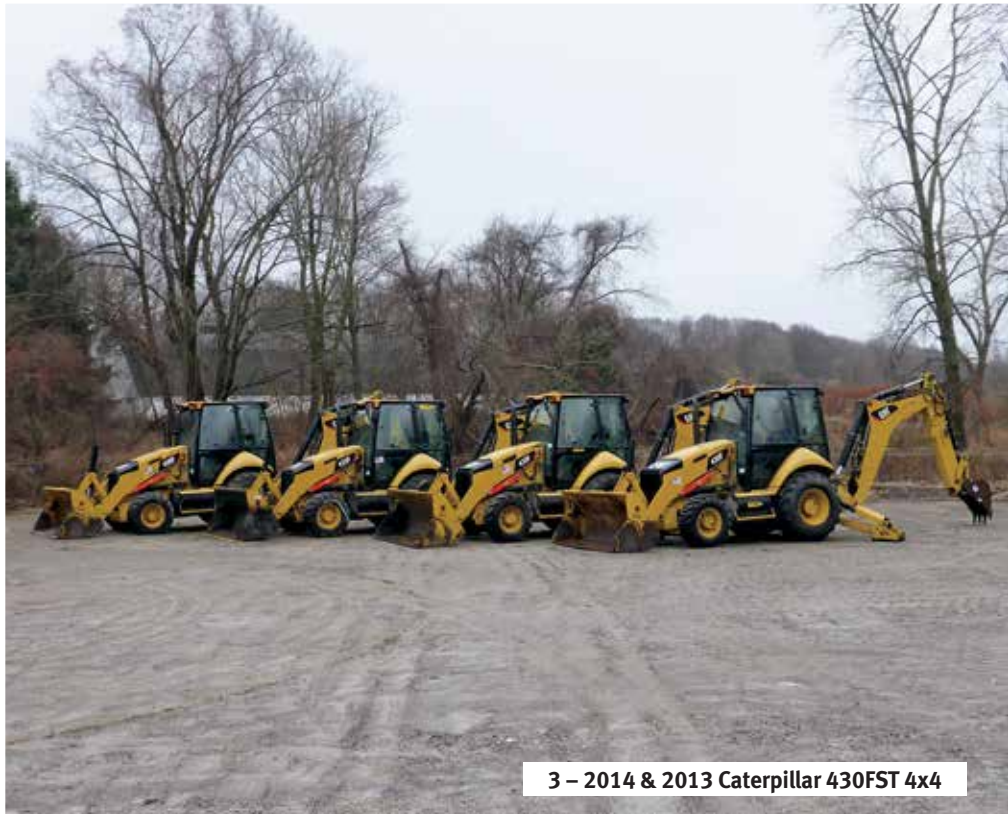
3 – 2014 & 2013 Caterpillar 430FST 4x4