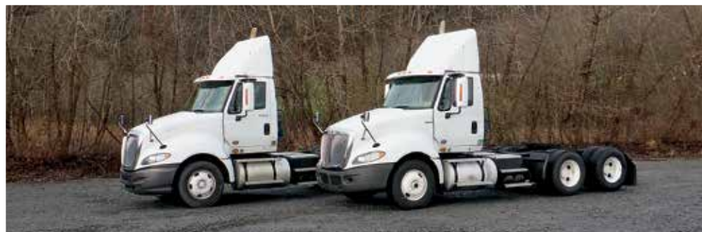
2 of 3 - 2011 International ProStar Premium