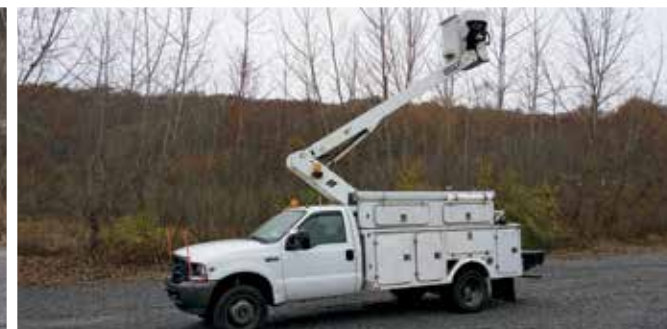
Ford F450 4x4 w/Versalift T3300N02