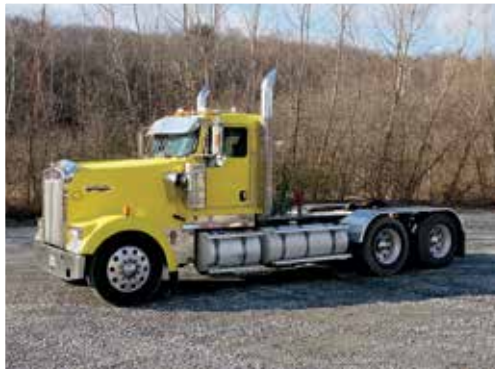
2009 Kenworth W900