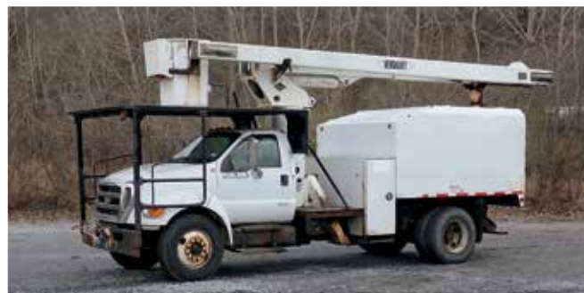
Ford F750 XL w/Versalift 56910