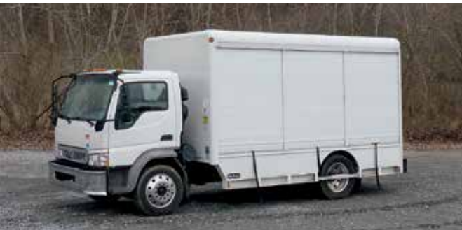
International CF600 Beverage