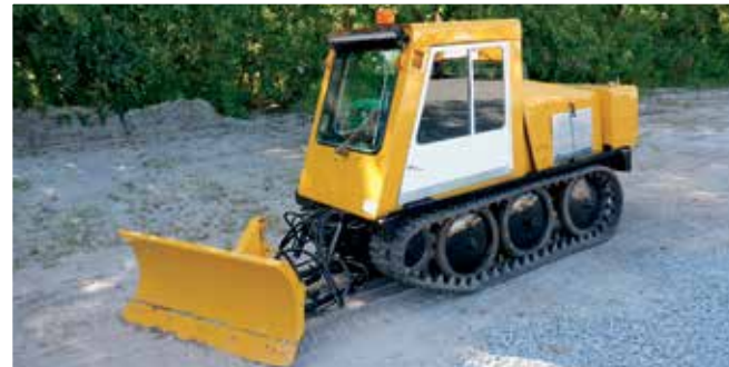
Bombardier SW48 Snow Cat