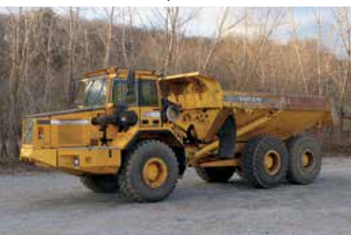
Volvo A30C 6x6