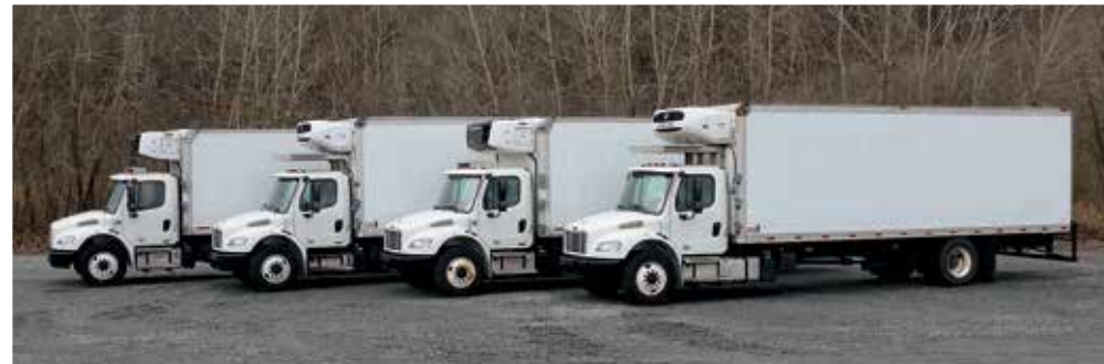
1 of 3 – 2013 & 3 – 2012 Freightliner M2 Business Class