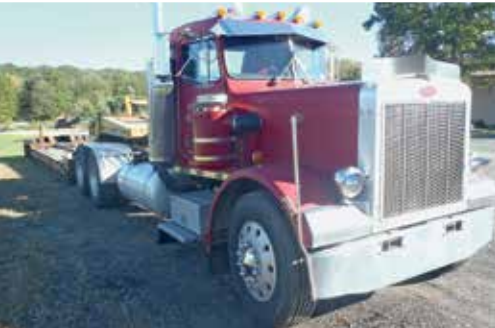
Peterbilt 359 & Trail King TK1000HDG