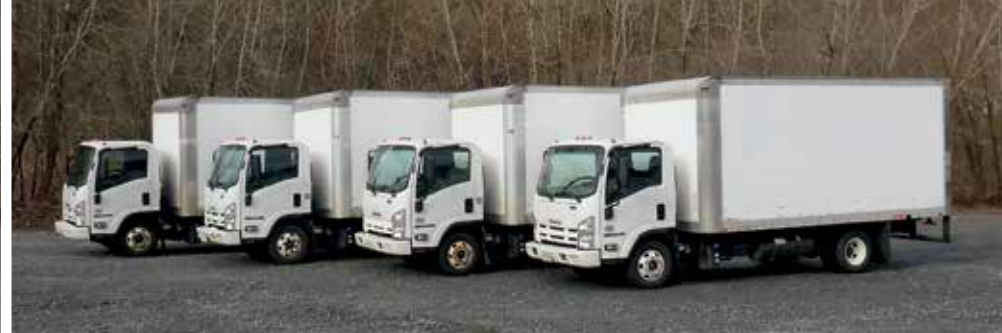
4 – 2013 Isuzu NPRHD