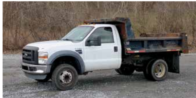
Ford F450 XL