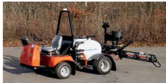
Unused - 2017 Smithco Spray Star 1008D