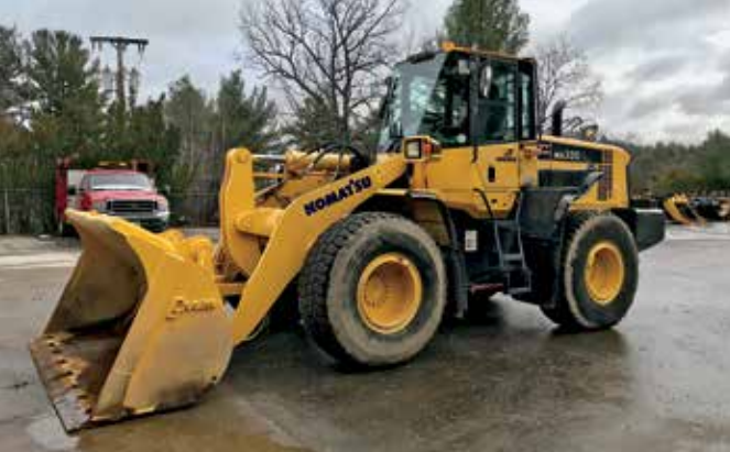
2009 Komatsu WA320-6