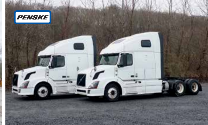
2 – 2012 Volvo VNL670