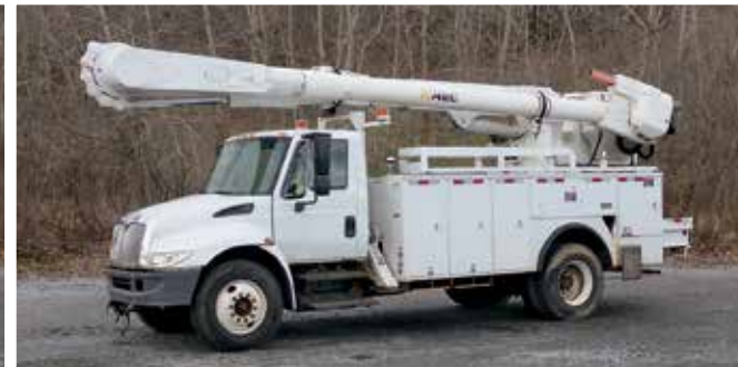
International 4300SBA w/Altec AM55