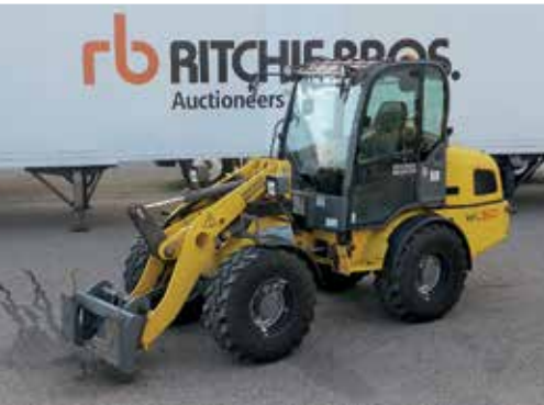
2012 Wacker Neuson WL50