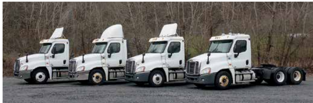
2 of 12 - 2012 & 2 of 3 - 2011 Freightliner Cascadia