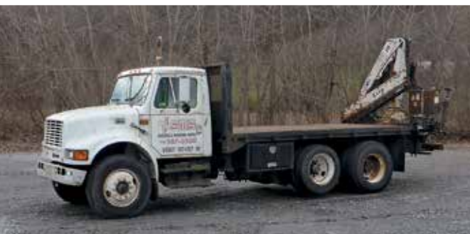
International 4900 w/PM 12021 12125 Lb