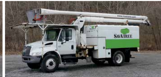
International 4300SBA w/Aerial Lift AL655351L4H