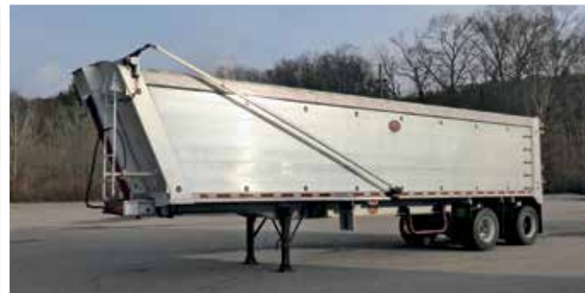
MAC 38 Ft Aluminum