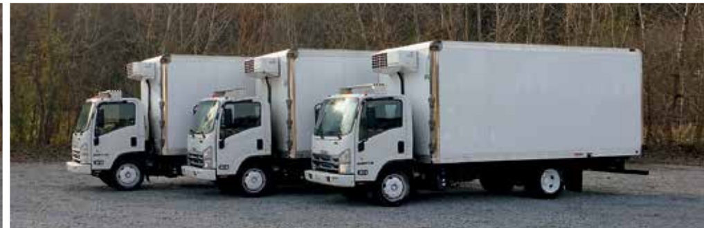
3 of 5 – 2015 Isuzu NQR