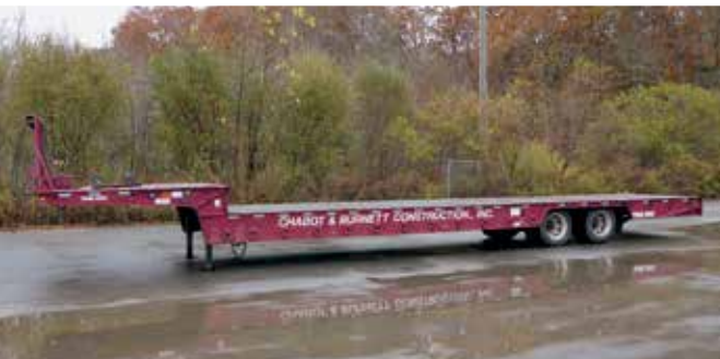
Trail King TK70HG482 35 Ton 48 Ft