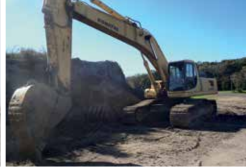
Komatsu PC400LC-6LK Avance