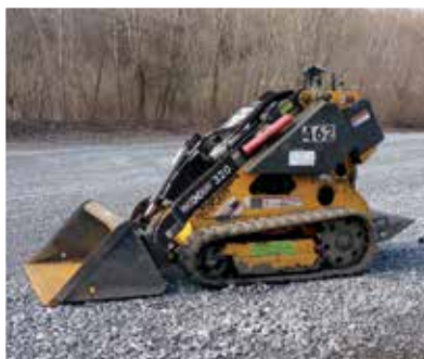
2013 Boxer 320