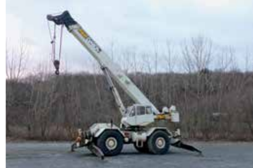
P & H Omega 35 35 Ton 4x4x4