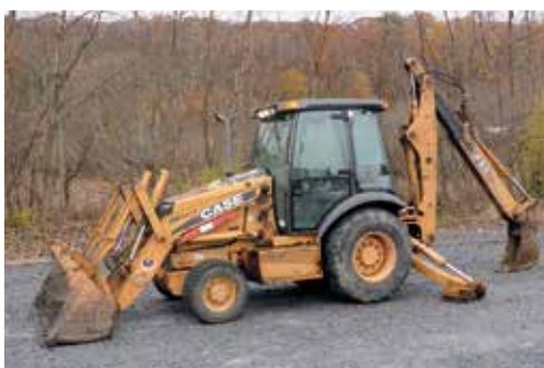
2010 Case 580SM Series 3 4x4