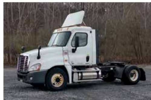
2012 Freightliner Cascadia