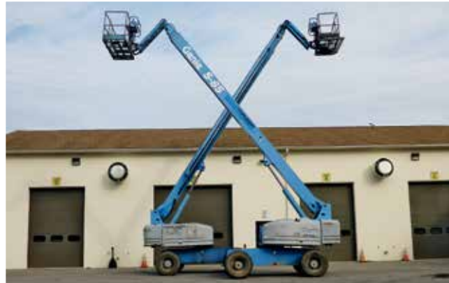
2 - Genie S85 4x4