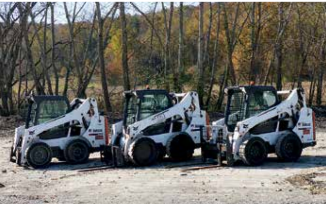
3 – 2015 Bobcat S570