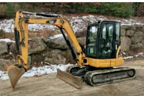
2011 Caterpillar 305DCR