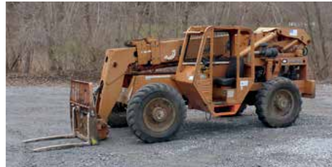
Lull 844C42 Highlander 8000 Lb 4x4x4