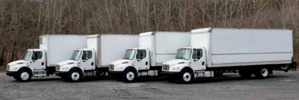
4 of 9 – 2012 Freightliner M2 Business Class