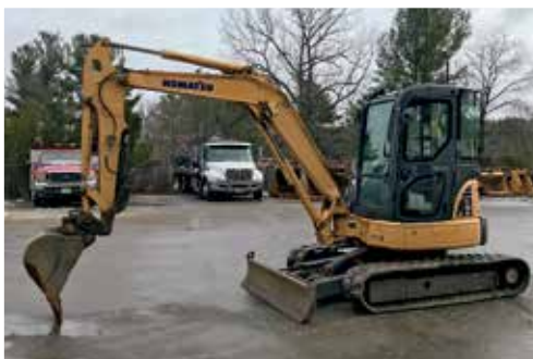
2009 Komatsu PC50MR-2 Galeo