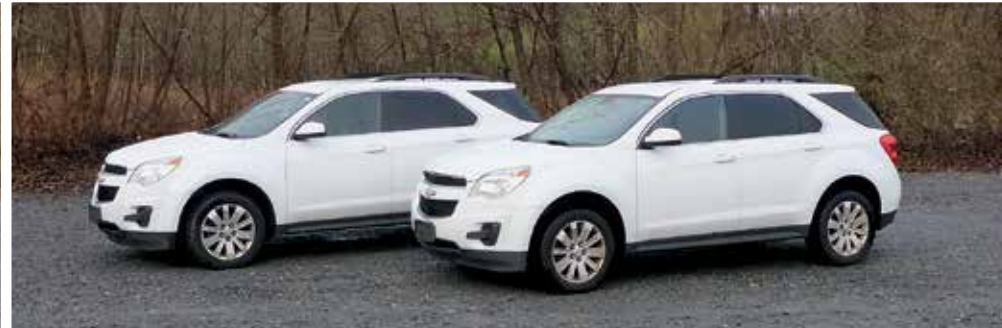
2 – 2011 Chevrolet Equinox LT AWD