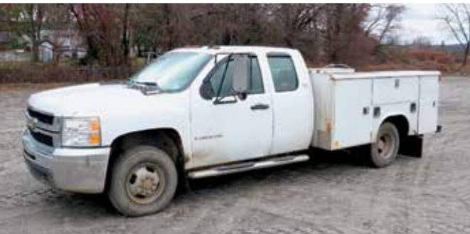
Chevrolet 3500HD 4x4