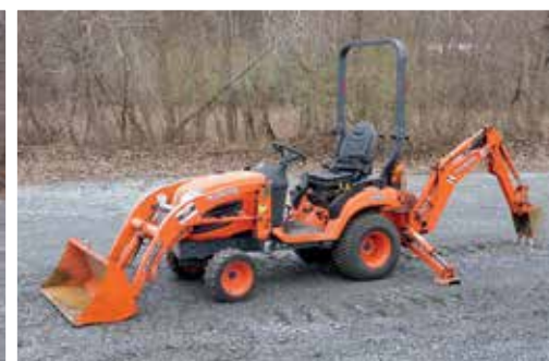
1 of 3 - 2013 Kubota BX25D 4x4