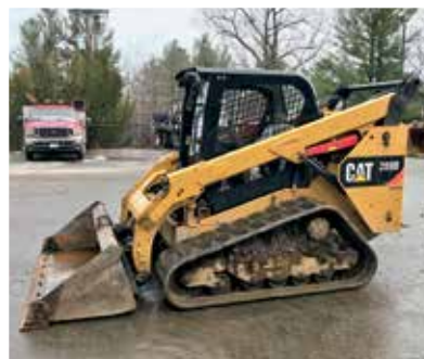
2015 Caterpillar 289D 2 Spd