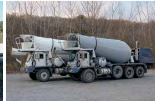
2 - Oshkosh S2346 8x6