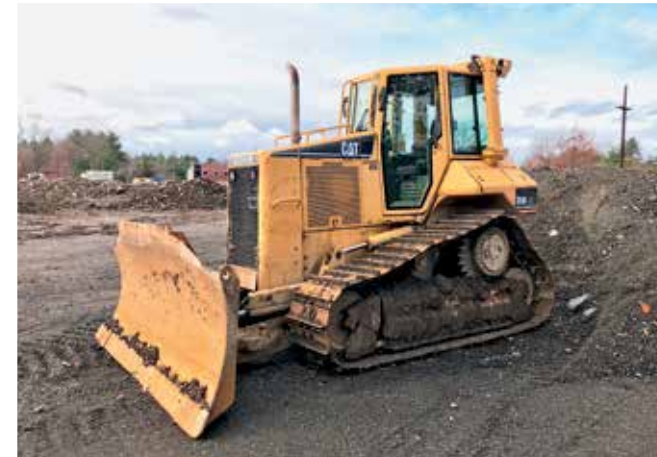
Caterpillar D5N XL