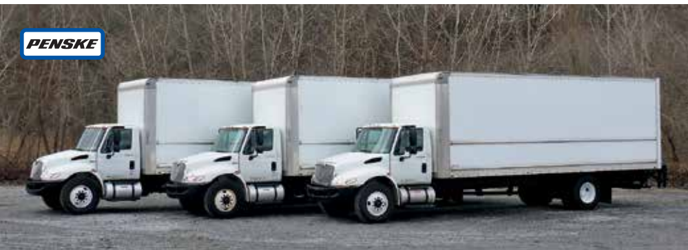
3 of 4 – 2014 International 4300SBA DuraStar