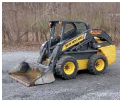
2013 New Holland L225 2 Spd