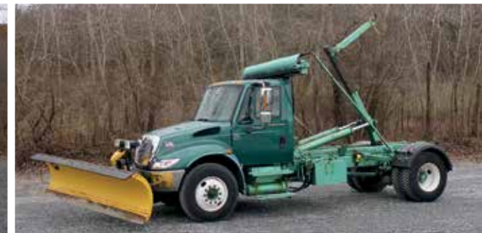
International 4300SBA w/American HA15012036