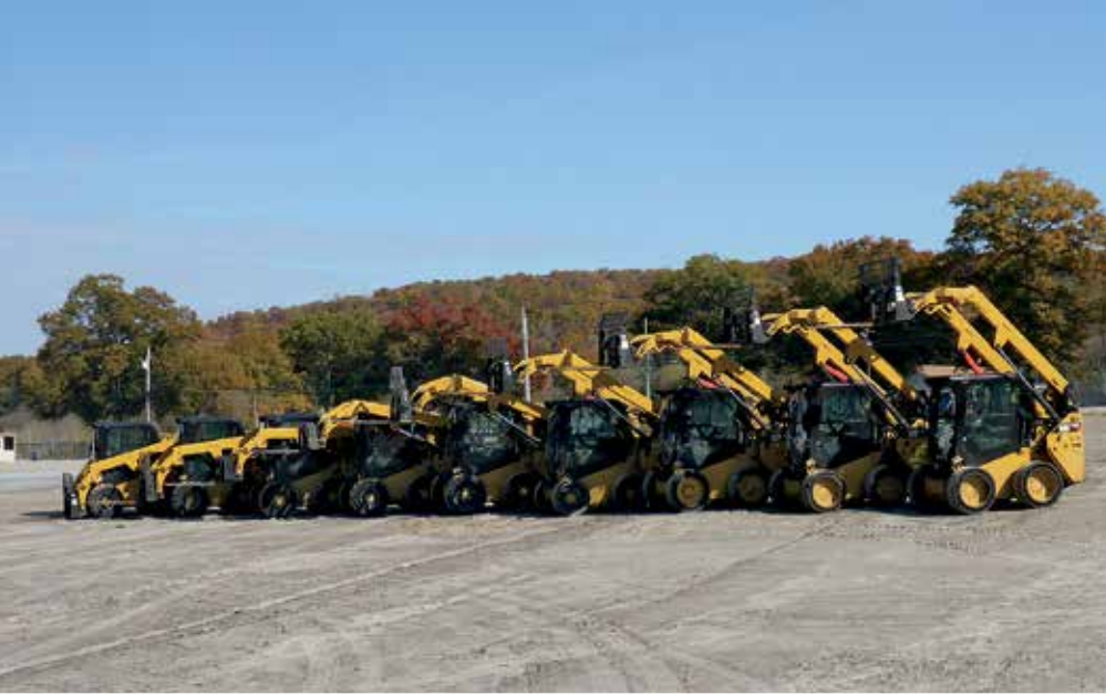
6 – 2016 & 3 – 2015 Caterpillar 232D