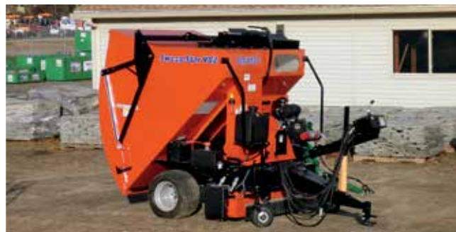
Unused - 2017 Smithco Sweep Star V62