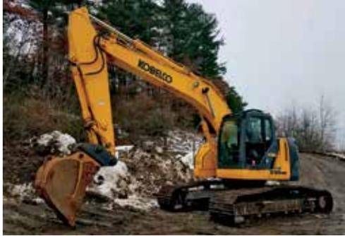
2010 Kobelco SK235SRLC-2 Acera