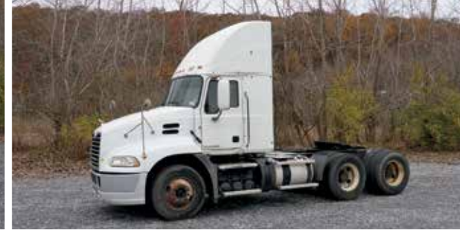
2011 Mack CXU613 Pinnacle