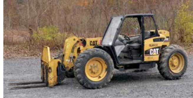
Caterpillar TH220B 7000 Lb 4x4x4