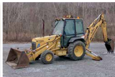
Ford-New Holland 675D 4x4