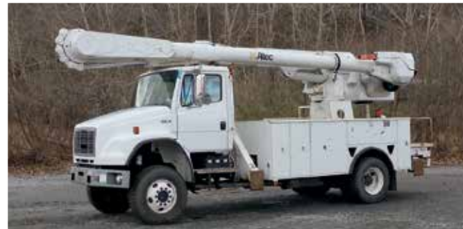
Freightliner FL80 4x4 w/Altec AM55