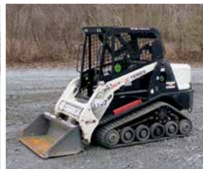
2011 Terex PT30