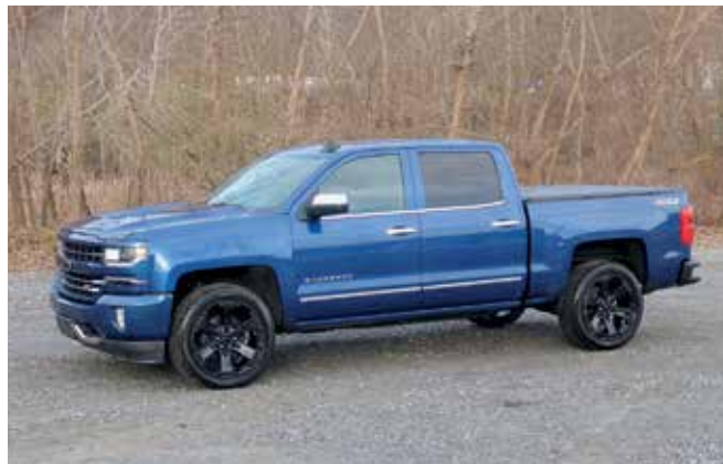
2016 Chevrolet 1500 Z71 4x4

See complete auction and equipment information on our website