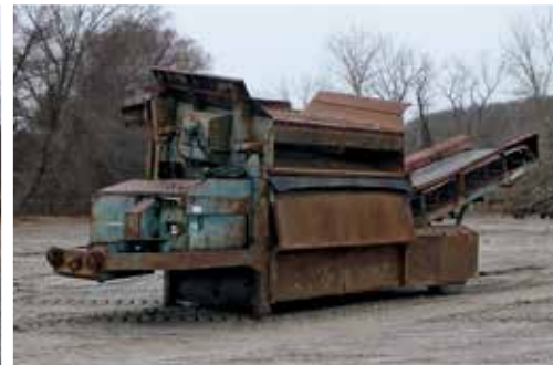
Powerscreen Powergrid 8 x 10 Ft 2 Deck