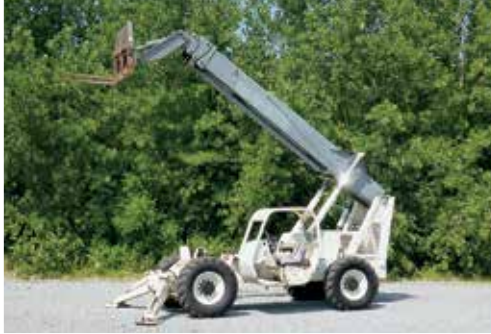
Terex TH1056C 10000 Lb 4x4