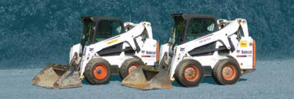
2 – 2012 Bobcat S650