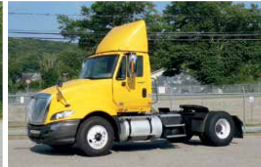
2011 International ProStar+