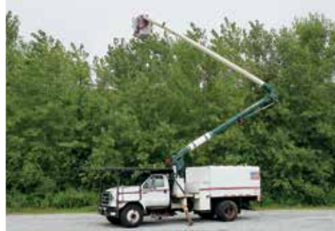
Ford F750 w/Aerial Lift 60/5051L4H