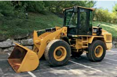
2013 Caterpillar 914G2