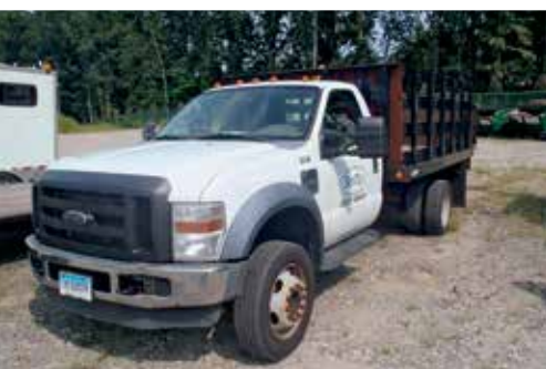
Ford F450 XL