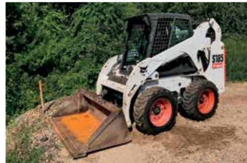
2011 Bobcat S185