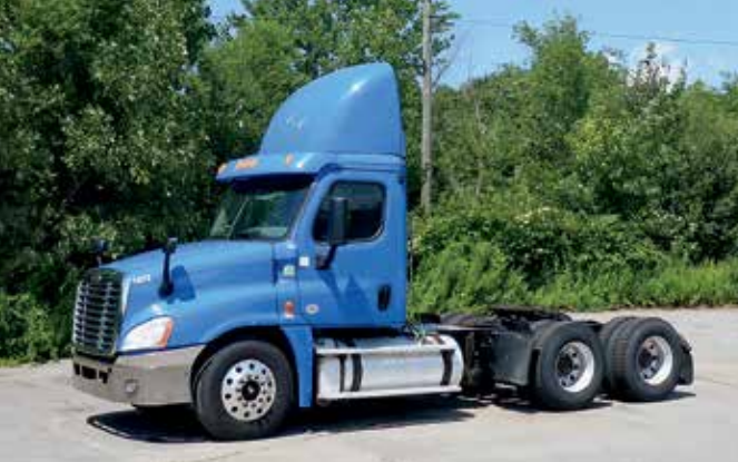
2013 Freightliner Cascadia