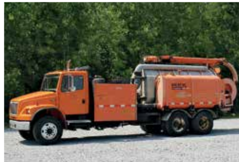
Freightliner FL80 w/Safe-Jet-Vac Clean Earth