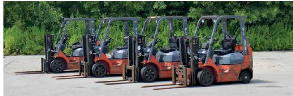
4 – Toyota 7FGCU20 3150 Lb