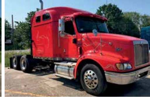
International 9400i Eagle