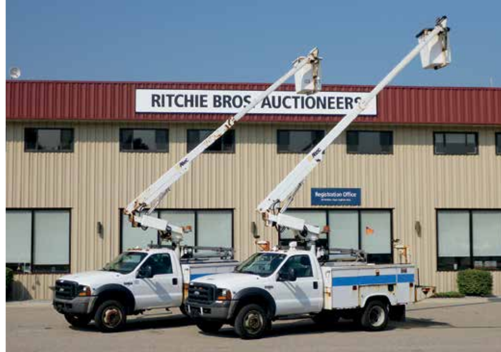
Ford F450 4x4 w/Altec AT200A & Ford F450 4x4 w/Altec AT200