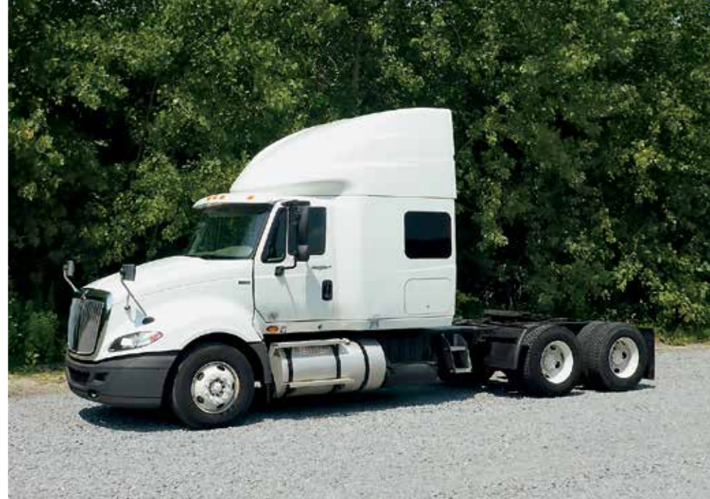
2012 International ProStar+