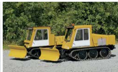
Bombardier SW48F Snow Cat & Bombardier SW48 Snow Cat