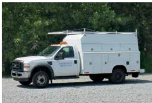
Ford F550 XL