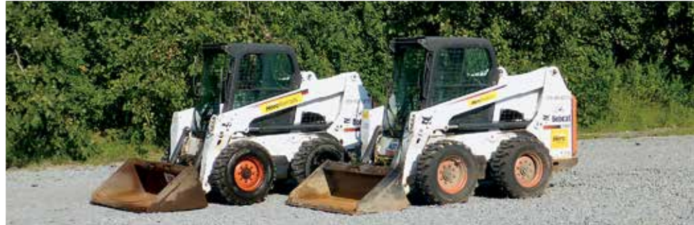
2 - 2011 Bobcat S630