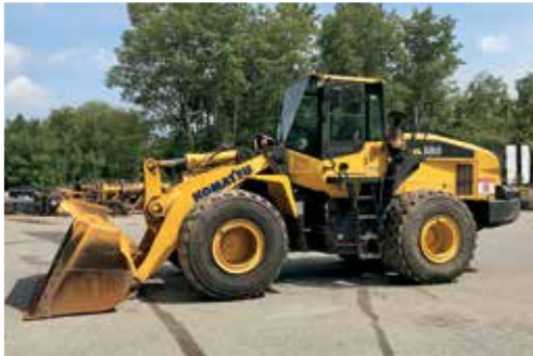
2013 Komatsu WA380-7