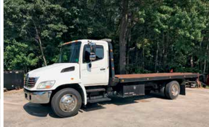
2009 Hino 268