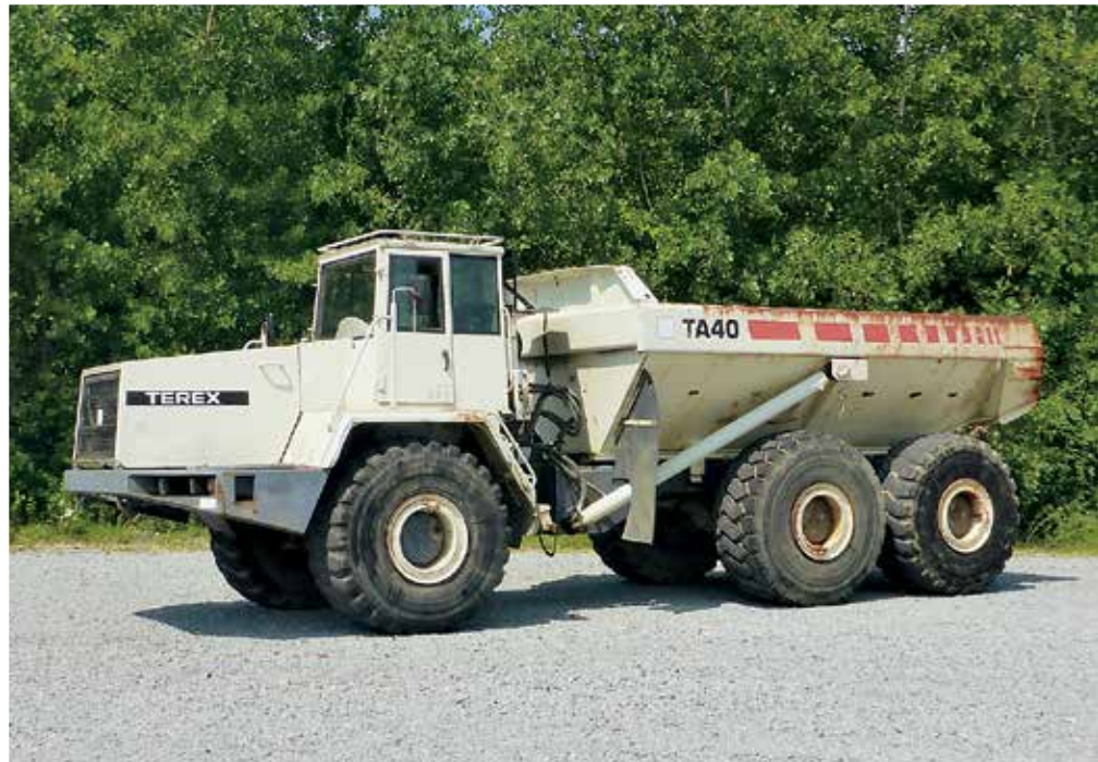
Terex TA40 6x6