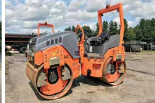
2010 Hamm HD14VV