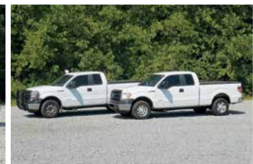
2 – 2013 Ford F150 XL