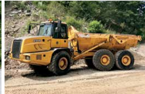
John Deere 250D 6x6