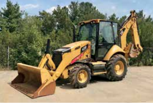
2012 Caterpillar 420FST 4x4