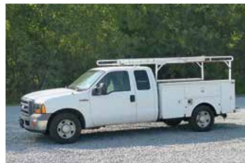
Ford F250 XL