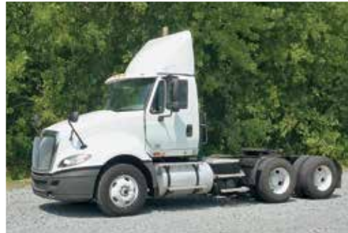
2012 International ProStar+