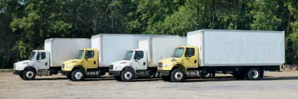
4 of 7 – 2013 Freightliner M2 Business Class