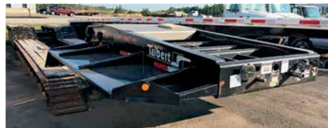
2012 Talbert T3DW50SAHRG1T1 51 Ton