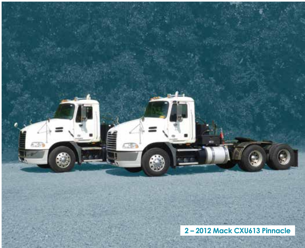
2 – 2012 Mack CXU613 Pinnacle