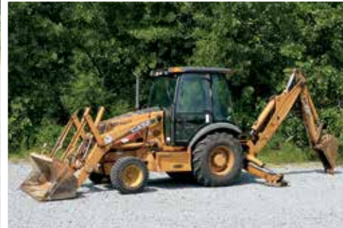
Case 580SM Series 2