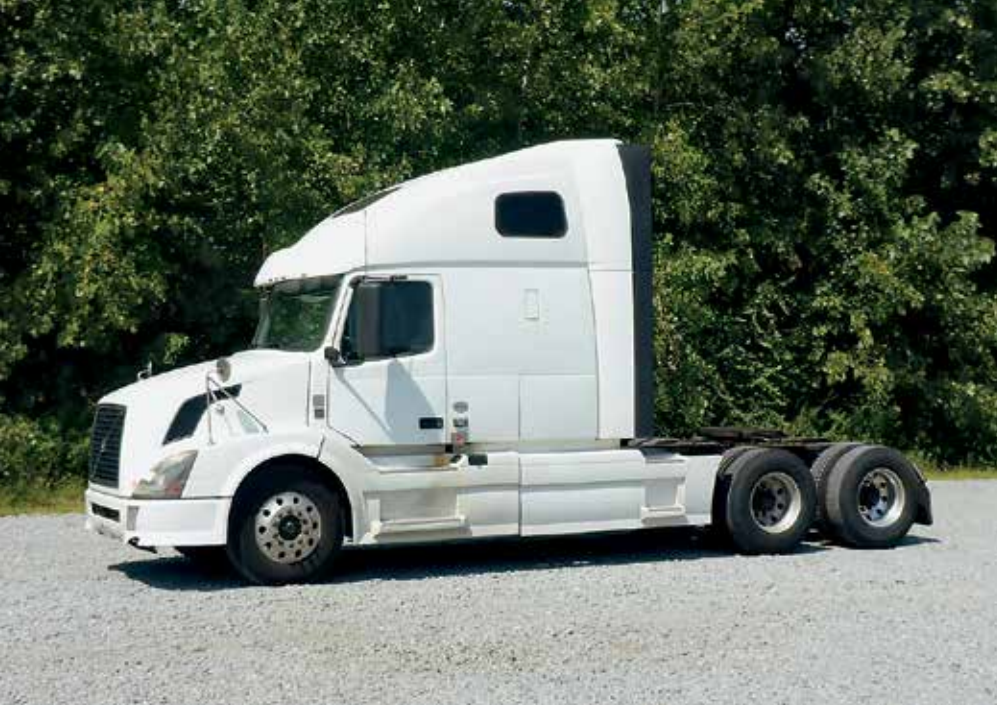
2012 Volvo VNL670