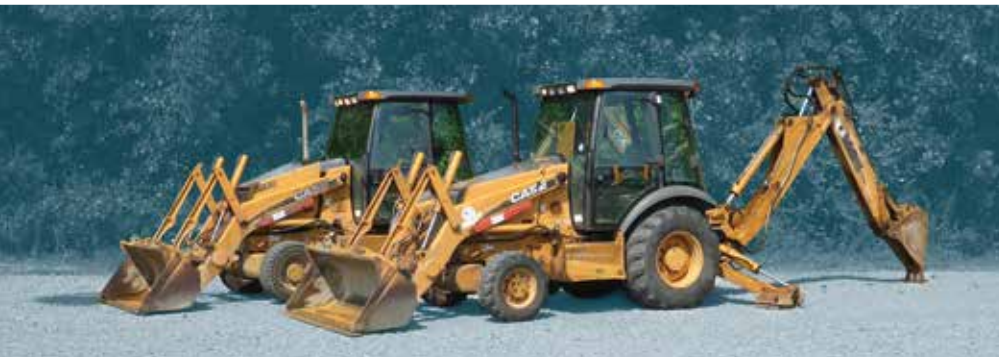
2 – Case 580M Series 2 4x4