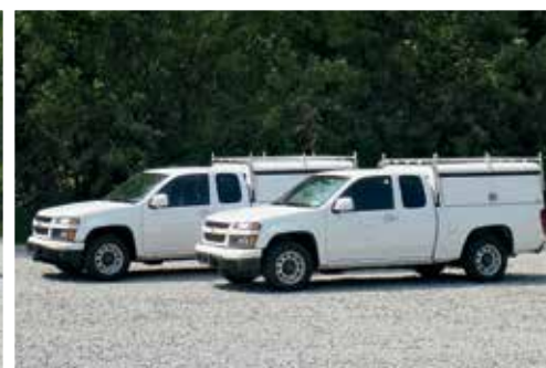
2 – 2012 Chevrolet Colorado