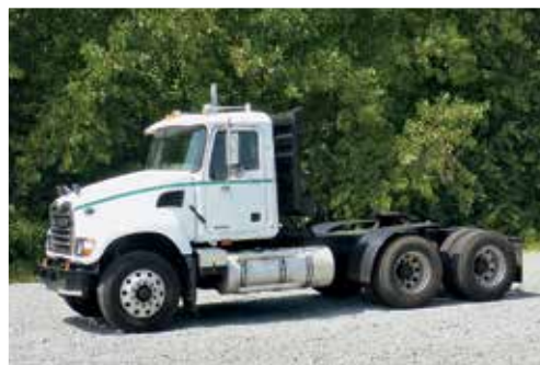
Mack CV713 Granite