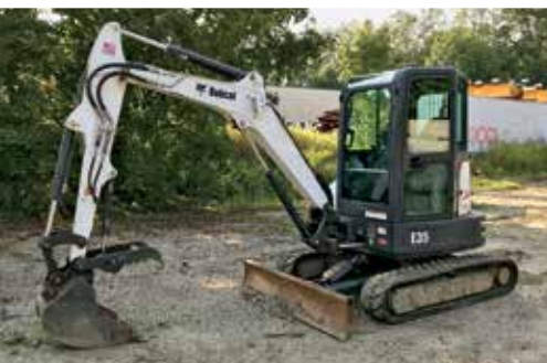
2014 Bobcat E35