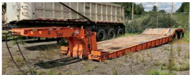
Trail King TK70HDG 35 Ton