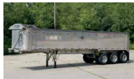
2017 Mac 29 Ft