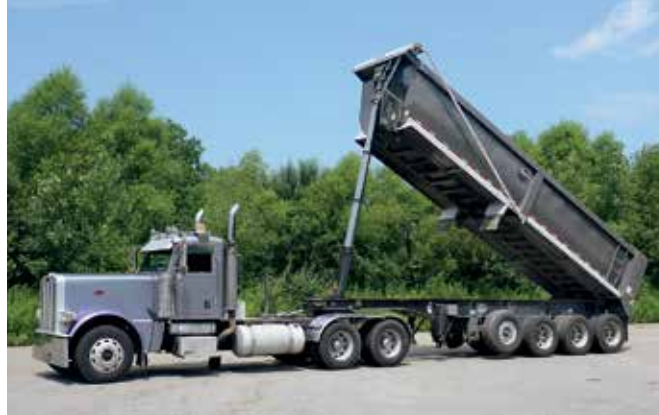
Peterbilt 389 & 2016 Mac 30 Ft