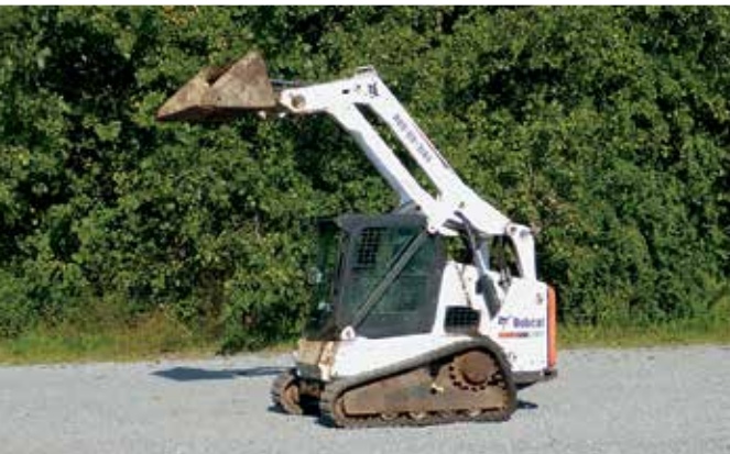
2013 Bobcat T650