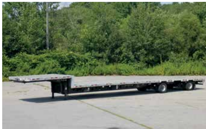
2016 Manac 13253C0B0 53 Ft

See complete auction and equipment information on our website rbauction.com