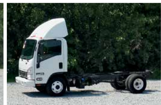
2011 Isuzu NPR