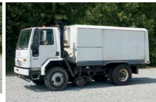
Sterling SC8000 w/Elgin GeoVac Series Y