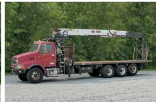
Sterling LT9500 w/IMT 2456K4 5000 Lb