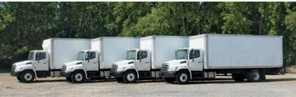
4 – 2012 Hino 268