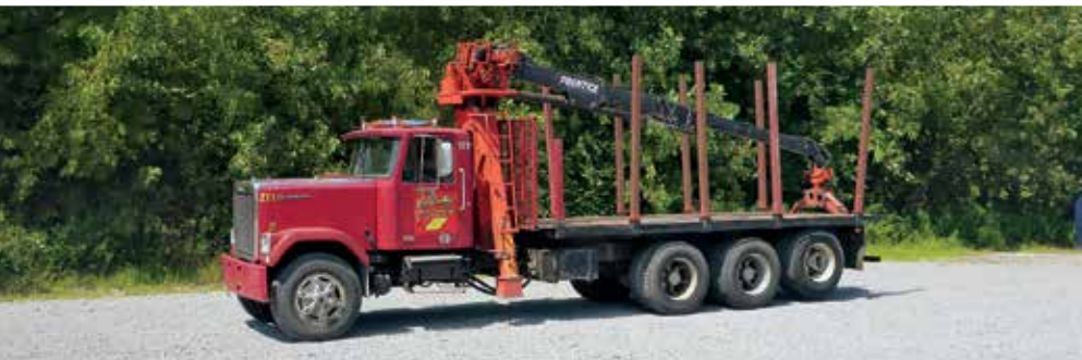
GMC General w/Prentice