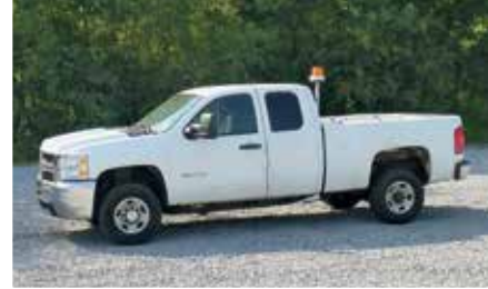
2010 Chevrolet 2500 4x4