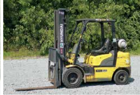
2012 Hyundai 30L-7A 2860 Lb