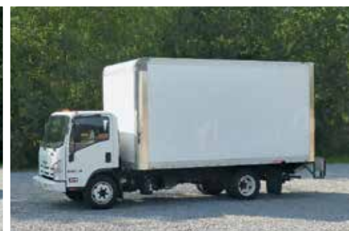
2014 Isuzu NQR