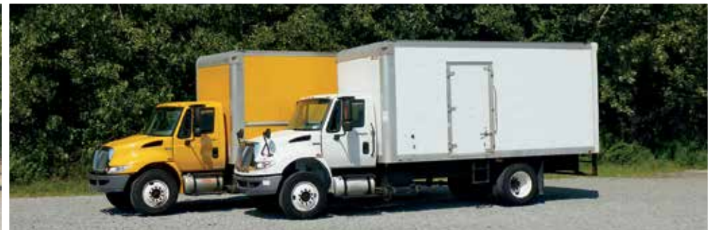
2 – 2012 International 4300SBA DuraStar