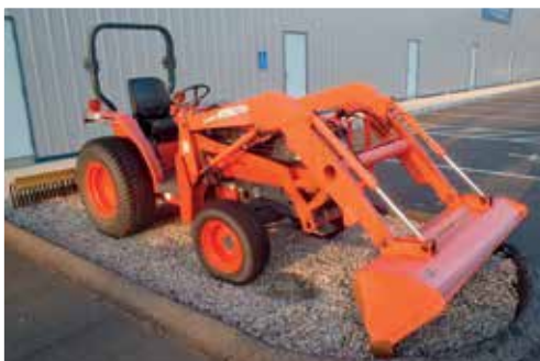
Kubota L3010D 4WD