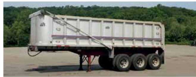
Benson 28 Ft