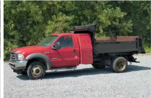
Ford F450 XL 4x4