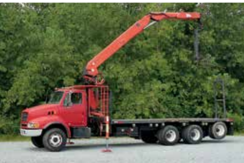
Ford LT9513 w/Fassi F230SE22 5291 Lb