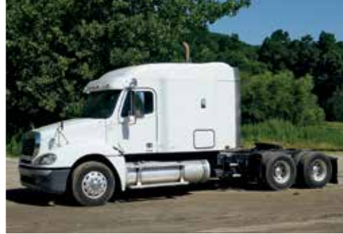
Freightliner Columbia Heritage Edition