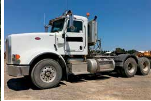
2011 Peterbilt 367