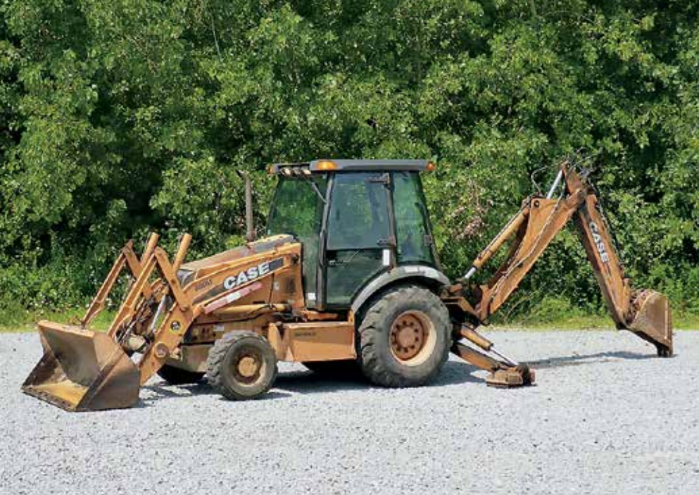
Case 580M Series 3 4x4