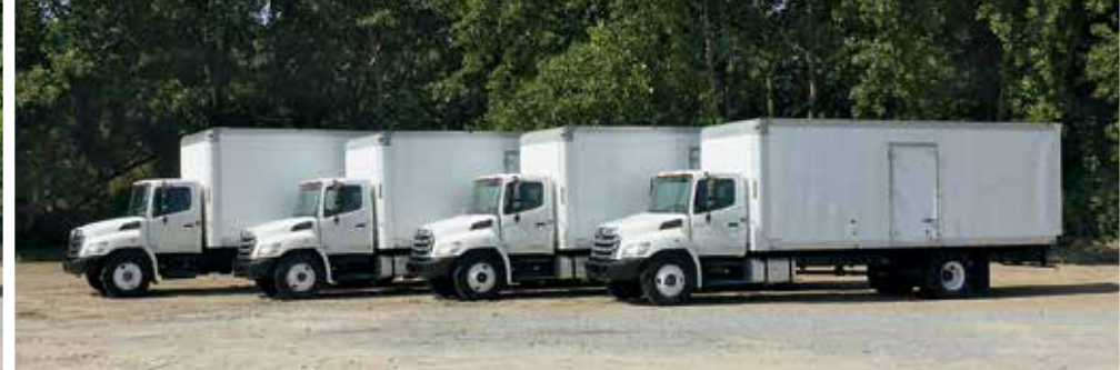
4 – 2012 Hino 338