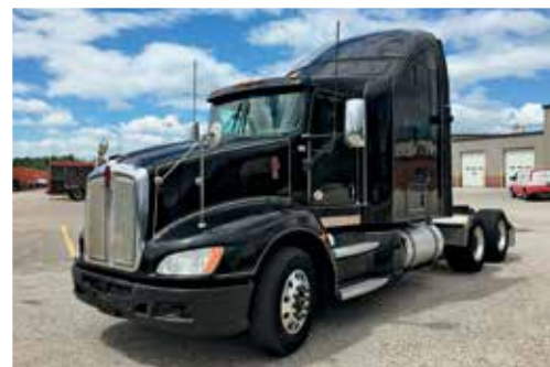
2012 Kenworth T660