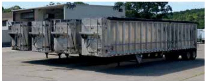
4 - 2016 East 48 Ft x 102 In. Walking Floor