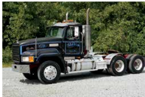
Mack CL613 Elite