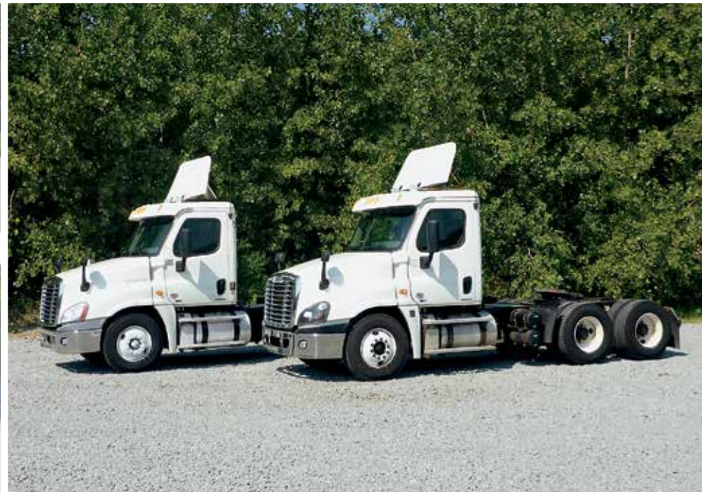
2 of 9 – 2012 Freightliner Cascadia