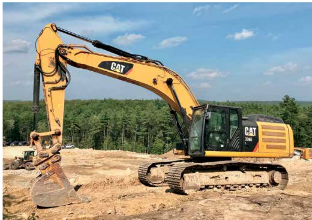
2011 Caterpillar 336EL