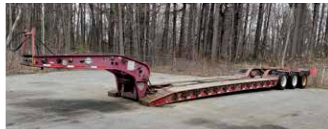
Fontaine TH55FLD 55 Ton