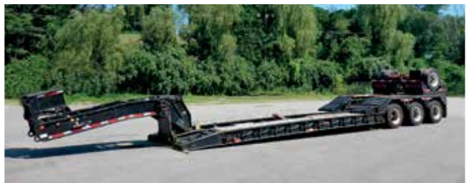
Loadstar 75 Ton