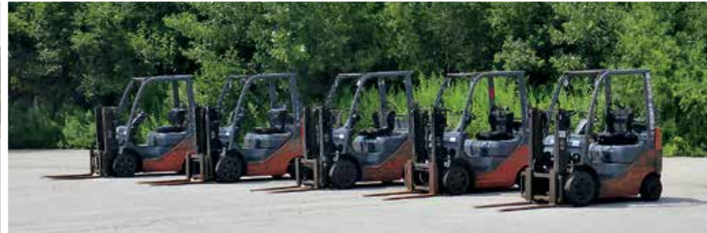
Toyota 8FGCU20 3400 Lb & 4 – Toyota 8FGCU20 3150 Lb