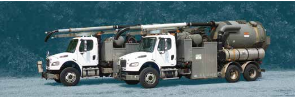
2 – 2009 Freightliner M2 Business Class w/Vactor 2110CB