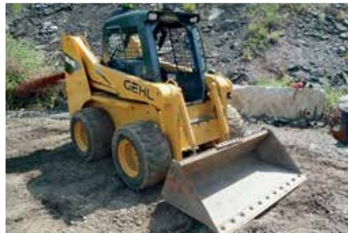
Gehl 6640 E Series 2 Spd