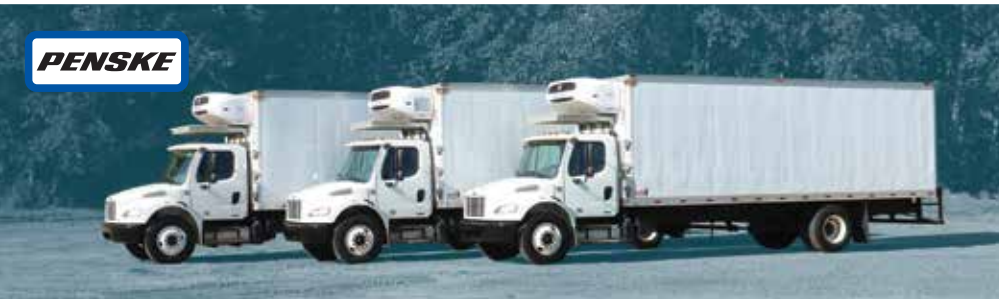
3 of 5 – 2012 Freightliner M2 Business Class