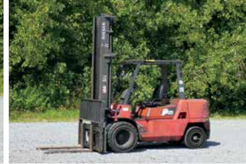
Nissan F04D45V 9400 Lb