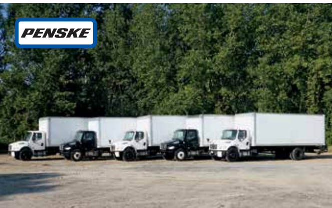
5 of 9 – 2012 Freightliner M2 Business Class