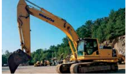
2011 Komatsu PC350LC-8