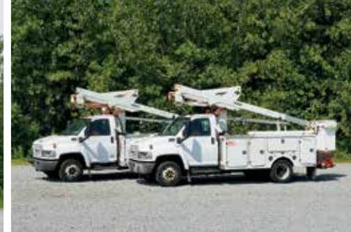
2 - GMC C4500 w/Versalift SST37NE