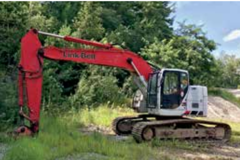
Link-Belt 225 Spin Ace