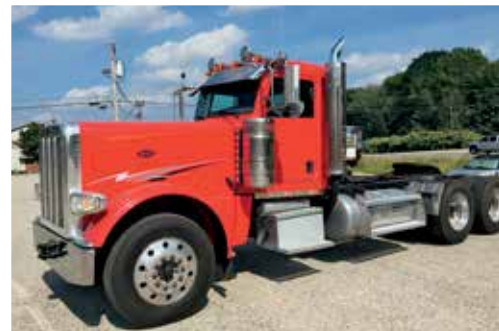
2012 Peterbilt 389