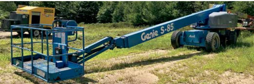
Genie S85 4x4