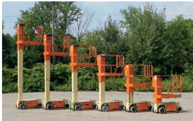
6 of 24 – 2010 JLG 1230ES