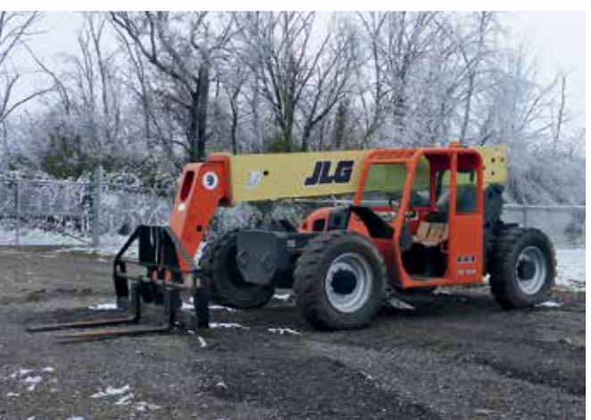
JLG G943A 9000 Lb 4x4x4 Manitou TMT320FLHT

For up-to-date listings visit rbauction.com