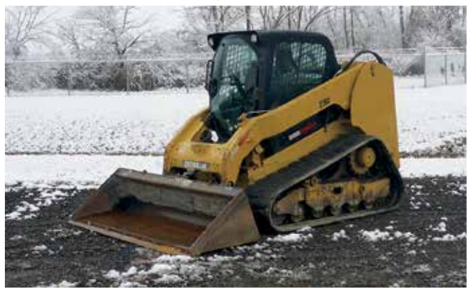
See complete auction and equipment information on our website