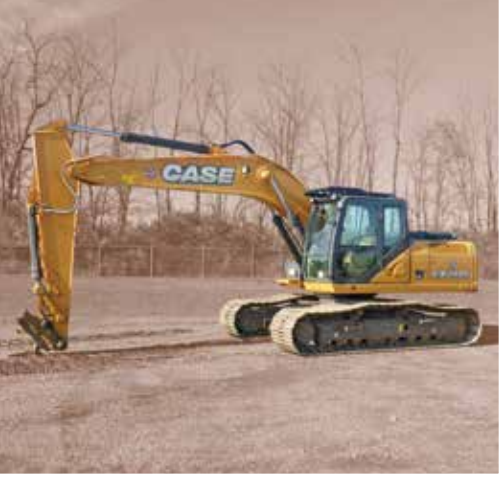
2014 Case CX210C