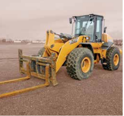
2013 Case 921F