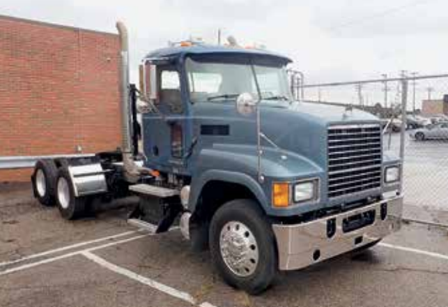
2014 Freightliner PX125042ST Mack CX613 Vision 2009 Mack CHU613