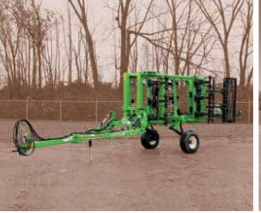
2016 Mandako MT1230 Twister 12 Ft