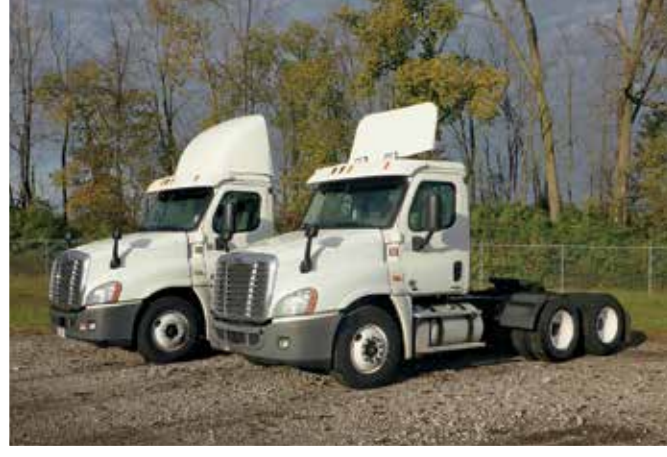
Caterpillar 430D 4x4 2 – 2012 John Deere 310SJ 4x4 2 of 27 – Freightliner PX125064ST