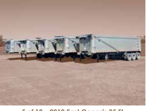
5 of 19 – 2012 East Genesis 35 Ft