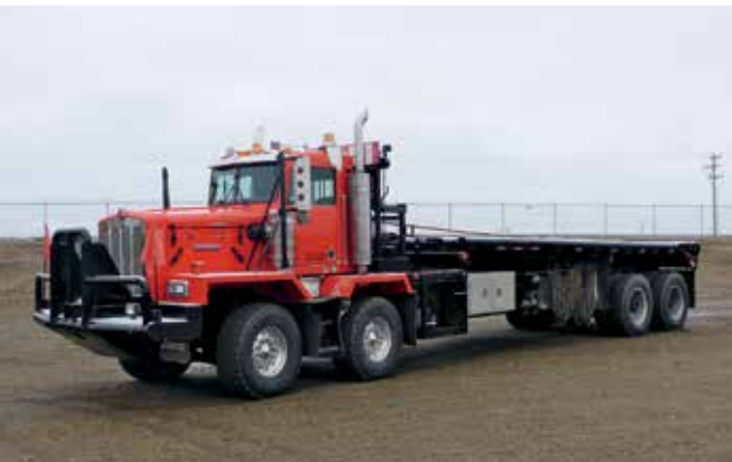
Kenworth C500 234 In.