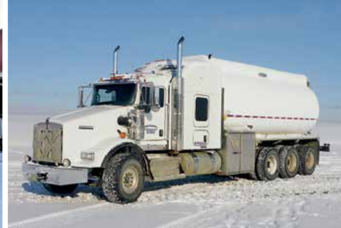
2012 Kenworth T800