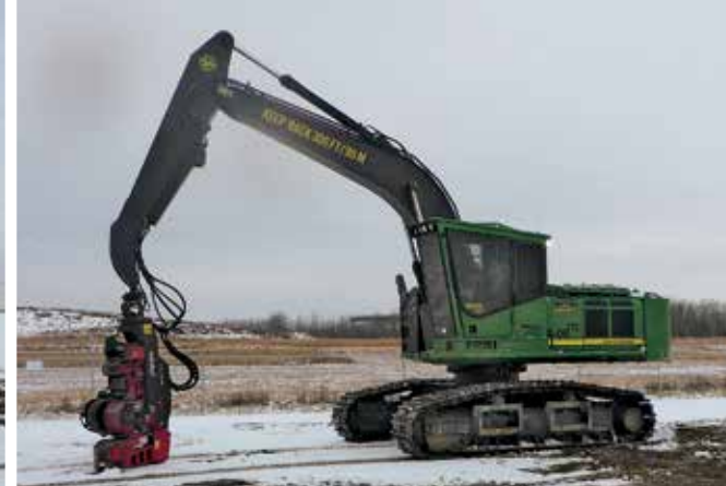
2011 John Deere 2454G w/Waratah 623C