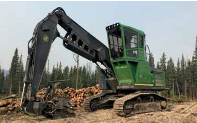
2017 John Deere 2656G LC