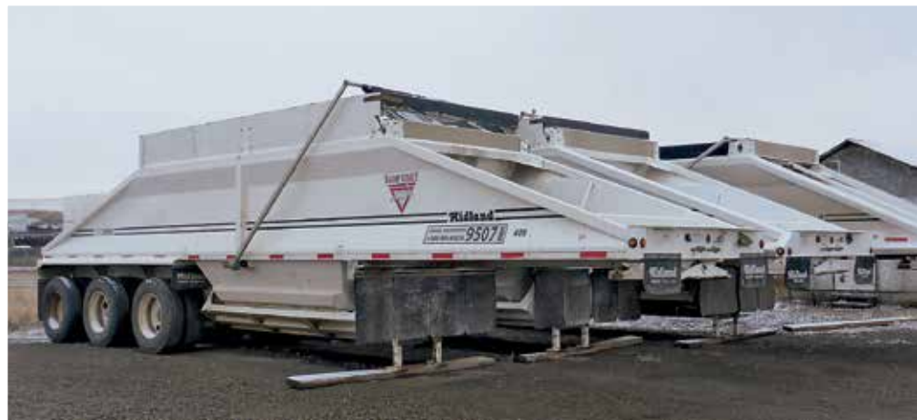
2 – 2013 Midland 38 Ft