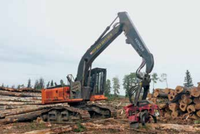
2015 Hitachi ZX210F-3 w/Waratah 622C