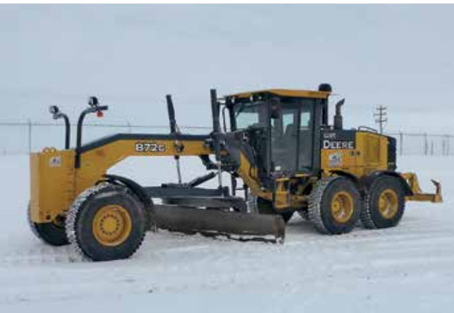
2010 John Deere 872G AWD