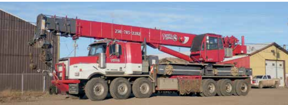
2013 Western Star 4900SA w/Terex 60 Ton