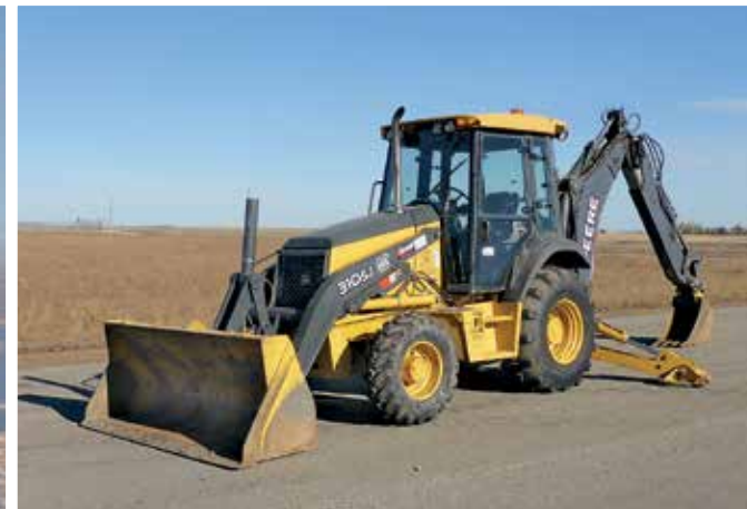
John Deere 310SJ