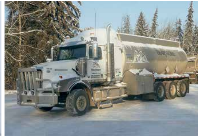
2014 Western Star 4900EX 21577 Litre