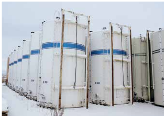
Large Qty of 400 BBL