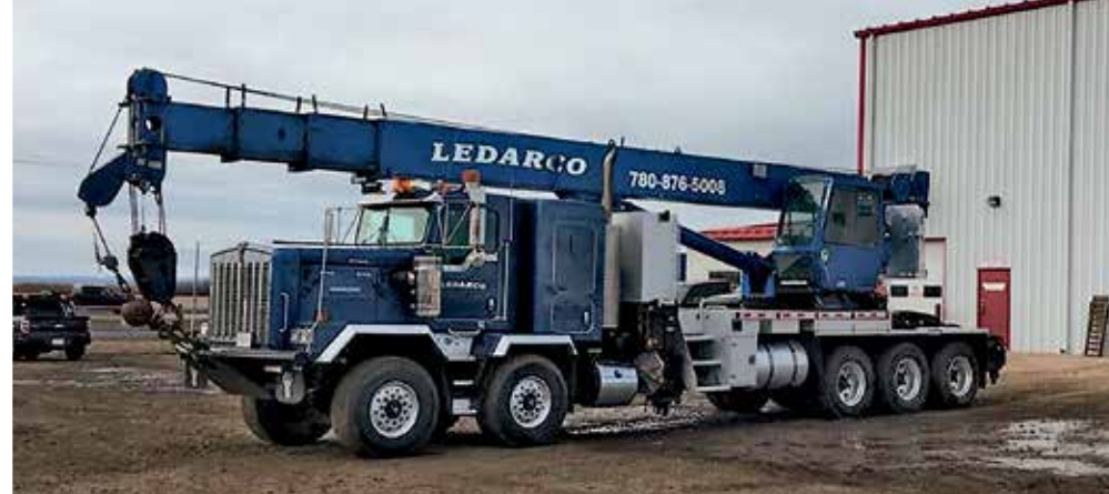
2012 Kenworth C500