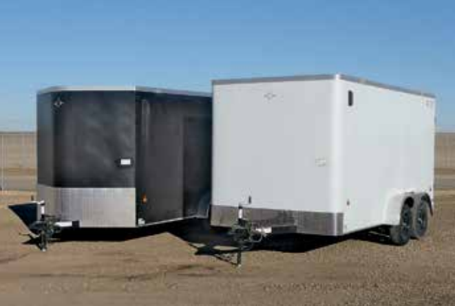
2 of 12 – Unused – 2019 & 2018 Royal Cargo 14 Ft