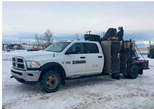
2012 Dodge 5500HD w/Hiab 077CLX