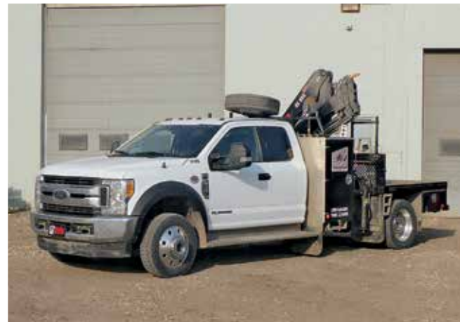
1 of 2 – 2017 Ford F550 XLT w/Hiab 055D3DLX