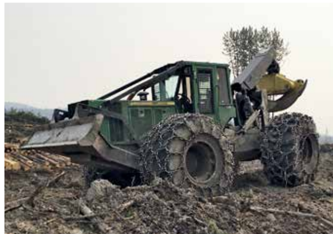
2014 John Deere 748H