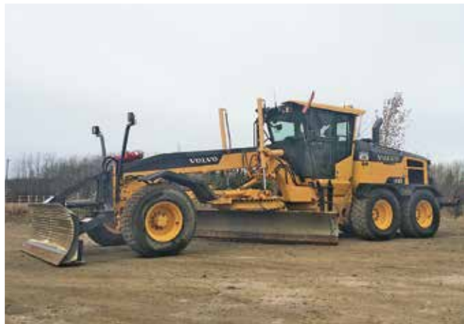
2011 Volvo G960