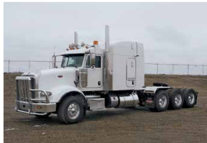
2015 Peterbilt 367