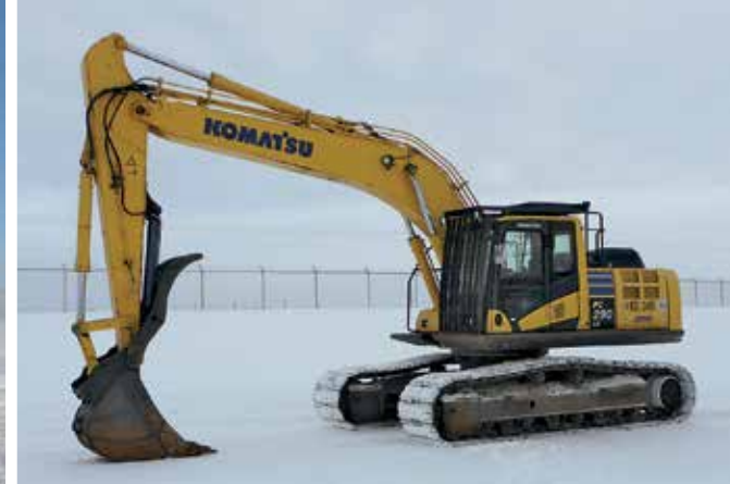
1 of 3 – 2013 Komatsu PC290LC-10