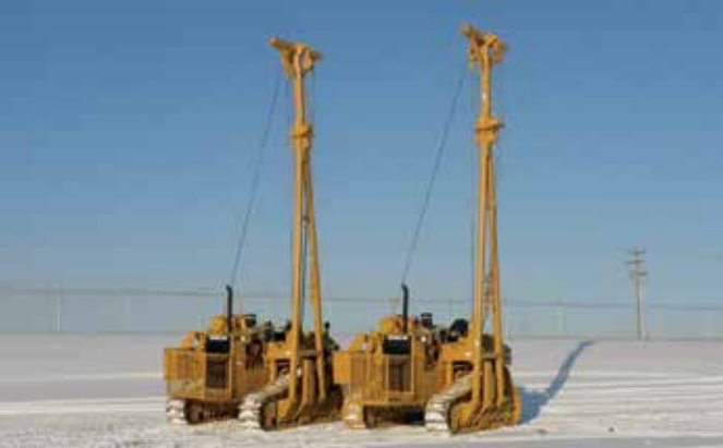
2 – Caterpillar 561M