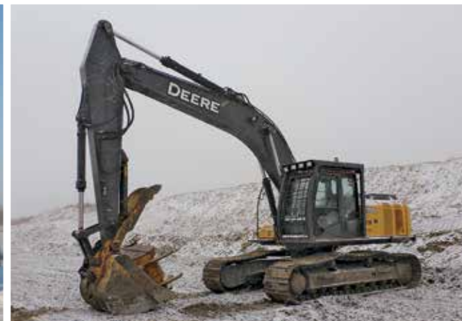
John Deere 270D LC