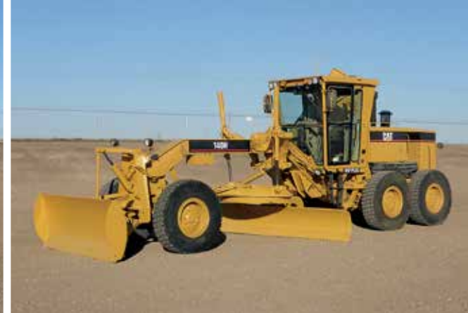
Caterpillar 140H VHP Plus