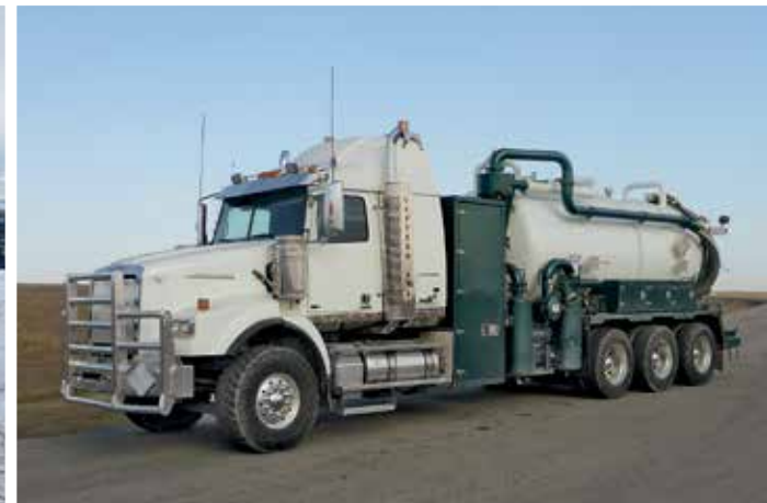
2012 Western Star 4900SA 17333 Litre Combo