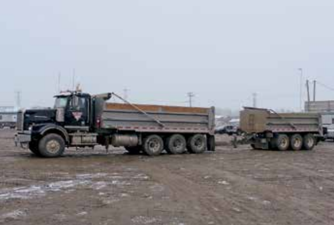
2015 Western Star 4900SA & 2016 Midland