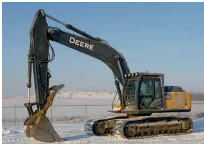
1 of 2 - Late Model John Deere 290G LC