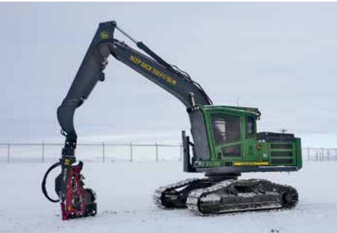
2017 John Deere 2154G w/Waratah HTH622B