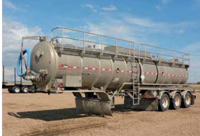
2015 Heil 38000 Litre