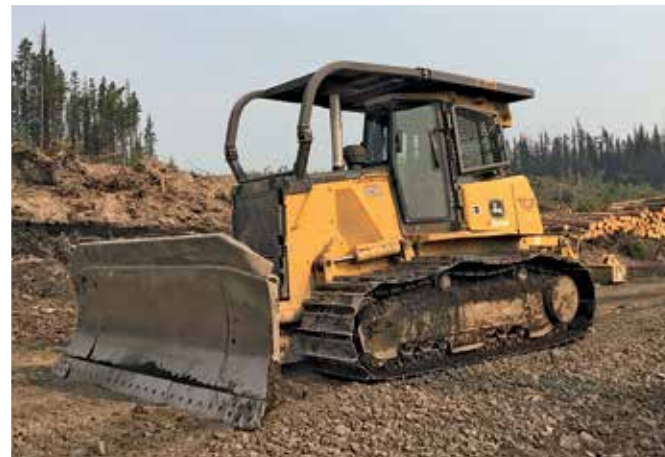
2013 John Deere 850J WLT