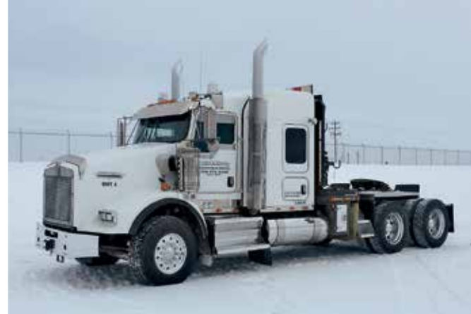
2013 Kenworth T800 Winch