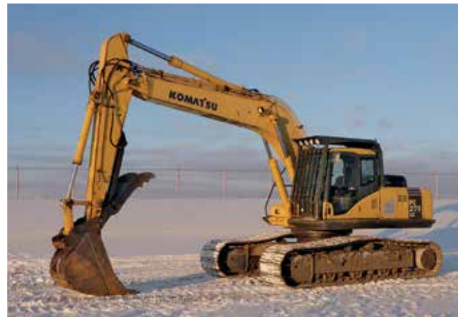
1 of 3 – Komatsu PC270LC-7