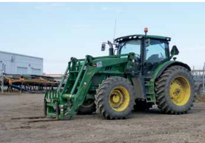
2013 John Deere 6450R