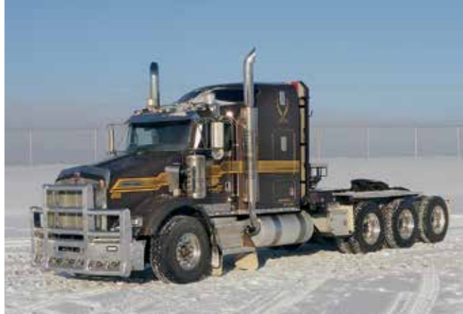
Kenworth T800 Winch