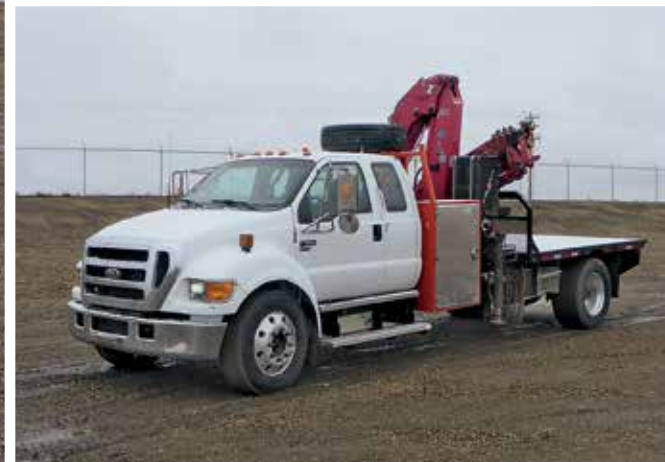
Ford F650 w/Amco Veba