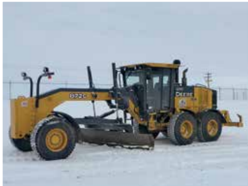
2010 John Deere 872G AWD