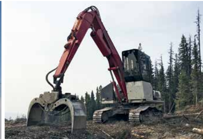
2015 Link-Belt 290