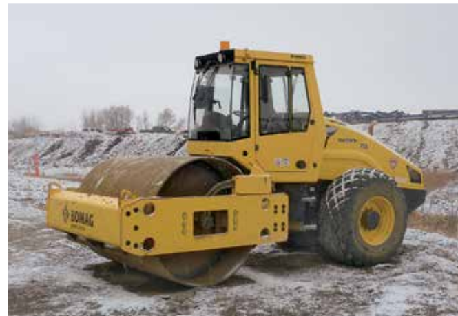
1 of 2 – 2013 Bomag BW211D-50