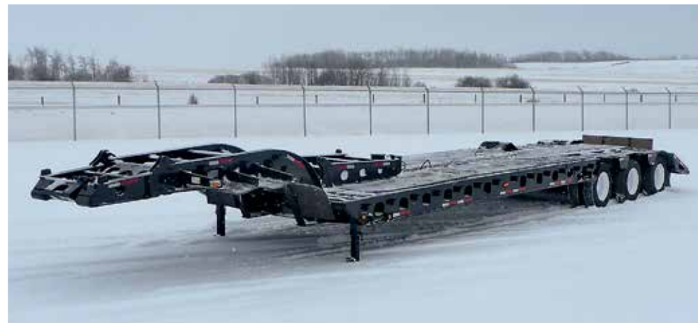
2009 K-Line 50 Ton