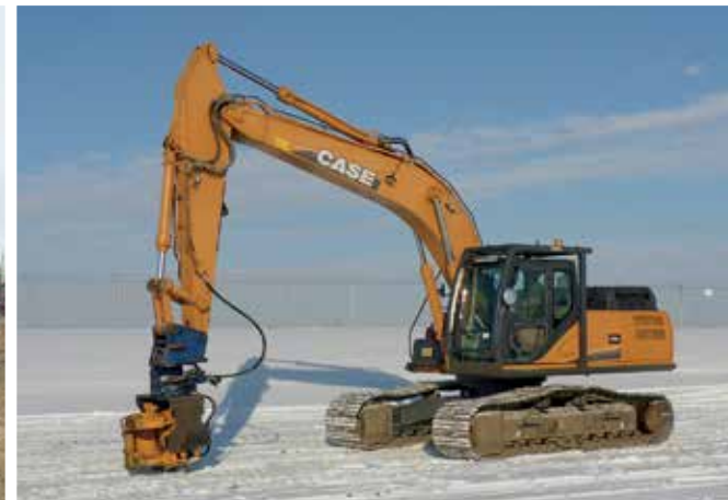
2014 Case CX300C w/Hercules SP60