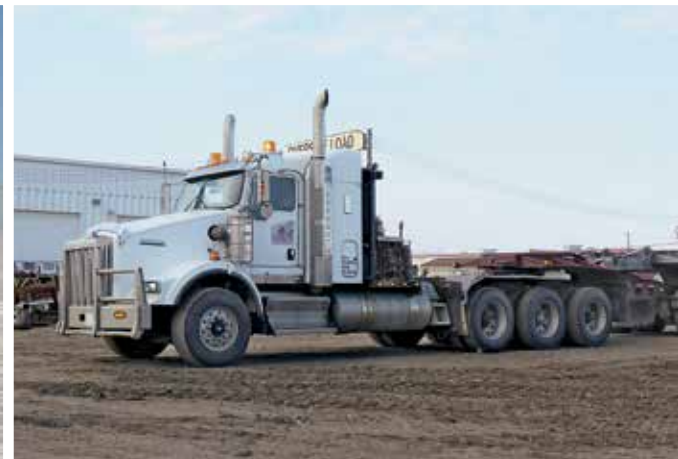
2012 Kenworth T800