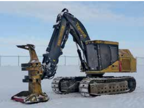
2017 Tigercat 870C