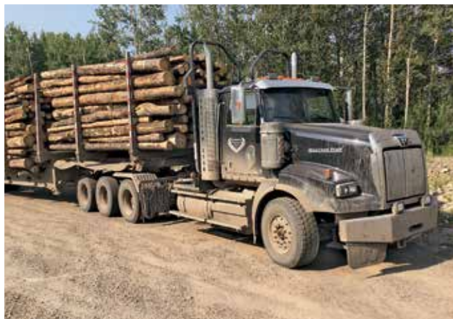
2018 Western Star 4900SB & 1 of 3 - 2016 Peerless SW5677B603