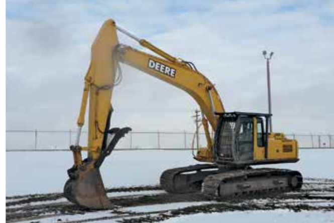
1 of 4 – John Deere 270C