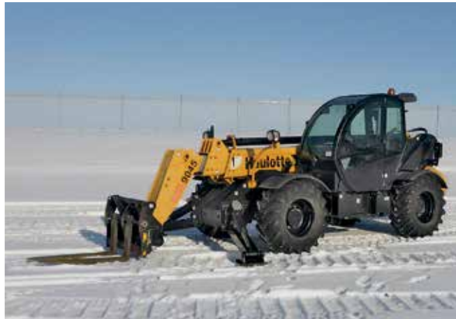
2013 Haulotte HT9045 4x4x4