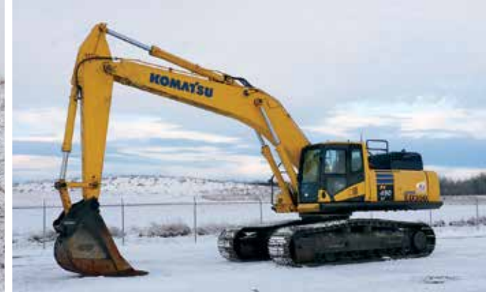
2011 Komatsu PC490LC-10