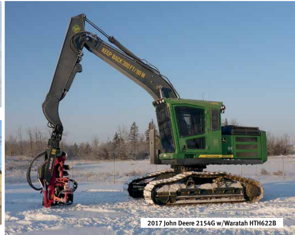
2017 John Deere 2154G w/Waratah HTH622B