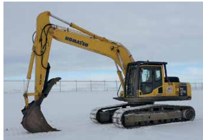
2010 Komatsu PC270LC-8