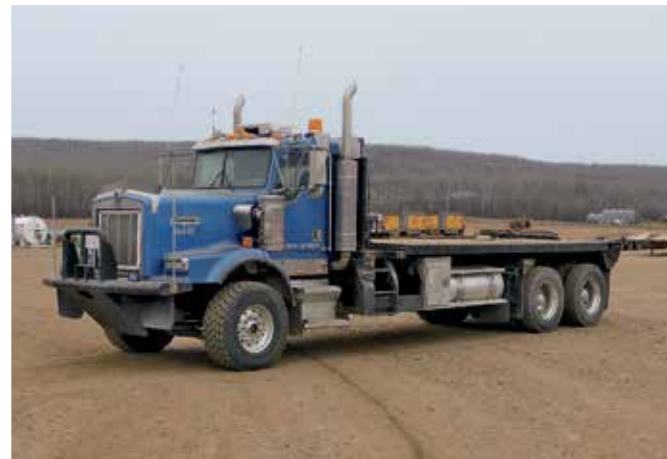
Kenworth C500 340 In.