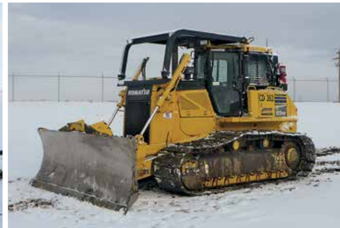
2013 Komatsu D65PX-17