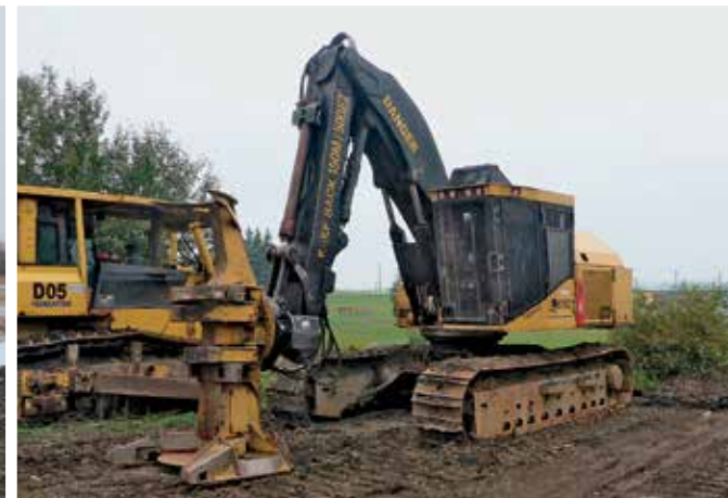
2011 Tigercat 870C