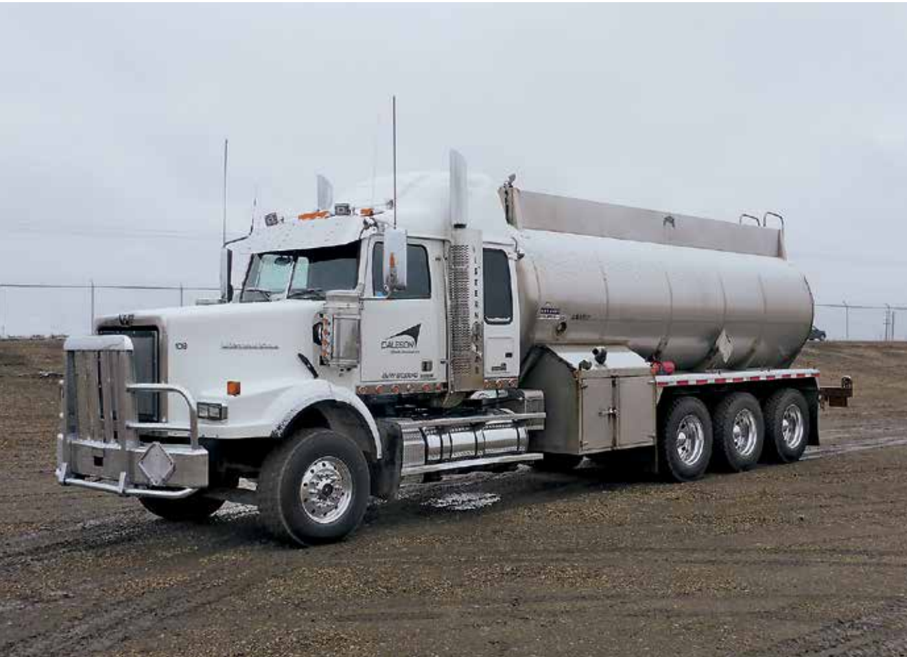
2013 Western Star 4900SA 21577 Litre