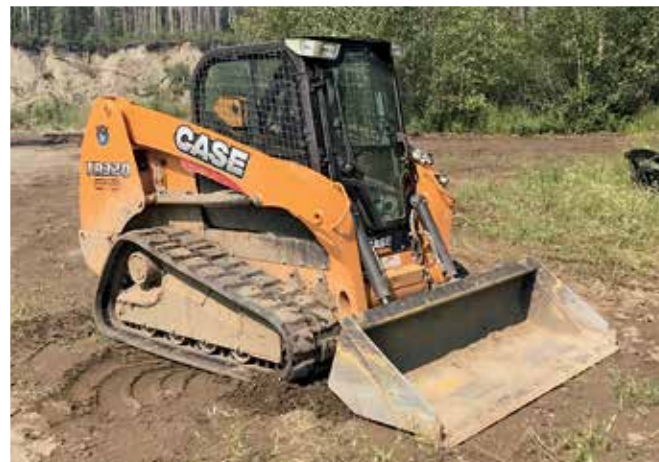
2012 Case TR320