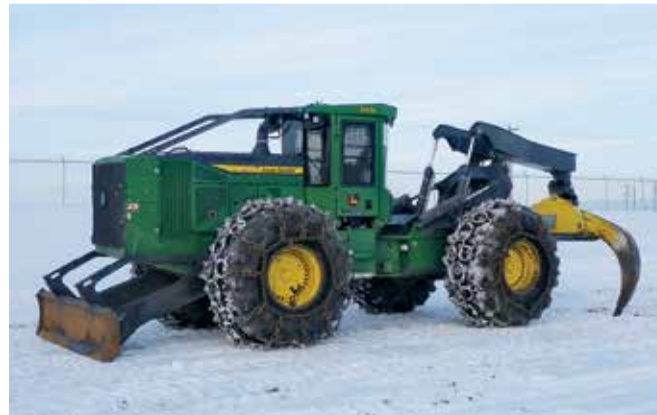
2016 John Deere 848L