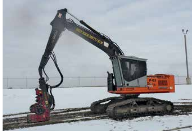
Hitachi ZX200LL w/Waratah HTH622