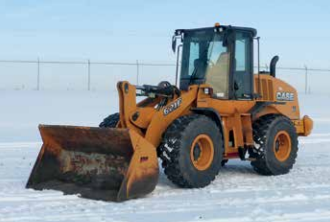
2013 Case 621F