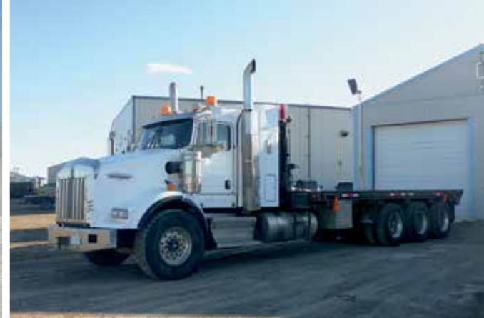
2009 Kenworth T800