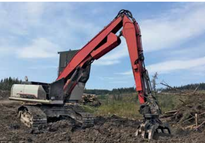
2014 Link-Belt 240