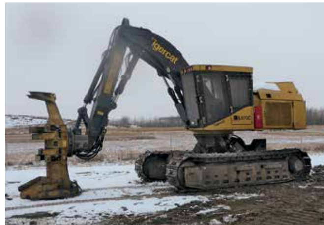
2014 Tigercat L870C