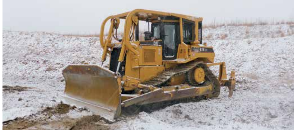
Caterpillar D7R XR Series II