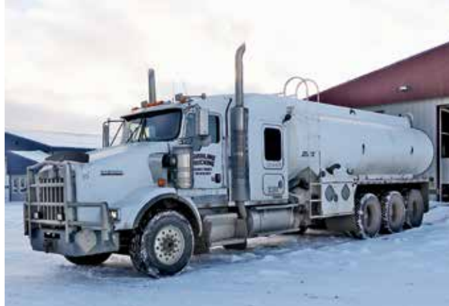
Kenworth T800 25000 Litre