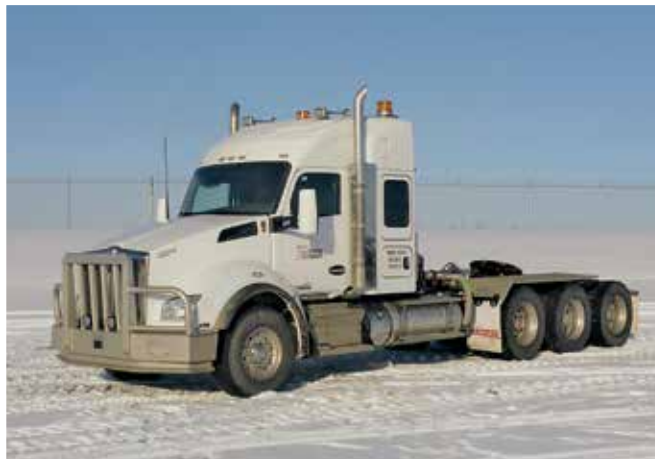
2016 Kenworth T880