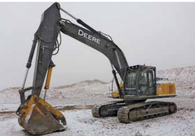
2012 John Deere 350G LC