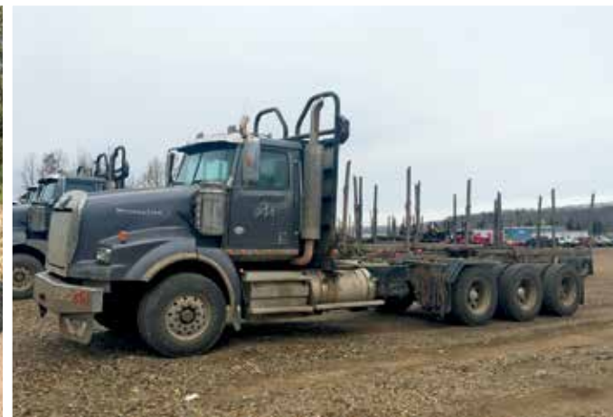
2014 Western Star 4900SA