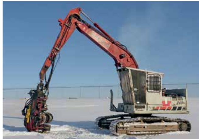
Link-Belt 210LX w/Waratah HTH620