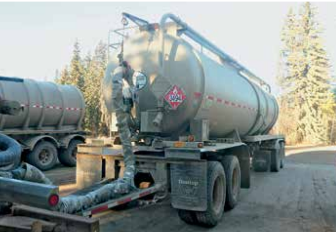
1 of 3 – Stephens 31800 Litre