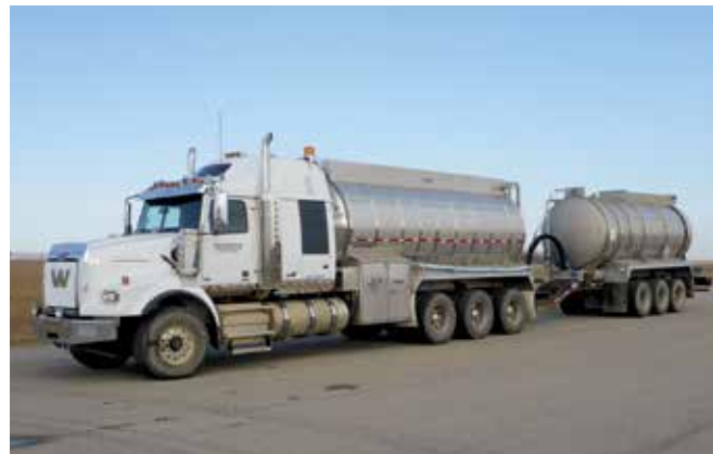
2015 Western Star 4900SA 22000 Litre & Tremcar 21000 Litre

See complete auction and equipment information on our website