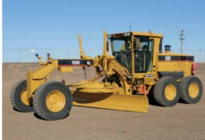
1 of 2 - Caterpillar 160H VHP Plus