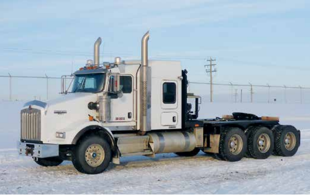
2015 Kenworth T800 Winch