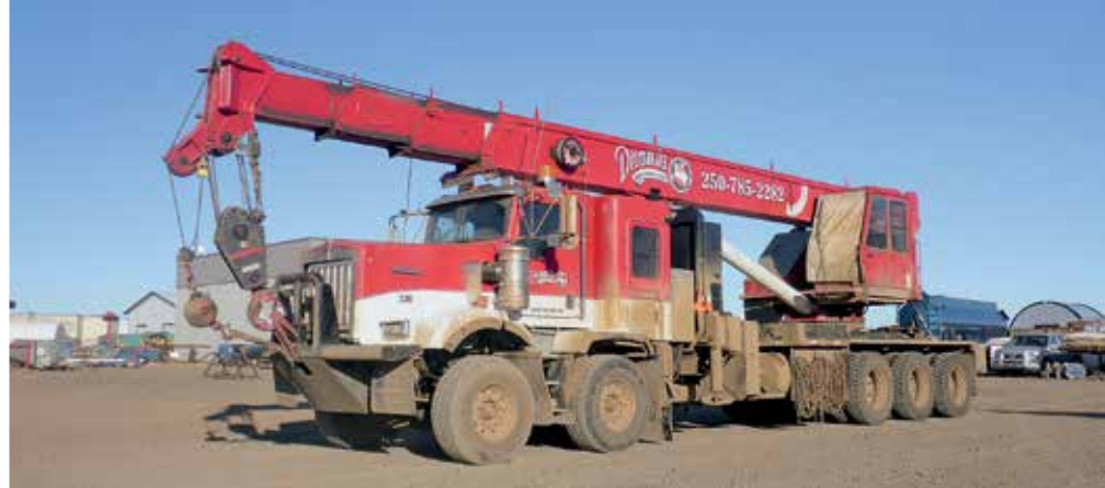
2011 Kenworth C500 w/Weldco WHL45TC100