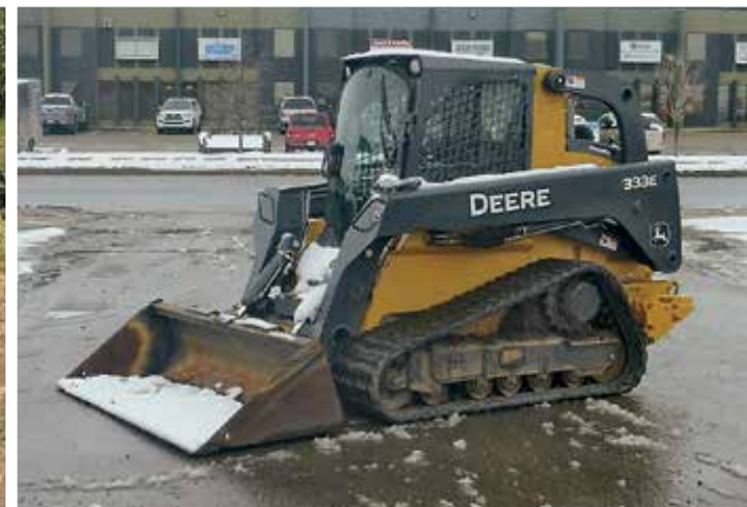
1 of 2 – 2017 John Deere 333E