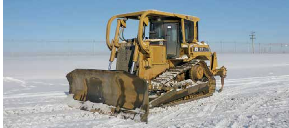
Caterpillar D7R XR Series II