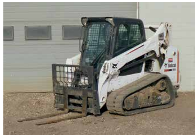
2014 Bobcat T590