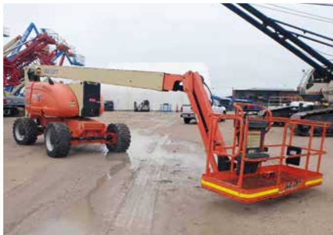
1 of 5 - JLG 800AJ