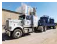
2014 Western Star w/Cement