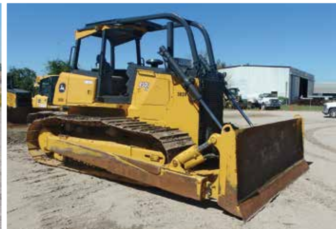
John Deere 850J LGP