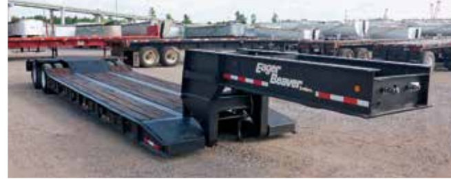
Eager Beaver 35GHG 35 Ton

12- CAR CARRIERS: Peterbilt 379 T/A • Peterbilt 379 w/Cottrell T/A 9 Car • 2- Peterbilt 379 w/Boydston 9100ST T/A 9 Car Open • Sterling