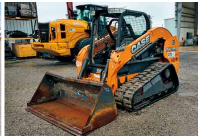
2014 Case TV380