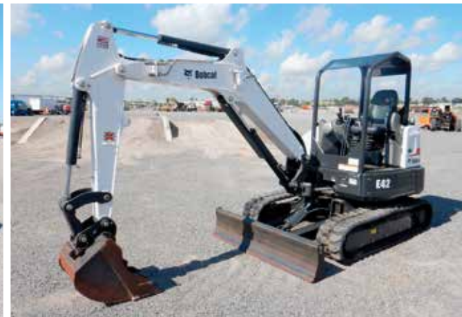
2017 Bobcat E42