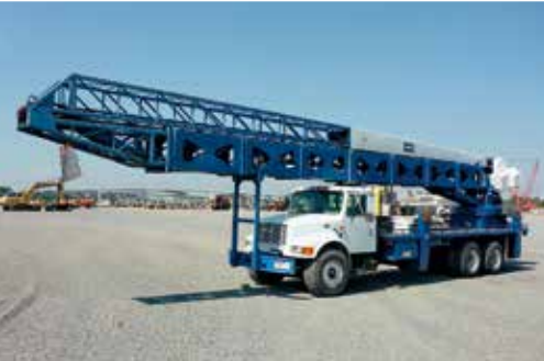
International 4900 w/Mat-3 BL.125.1