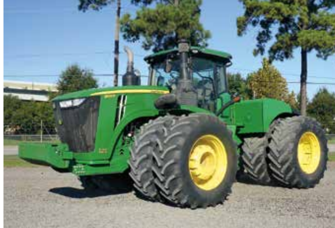
1 of 2 – 2015 John Deere 9520R