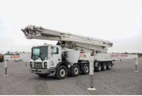
Mack MR688S w/Schwing 52 Meter