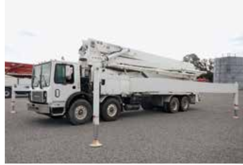
Mack MR688S w/Putzmeister 42 Meter