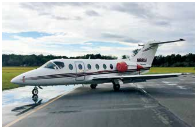
Beechcraft Beechjet 400 N880A