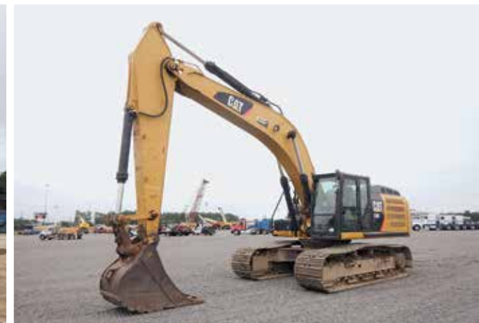
2011 Caterpillar 336EL