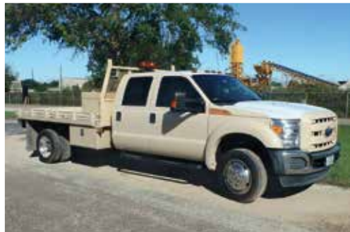
2015 Ford F550