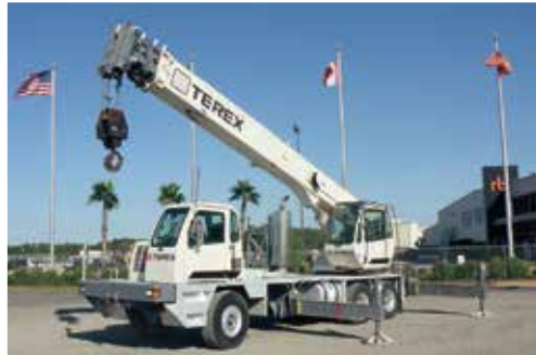
Terex T340-140 Ton 6x4