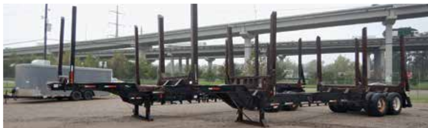
Riley Double Bunk Log & AMC Double Bunk