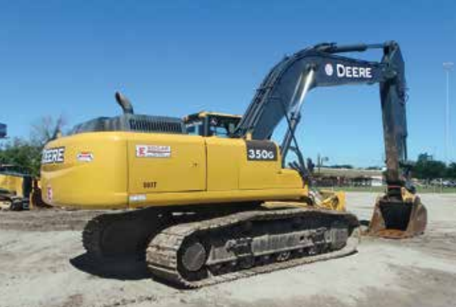
John Deere 350G LC