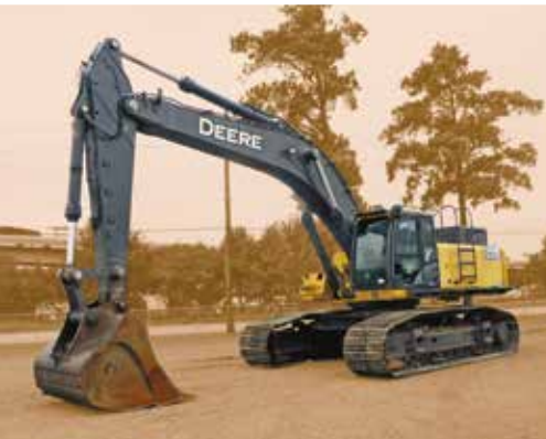
2012 John Deere 470G LC