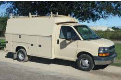
2015 Chevrolet 3500HD Service Utility