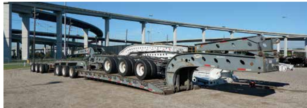
Liddell M80 80 Ton