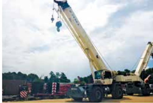
2011 Terex RT555-155 Ton