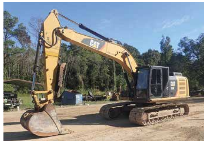
2014 Caterpillar 320EL