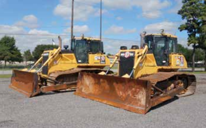
2 – Komatsu D65PX-17 LGP