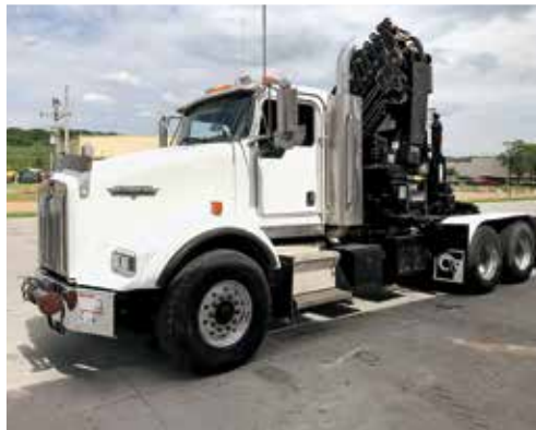
1 of 2 – Kenworth T800 w/Hiab 600