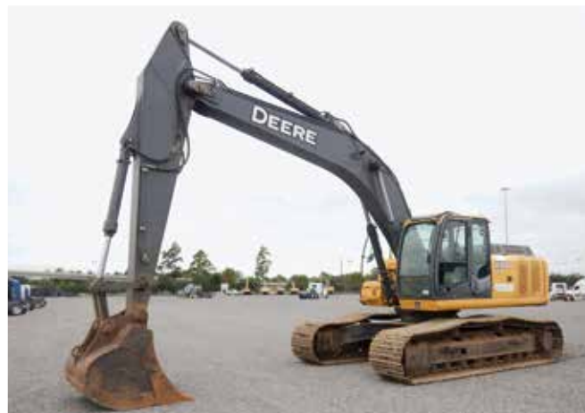
John Deere 270D LC