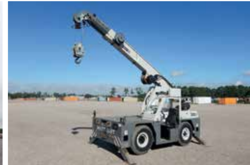
2012 Shuttlelift 3330FL 8.5 Ton