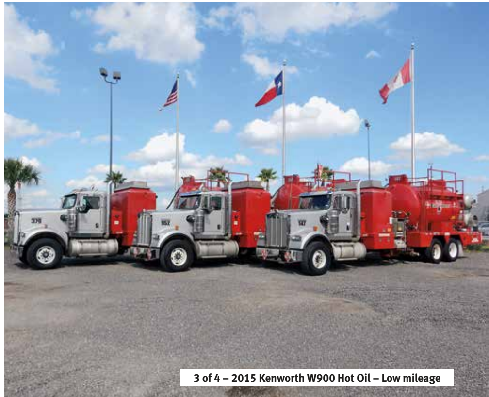
3 of 4 – 2015 Kenworth W900 Hot Oil – Low mileage