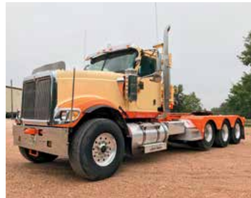
2009 International 5900i PayStar