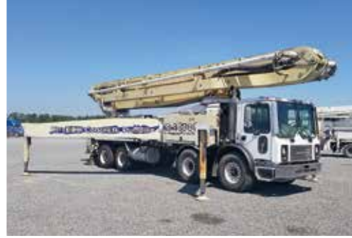
Mack MR688S w/Putzmeister 46 Meter