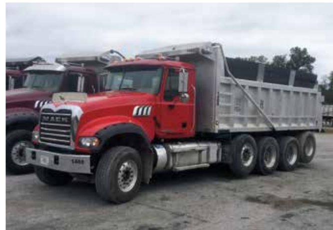
1 of 2 – 2014 Mack GU713