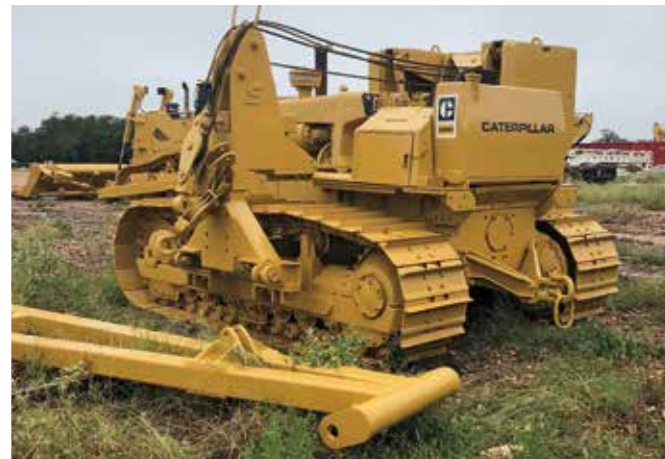
Caterpillar D6D LGP