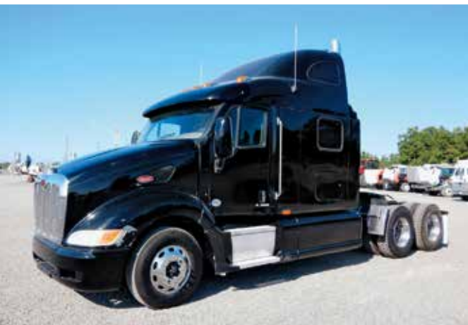
2011 Peterbilt 387