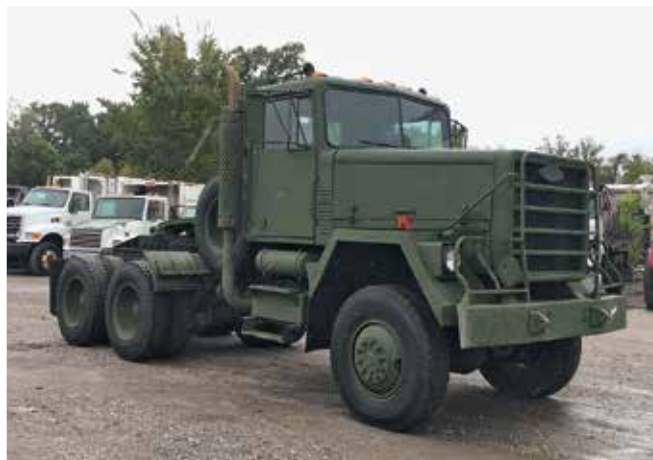
2012 AM General M916 Winch