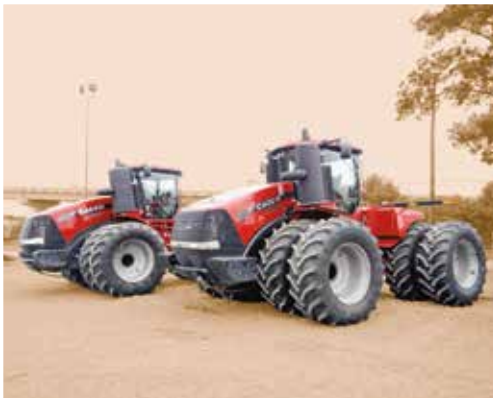
2 – 2015 Case IH Steiger 580S