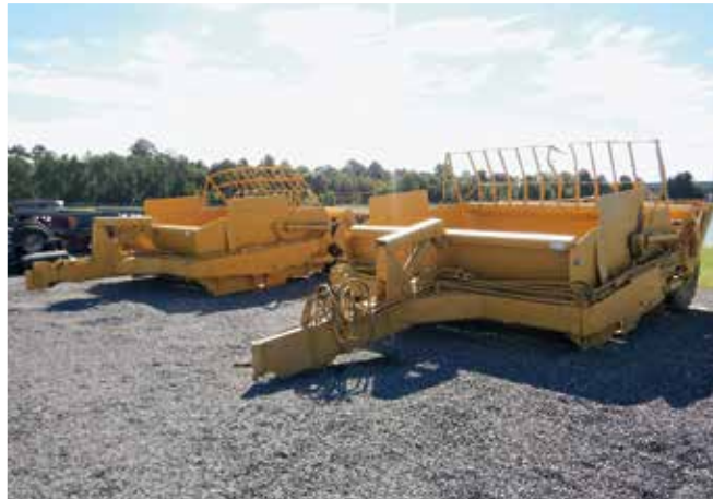
2 of 4 – Reynolds 14C