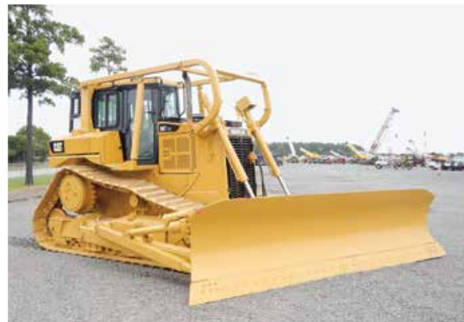
Caterpillar D6T LGP