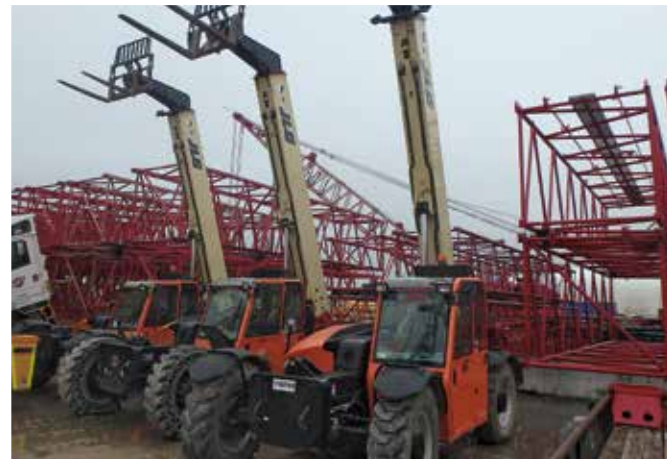
2 of 5 - 2013 & 2015 JLG A943 9000 Lb