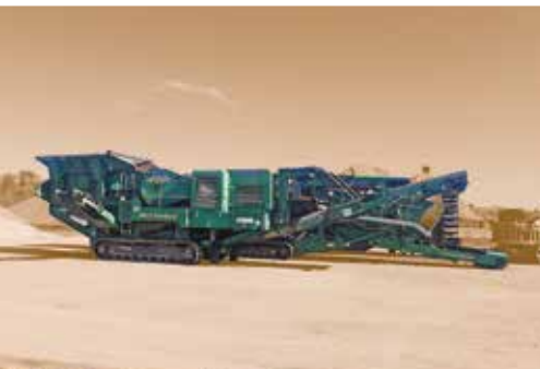
McCloskey C50 25 x 50 in.