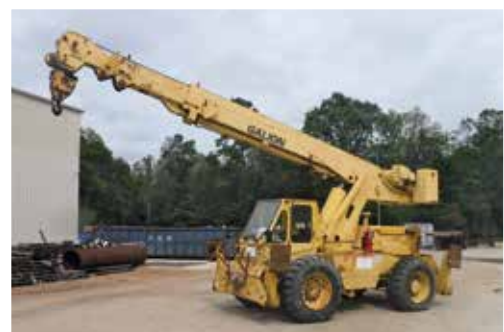
1 of 4 - Galion 150FA