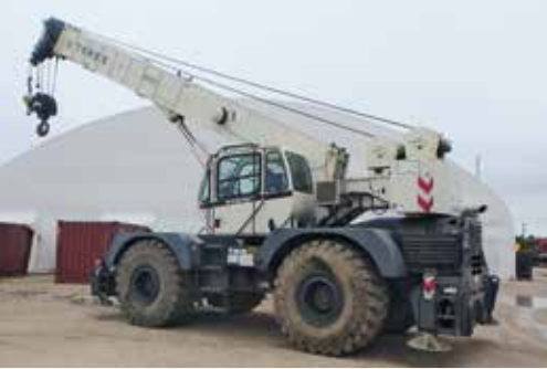
1 of 4 – 2013 Terex RT670-170 Ton