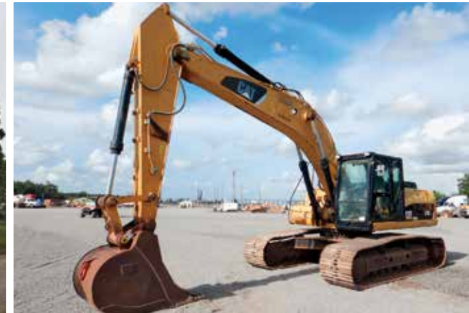
1 of 2 – 2011 Caterpillar 329DL