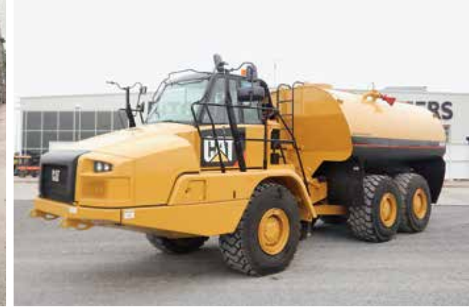
2014 Caterpillar 730C w/N600