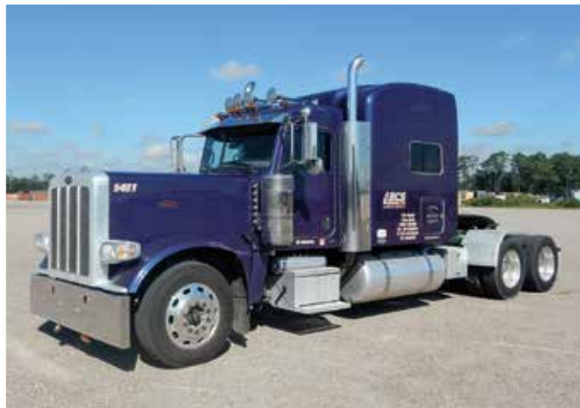
2011 Peterbilt 389