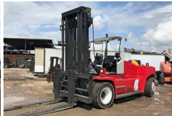
2012 Kalmar DCE160-12 36000 Lb