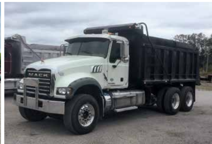
2016 Mack GU713