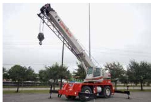
2009 Link-Belt RTC8030 Series 2 30 Ton 4x4x4