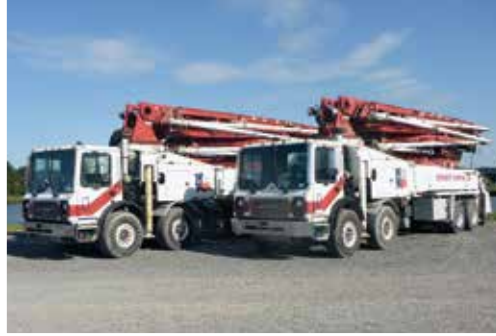
2 - Mack MR688S w/Putzmeister 47 Meter