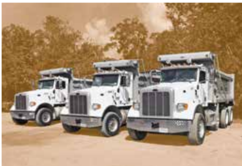
2016 Peterbilt 367 & 2 – 2016 Peterbilt 365