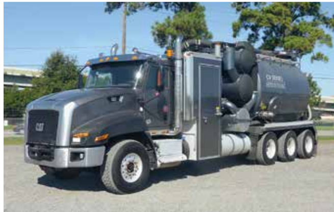
2015 Caterpillar CT660L Tri-Drive Hydro Vac