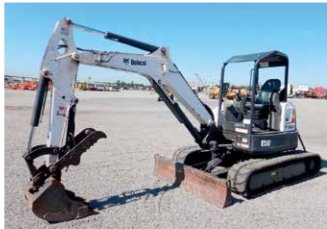
1 of 2 – 2015 Bobcat E50