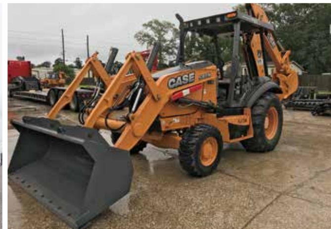
2014 Case 580N