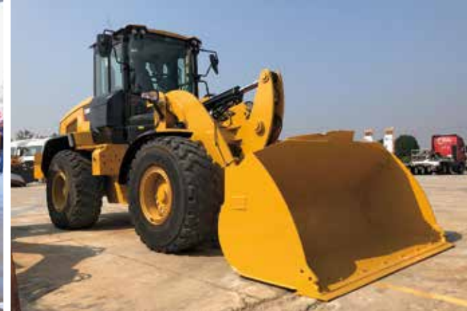
1 of 2 - 2017 Caterpillar 938M