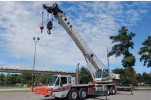
Link-Belt HTC8650 50 Ton 8x4x4