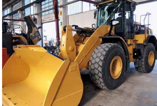
2017 Caterpillar 950M