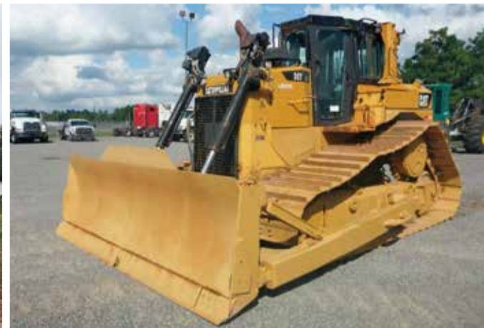
2013 Caterpillar D6T LGP