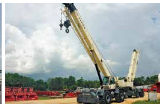
2011 Terex RT780 80 Ton