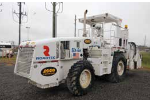
2015 Roadtec SX-2E