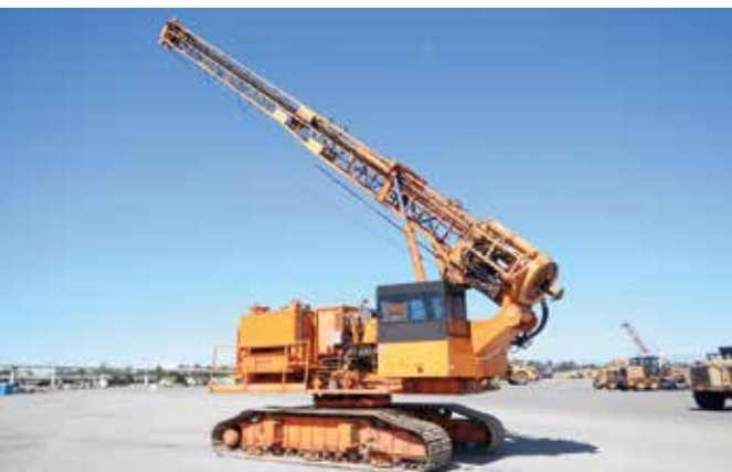
Atlantic Equipment AD150C w/80 Ft Mast