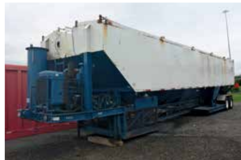
BSSE 60TAMM Sand King