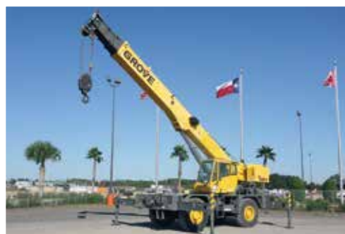
Grove RT530E-2 30 Ton