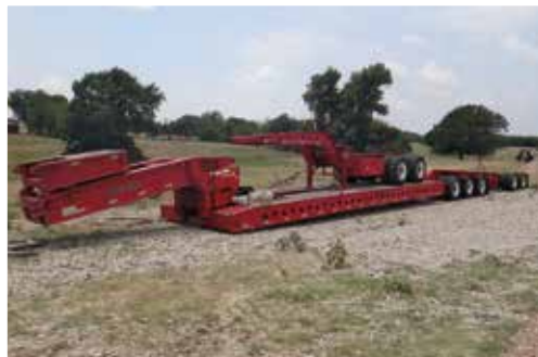
Trail King TK140HDG-62 2+3