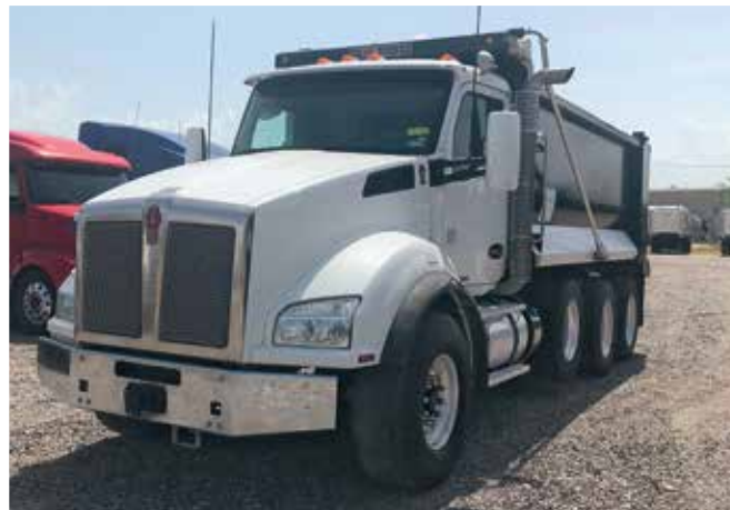
1 of 2 – 2016 Kenworth T880