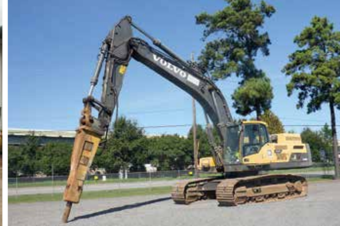
2012 Volvo EC340DL – Hammer sold separately