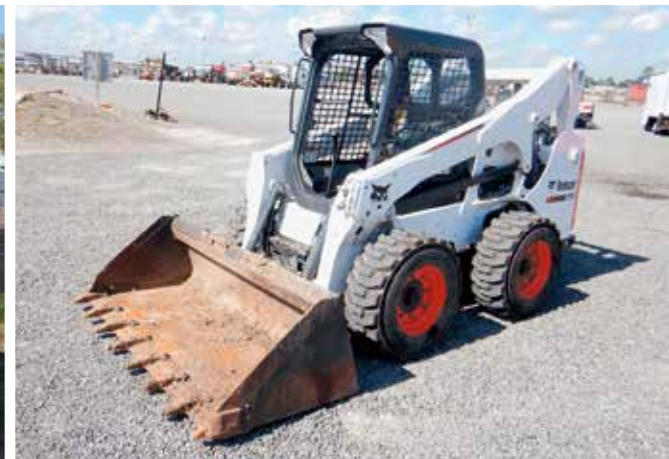
2016 Bobcat S750