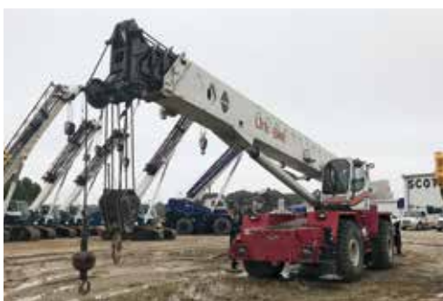
2013 Link-Belt RTC8030-2