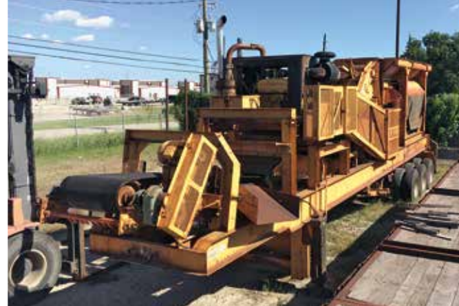
Eagle 33D5170 Impact