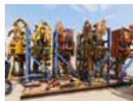
Tesco & FDS 250T Top Drives