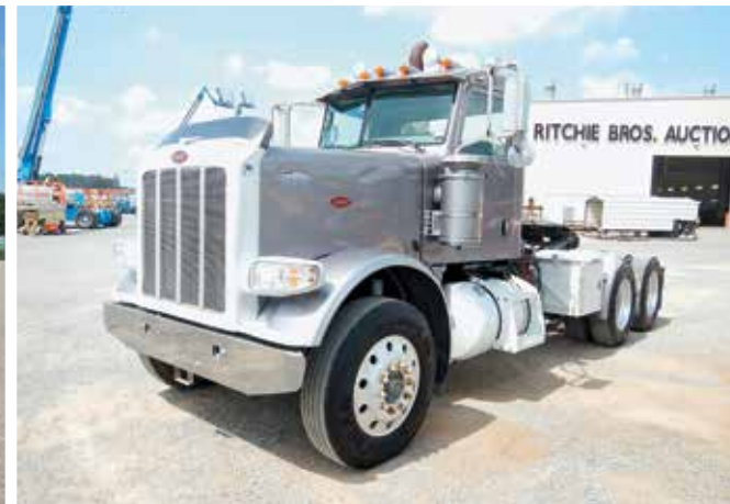
2011 Peterbilt 388