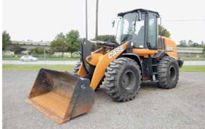
Unused – 2017 Case 621G