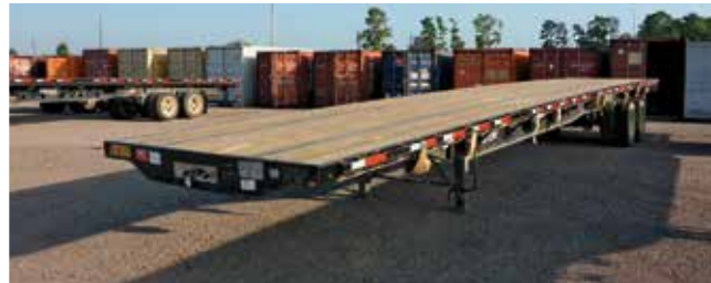
2014 Transcraft TL2000 48 Ft