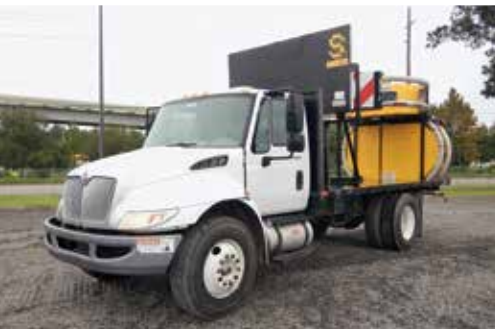
2011 International 4000 DuraStar