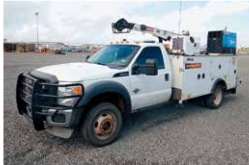
2011 Ford F550 w/IMT 3820 7500 Lb