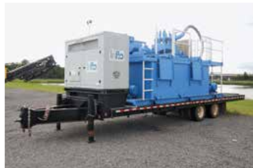
Triflo Mud Mixing System