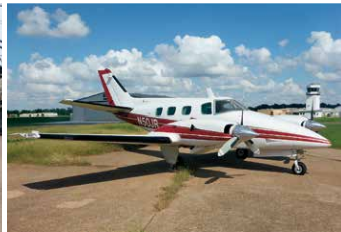
Beechcraft B60 Duke