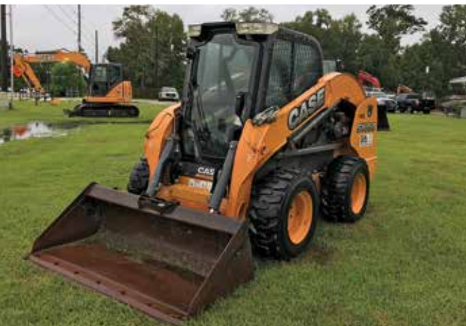
2014 Case SV250