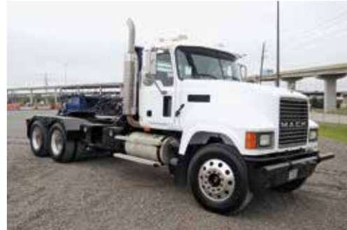
Mack CHN613 Winch