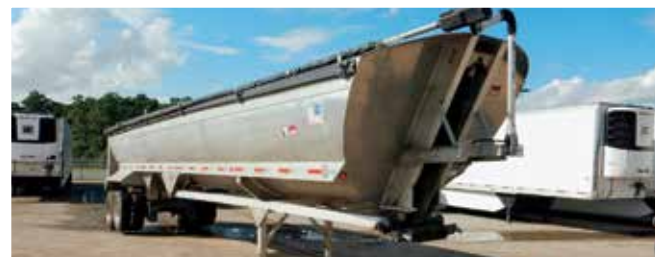
2017 Travis 39 Ft