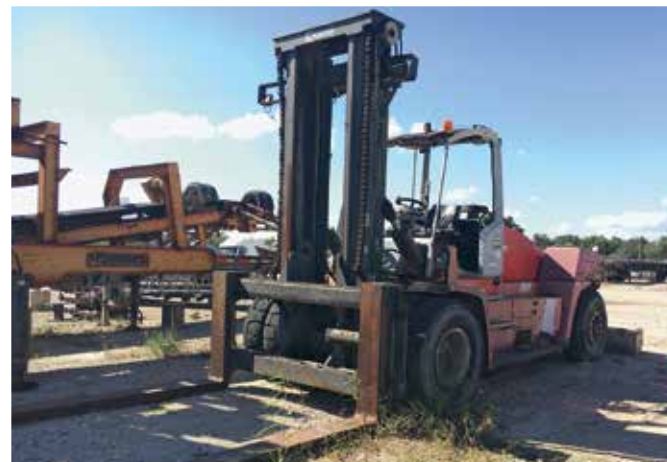
Kalmar DCE160-12 36000 Lb