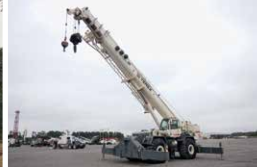
2009 Terex RT1120 120 Ton 4x4x4