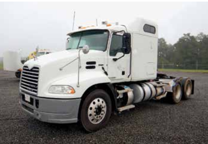
2012 Mack CXU613