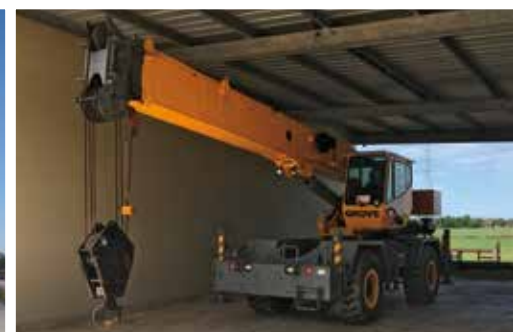
Grove RT530E 30 Ton