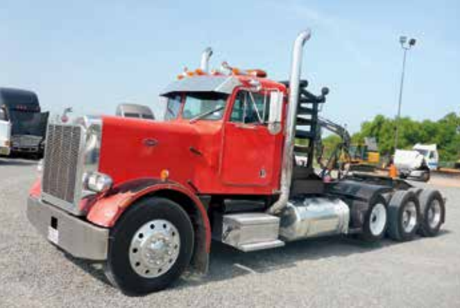
Peterbilt 359 Winch