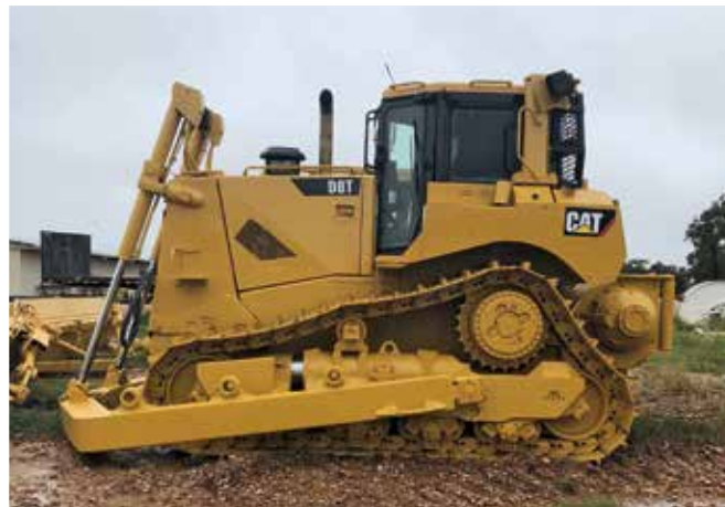
2009 Caterpillar D8T