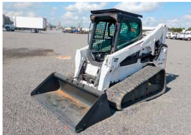
2013 Bobcat T770