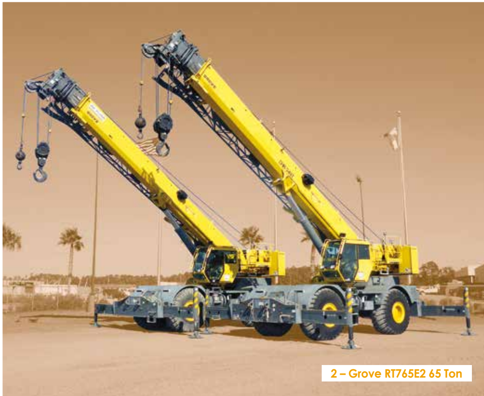
2 – Grove RT765E2 65 Ton