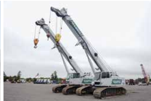
2 – Mantis 9010 45 Ton