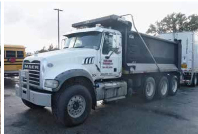
1 of 2 – 2016 Mack GU713