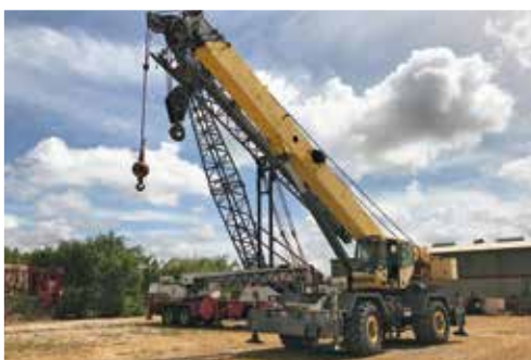
Grove RT600E 50 Ton