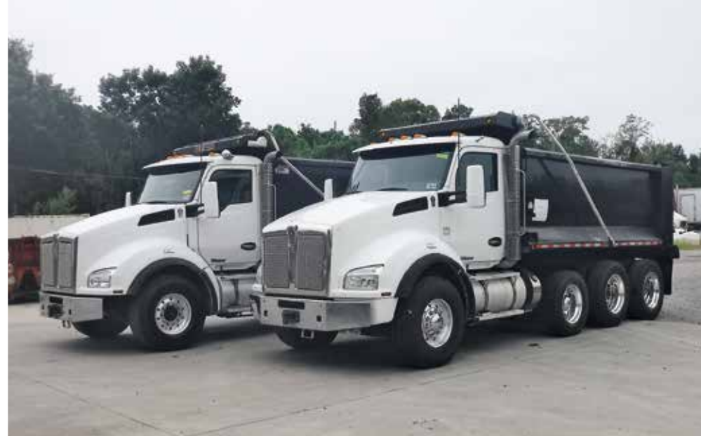
2 – 2016 Kenworth T880