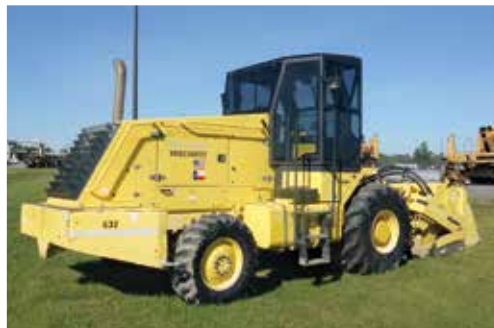
2013 Bomag MPH364R-2