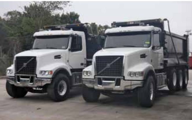
2 – 2016 Volvo VHD64F