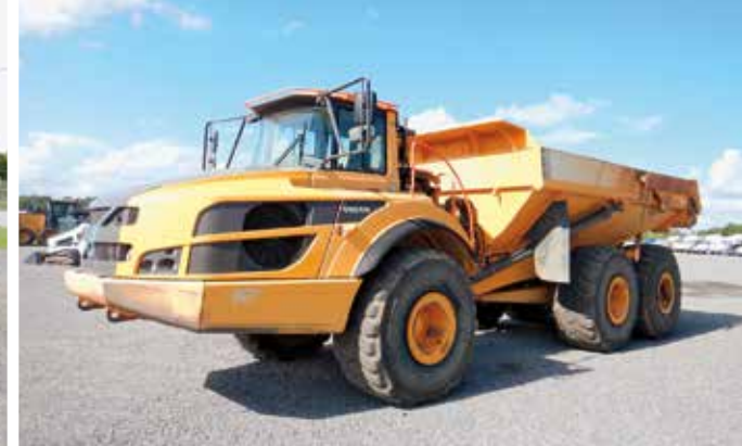
2014 Volvo A40G 6x6