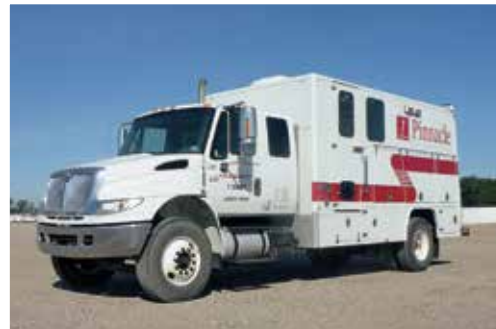
International 4400SBA Wireline