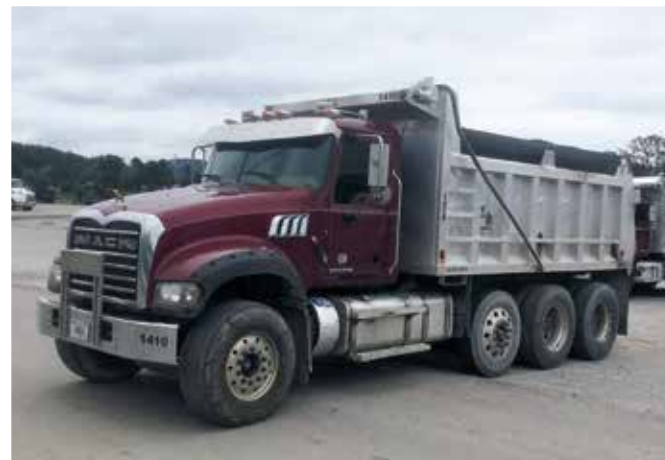
1 of 2 – 2014 Mack GU713