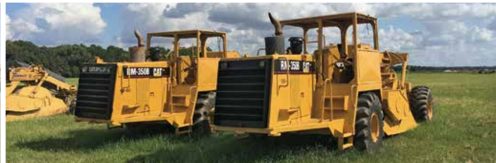
2 – Caterpillar RM350B