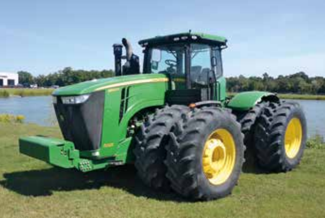
1 of 2 – 2015 John Deere 9560R Scraper Special