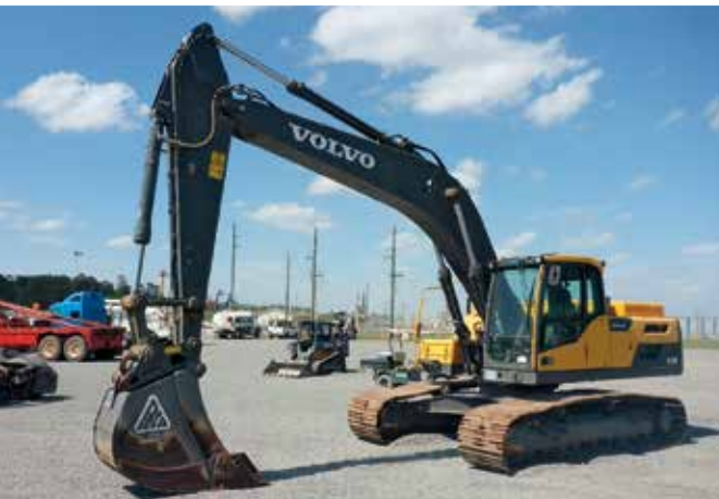
2014 Volvo EC250DL