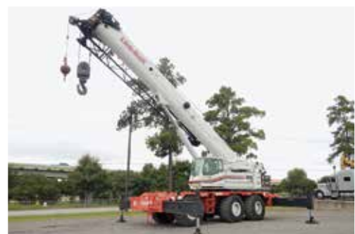
Link-Belt RTC80100 100 Ton 6x6