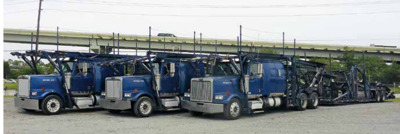
3 of 7 – Western Star 4900FA w/Cottrell 9 Car