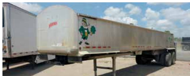
Vantage S85 Omega 37 Ft Quarter Frame