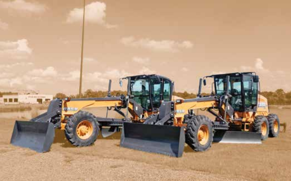
2 of 3 – Unused – 2014 Case 885B VHP