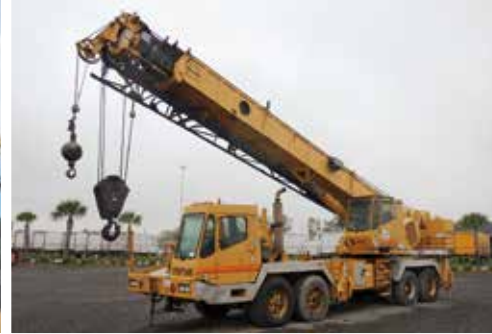
Grove RMS700B 50 Ton 8x4x4