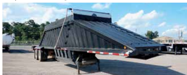
CTS BDT40 40 Ft