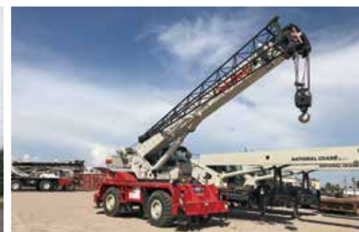
2009 Link-Belt RTC8030 30 Ton