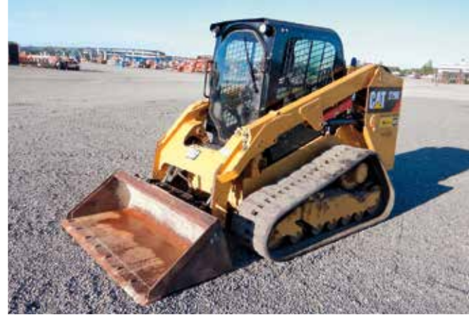
2015 Caterpillar 279D 2 Spd