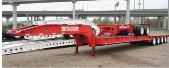
Holden HRD60 60 Ton