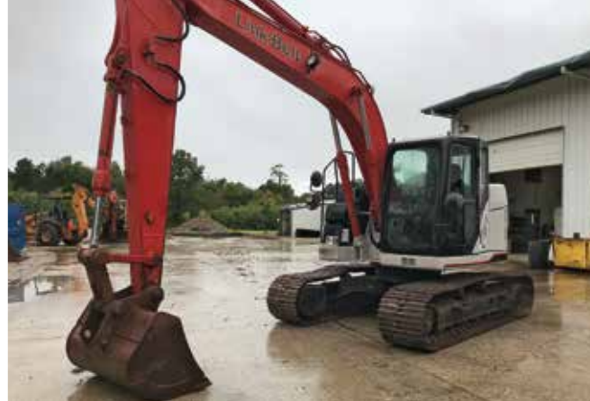
2014 Link-Belt 145X3