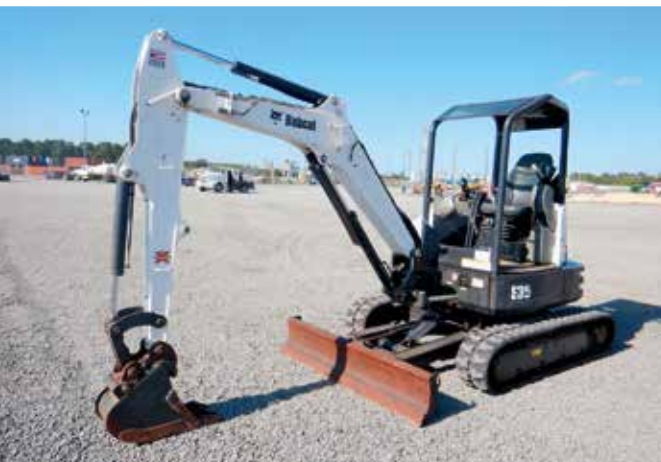
1 of 2 – 2016 Bobcat E35