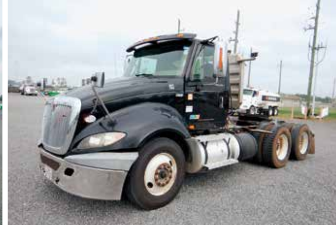
2013 International ProStar+