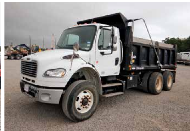
2011 Freightliner M2 Business Class