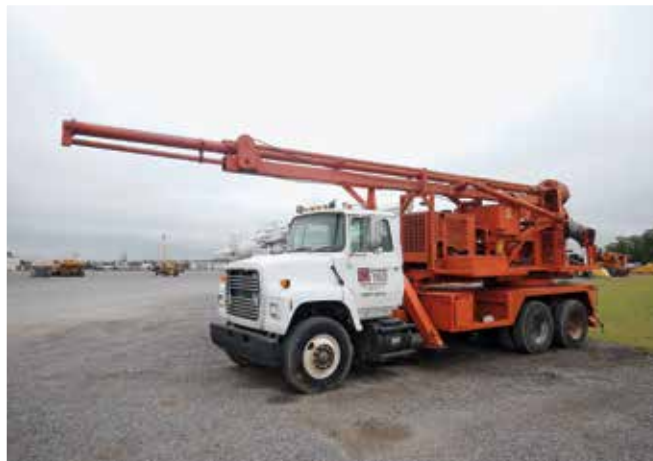
Ford 8000 w/Atlantic Equipment MCD353 37 Ft Mast