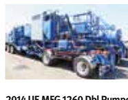
2014 UE MFG 1260 Dbl Pumper w/SPM 600S Triplexes