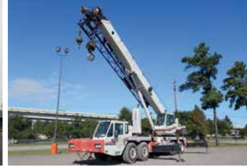
Link-Belt HTC8660 60 Ton 8x4x4