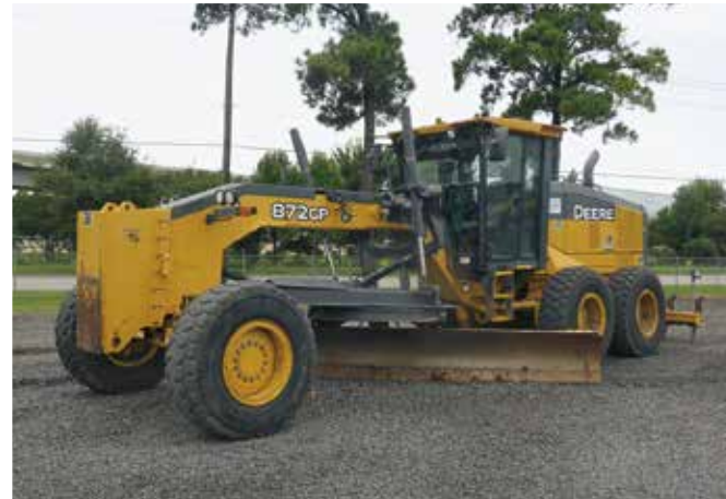
2015 John Deere 872GP AWD