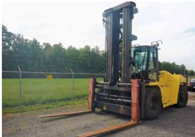
Hyster H450HD 39200 Lb