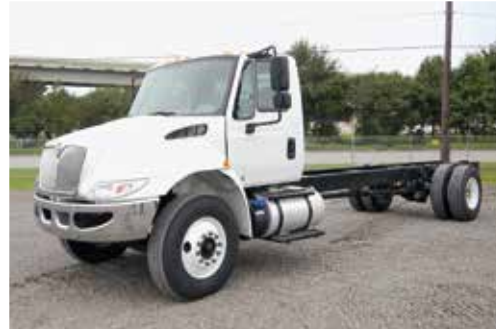
2018 International 4300SBA