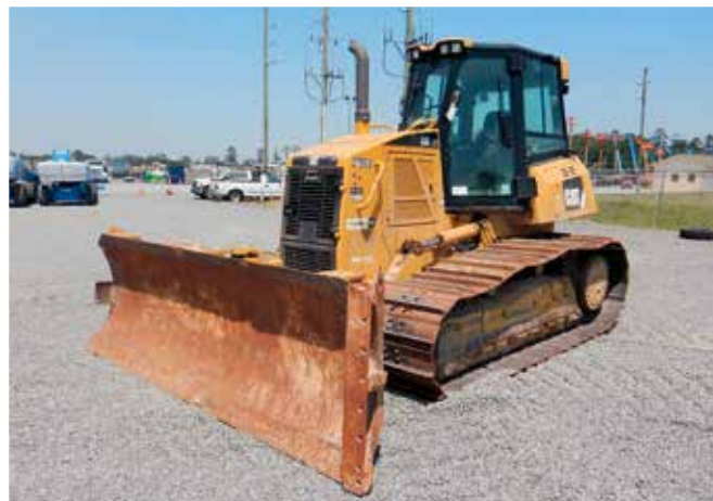
2012 Caterpillar D6K LGP