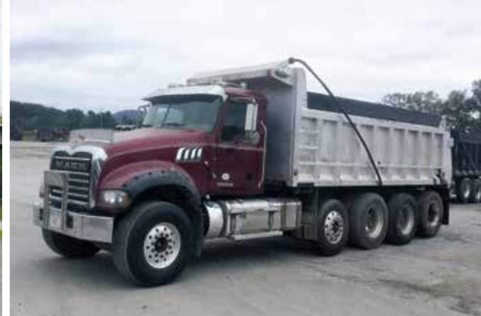
1 of 2 – 2014 Mack GU713