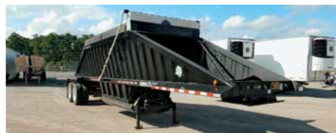
2017 Armorlite SBD40LT 40 Ft