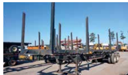
1 of 2 - 2016 Pitts LT40-8L