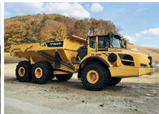
1 of 11 – 2012 Volvo A40F