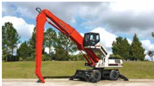
Factory Demo – 2017 Link-Belt 360X2MHRT