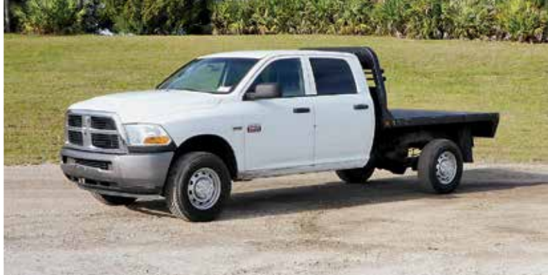
2010 Dodge 2500 4x4