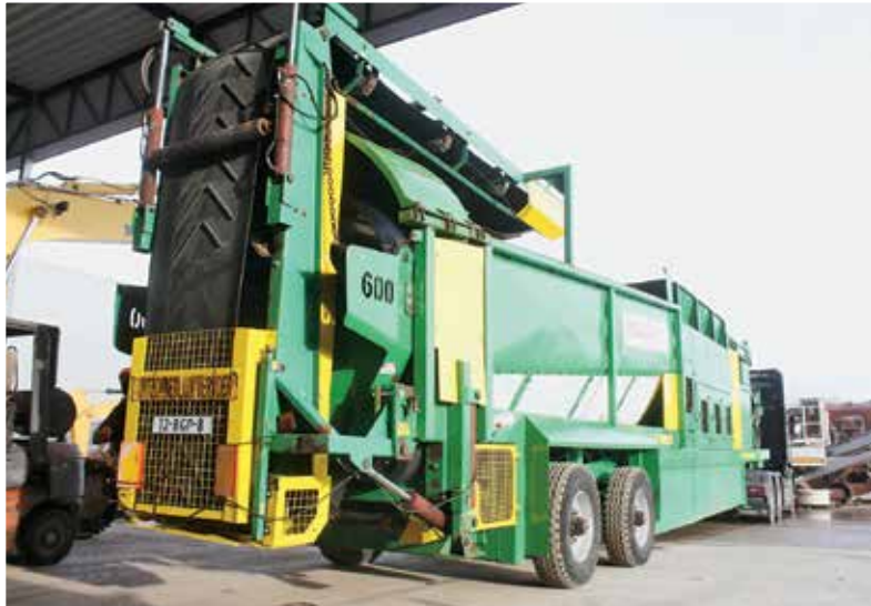
2010 McCloskey 621RE 6 x 21 Ft Trommel