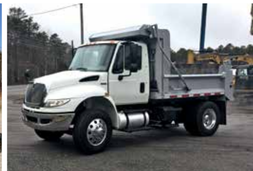
2012 International 4400SBA