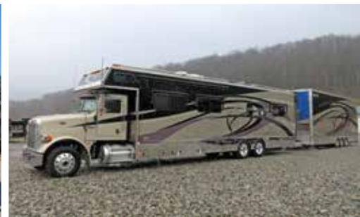
2008 Renegade/Peterbilt 365