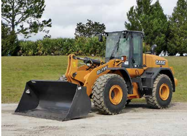
Unused – 2016 Case 821F