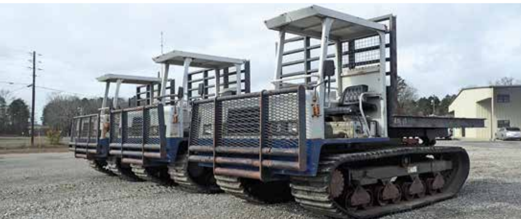
3 of 4 – 2008 IHI 45C-2