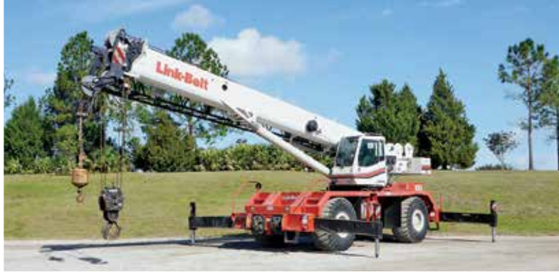
2009 Link-Belt RTC8065 Series II 65 Ton 4x4x4