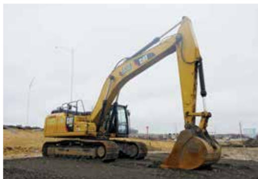
2015 Caterpillar 336FL