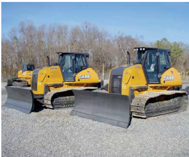
2 – Unused – 2016 Case 1150M WT – Located in Tampa, FL – FTZ