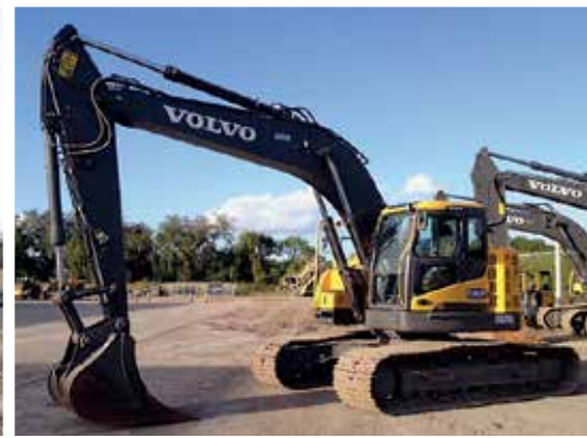
1 of 3 – 2015 Volvo ECR235D