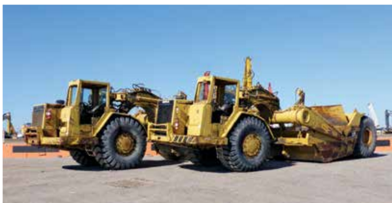
2 – Caterpillar 631E