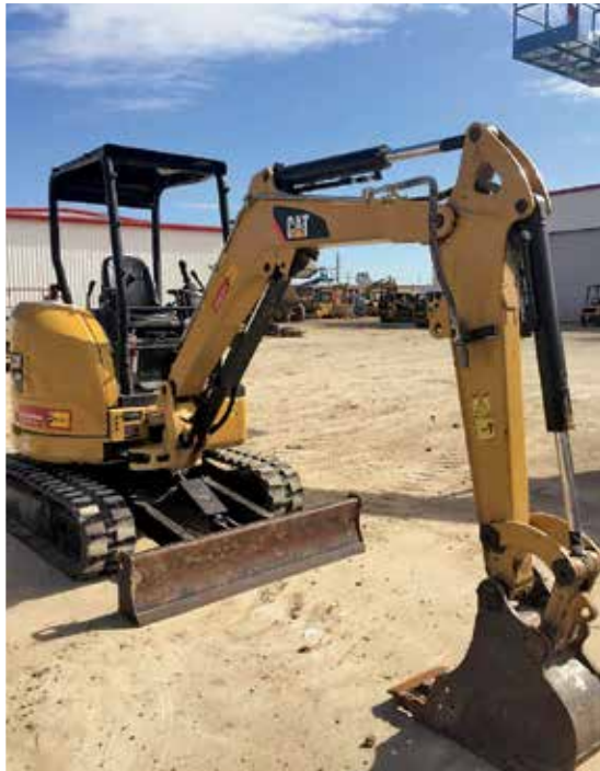
2015 Caterpillar 303Ecr