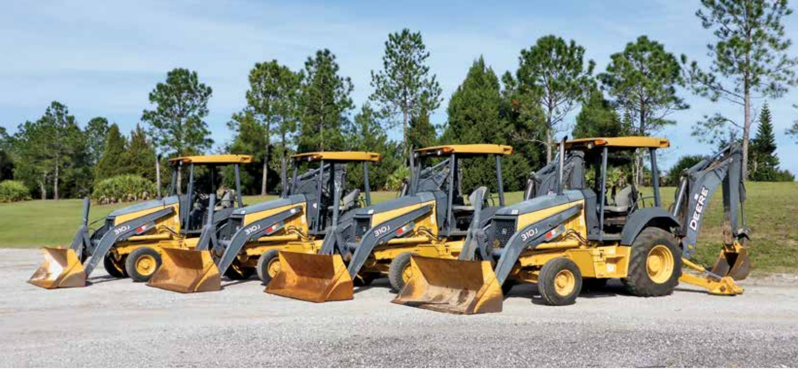
2 - 2012, 2011 & 2010 John Deere 310J