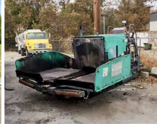
2010 Voegele S700