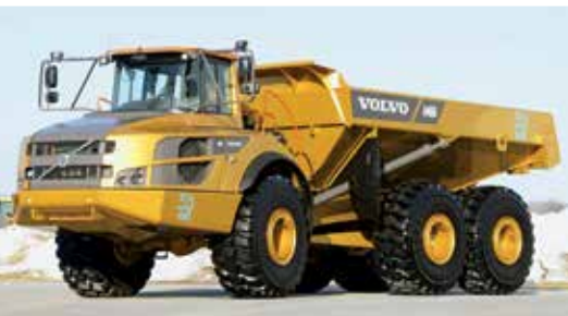
Unused – 2015 Volvo A40G Golden Hauler