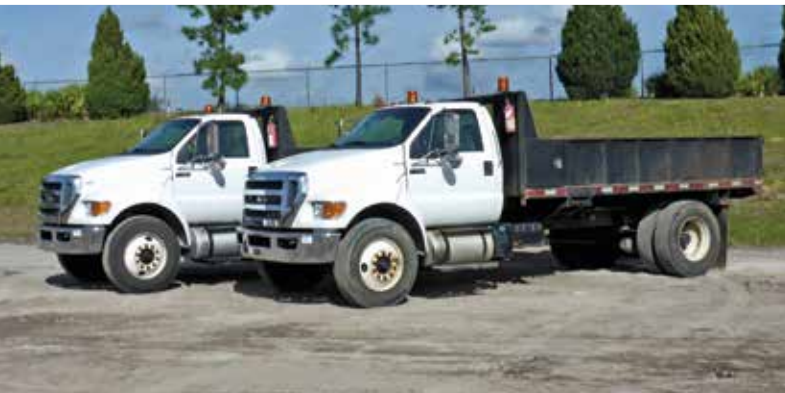
2 – 2011 Ford F750 XL Rollback