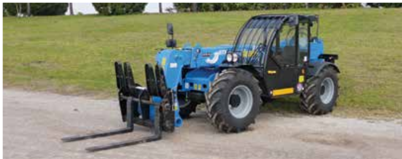
Unused – 2016 Genie GTH3007 6600 Lb 4x4x4