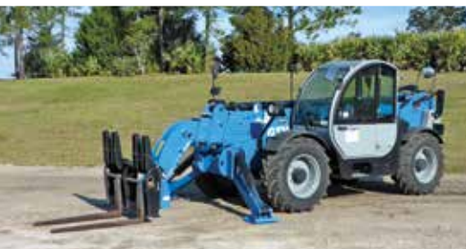
Unused - 2015 Genie GTH4018 8800 Lb 4x4x4