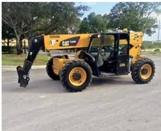
2013 Caterpillar TL943C 4x4