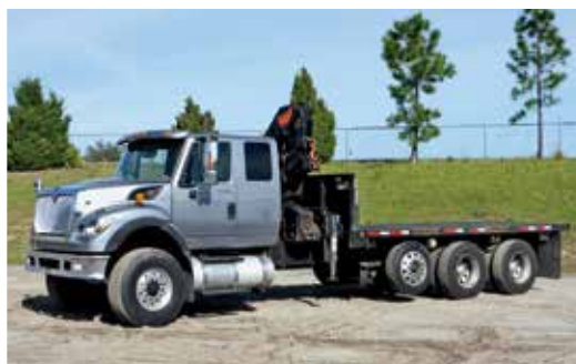
2009 International 7600SBA w/Palfinger PL11502 13670 Lb