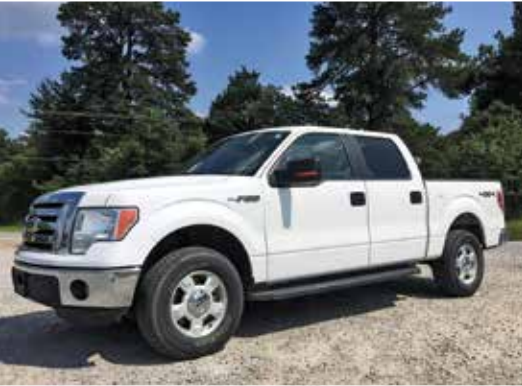
2012 Ford F150 XLT 4x4