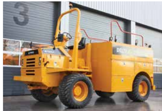
1 of 2 – Unused –Terex TA10 FLT5610