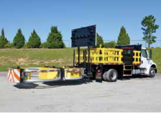
Freightliner M2106 Attenuator