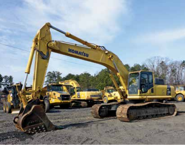
2008 Komatsu PC400-8