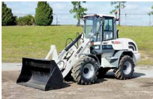
2010 Terex TL100