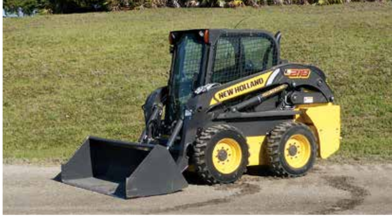
Unused – 2016 New Holland L218