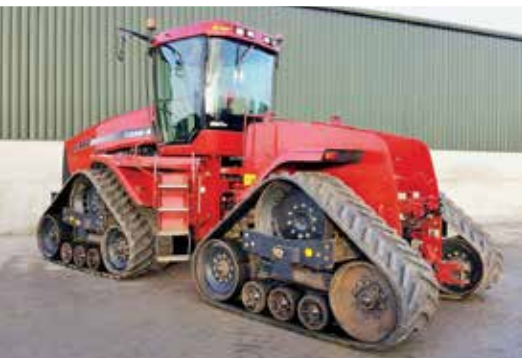
2003 Case STX440 Quadtrac