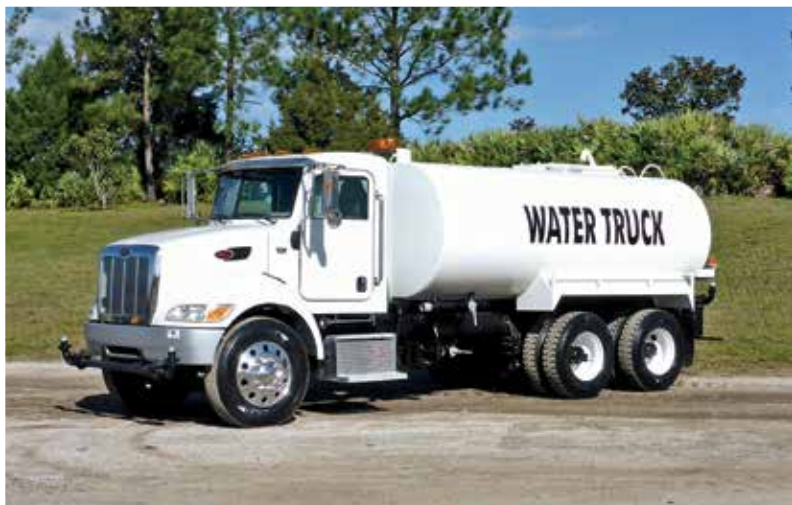
Peterbilt 4000 Gallon