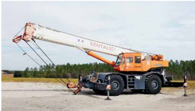
Tadano TR500XL3 50 Ton 4x4x4