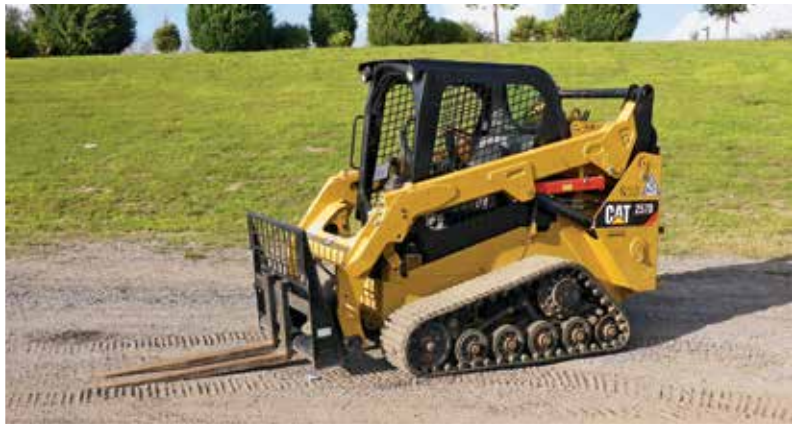
2014 Caterpillar 257D