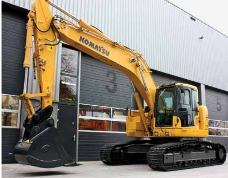
2011 Komatsu PC228USLC-8