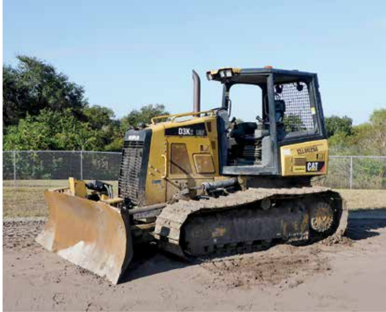
2013 Caterpillar D3K2 LGP