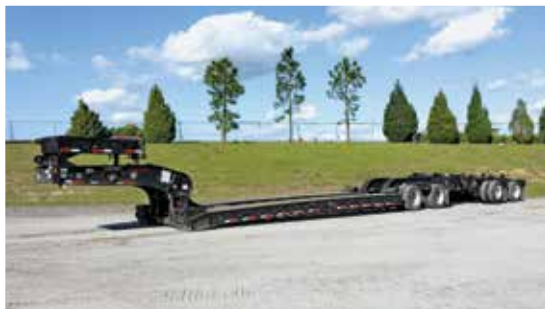
2015 Fontaine Magnitude 603P 60 Ton