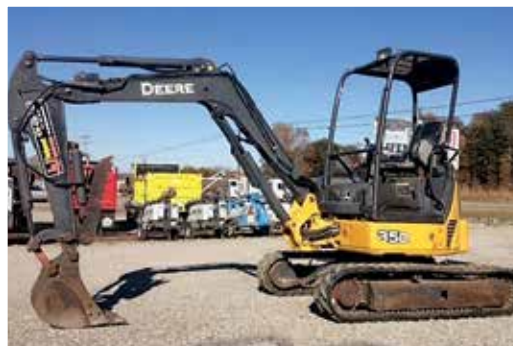
1 of 3 - 2013 Volvo ECR145DL