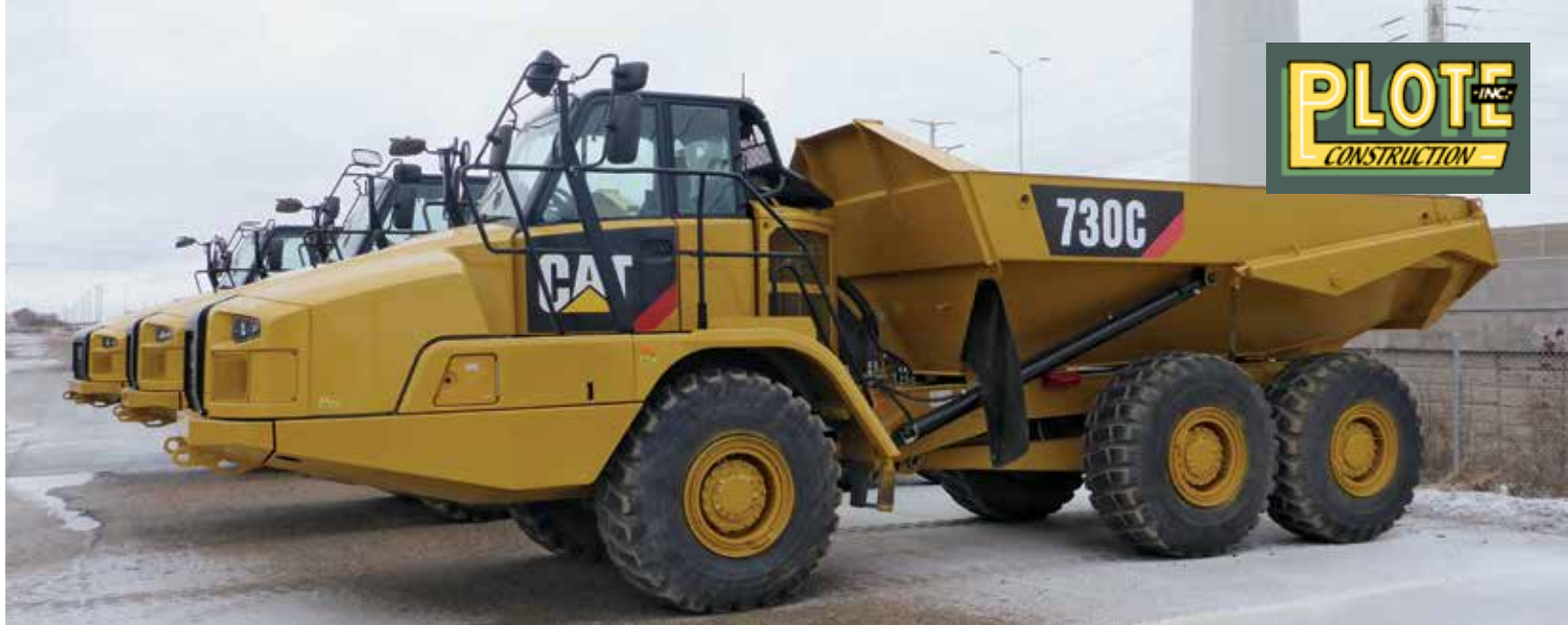
3 of 4 – 2015 Caterpillar 730C 6x6