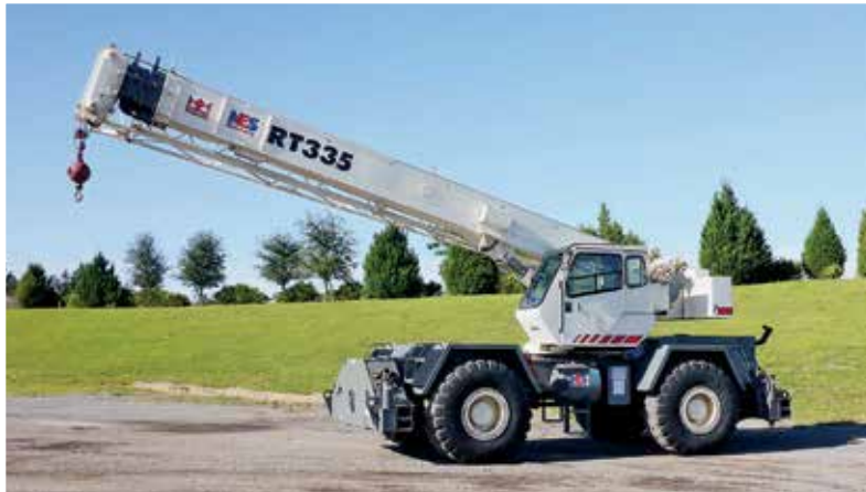
Terex RT335 35 Ton 4x4x4