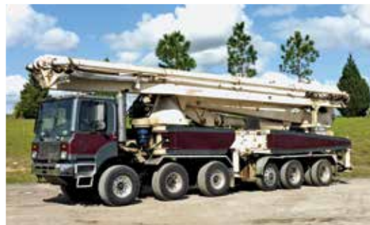
Tor w/Schwing 52M BPL2525H6KVM52 12x6x6