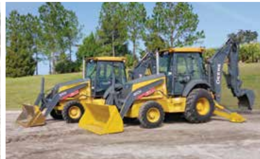
2012 John Deere 410K & 2012 John Deere 310K