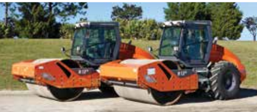
2 – 2015 Hamm H13IX