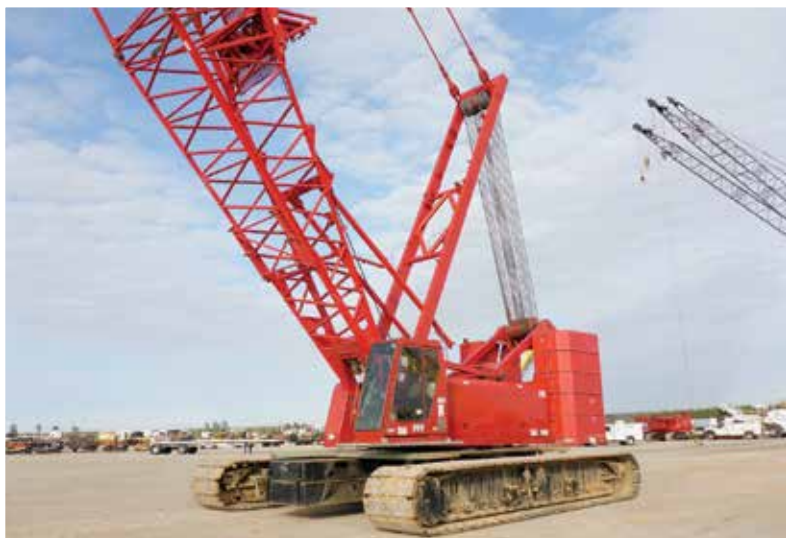
2011 Manitowoc 999 Series III 250 Ton