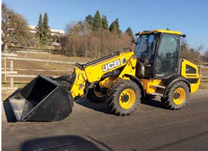
Unused – 2016 JCB TM220 Telescopic