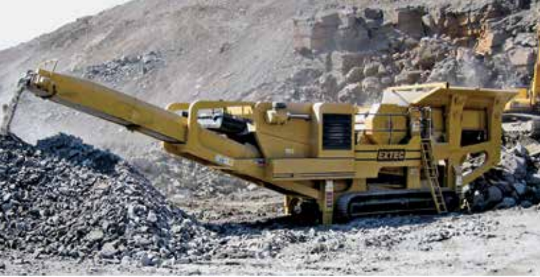
Extec 48 x 30 In. C12+ Jaw