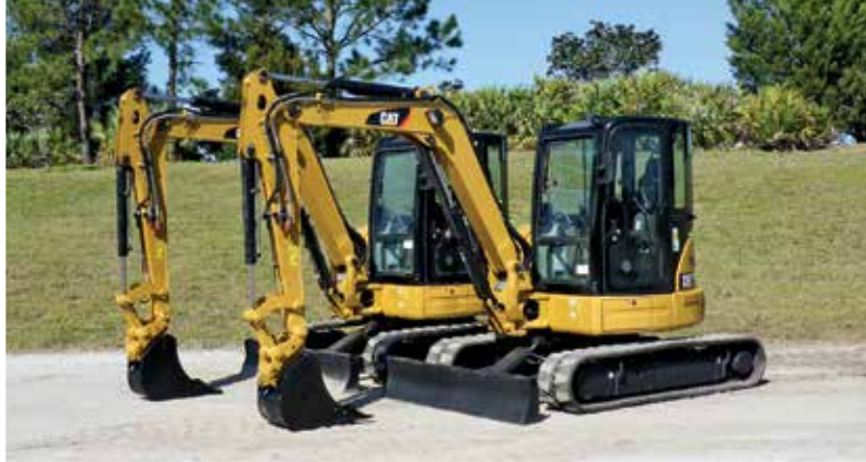
2 of 9 - 2012 Caterpillar 305CR