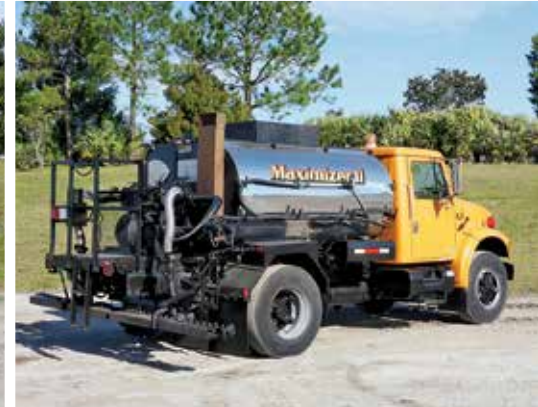
International 4900 1100 Gallon