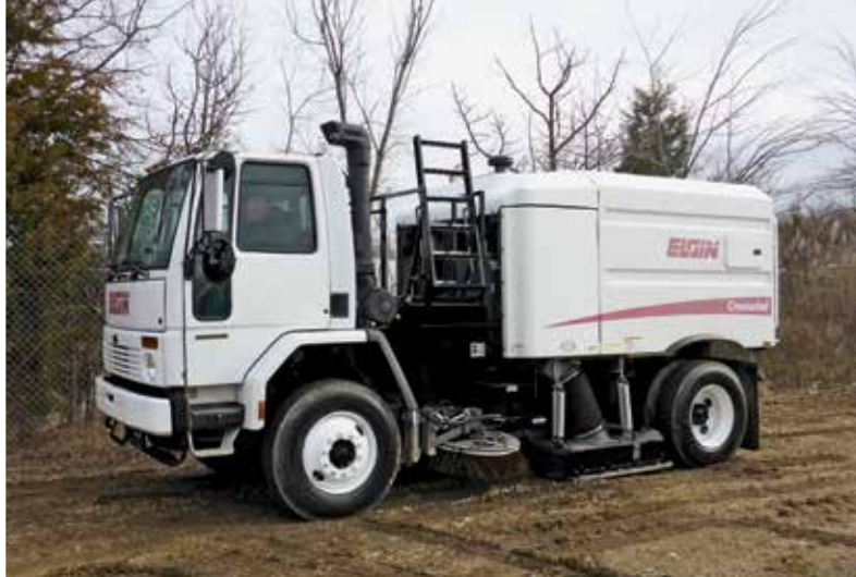
Sterling SC8000 w/Elgin Crosswinds Series J