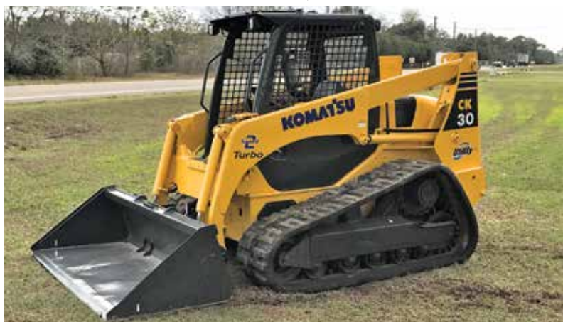
2008 Komatsu CK30