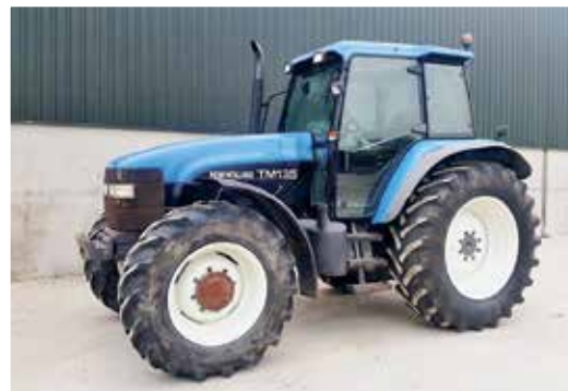
2002 New Holland TM135 Pro