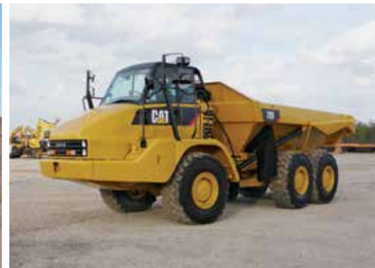
2013 Caterpillar 725 6x6