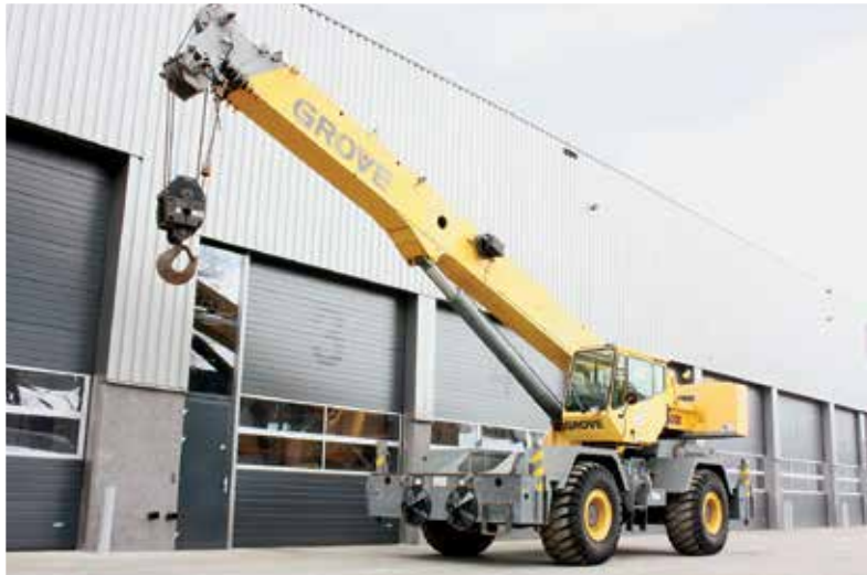
Grove RT600E 50 Ton 4x4x4