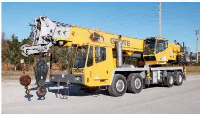
Grove TMS875C 75 Ton 8x4x4