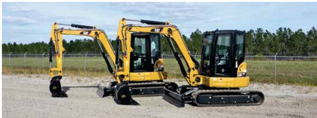
2 – Unused – 2016 Caterpillar 305ECR