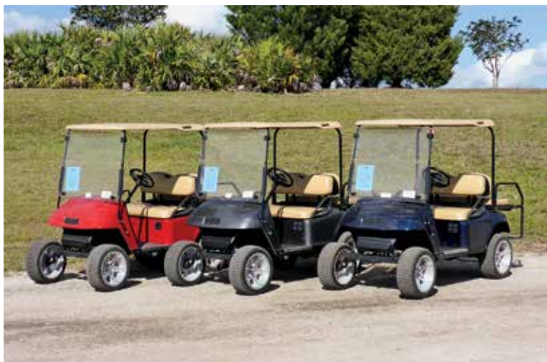
3 of 7 – 2012 EZ Go TXTe48V