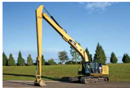
2012 Caterpillar 329EL