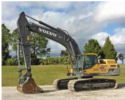
1 of 2 – 2014 Volvo EC340DL