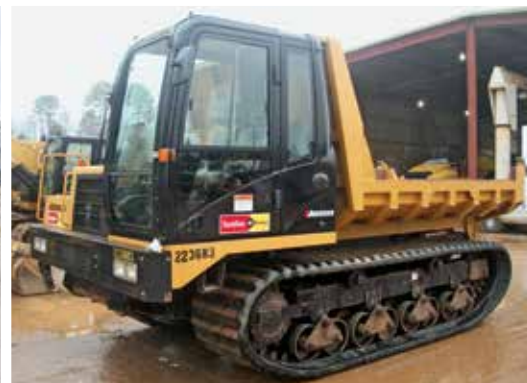
1 of 2 – 2014 Morooka MST2200VD