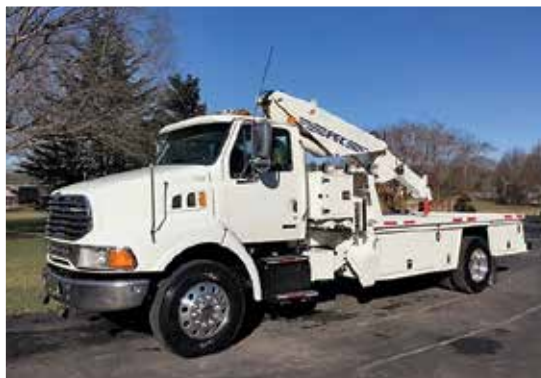
Sterling LT7500 w/FEC 16000 Lb