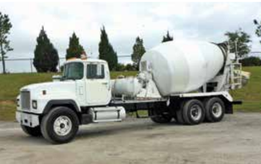
1 of 3 – Mack RD690S