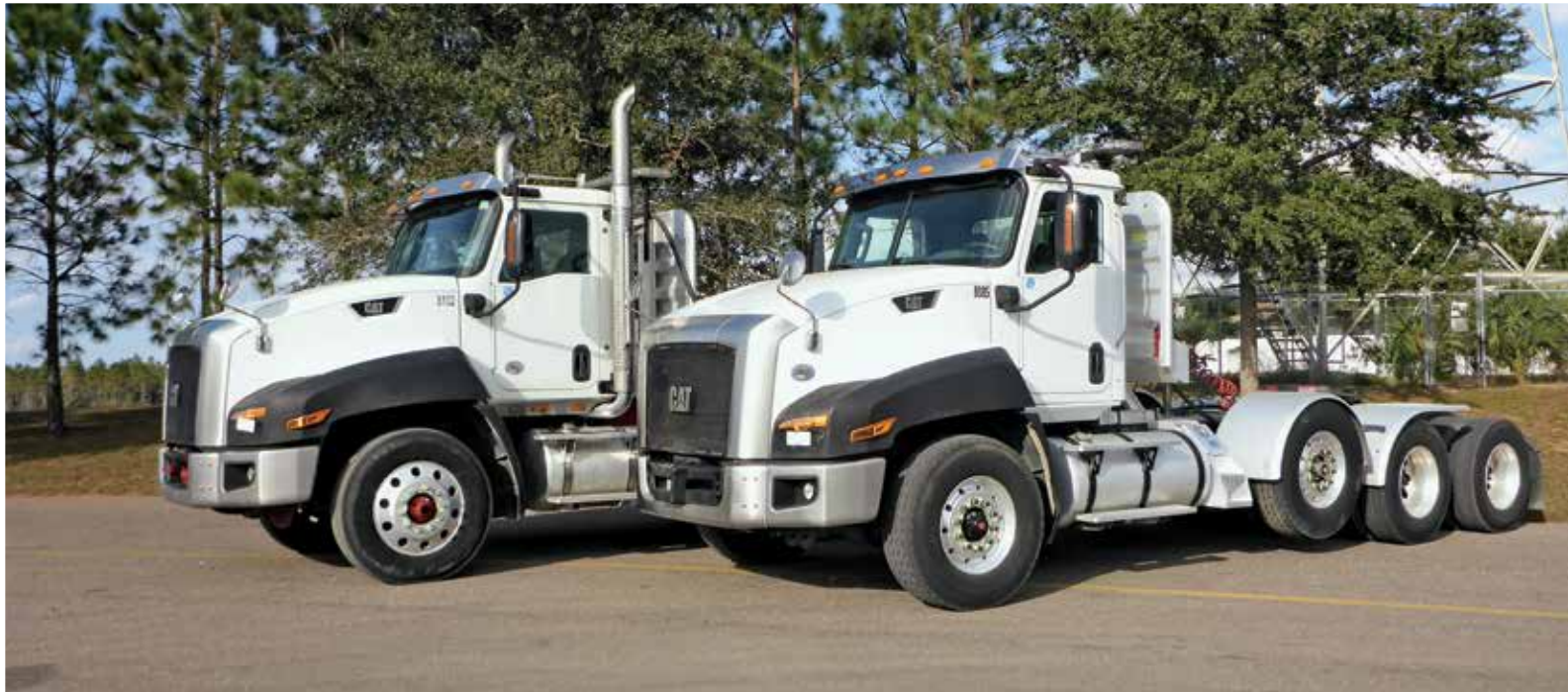
2 – 2013 Caterpillar CT660L

325 truck tractors | 20 bucket trucks | 24 lowboys 62 pickups | 38 equipment trailers | 13 digger derrick trucks