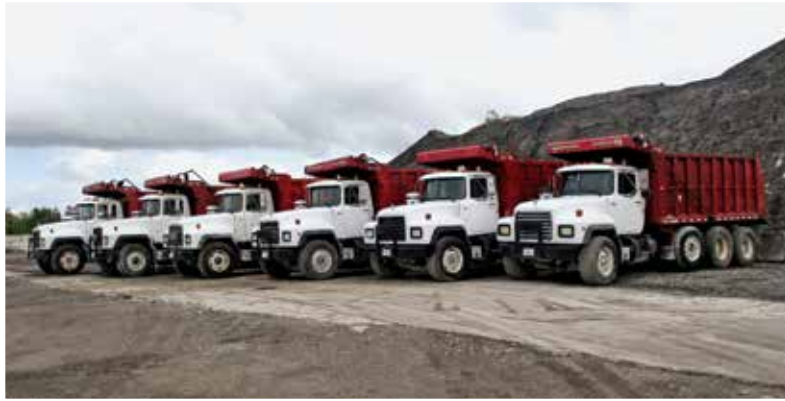
6 of 7 – Mack RD688