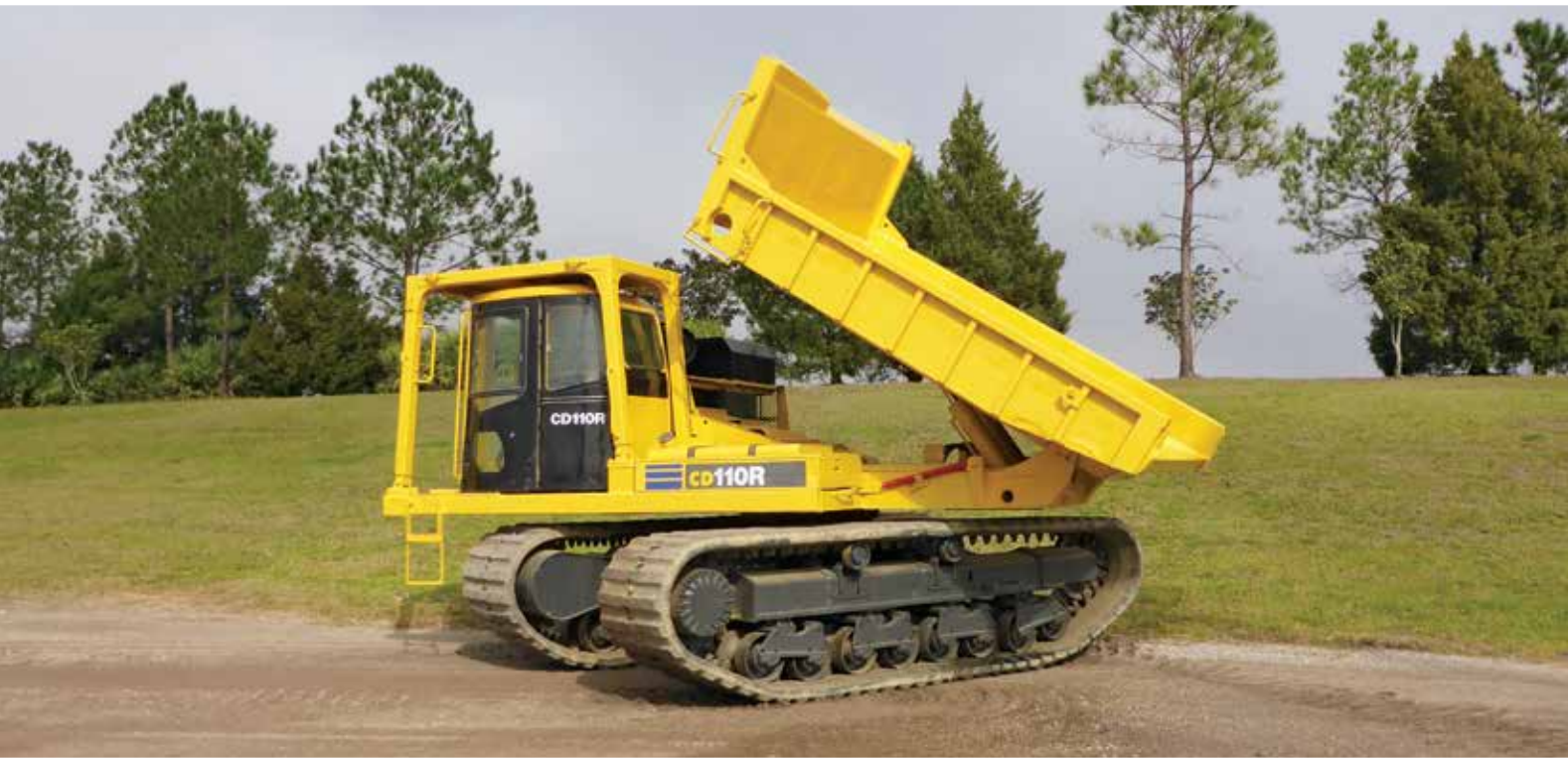
1 of 5 - Komatsu CD110R

62 skid steer loaders | 134 multi terrain loaders | 89 loader backhoes 96 telescopic forklifts | 45 forklifts | 98 scissorlifts | 213 boom lifts 33 dumpers