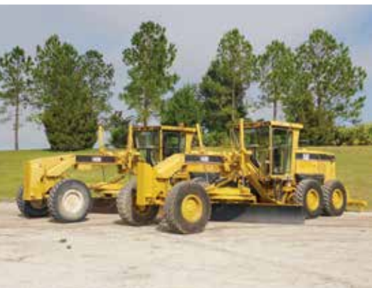
2 of 5 - Caterpillar 140H