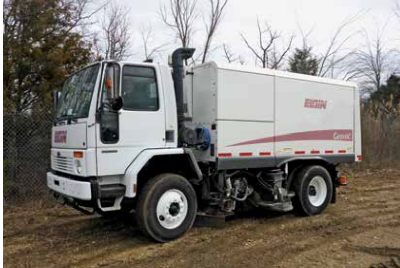
Sterling SC8000 w/Elgin Geovac