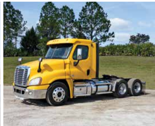
1 of 2 - 2012 Freightliner PX125064ST