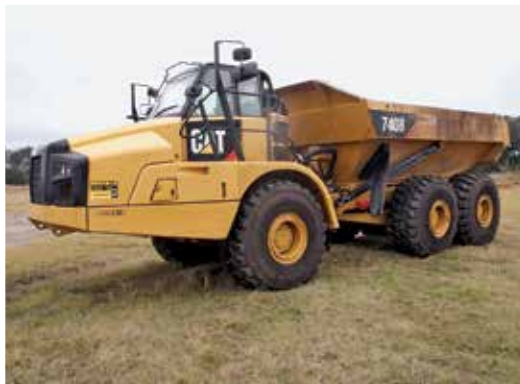
2014 Caterpillar 740B 6x6