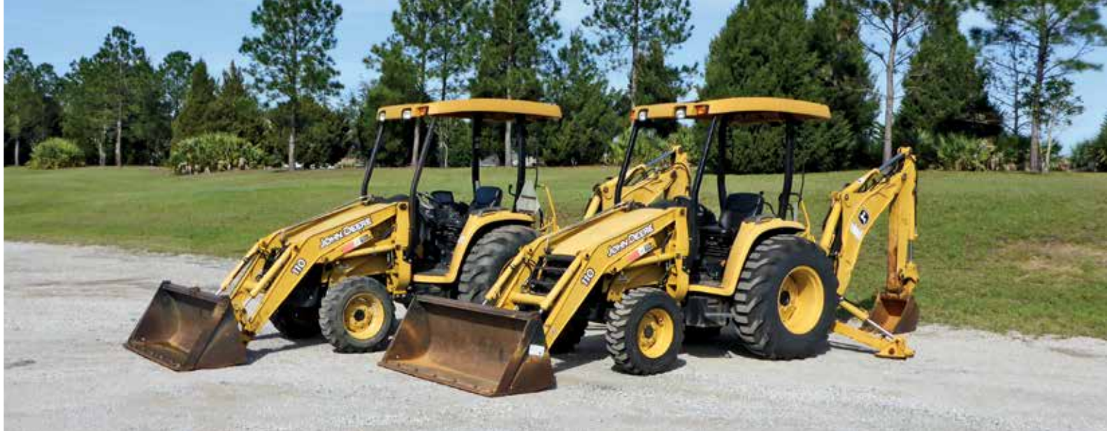
2 of 6 – John Deere 110 4x4