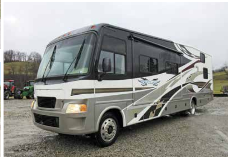
2008 Freightliner Toyhauler