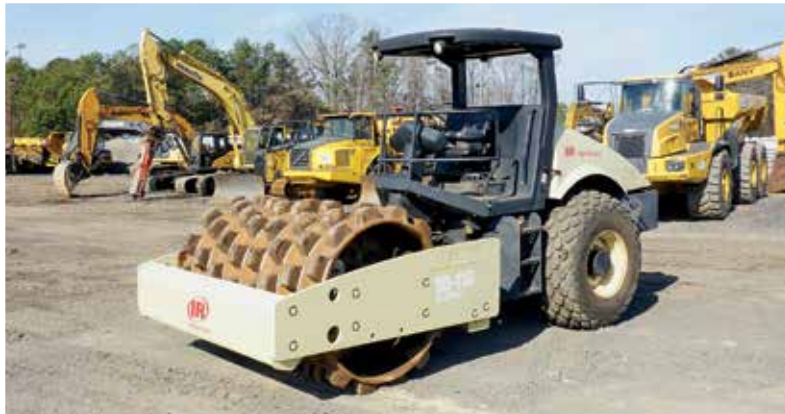
Ingersoll-Rand SD116 TF