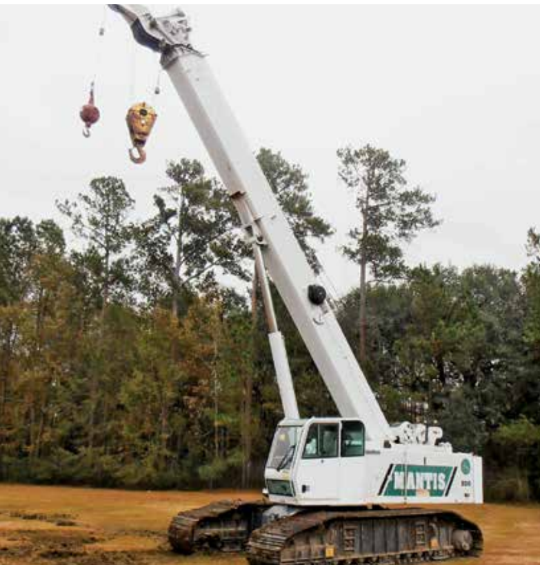
2008 Mantis 9010 45 Ton