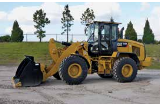
Unused – 2016 Caterpillar 938M