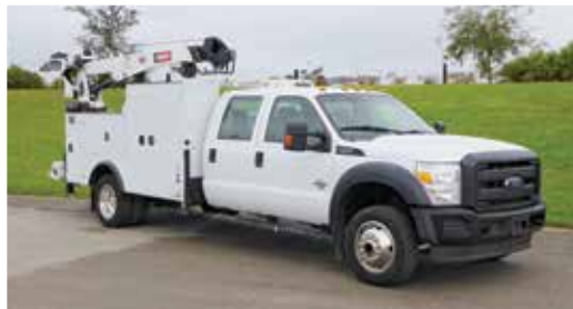
2012 Ford F550 XLT 4x4 w/IMT 3820 7500 Lb