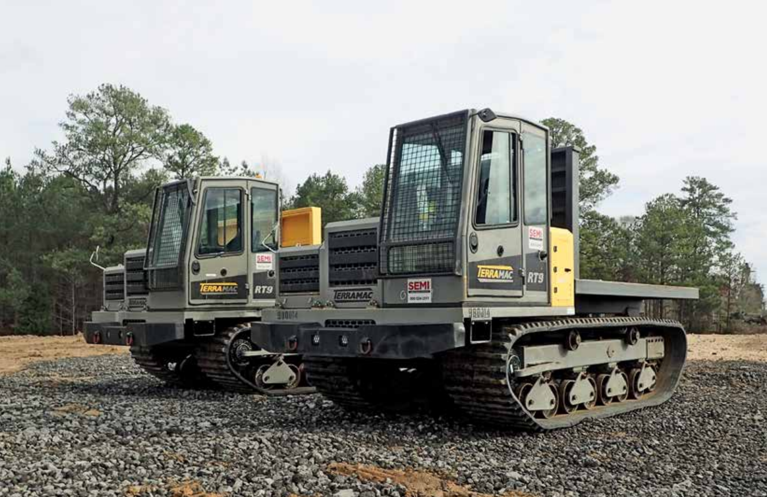
2 of 3 – 2013 Terramac RT9