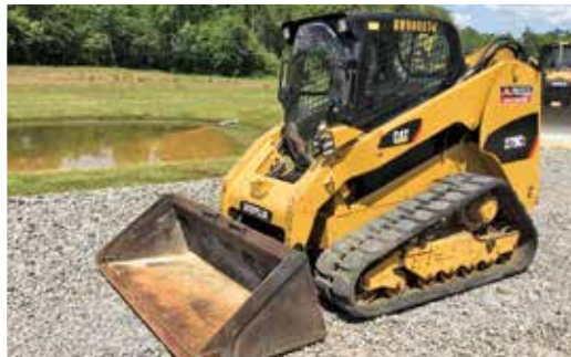
1 of 2 - 2013 Caterpillar 279C2