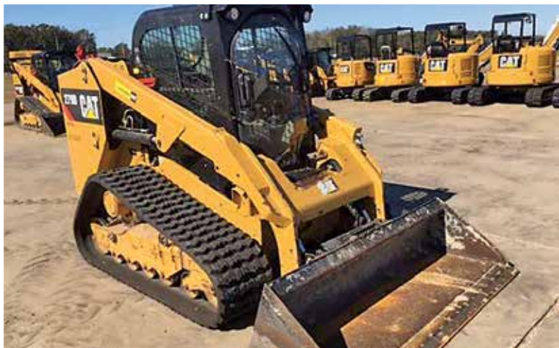
1 of 3 – 2014 Caterpillar 279D