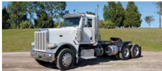
2014 Peterbilt 388