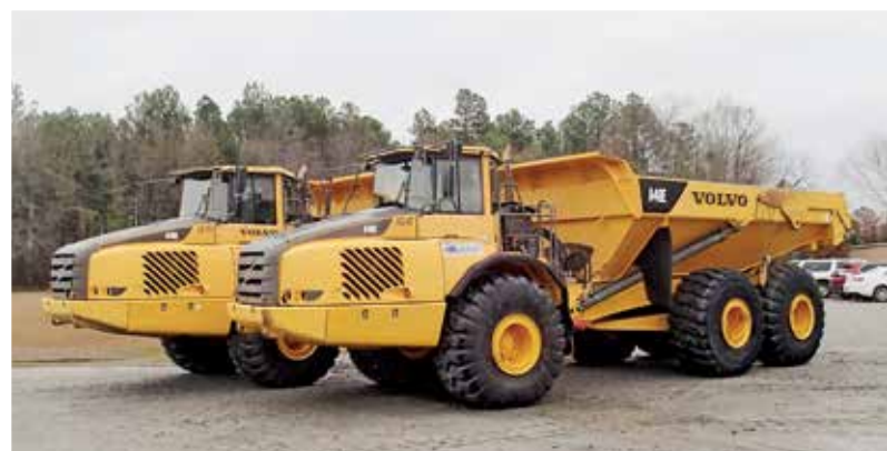
2 – 2012 Volvo A40E