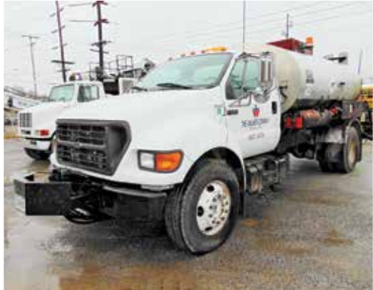
Ford F750 2000 Gallon