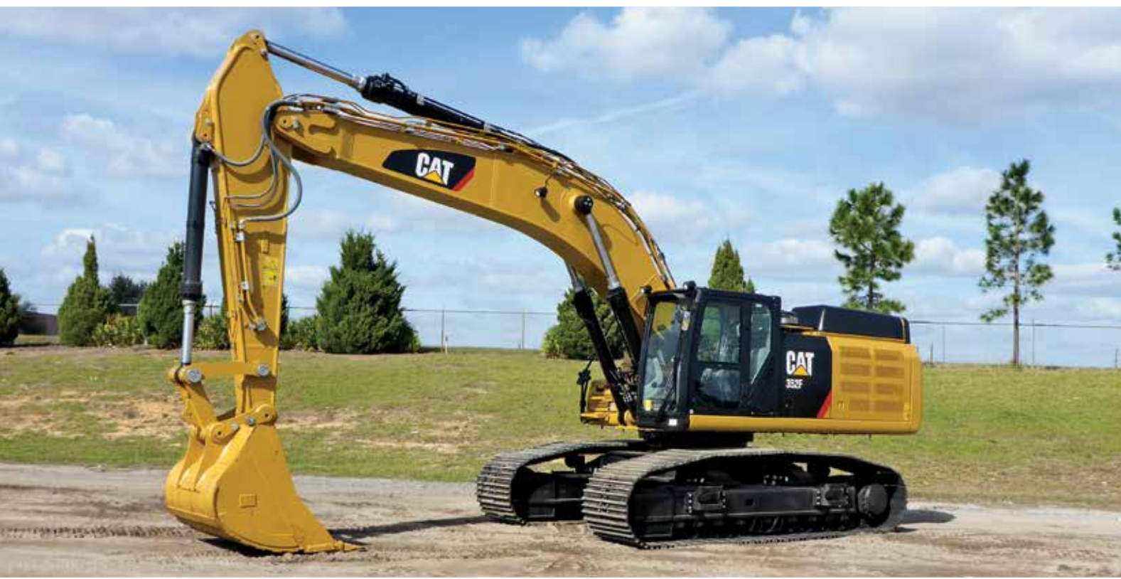
Unused – 2016 Caterpillar 352FL

284 excavators | 84 midi excavators | 91 mini excavators 121 dump trucks | 52 mixer trucks | 33 water trucks | 78 mechanics trucks 34 utility trucks