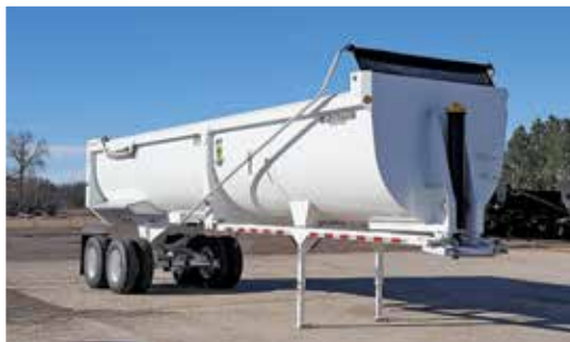
1 of 2 – 2017 Brazio 321BRAZ 32 Ft