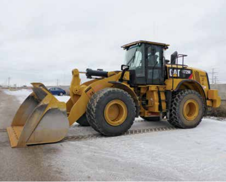
2015 Caterpillar 972M XE