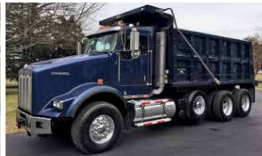
2009 Kenworth T800