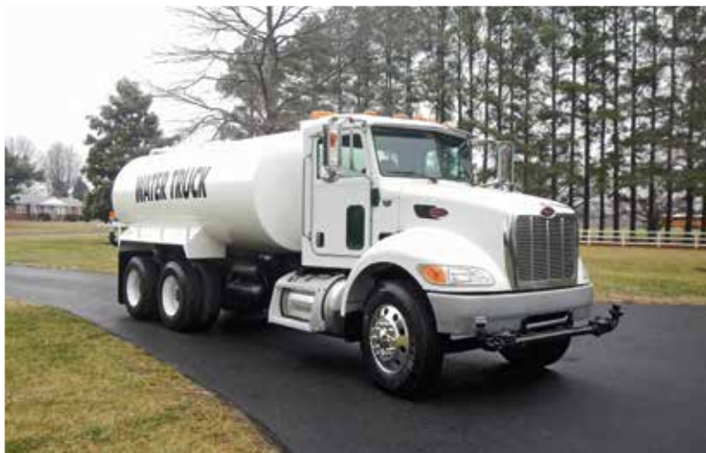
Peterbilt 335 4000 Gallon