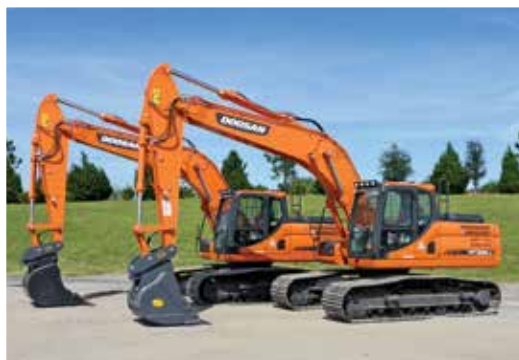
2 – Unused – 2016 Doosan DX225LC-3