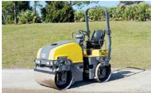
1 of 2 – Unused – 2016 Dynapac CC1200