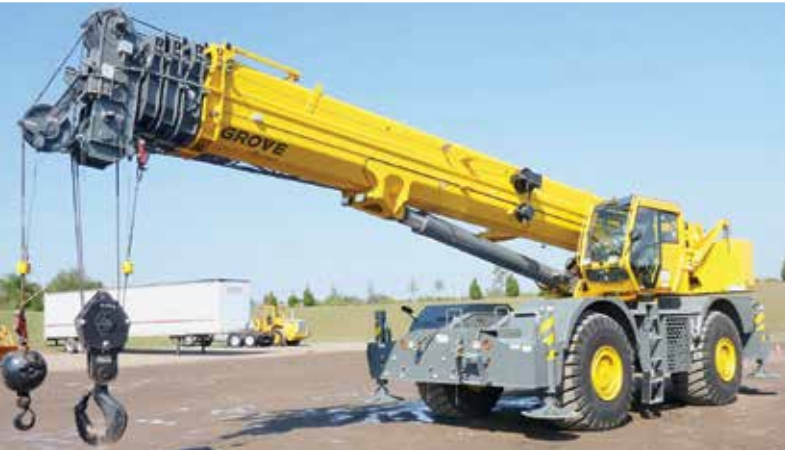
2012 Grove RT890E 4x4x4