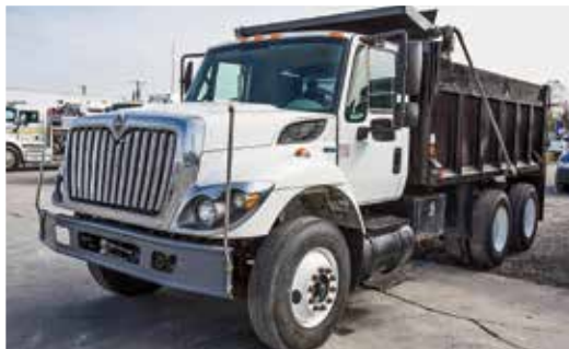
2008 International 7400