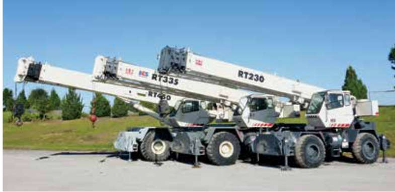
1 of 4 – Terex RT450, 1 of 4 – Terex RT335 & 1 of 7 – Terex RT230