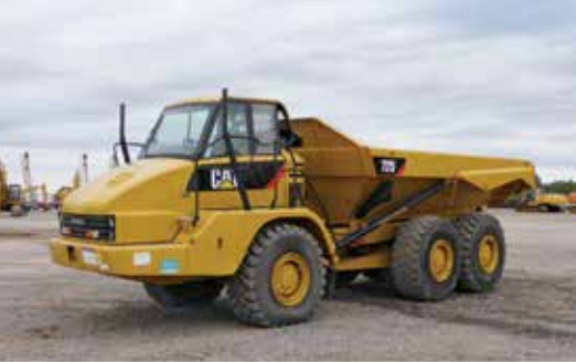
2013 Caterpillar 725 6x6 Located in Tampa, FL – FTZ