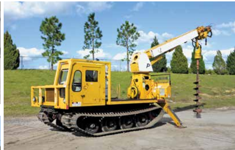
Pitman Polecat P42MT 2B