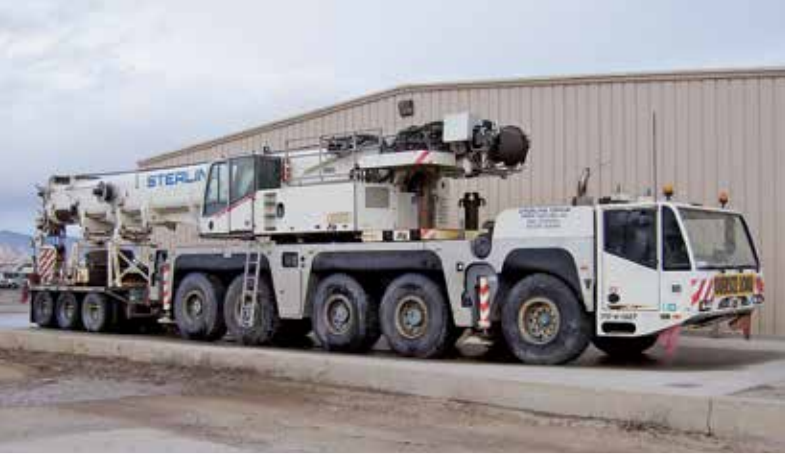
Demag AC140 170 Ton 10x8x8