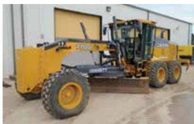
2014 John Deere 770GP