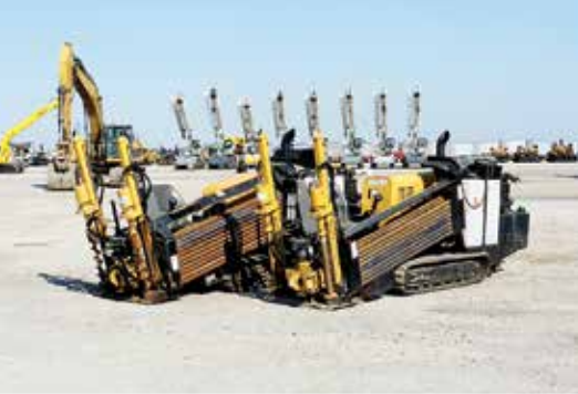
2 – 2014 Vermeer D9X13 Series III