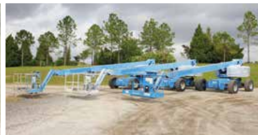
3 of 5 - Genie S85 4x4