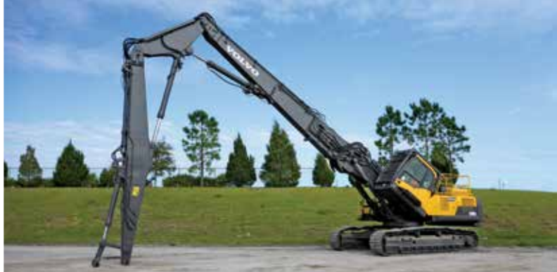
2008 Volvo EC360CL