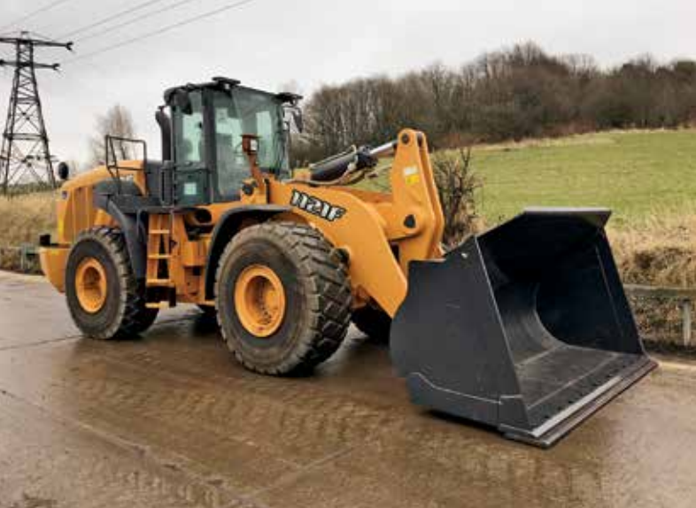
Unused – 2013 Case 1121F