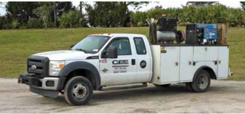
2011 Ford F450 XL