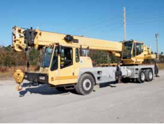
Grove TMX540 40 Ton