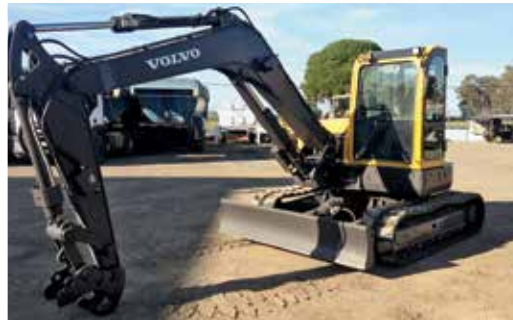
2012 Volvo EC250DLR