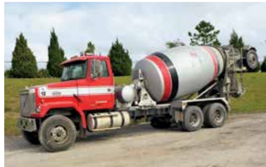
1 of 4 – Volvo ACL