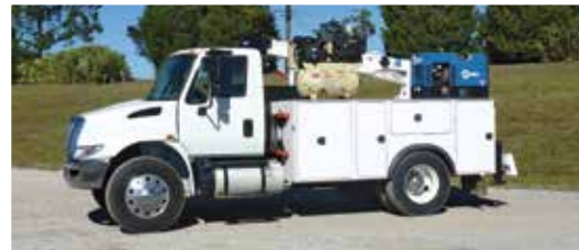
2016 International 4300 w/Autocrane

Orlando, FL February 20–24, 2017 (Mon–Fri)