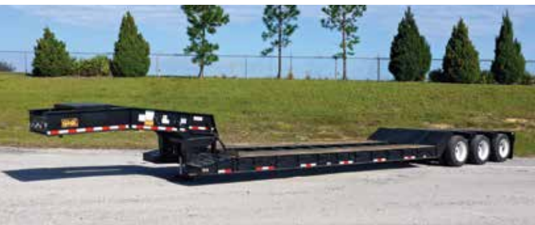
2015 Witzco Challenger 50 Ton