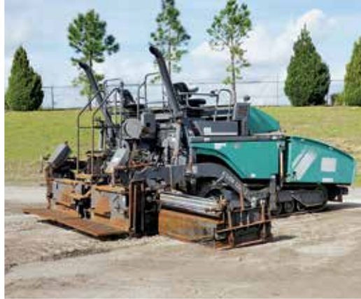
2008 Voegele Vision 5200