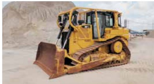
2012 Caterpillar D6T XL