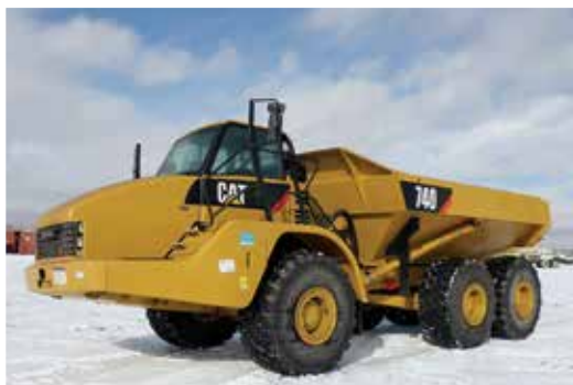
2011 Caterpillar 740 6x6 Located in Tampa, FL – FTZ