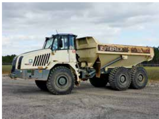
1 of 3 – 2011 Terex TA300 6x6