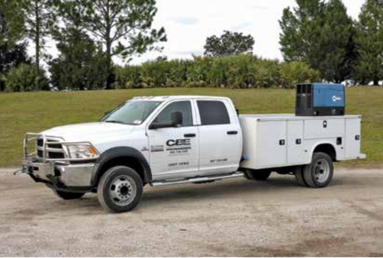
2016 Dodge 5500