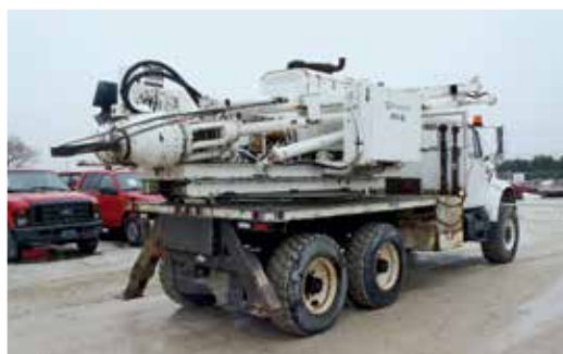
International 4900 6x6 Highway