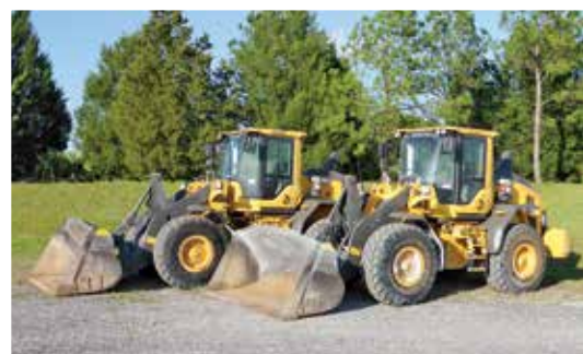
2 of 3 – 2016 Volvo L90H