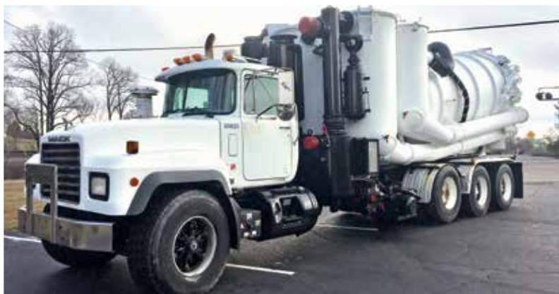
Mack RD688S w/Guzzler