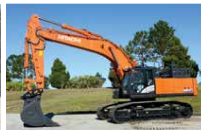
Unused – 2016 Hitachi ZX490LCH6