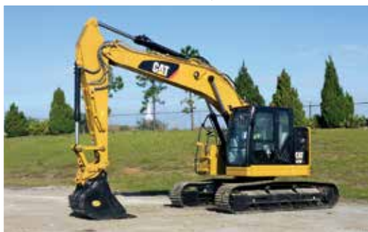
Unused – 2016 Caterpillar 325FL