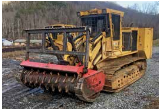
2013 Tigercat 480