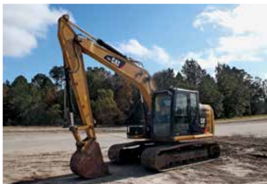
2013 Caterpillar 312EL