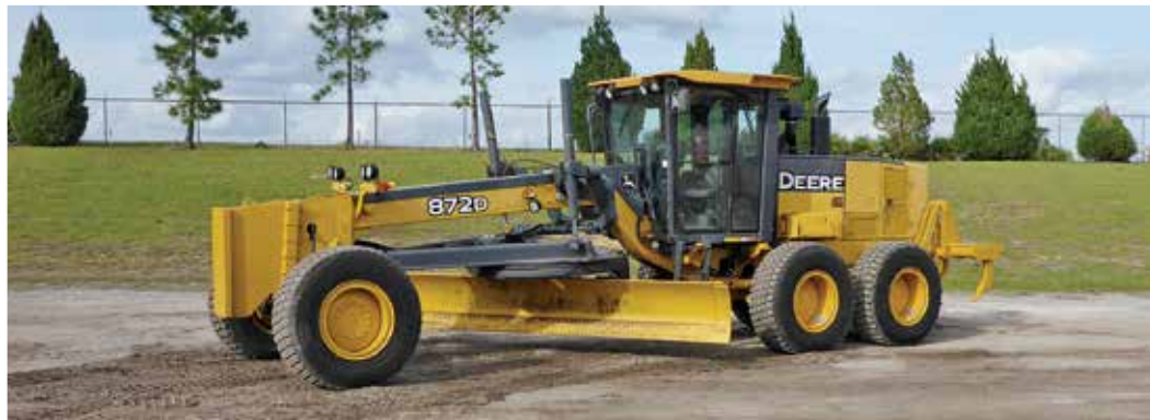
John Deere 872D AWD