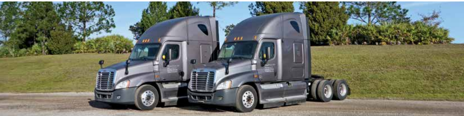
2 of 4 - 2012 Freightliner PX125064ST