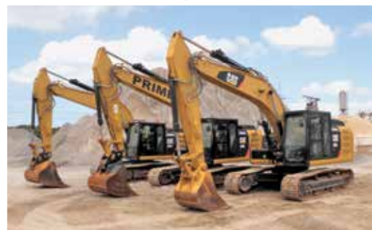
3 of 12 – Caterpillar 320EL