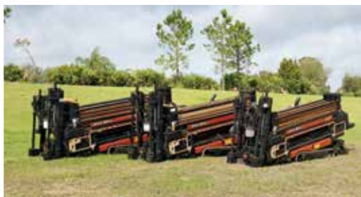
2 – 2013 & 2014 Ditch Witch JT20