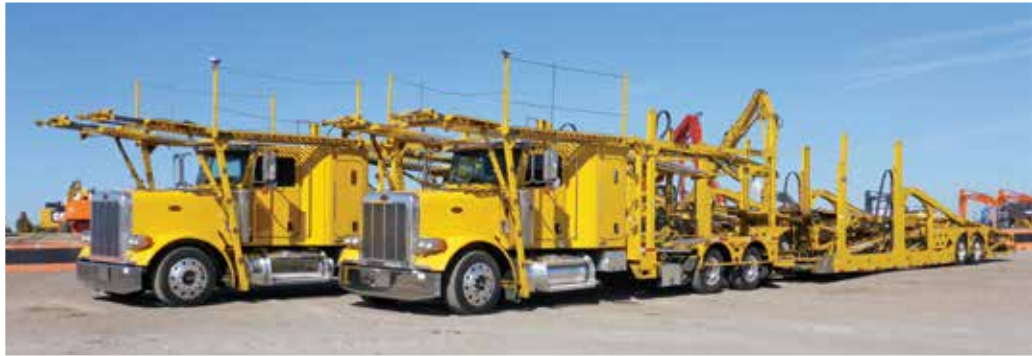
2 of 6 – 2007 Peterbilt 379 w/Boydston 10 Car