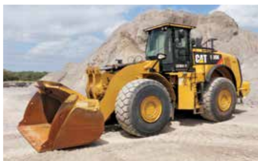
2011 Caterpillar 980K