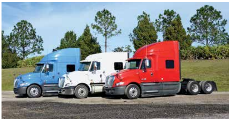
2 of 41 – 2014 & 1 of 13 – 2013 International ProStar+