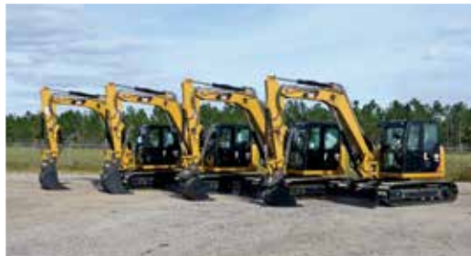
4 of 10 – Unused – 2016 Caterpillar 308E2CR