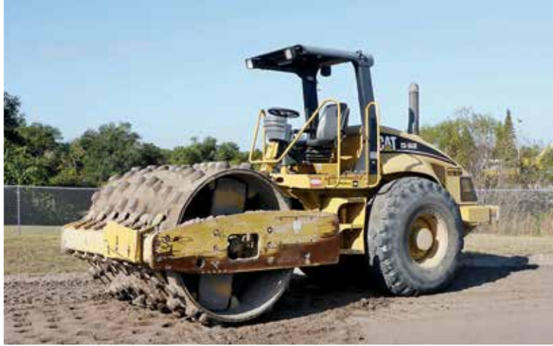
1 of 2 – Caterpillar CS563E