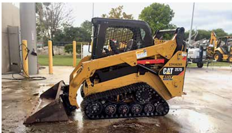
1 of 4 – 2014 Caterpillar 257D