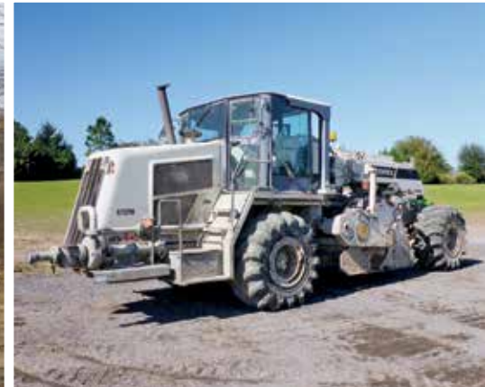
2009 Terex RS445C 4x4x4