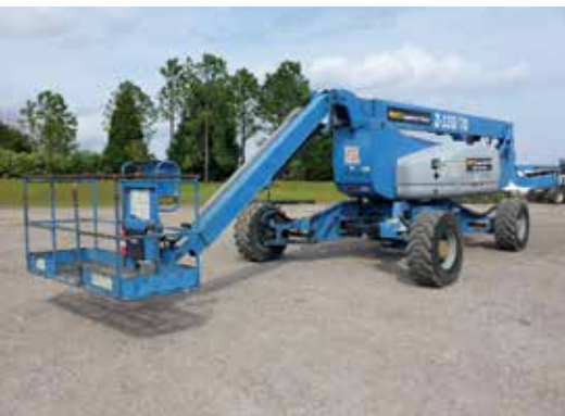
Genie Z135/70 4x4x4