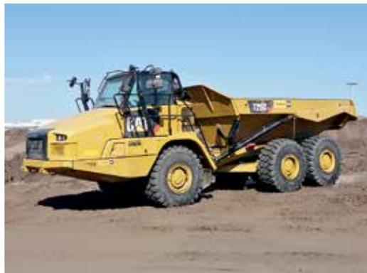
1 of 5 – 2014 Caterpillar 725C 6x6