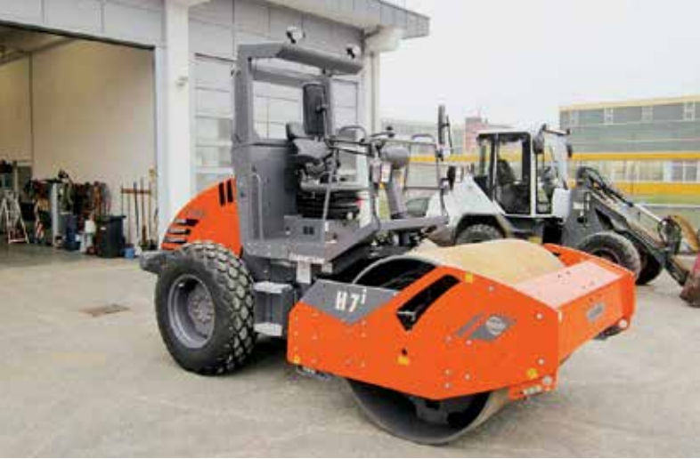
Unused – 2016 Hamm H7i