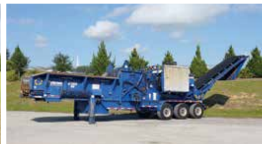
2012 Peterson 4700B Grinder