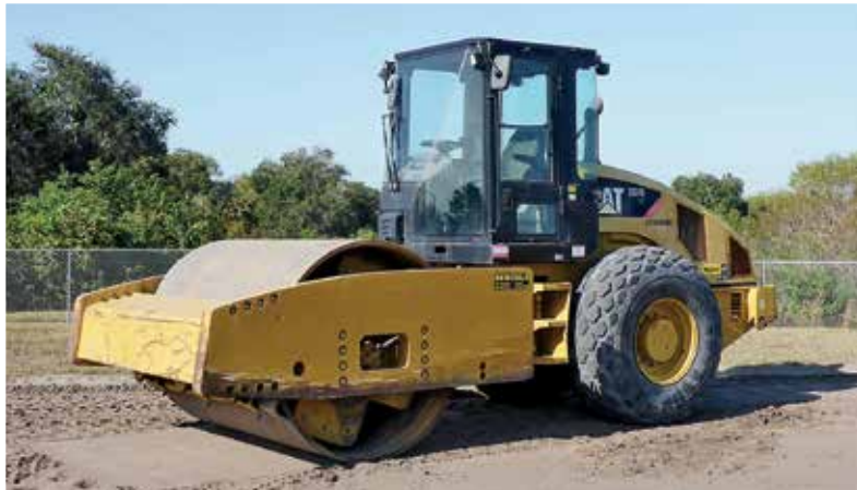
2011 Caterpillar CS76XT