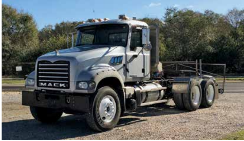
1 of 5 – 2012 Mack GU713