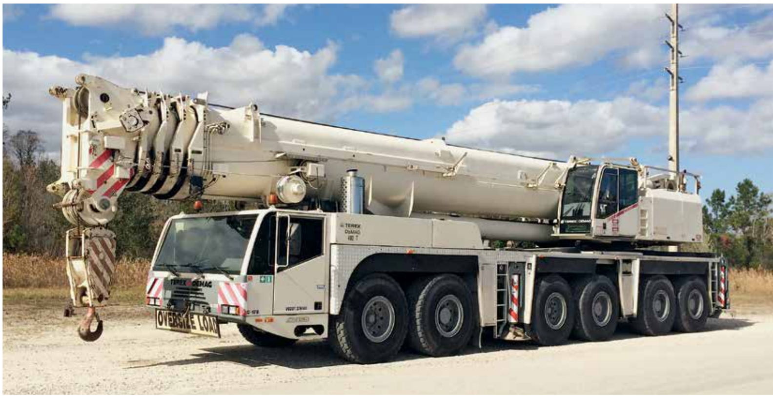
Terex Demag AC350 400 Ton 12x8x10

110 crawler tractors | 87 cranes | 61 asphalt pavers | 27 boom trucks 280 compaction equipment | 22 asphalt distributor trucks