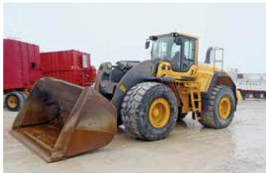
2012 Volvo L250G