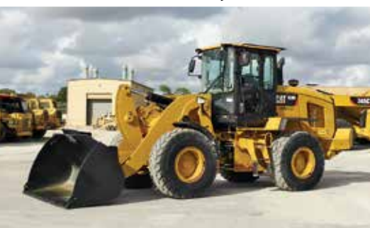
1 of 2 – 2012 Caterpillar 938K