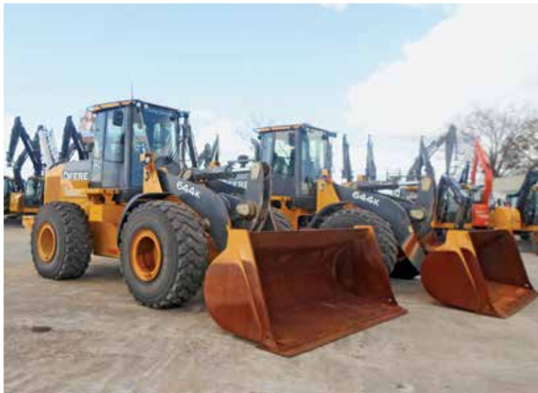
2 – 2015 John Deere 644K