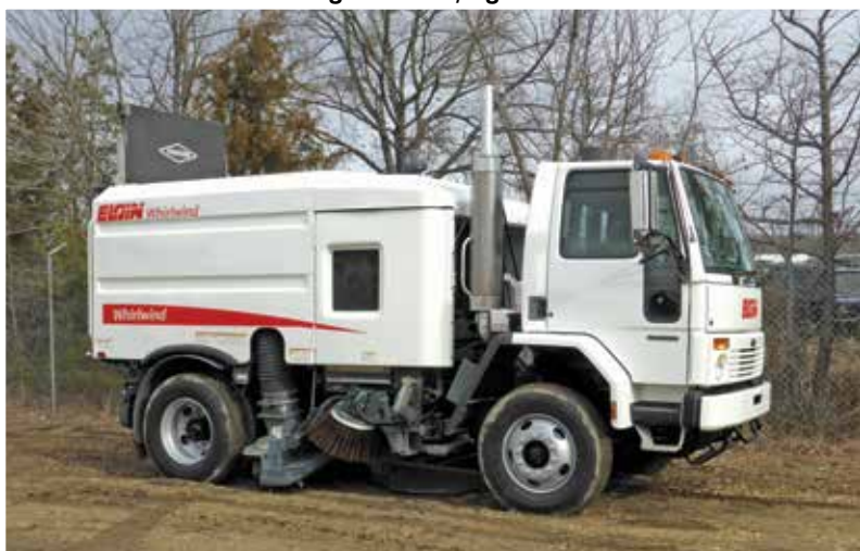
Sterling SC8000 w/Elgin Whirlwind