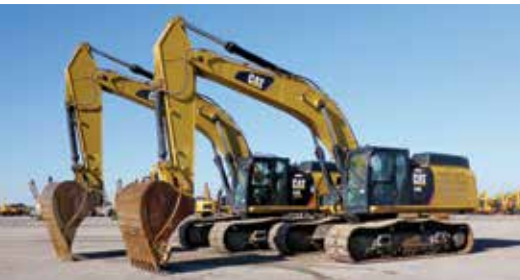
2 of 6 – 2013 Caterpillar 349EL