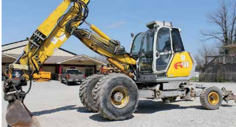
Menzi Muck A91