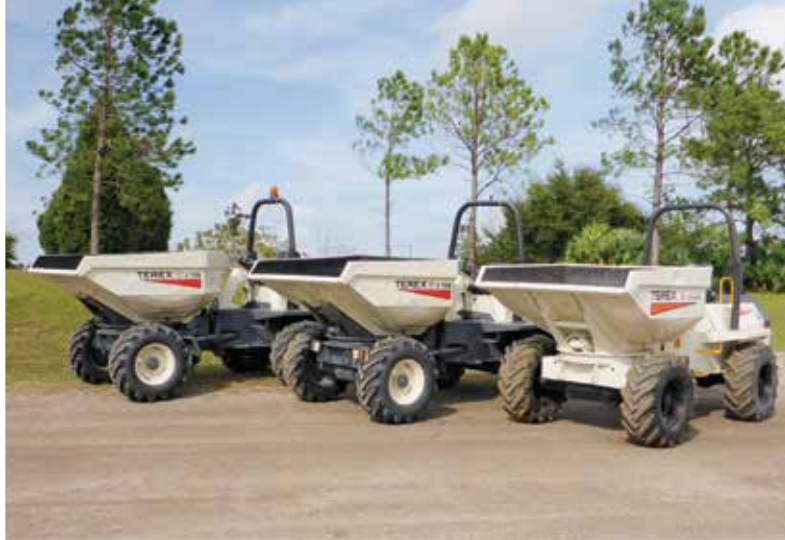
3 of 10 – Terex Bedford TA63