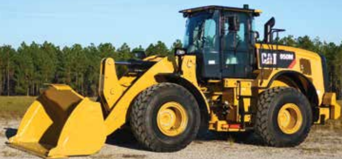
Unused – 2016 Caterpillar 950M