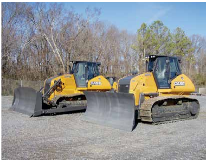
Unused – 2016 Case 2050M XLT & Unused – 2014 Case 2050M LT Located in Tampa, FL – FTZ