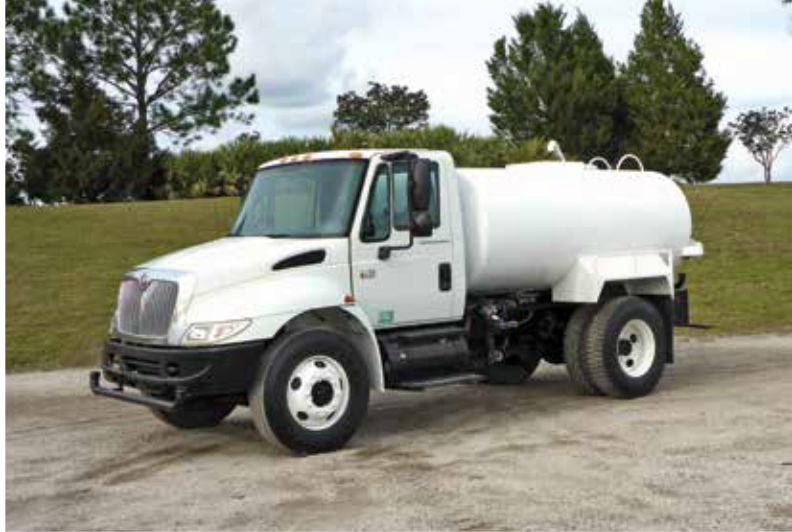
International 4200 2000 Gallon