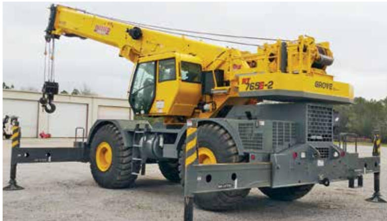
2013 Grove RT765E2 65 Ton 4x4x4