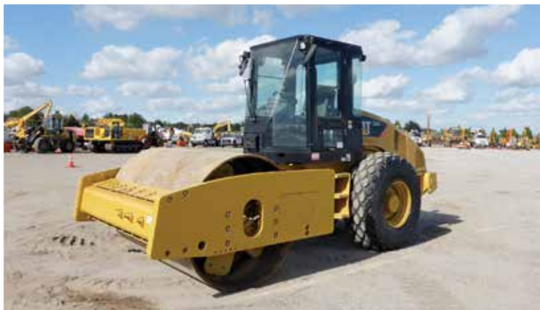
2011 Caterpillar CS64