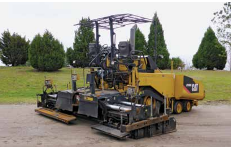
1 of 2 – 2010 Caterpillar AP600D