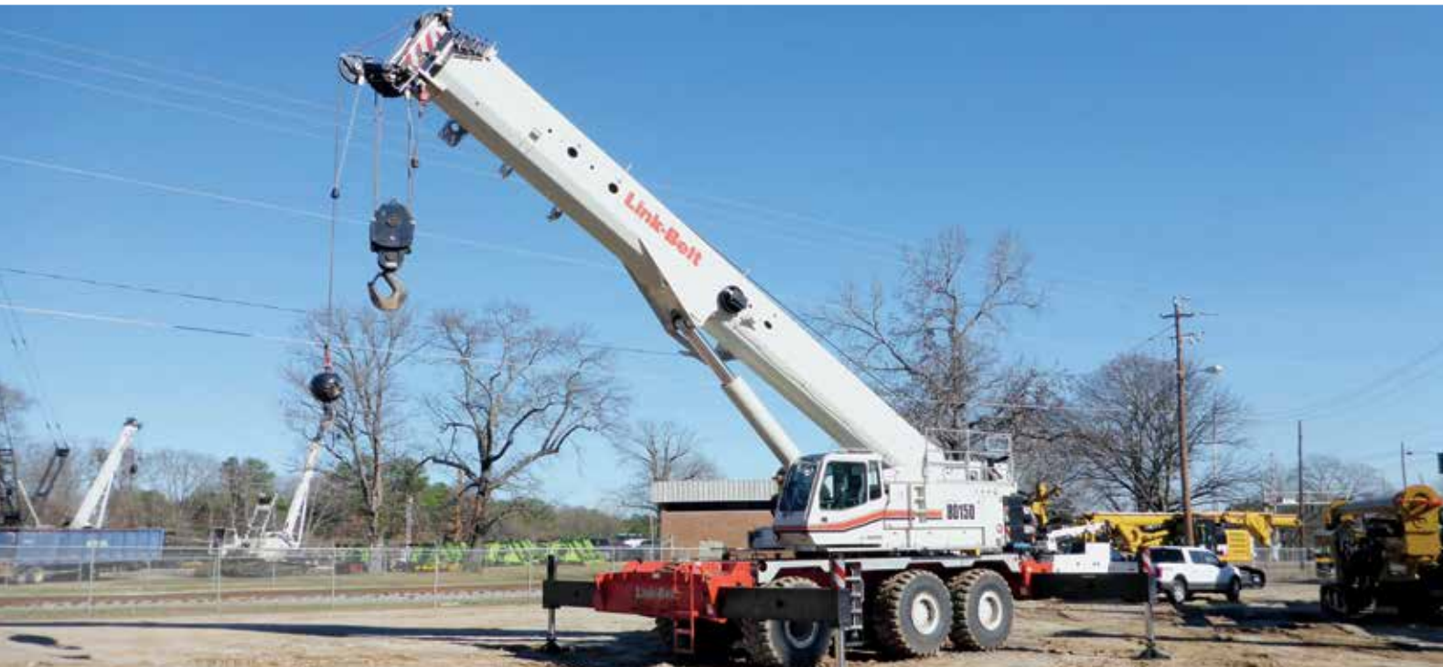
2015 Link-Belt RTC80150 Series II 150 Ton 6x6x6