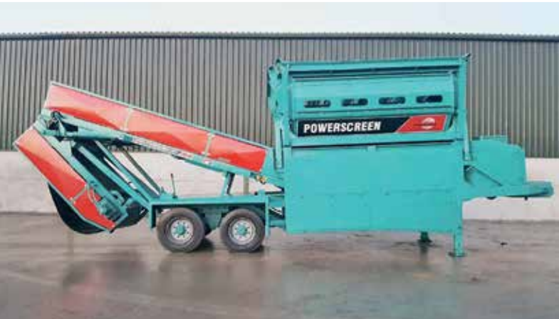
Powerscreen Powergrid 1200 8 x 10 Ft 2 Deck