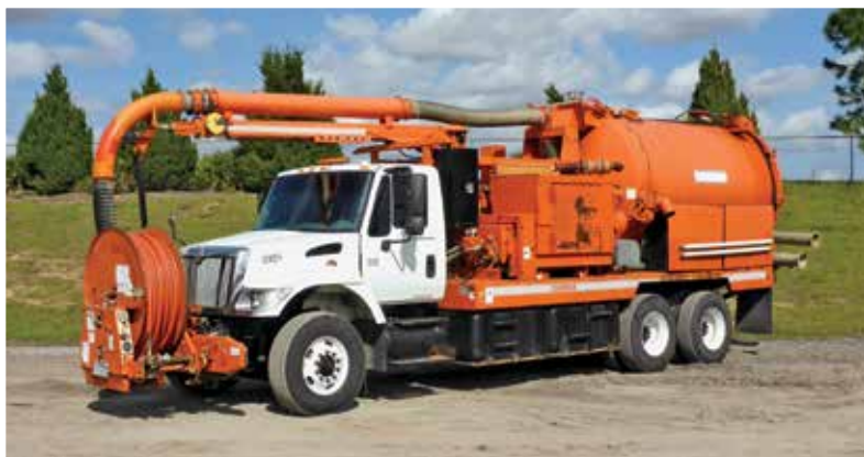
International 7400 w/Vac-ConV316LHAE