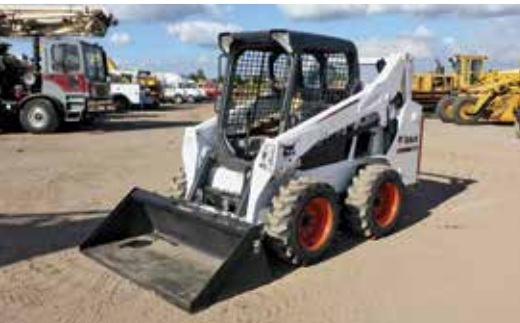
2014 Bobcat S590