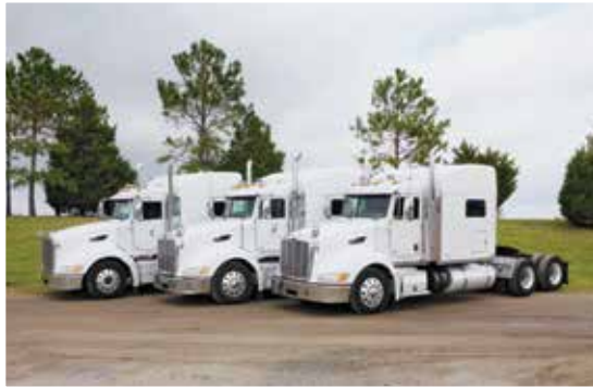
3 of 10 – 2012 Peterbilt 386