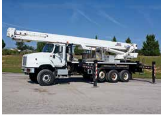
International 5600l w/Skylift S158MD