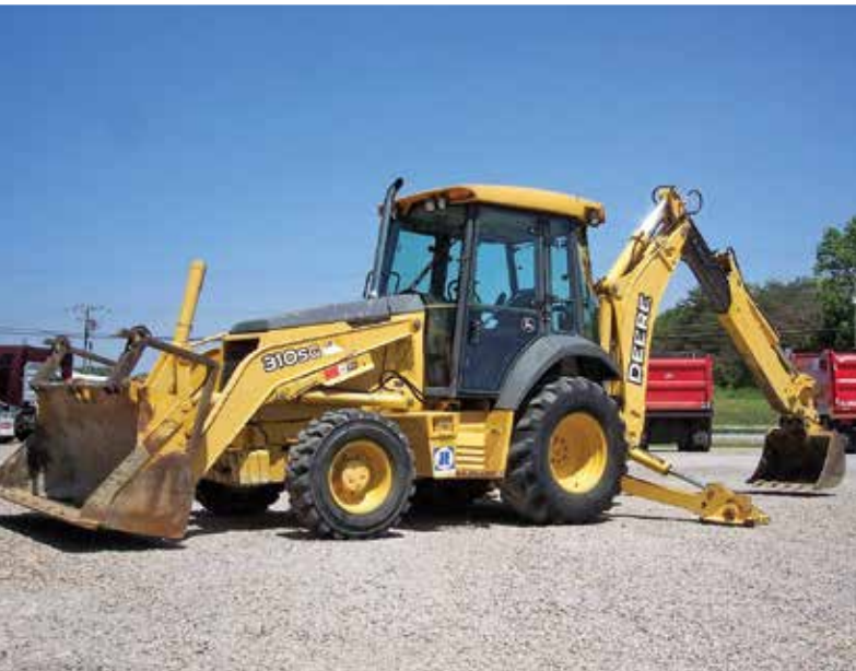
John Deere 3105G