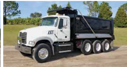
2011 Mack GU713