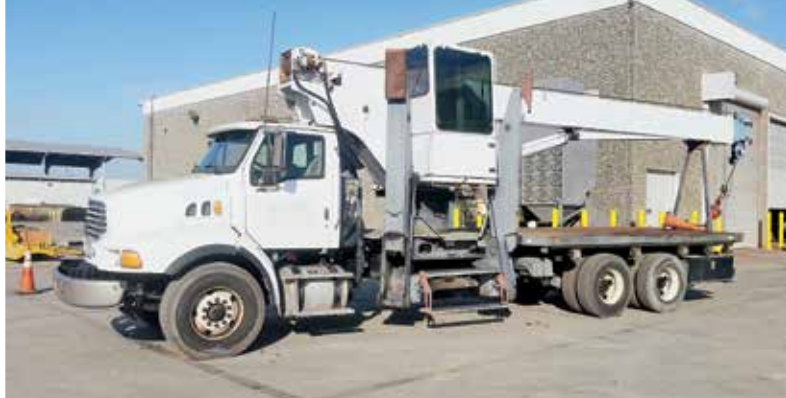
Sterling LT9513 w/Manitex 30102SX 30 Ton