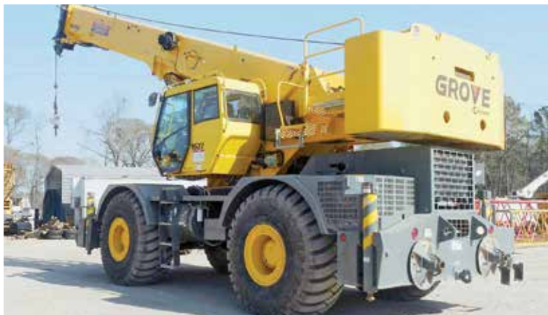
1 of 2 - 2011 Grove RT760E 4x4x4