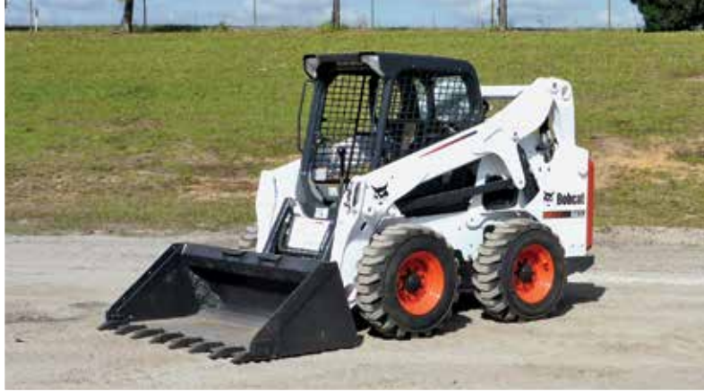
2013 Bobcat S650 High Flow