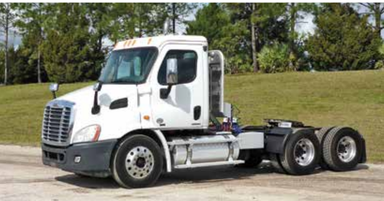
2010 Freightliner PX113064ST