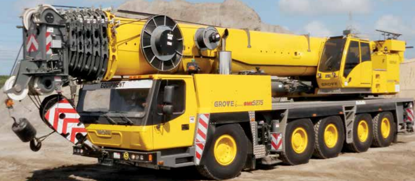
2014 Grove GMK5275 275 Ton 10x6x10 – Low meter hours