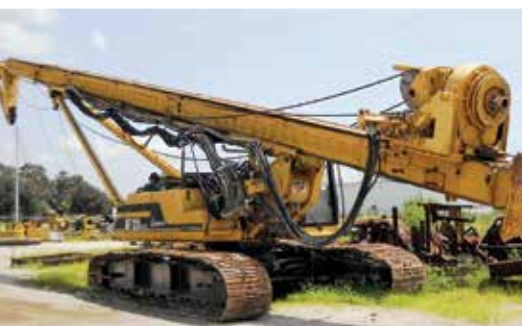
1 of 2 – IMT AF200CFA