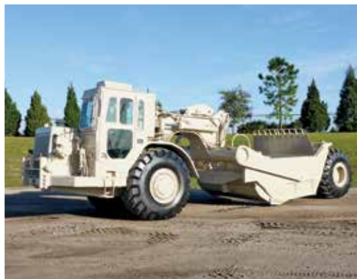
1 of 2 - Caterpillar 621B