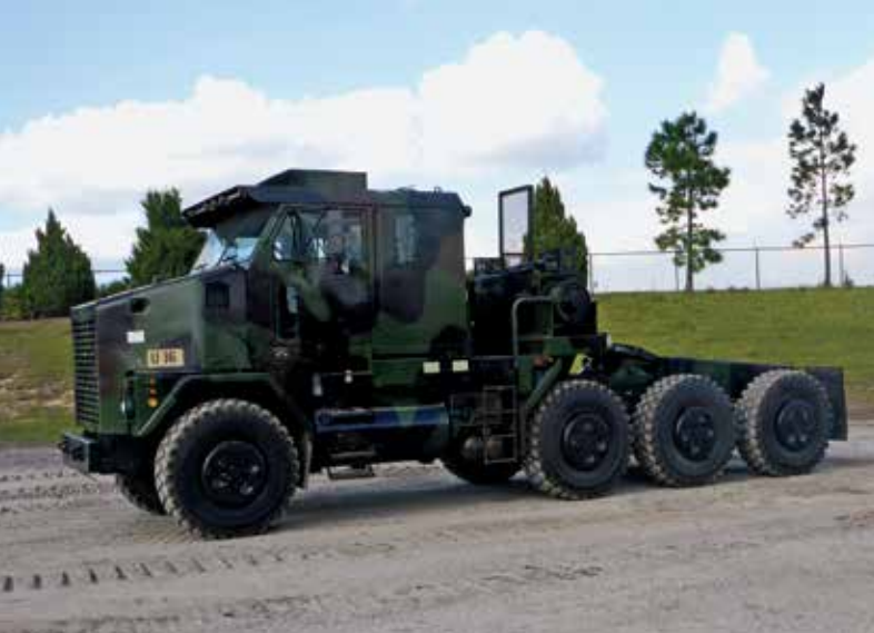
Oshkosh M1070 8x8