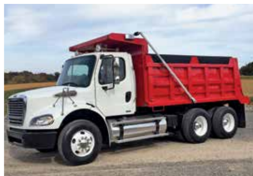
2008 Freightliner M2112