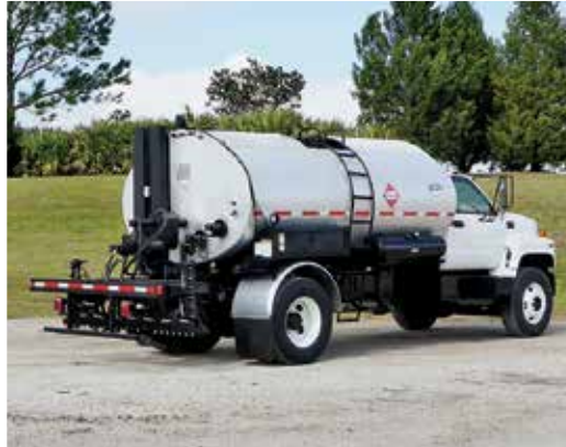
GMC C7500 2000 Gallon