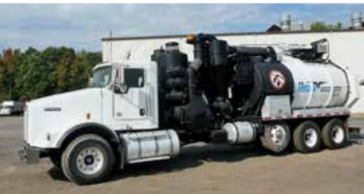
1 of 2 – 2012 Kenworth T800 w/Vactor HHX