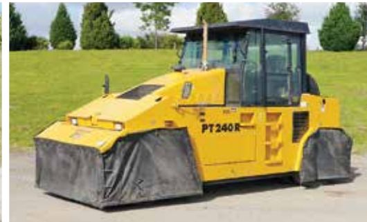
2010 Volvo PT240R