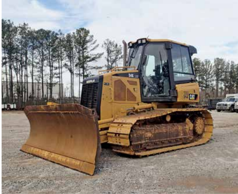
2008 Caterpillar D4K LGP