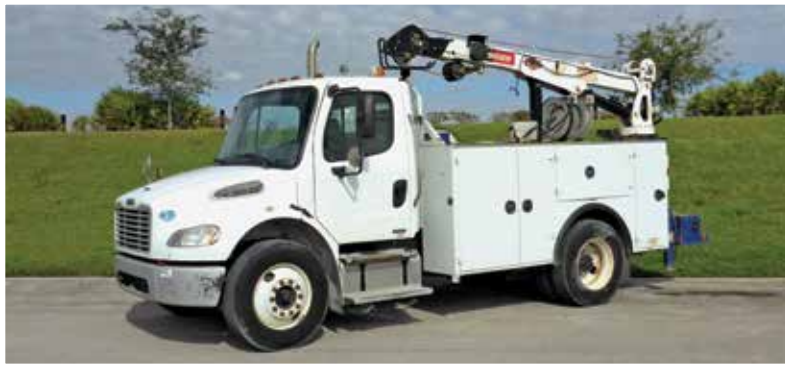
2008 Freightliner MR w/IMT 5020