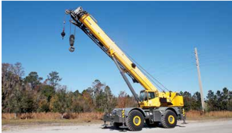
2010 Grove RT880E 80 Ton 4x4x4