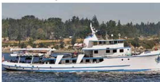
1944 Levington Shipbuilding CO "Modoc" 146 x 34 x 16 Ft