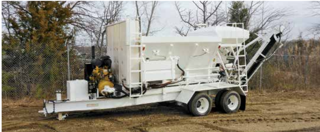
Elkin 5 Cu Yd