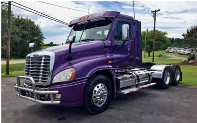
2010 Freightliner 125 Cascadia