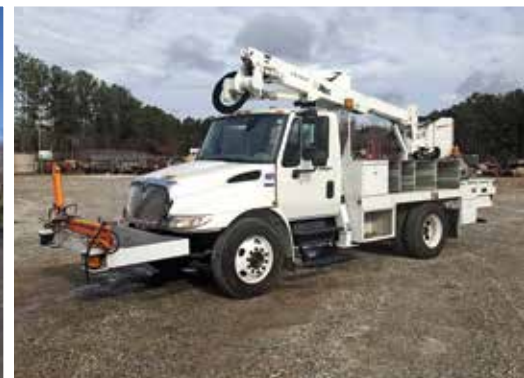
2008 International 4300 w/Altec AT37-G