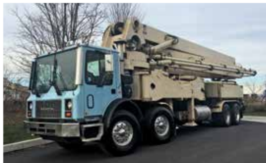
Mack MR688S w/Schwing 20235KVM42