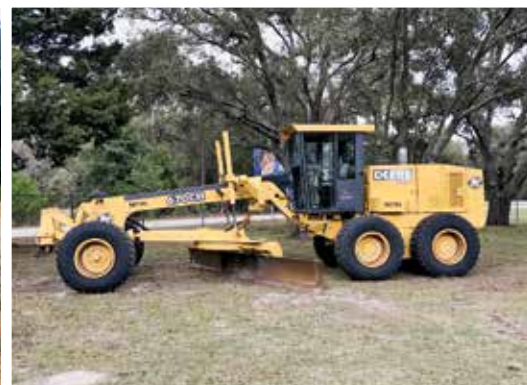
John Deere 670CH