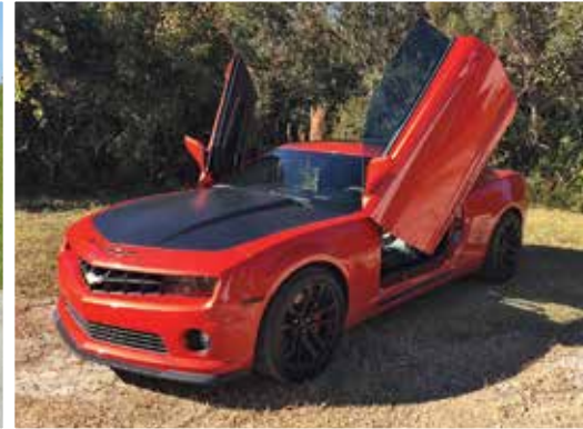
2013 Chevrolet Camaro 2SS