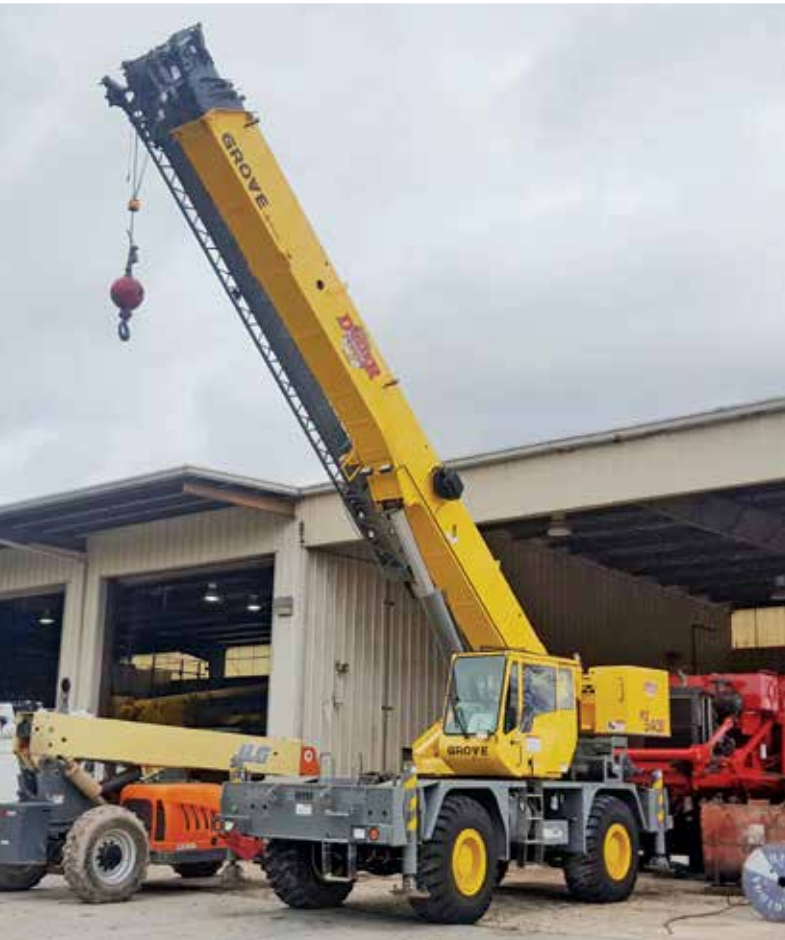
2011 Grove RT540E2 4x4x4