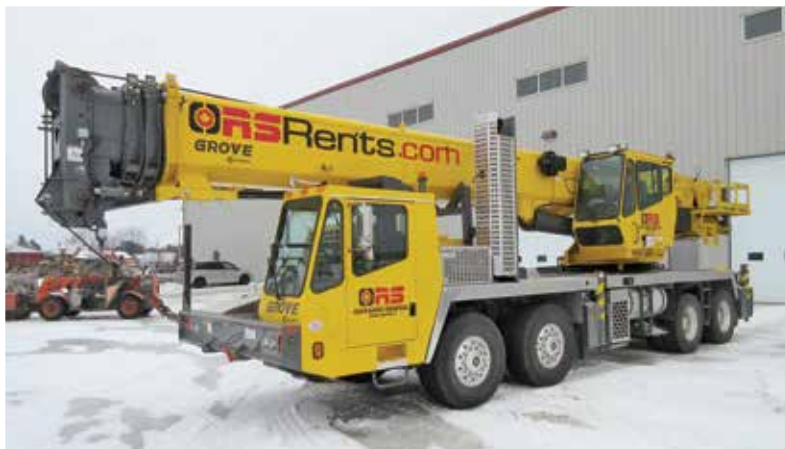
2013 Grove TMS745E 60 Ton