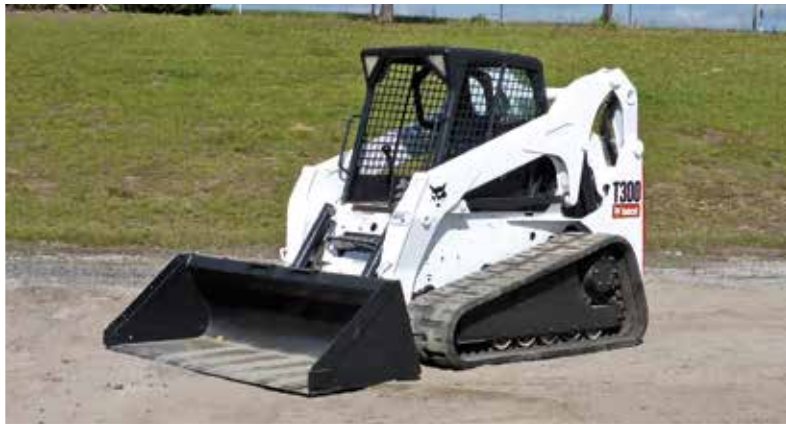
2008 Bobcat T300