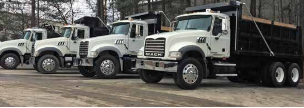
3 – 2012 Mack GU713 & 2007 Mack CTP713