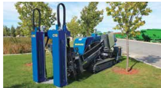
1 of 3 – Unused – 2016 McCloskey