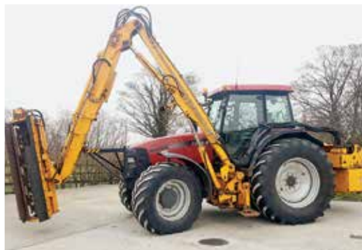
2007 Case IH MXM155 Pro