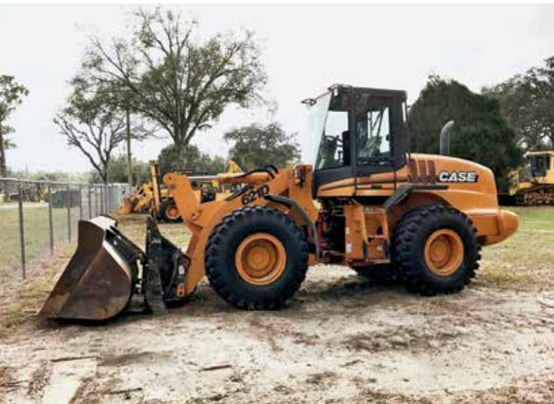
2007 Case 621D