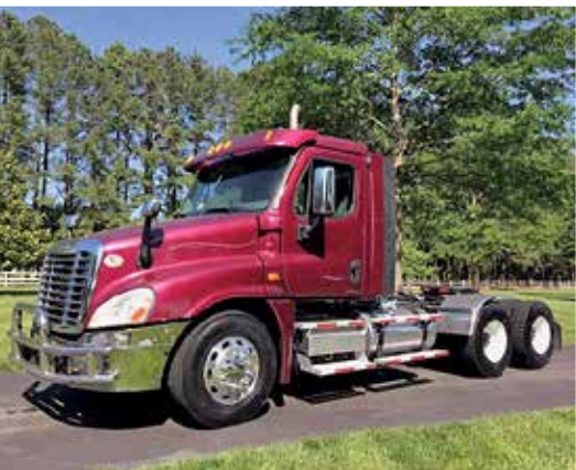
2010 Freightliner 125 Cascadia