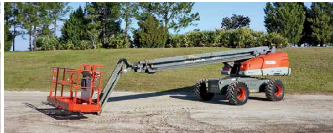
2012 Skyjack SJ66T 4x4