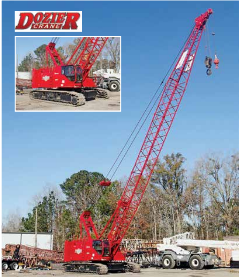
2014 Manitowoc 8500-1 85 Ton