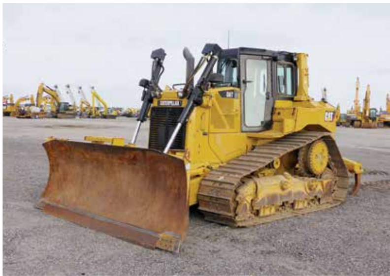
2012 Caterpillar D6T XWVP