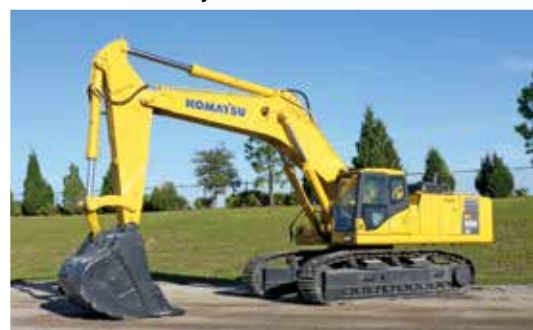
2010 Komatsu PC600LC-8