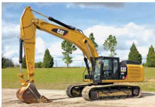
1 of 2 – 2013 Caterpillar 336EL