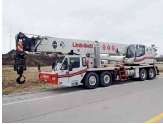
Link-Belt HTC8670 70 Ton 8x4x4