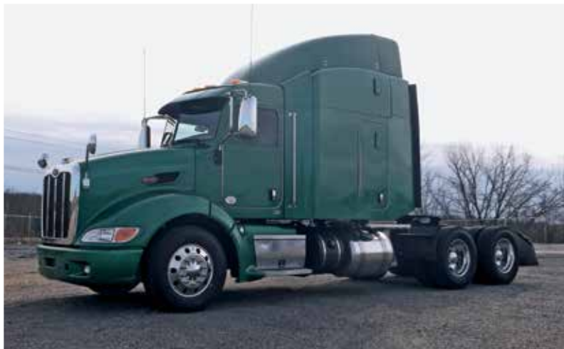
1 of 3 – 2014 Peterbilt 384