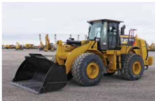
2014 Caterpillar 966K