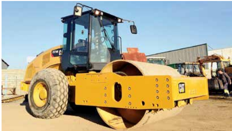
2014 Caterpillar CS66B