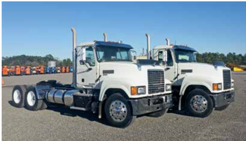
2 of 4 – 2014 Mack CHU613