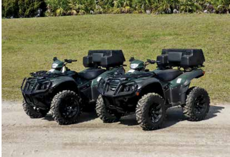
2 – 2016 Bad Boy Onslaught 4x4