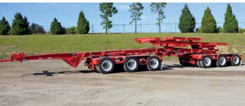
2017 Express Beam Master 30 Ft x 102 In. 75000 Lb