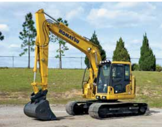
2016 Komatsu PC138US-10