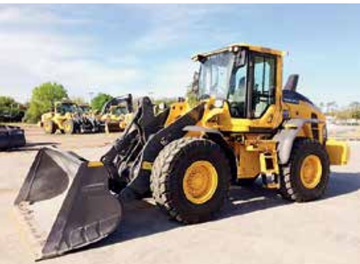
1 of 2 - 2015 Volvo L70H