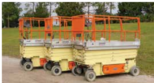
3 of 4 - 2011 JLG 3246ES