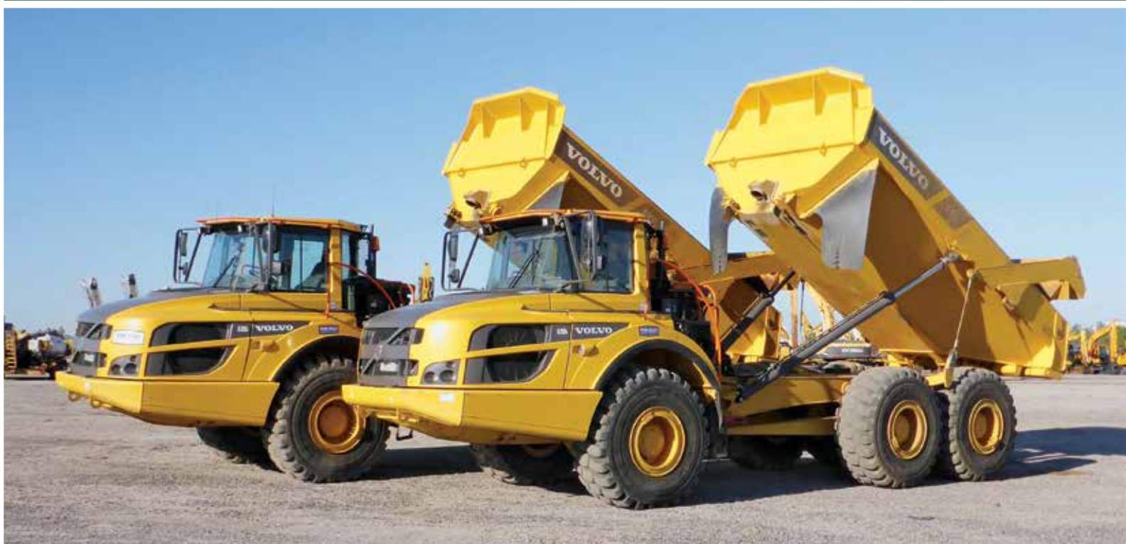
2 of 4 – 2015 Volvo A30G 6x6

181 wheel loaders | 73 articulated dump trucks | 51 motor graders 29 trenchers | 43 directional drills