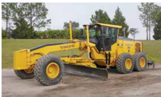
2008 Volvo G990