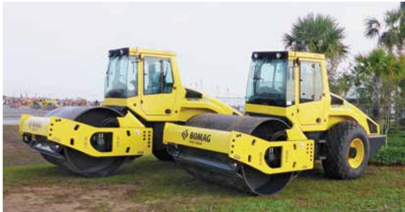
2 – Unused – 2016 Bomag BW211D4i