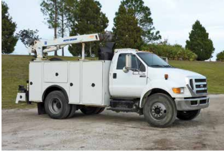
2012 Ford F750 XL w/Autocrane 8406H 8400 Lb