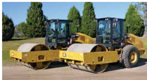
2 – 2014 Caterpillar CS66B