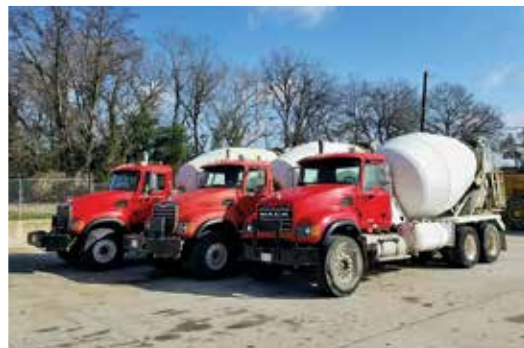
3 of 7 – Mack CV713