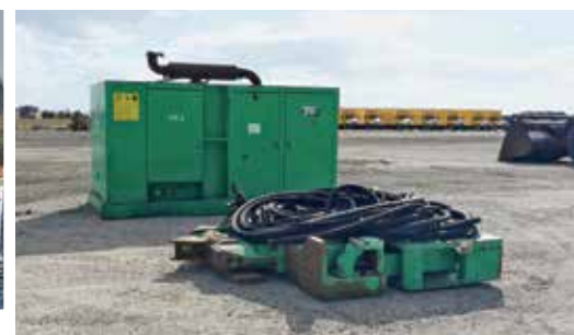
Ice 4450 Pile Driver