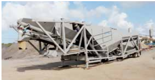
2014 Con-E-Co Lo Pro 427 12 Cu Yd/Hr