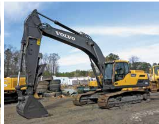
2014 Volvo EC300DL