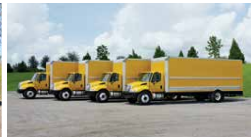
4 of 107 – 2013 International 4300SBA