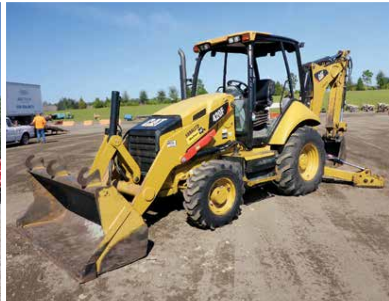
2013 Caterpillar 420F