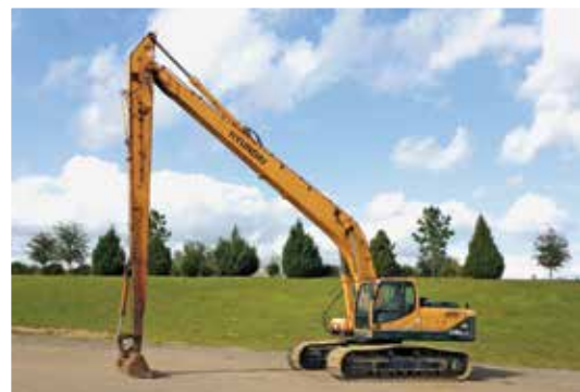
2011 Hyundai Robex290LC9