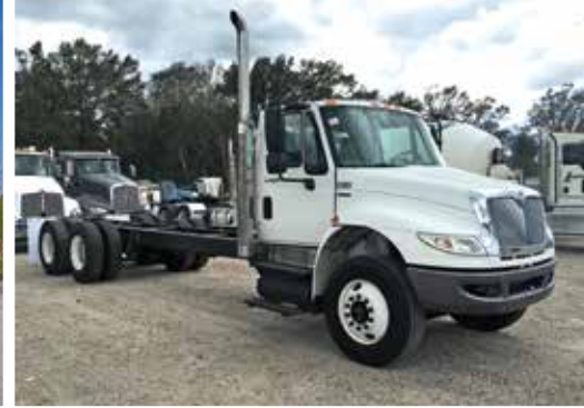
2010 International 4400