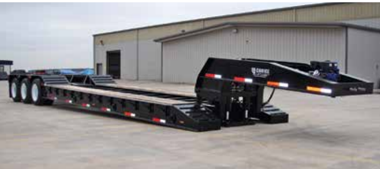
2017 Choice 355DN