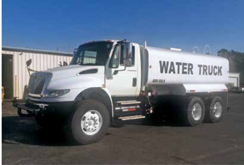
International 4400 4000 Gallon