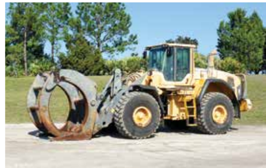
2013 Volvo L150G