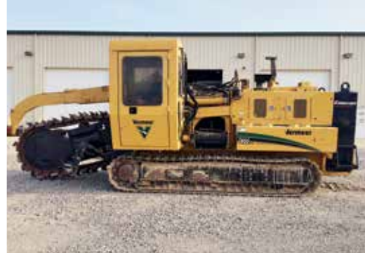
2013 Vermeer T655 Commander III