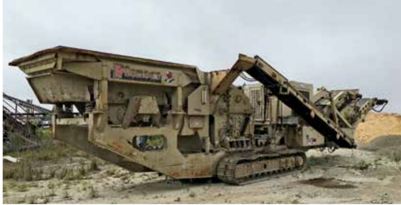
Kolberg Pioneer FT4250 Impact