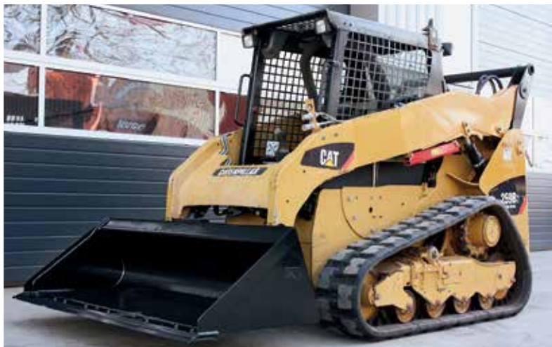
1 of 4 – 2013 Caterpillar 259B3