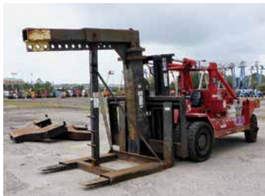
Bristol RS80 80000 Lb