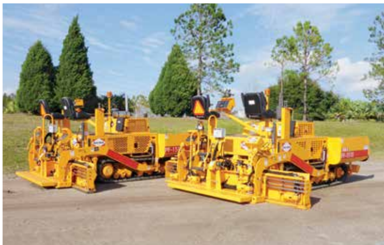
2 – 2013 Lee-Boy PF1510