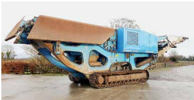
2012 Sandvik QE140 6 x 10 Ft