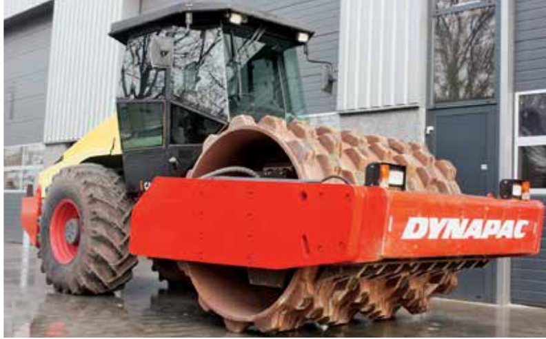
2012 Dynapac CA621PD