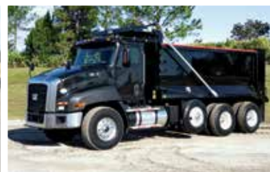
2014 Caterpillar CT660S SBA

2000+ construction equipment 710+ lifting & material handling 680+ transport trucks & trailers 190+ aggregate equipment