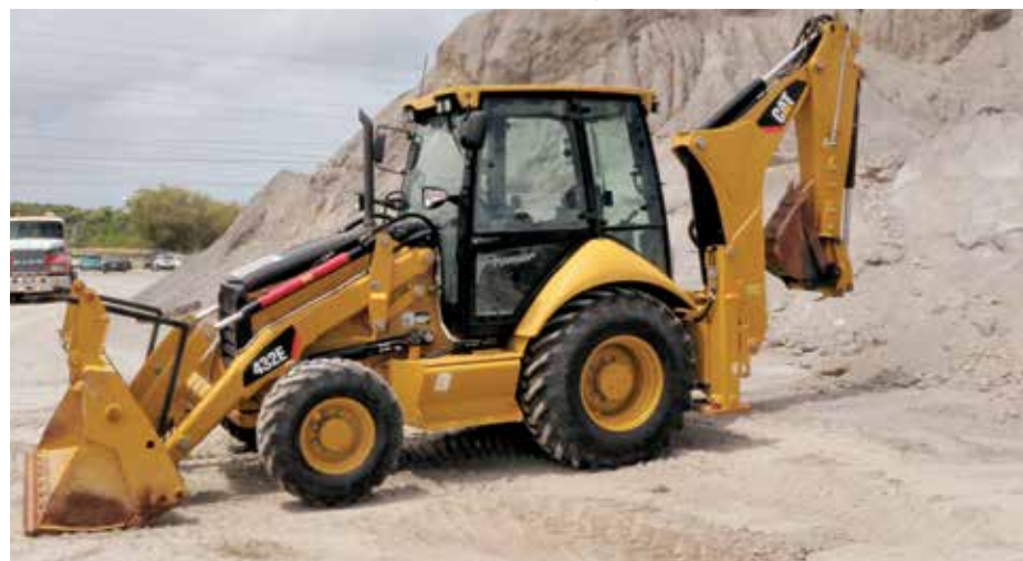
2012 Caterpillar 432E 4x4 - Located in Tampa, FL - FTZ