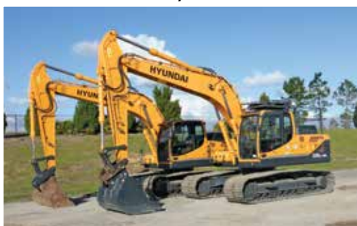
2 of 3 – 2014 Hyundai Robex 220LC9A