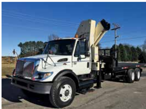
International 7500SBA w/National