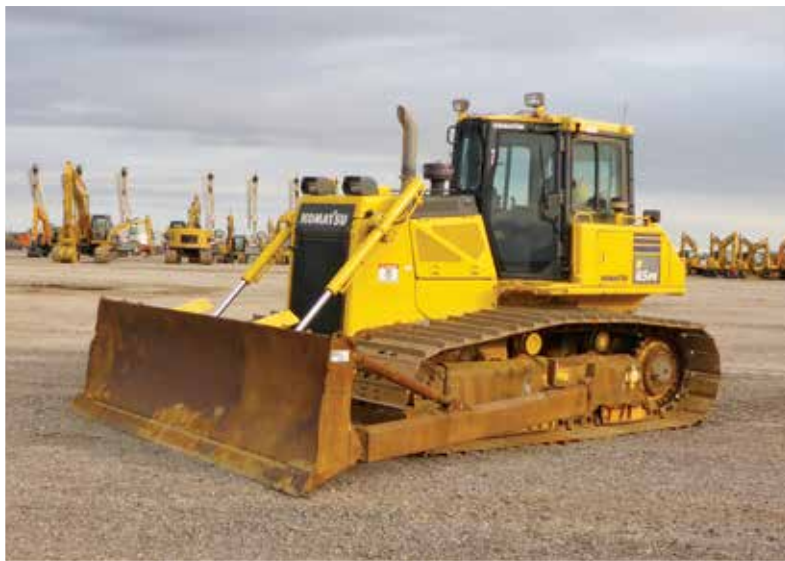
1 of 2 – 2015 Komatsu D65PX-17