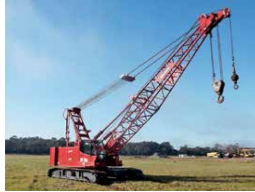
2008 Manitowoc 8500 80 Ton