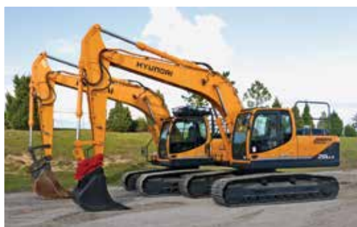
2 – 2013 Hyundai Robex 210LC-9