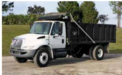
2009 International 4300SBA