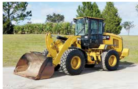
2014 Caterpillar 938K