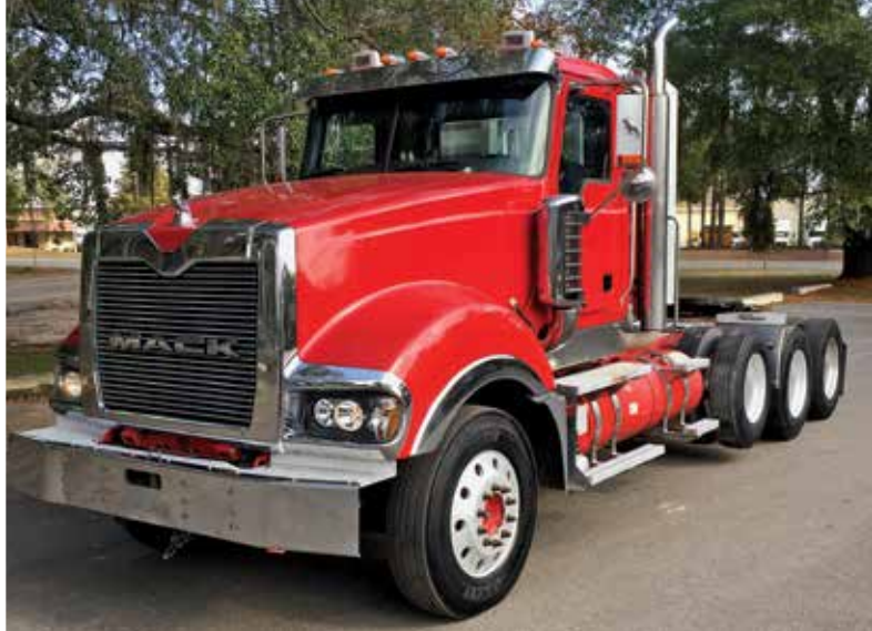
2010 Mack TD713