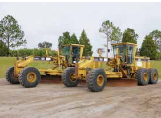
2 - Caterpillar 16H