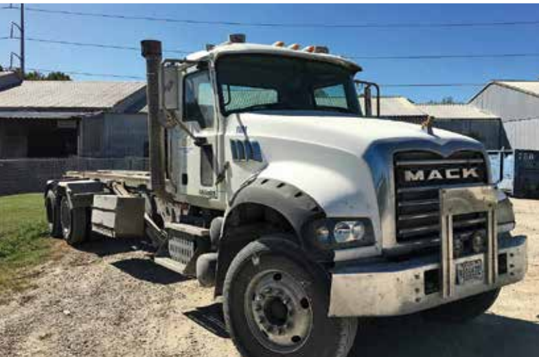
2009 Mack GU713 Rolloff