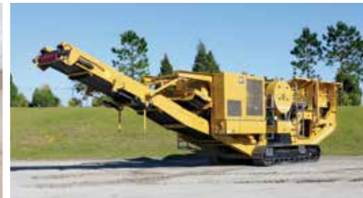
Unused – 2016 Maximus MXJ1100