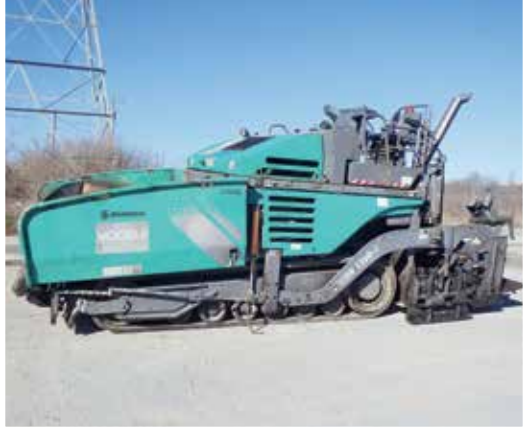
2010 Voegele Vision 5200