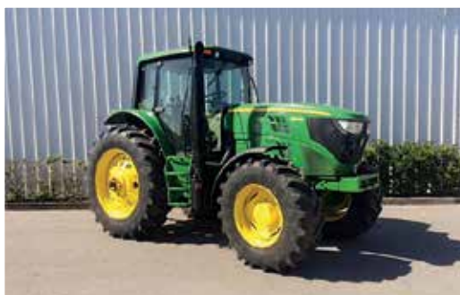
2013 John Deere 6150M