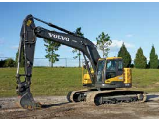
2014 Volvo ECR235D – Low meter hours