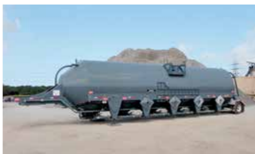
2014 Exosent 4300 Cu Ft