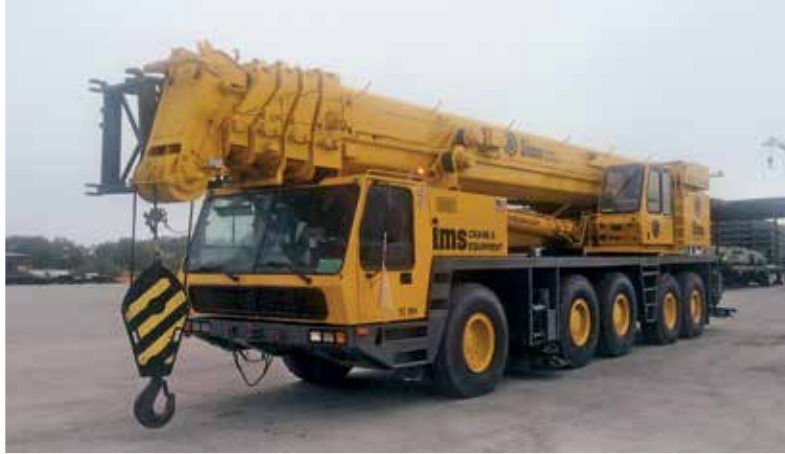
Grove GMK5175 175 Ton 10x8x8