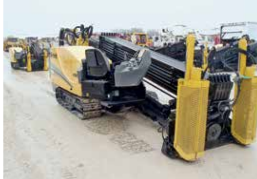
2008 Vermeer D36X50 Navigator Series II