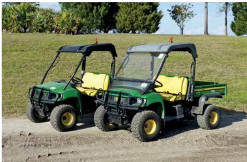
2 of 8 – John Deere HPX 4x4