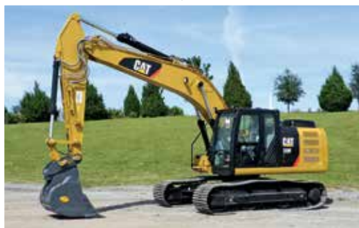
1 of 5 – Unused 2016 Caterpillar 320FL