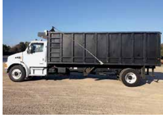
2009 Sterling Acterra