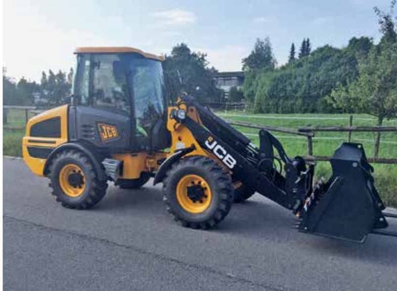
Unused – 2016 JCB 407