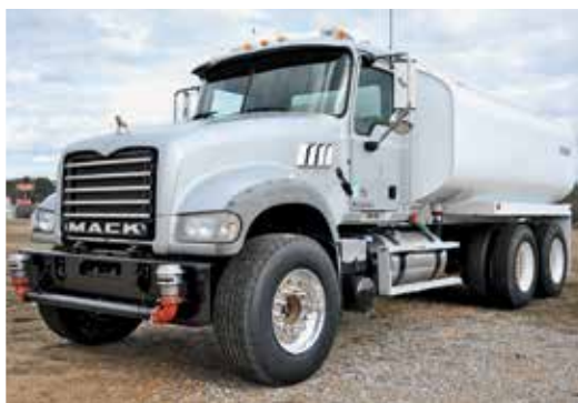
2012 Mack GU713 4000 Gallon