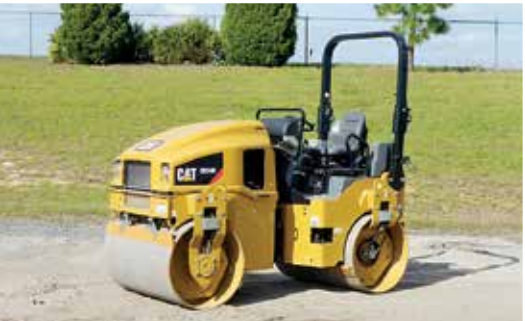
2015 Caterpillar CB34B