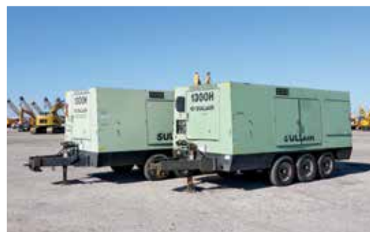
2 – Sullair 1300HAFCAT 130C