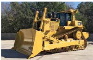
2008 Caterpillar D10T