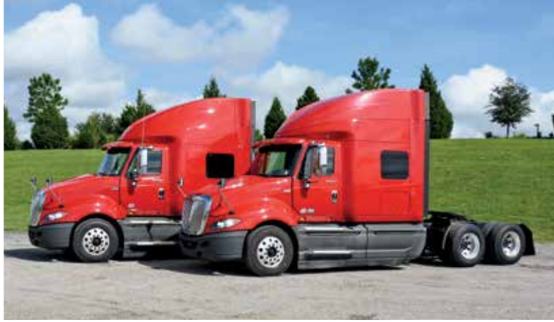
2 of 3 – 2013 International ProStar