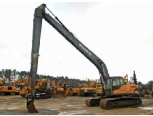
2008 Volvo EC290CLR