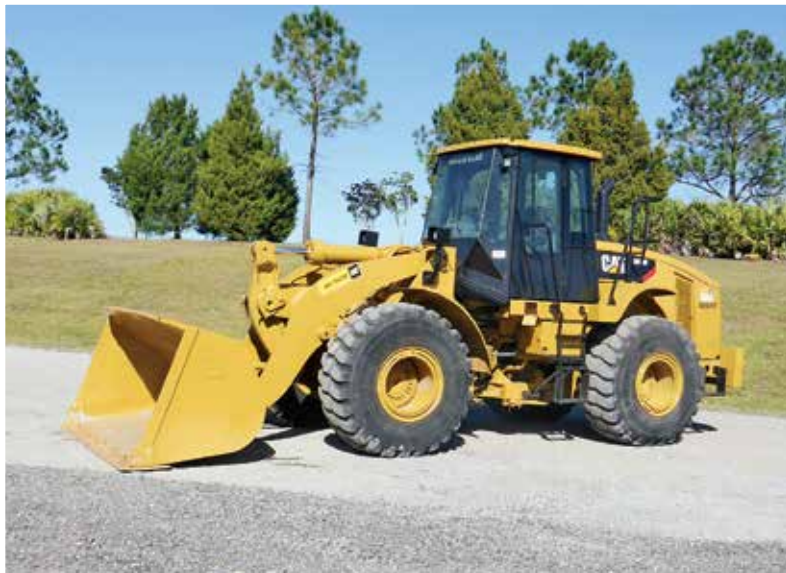
2010 Caterpillar 950H