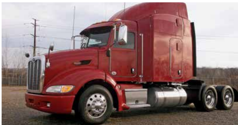
1 of 3 – 2013 Peterbilt 384