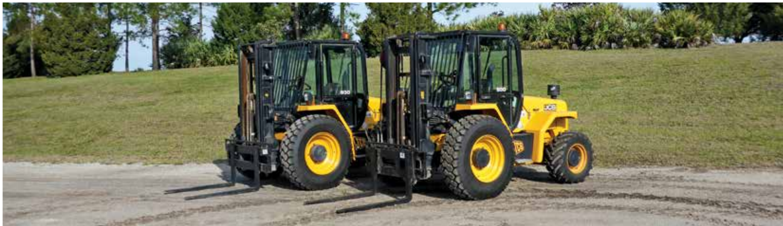
2 – 2013 JCB 930 6600 Lb 4x4