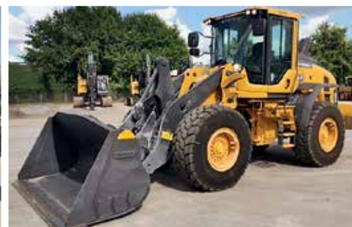
1 of 3 – 2016 Volvo L90H