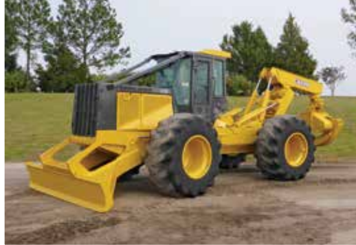
John Deere 648G Series III