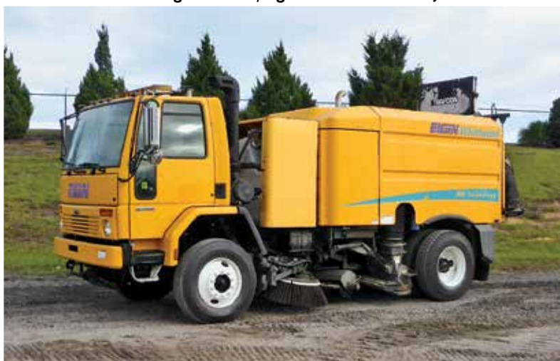
Sterling SC8000 w/Elgin Whirlwind