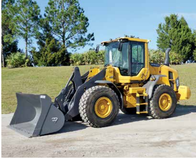
2014 Volvo L70G