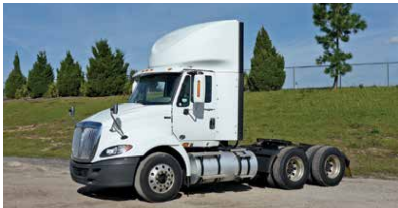
2014 International ProStar+