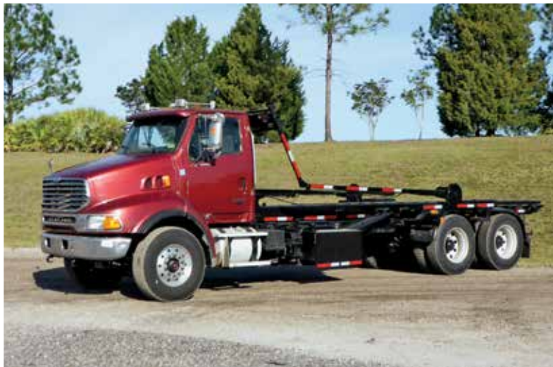
Sterling L9500 Rolloff