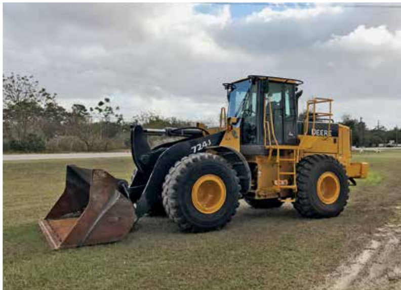
John Deere 724J