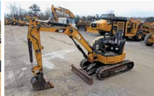
2014 Volvo ECR235D