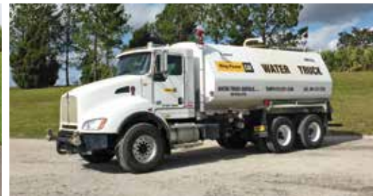
2015 Kenworth T440 5000 Gallon