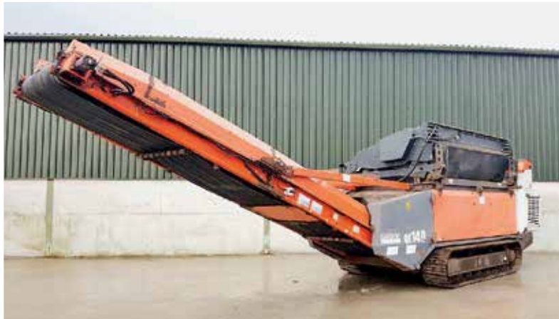
2012 Sandvik QE140 6 x 10 Ft