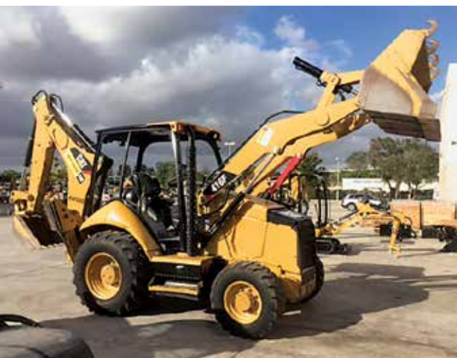
1 of 2 - 2013 Caterpillar 416F 4x4