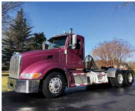
2009 Peterbilt 385