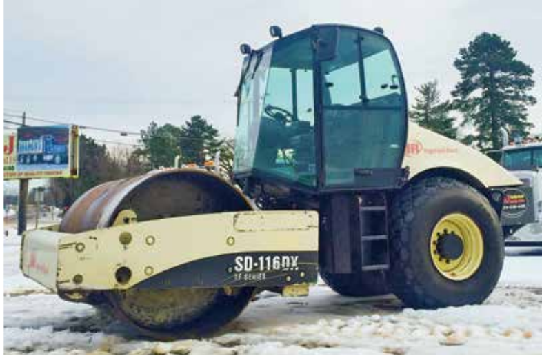
Ingersoll-Rand SD116DX TF