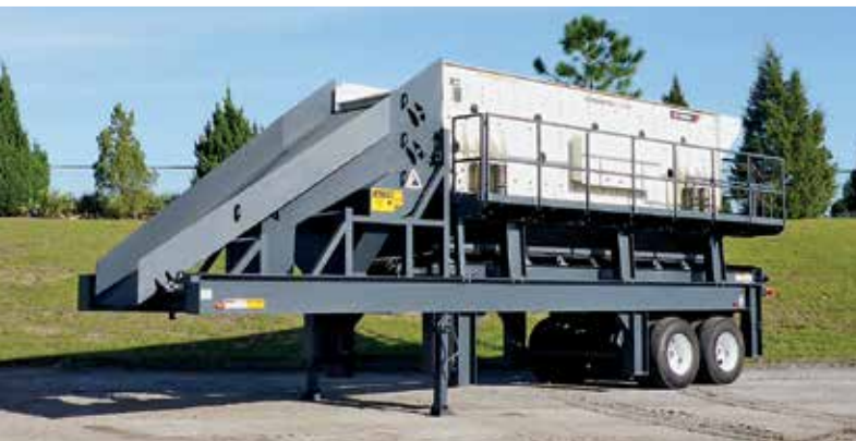
Unused - 2015 Terex Cedarapids TSV6203