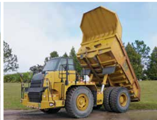
2010 Caterpillar 772