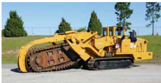
2008 Trenchor T1060