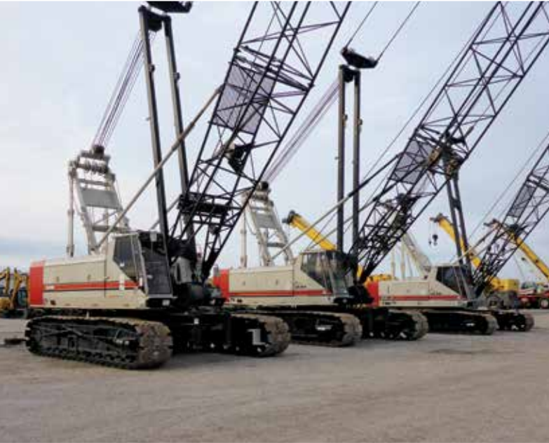
2 - Link-Belt LS218H 100 Ton & Link-Belt LS138H 75 Ton