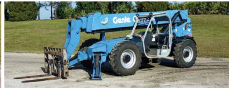
1 of 3 – Genie GTH1056 10000 Lb 4x4x4