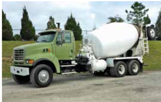
1 of 2 – Sterling LT8500