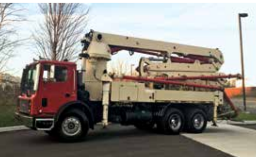
Mack MR688S w/CIFA PA1506/909FB 31 M