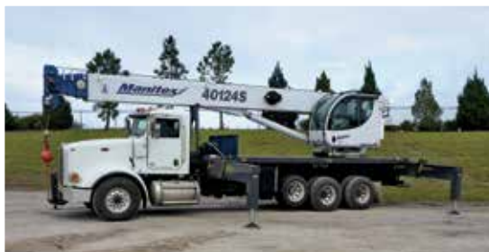
2016 Peterbilt 367 w/Manitex 40124S 40 Ton