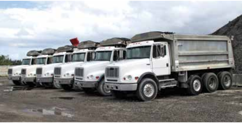
6 of 7 – Freightliner FL112