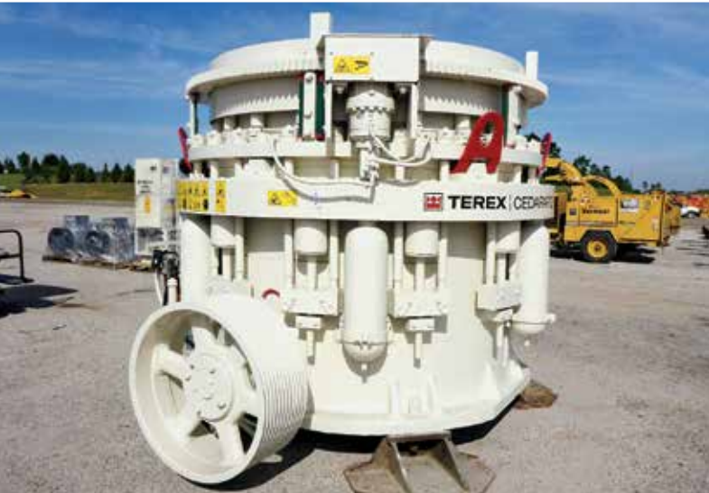
2010 Terex Cedarapids VMP550 Cone