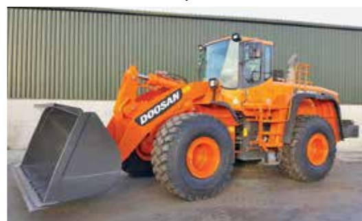
2012 Doosan DL420