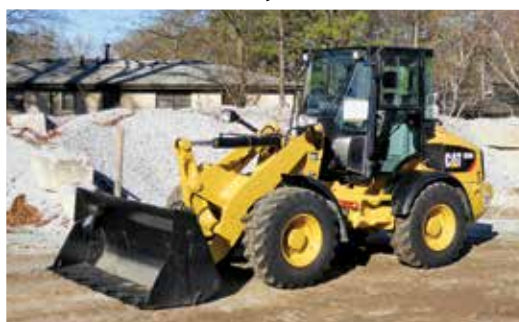
2013 Caterpillar 908H2