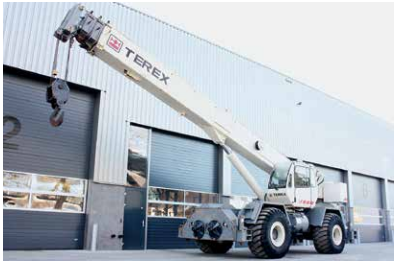
1 of 2 – Terex RT555 155 Ton 4x4x4